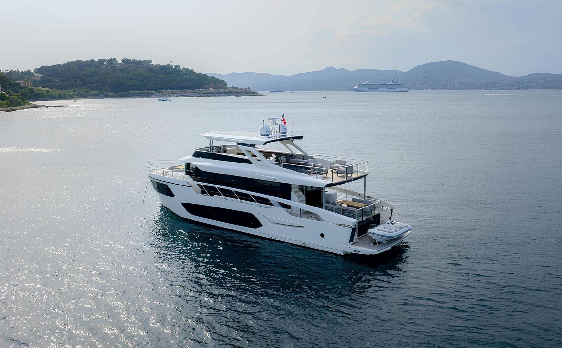
EXTERIOR ABSOLUTE NAVETTA 75 2024 MY SEMELA