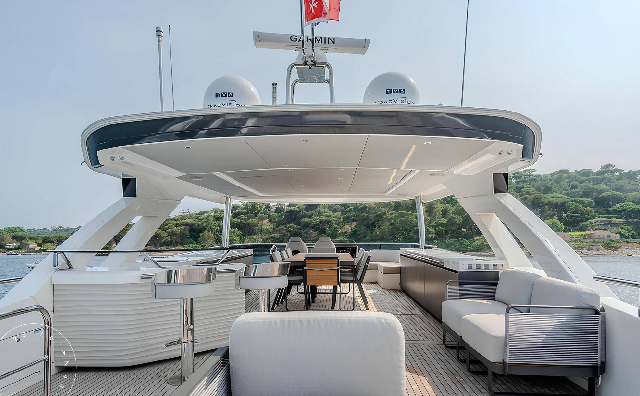
FLYBRIDGE LOUNGE AREA