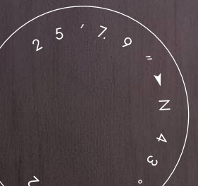
MAKE-UP TABLE IN MASTER CABIN