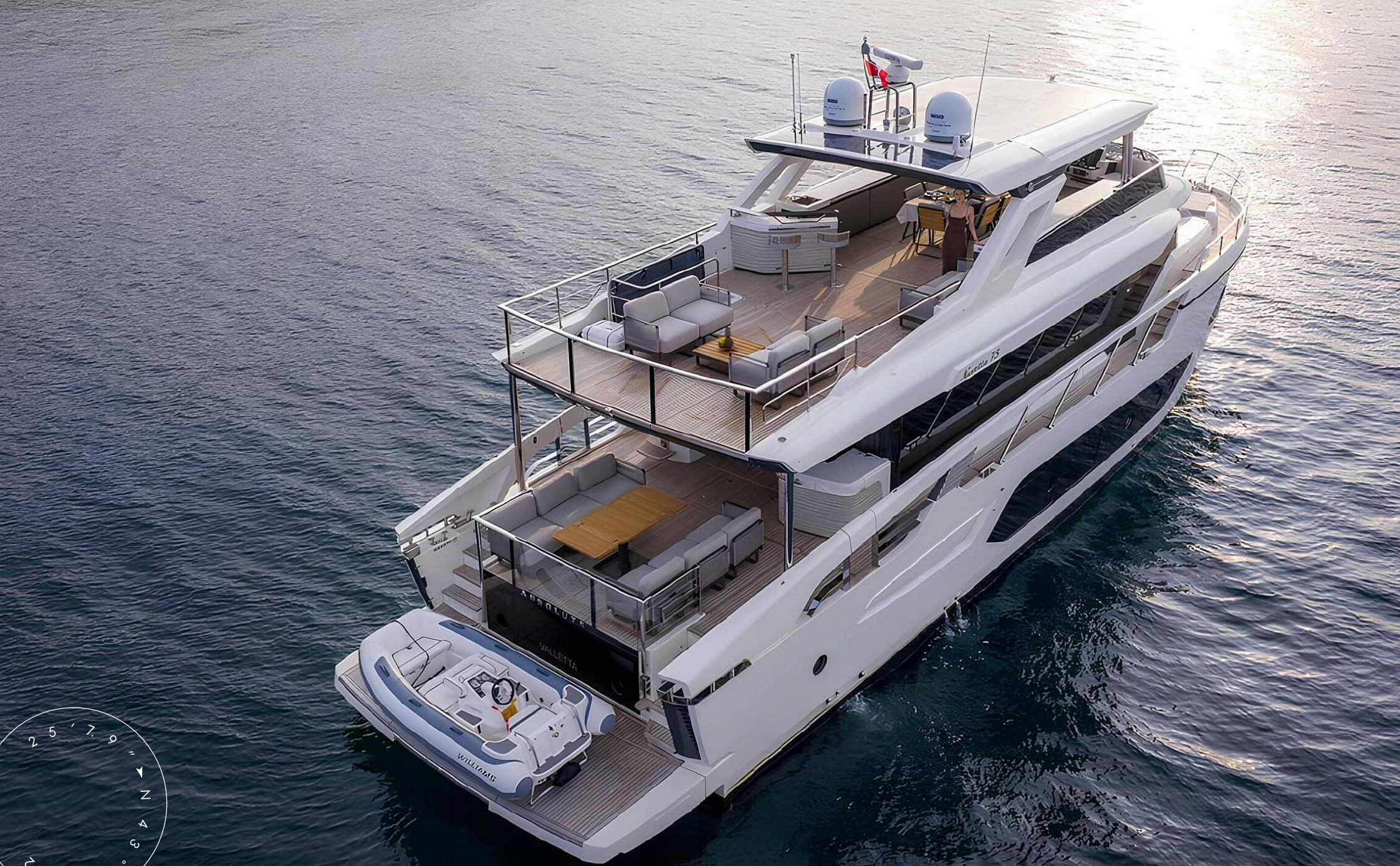
EXTERIOR ABSOLUTE NAVETTA 75 2024 MY SEMELA