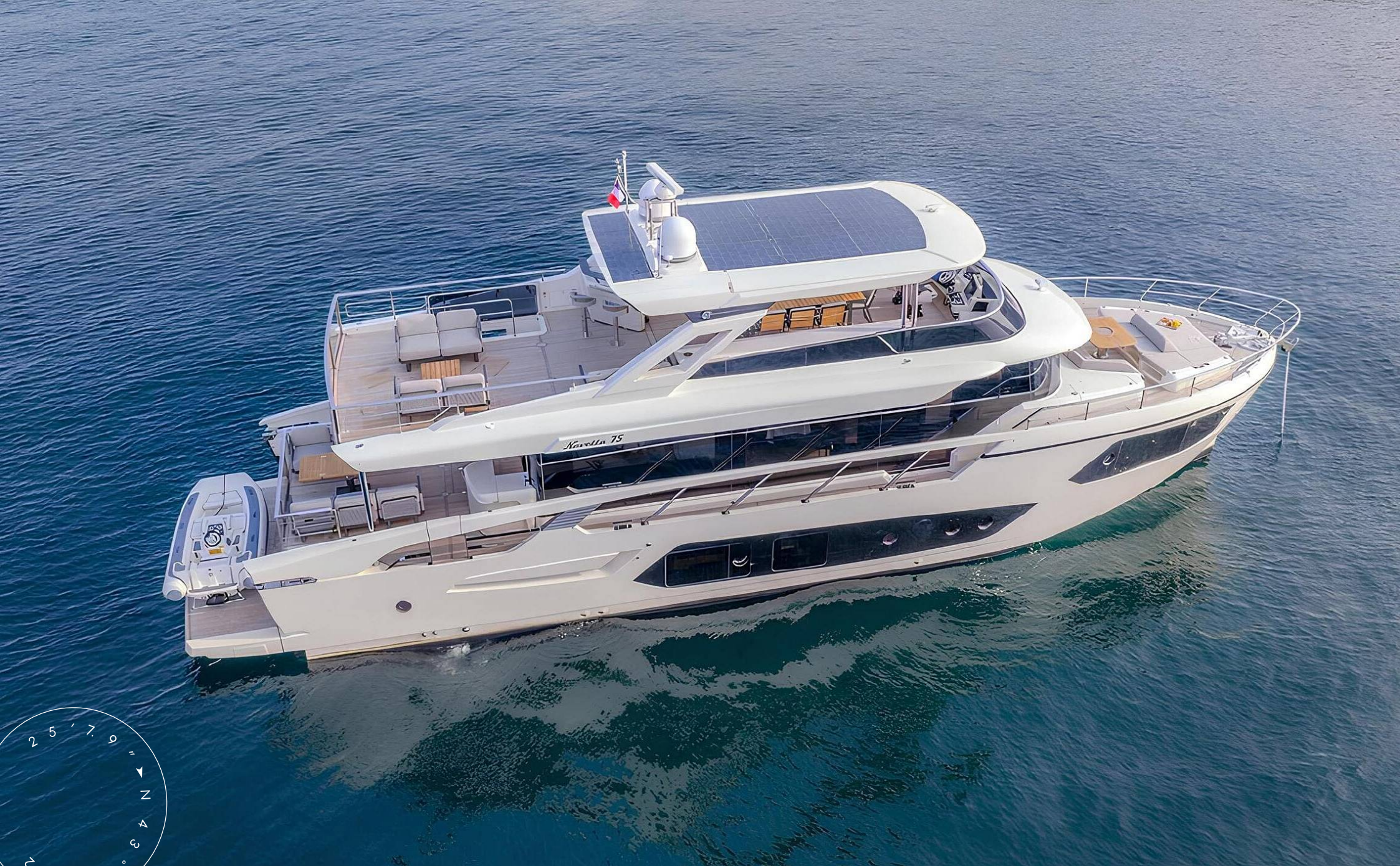
EXTERIOR ABSOLUTE NAVETTA 75 2024 MY SEMELA