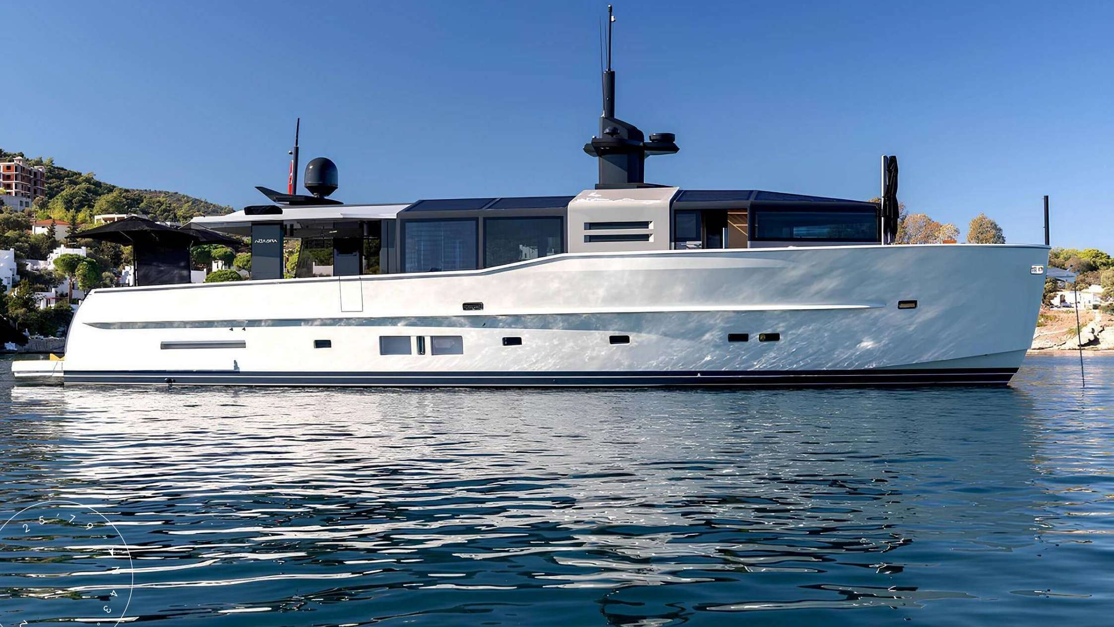
EXTERIOR ARCADIA A85 2015