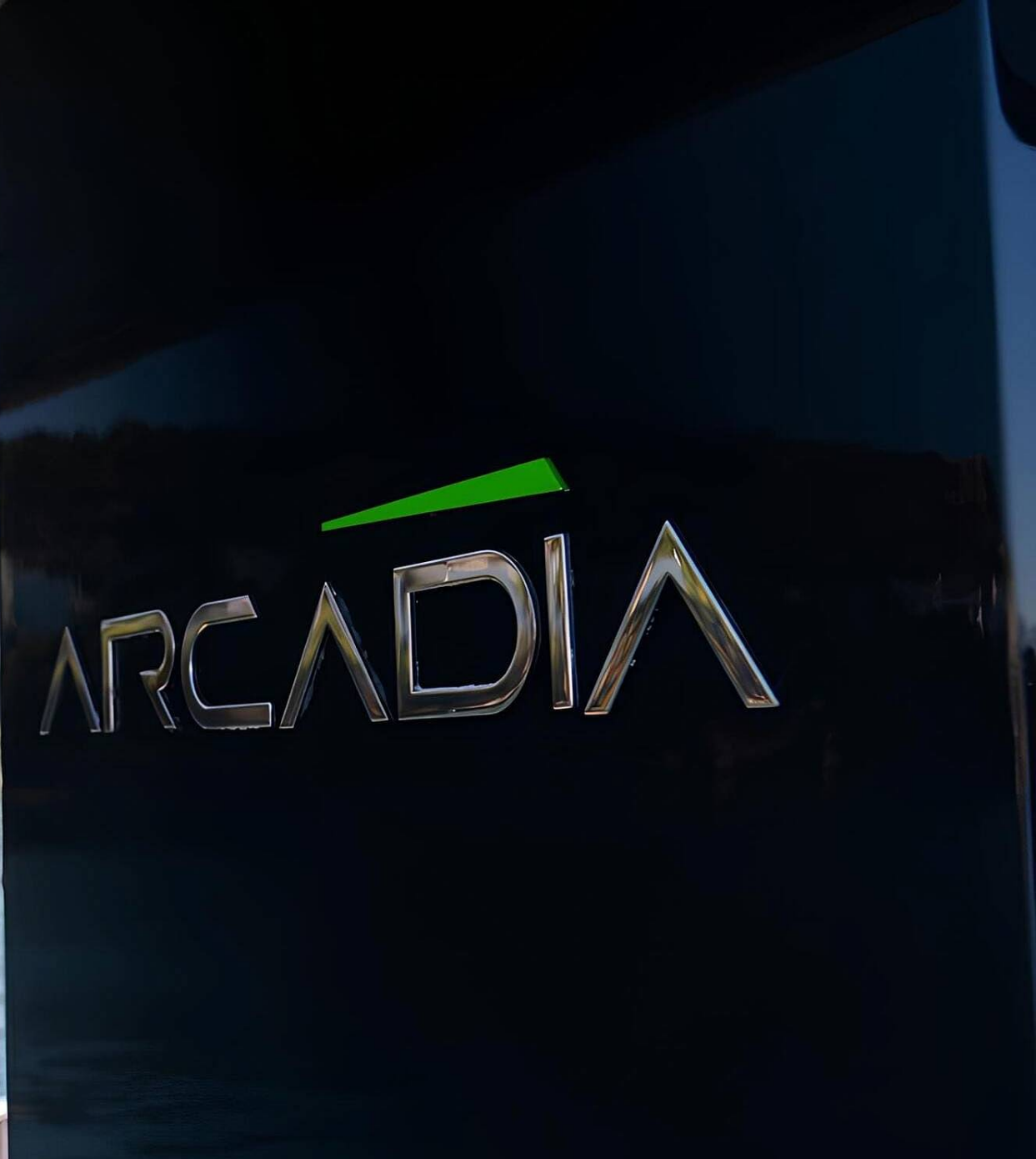
EXTERIOR ARCADIA A85 2015