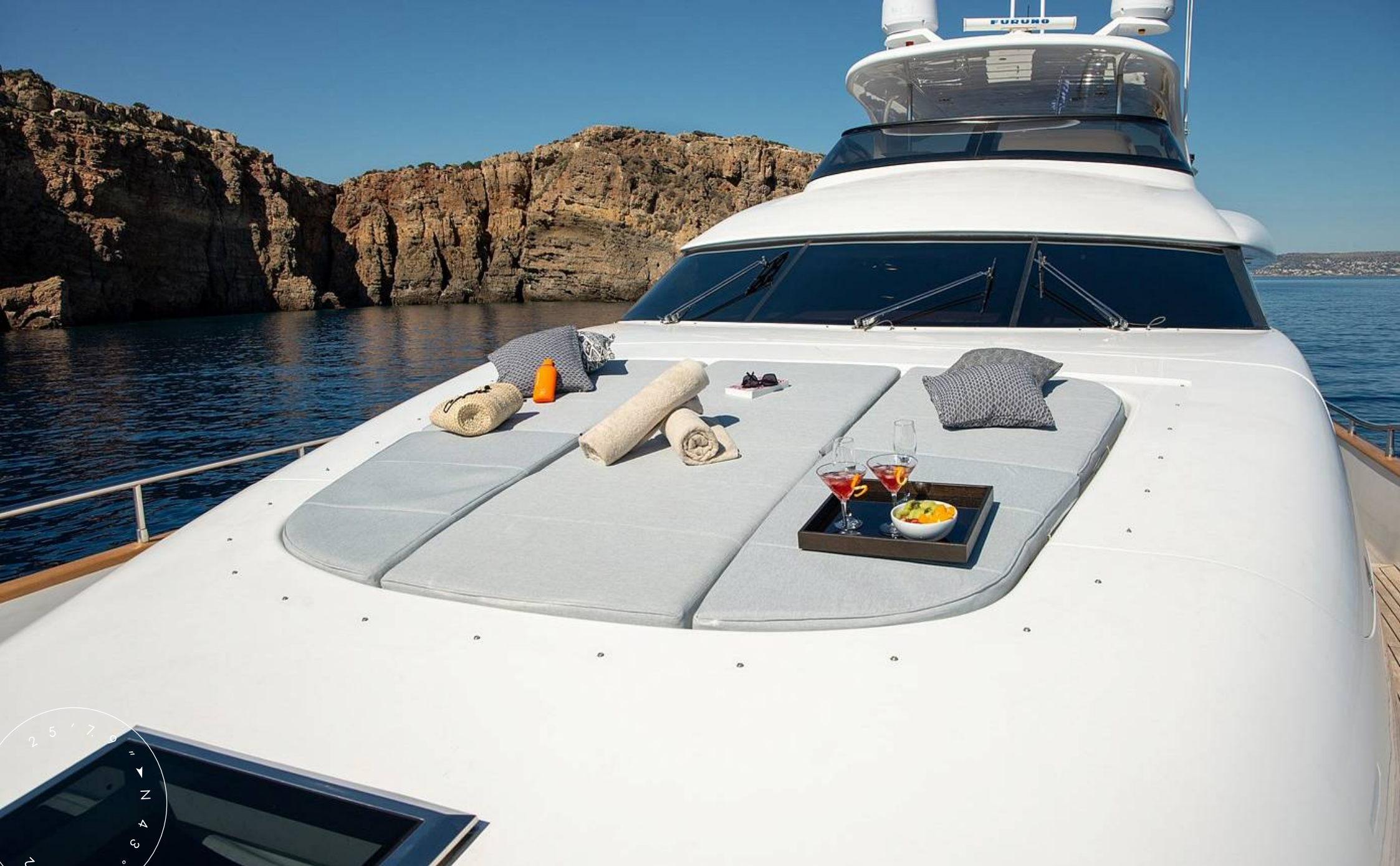
BOW SUNBATHING AREA