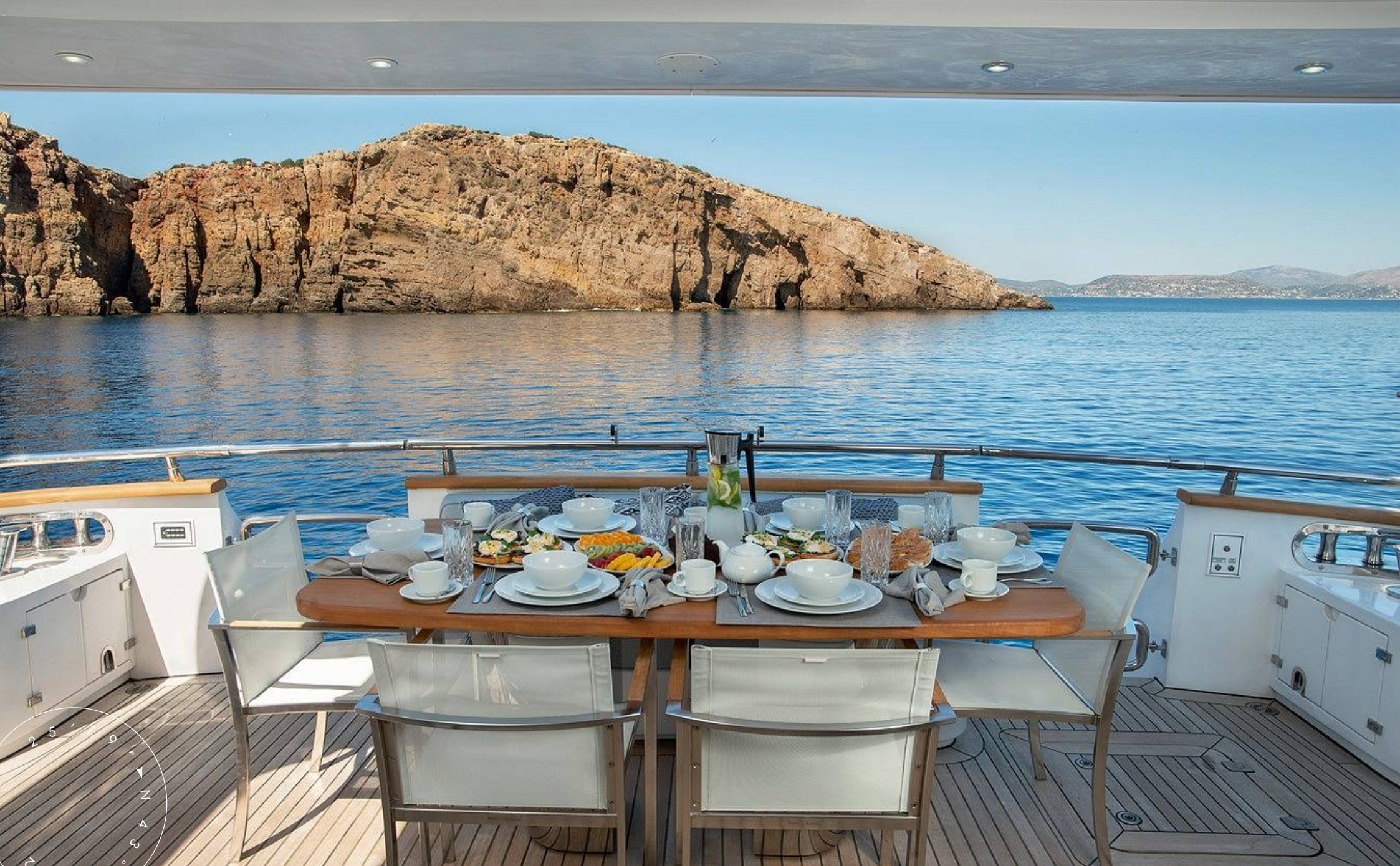
COCKPIT DINING AREA