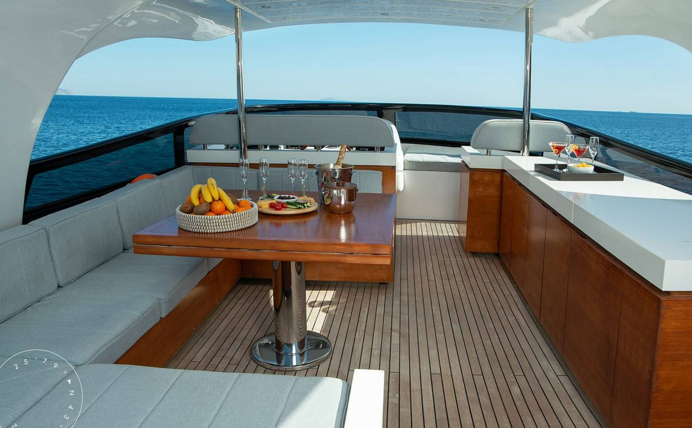
FLYBRIDGE DINING AREA