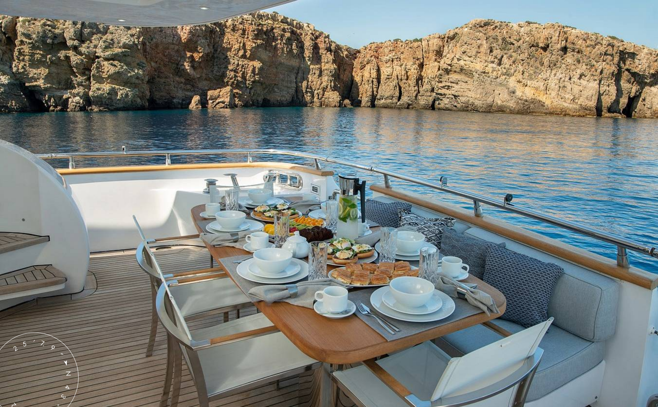
COCKPIT DINING AREA