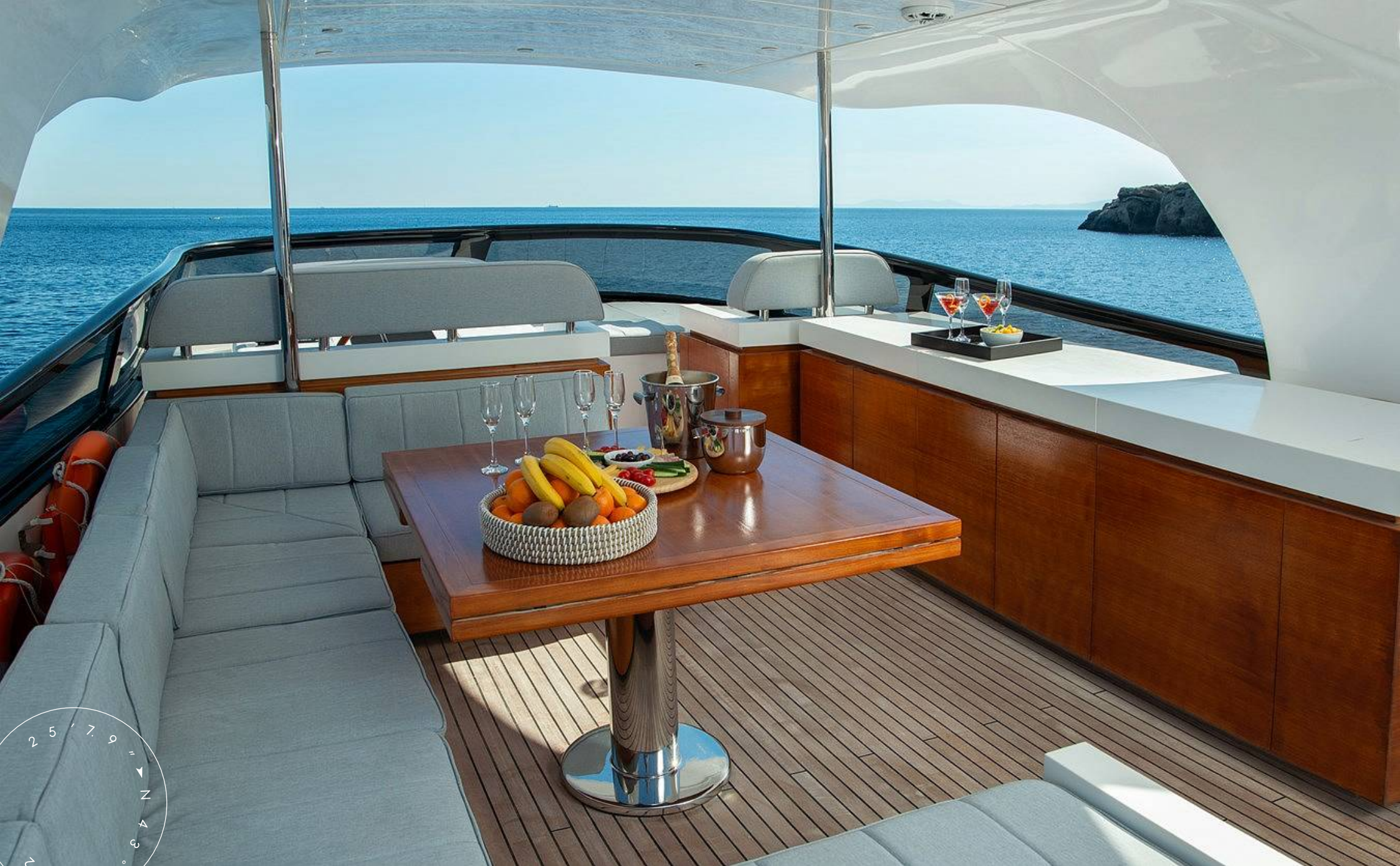
FLYBRIDGE DINING AREA