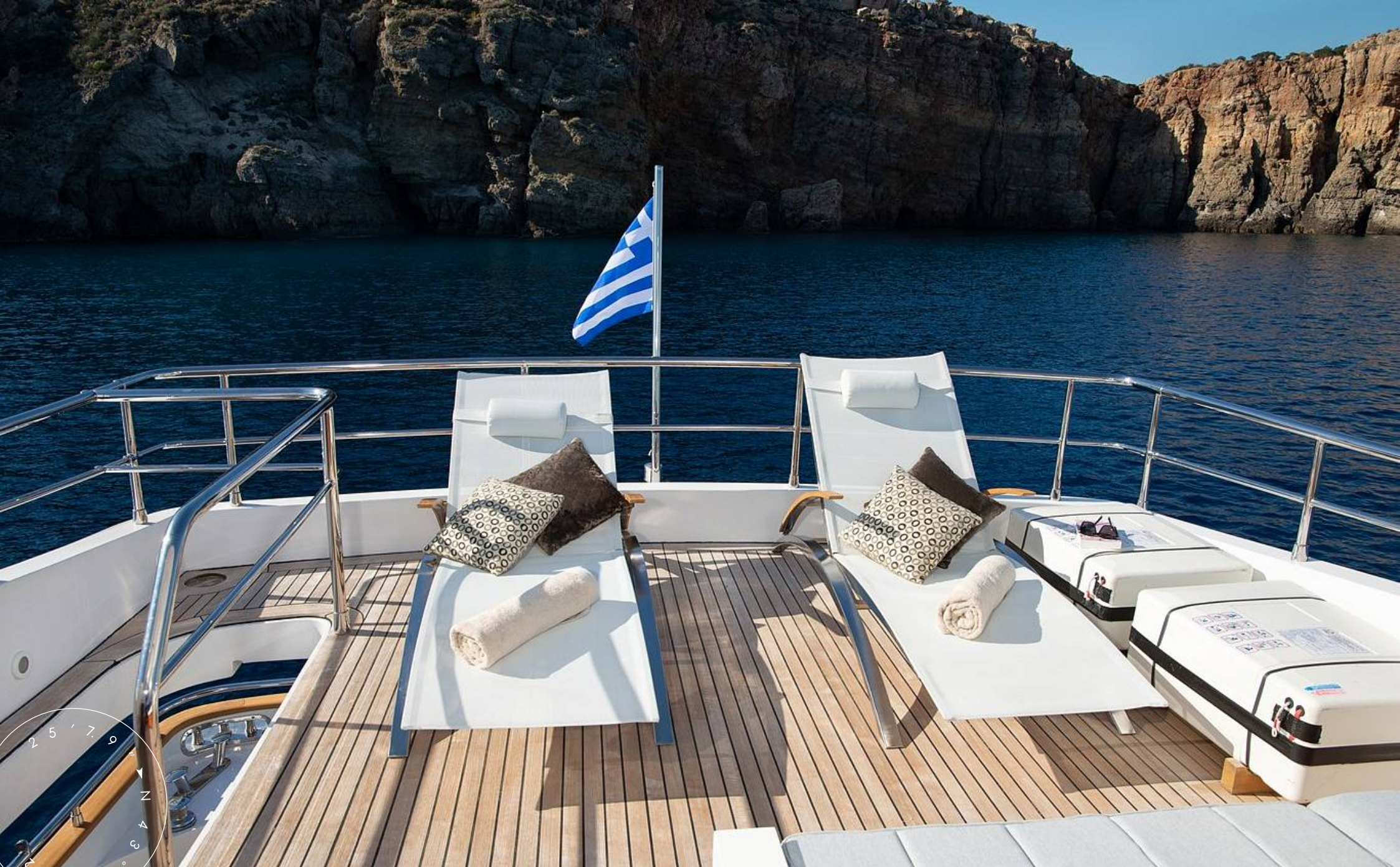
FLYBRIDGE AFT SUNBATHING AREA