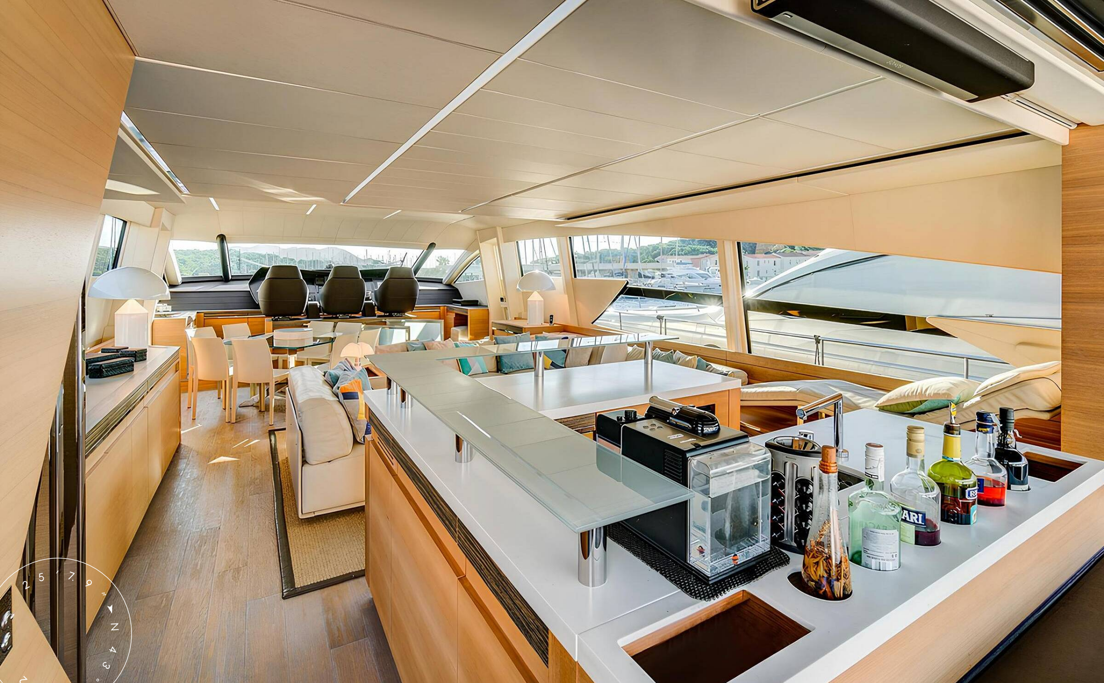
MAIN SALON BAR