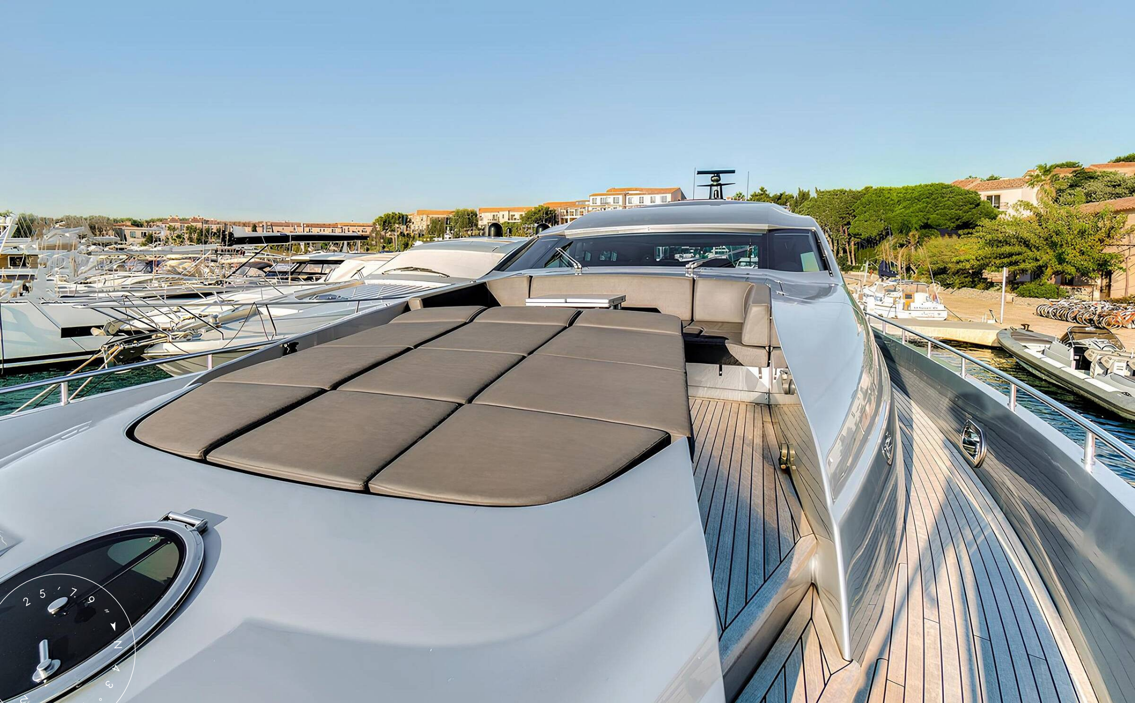
BOW SUNBATHING AREA