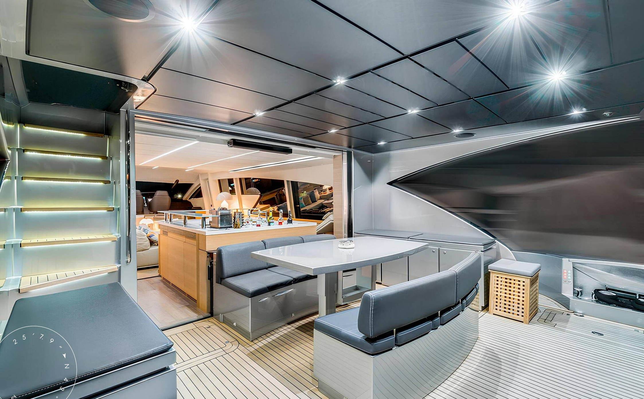
COCKPIT DINING AREA