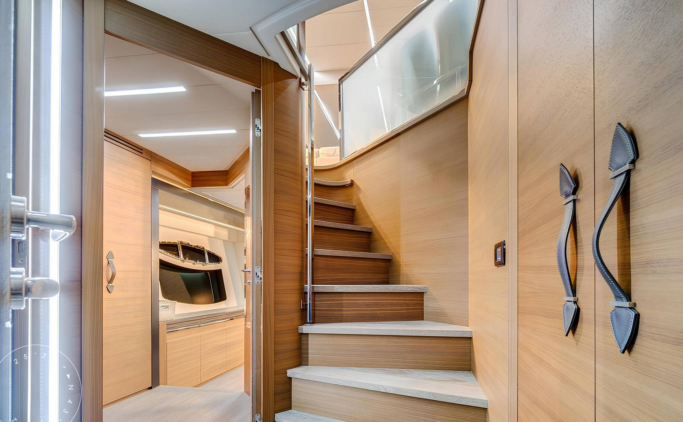
STAIRS FROM MD TO LD