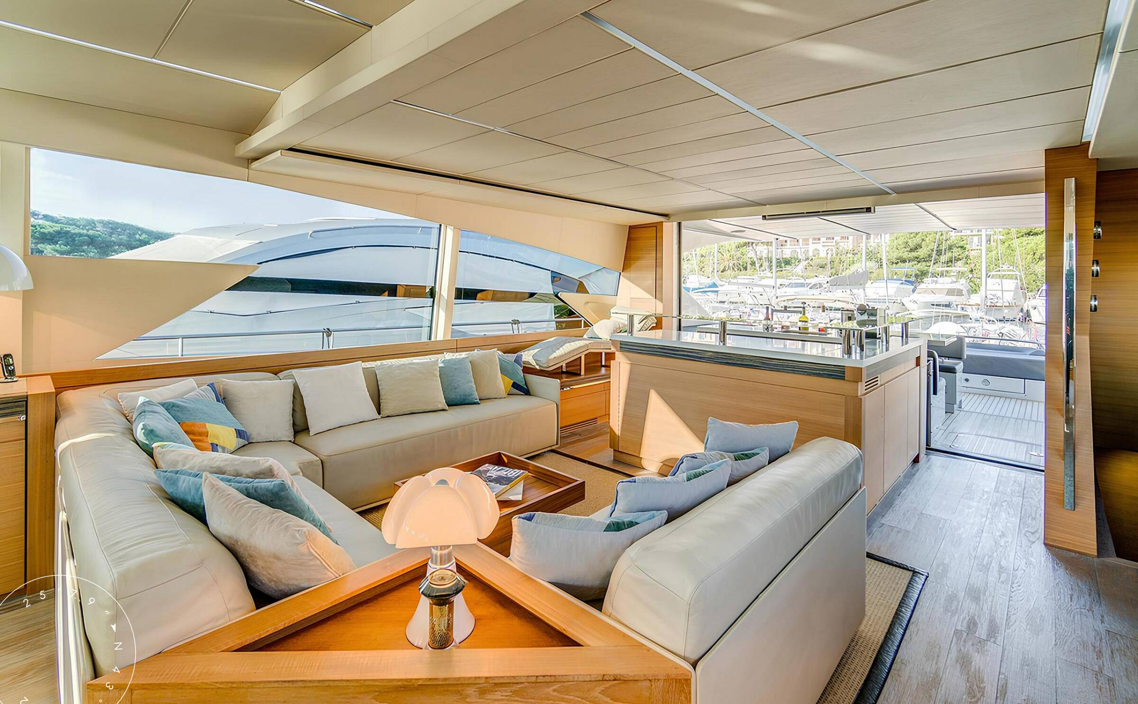
MAIN SALON LOUNGE AREA