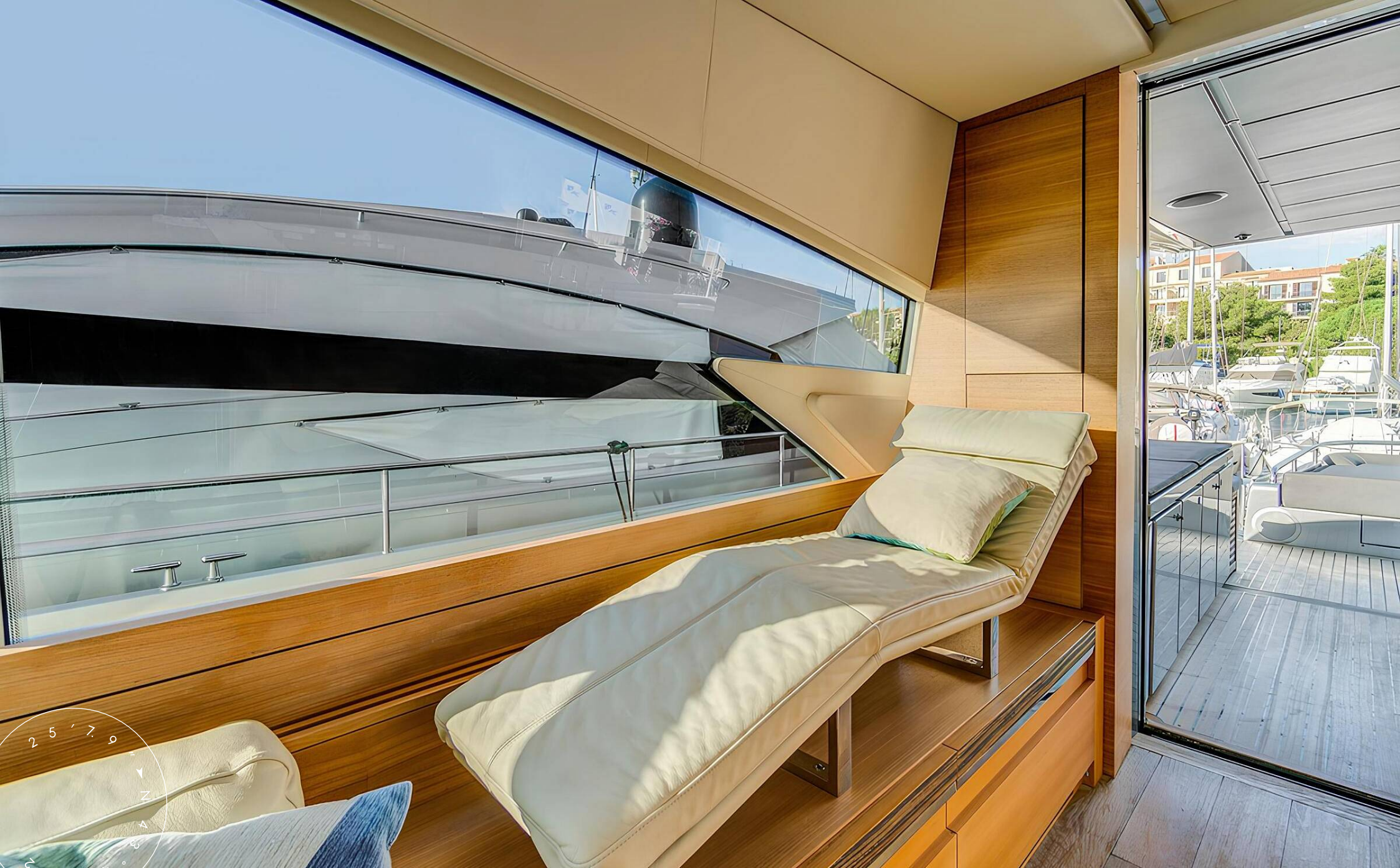
MAIN SALON LOUNGE AREA