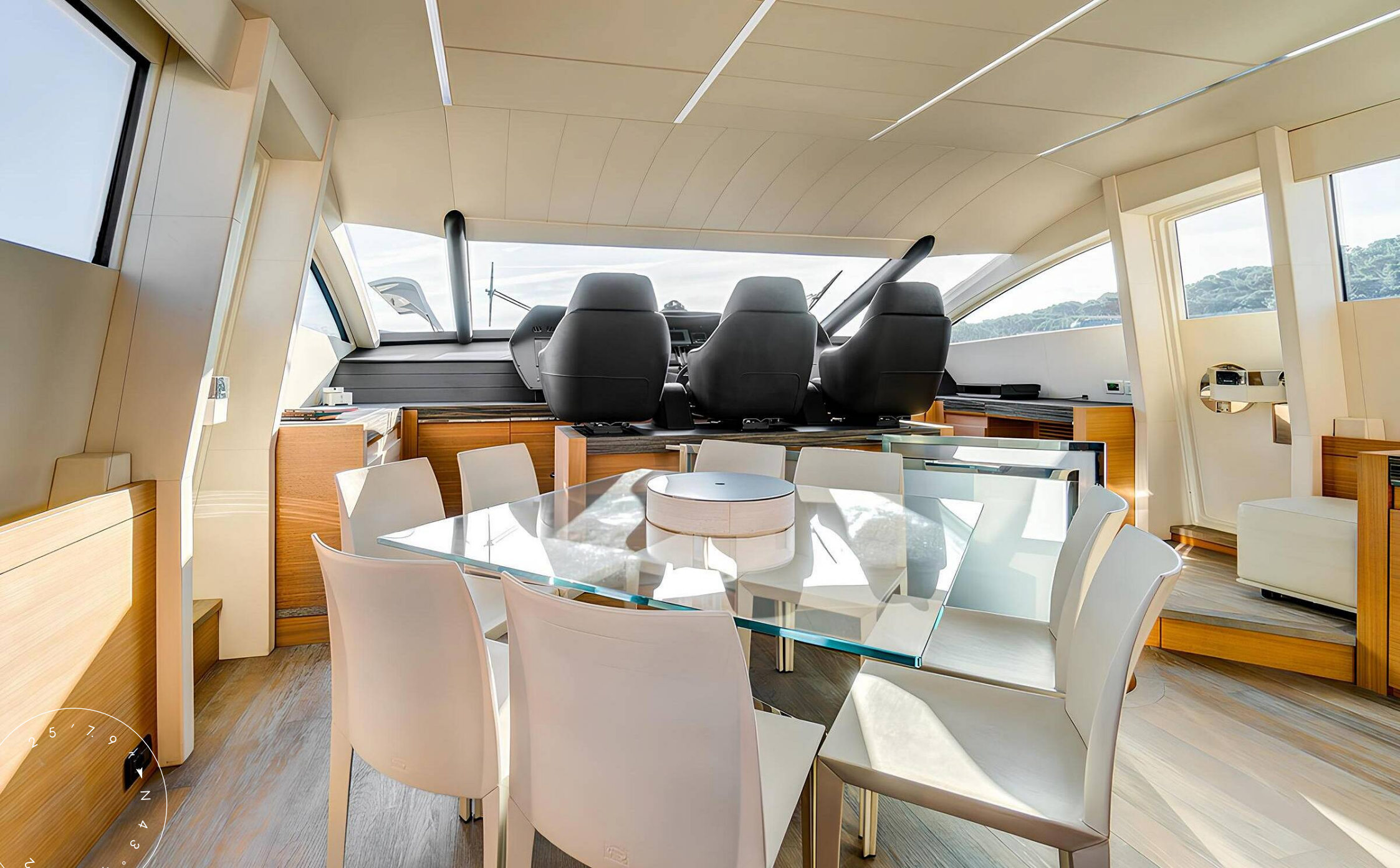
MAIN SALON DINING AREA