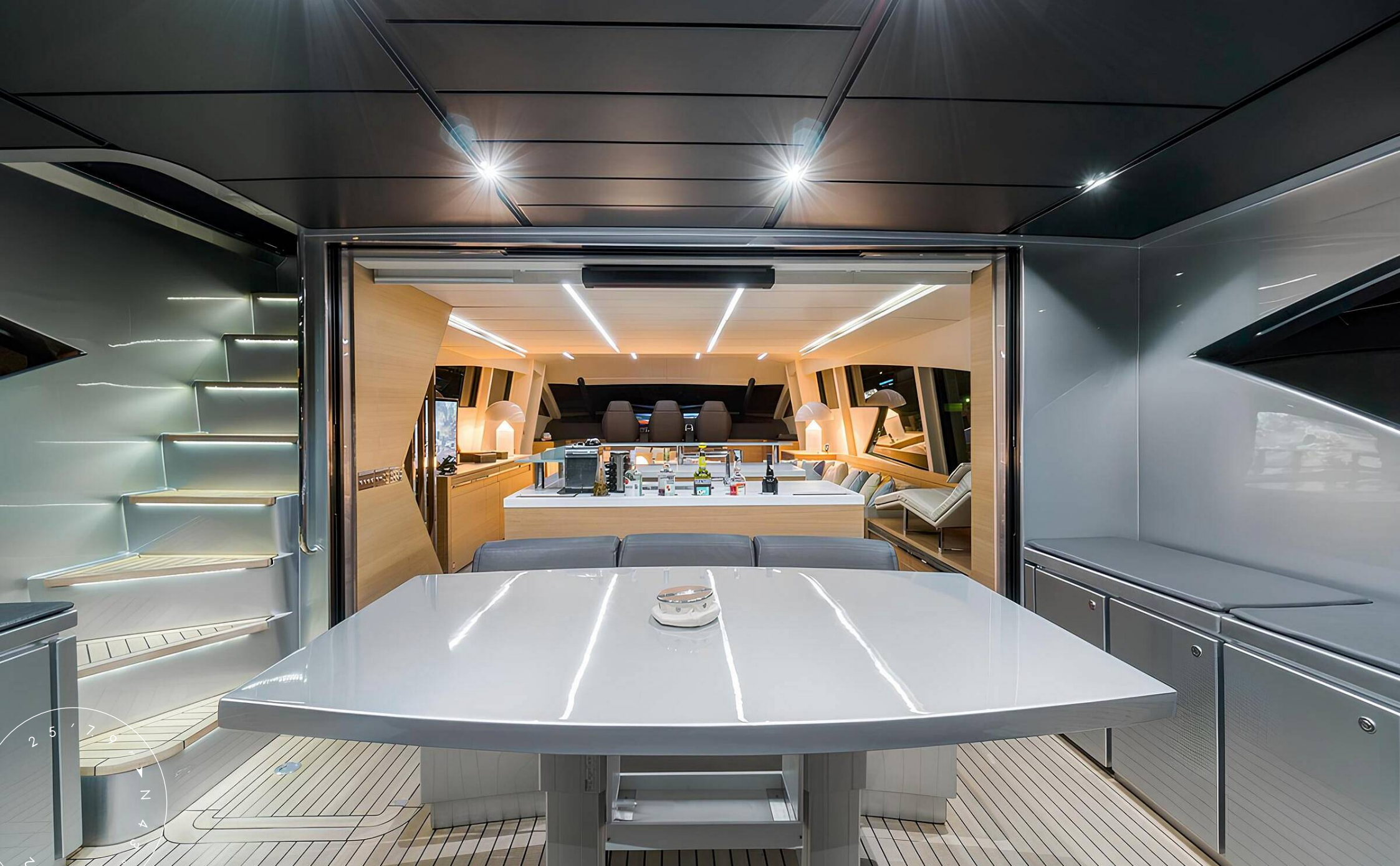
COCKPIT DINING AREA