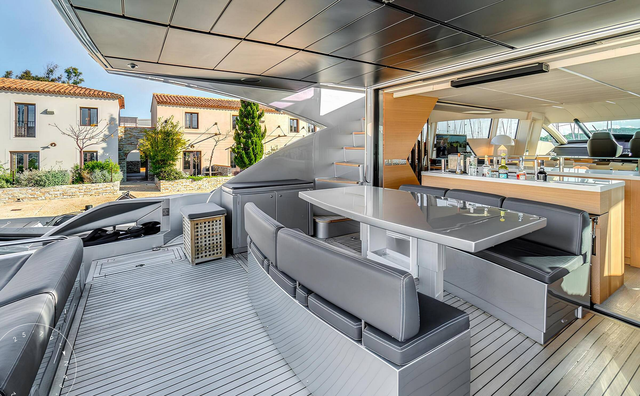
COCKPIT DINING AREA