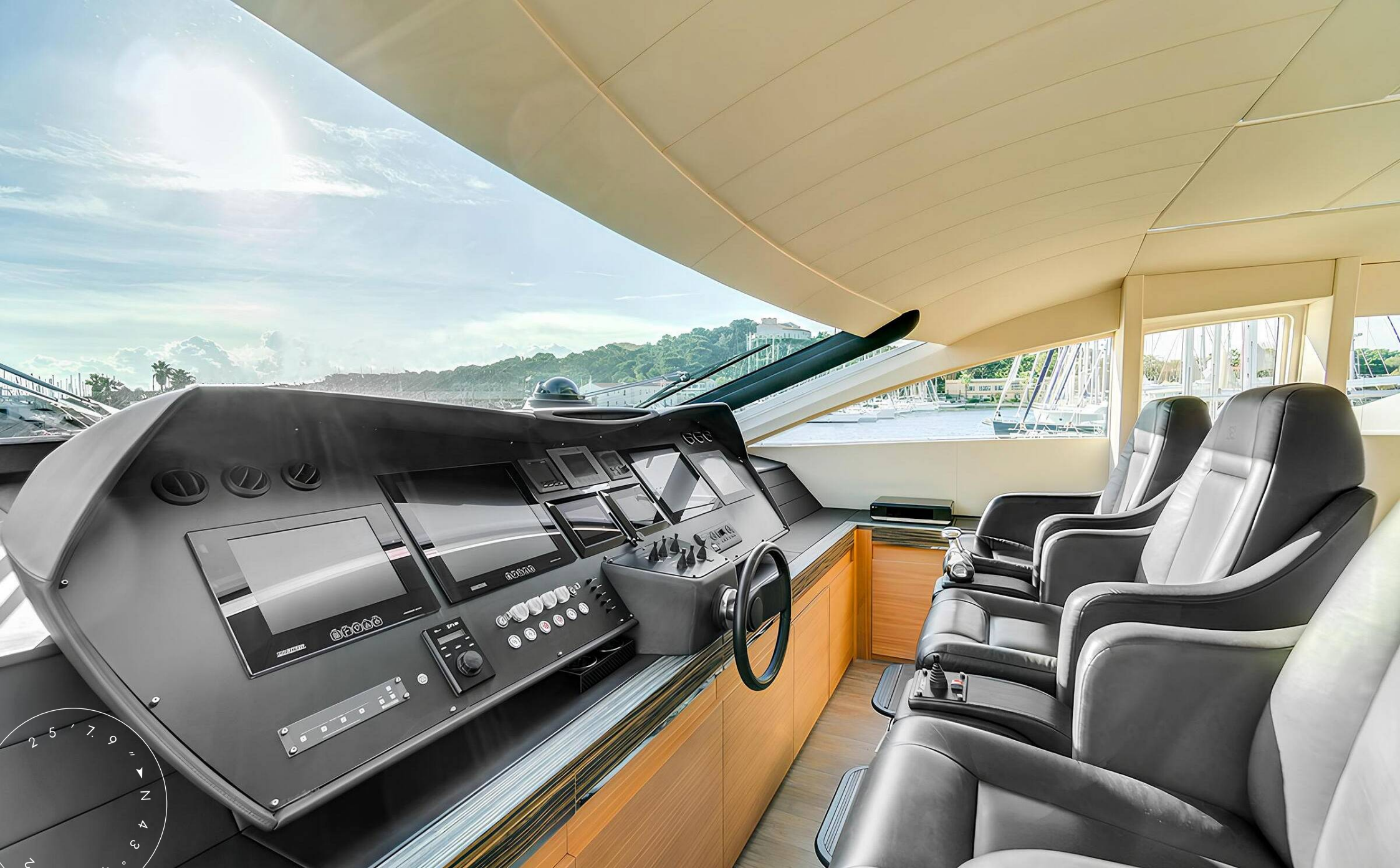
MAIN HELM STATION