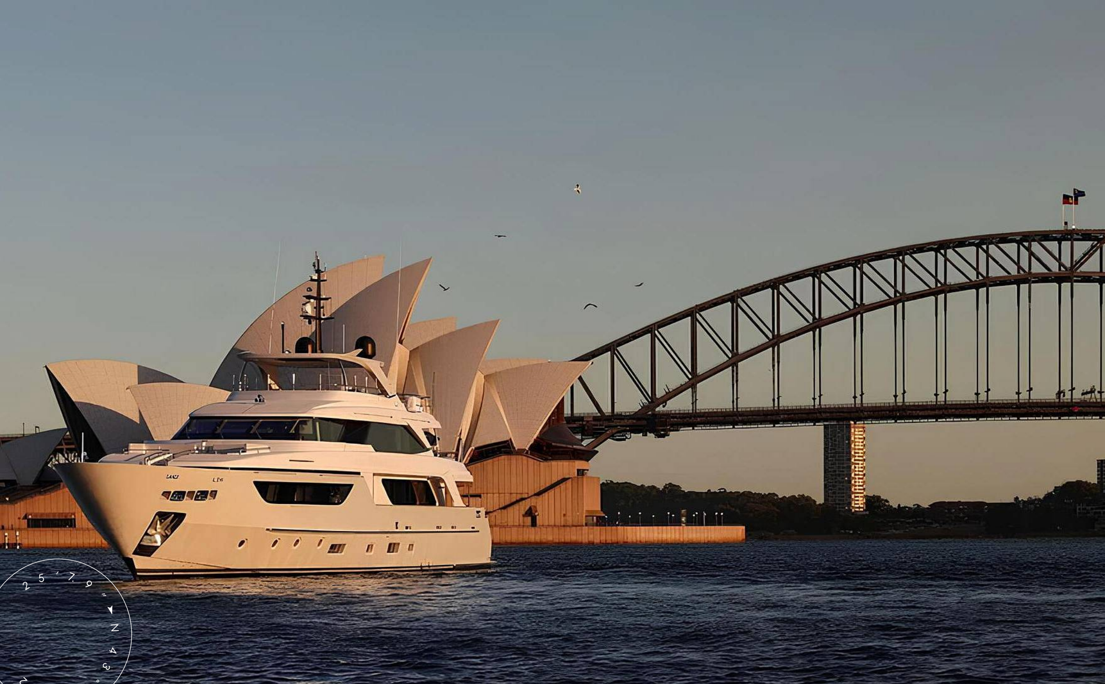
EXTERIOR SANLORENZO SD126 2023 MY LANCE