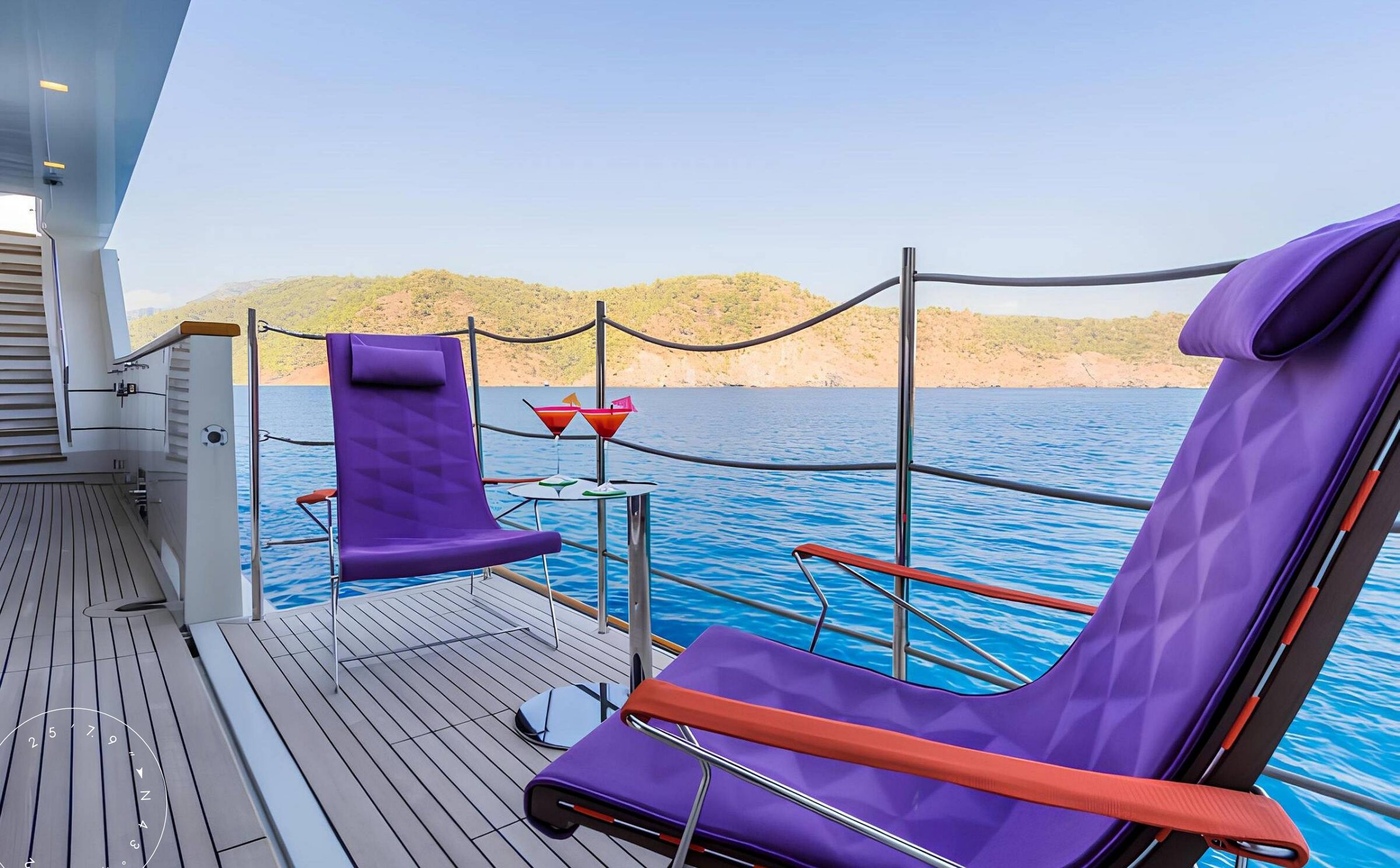
FOLDING STARBOARD BALCONY