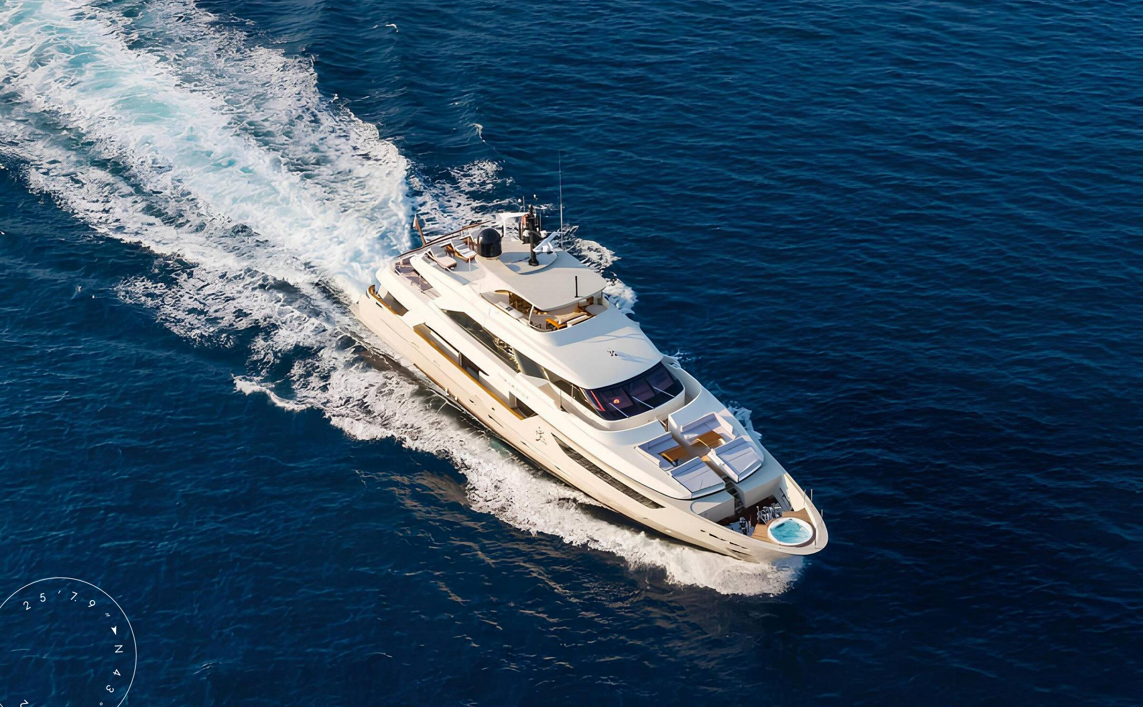
EXTERIOR SANLORENZO SD126 2016 MY TAKARA ONE