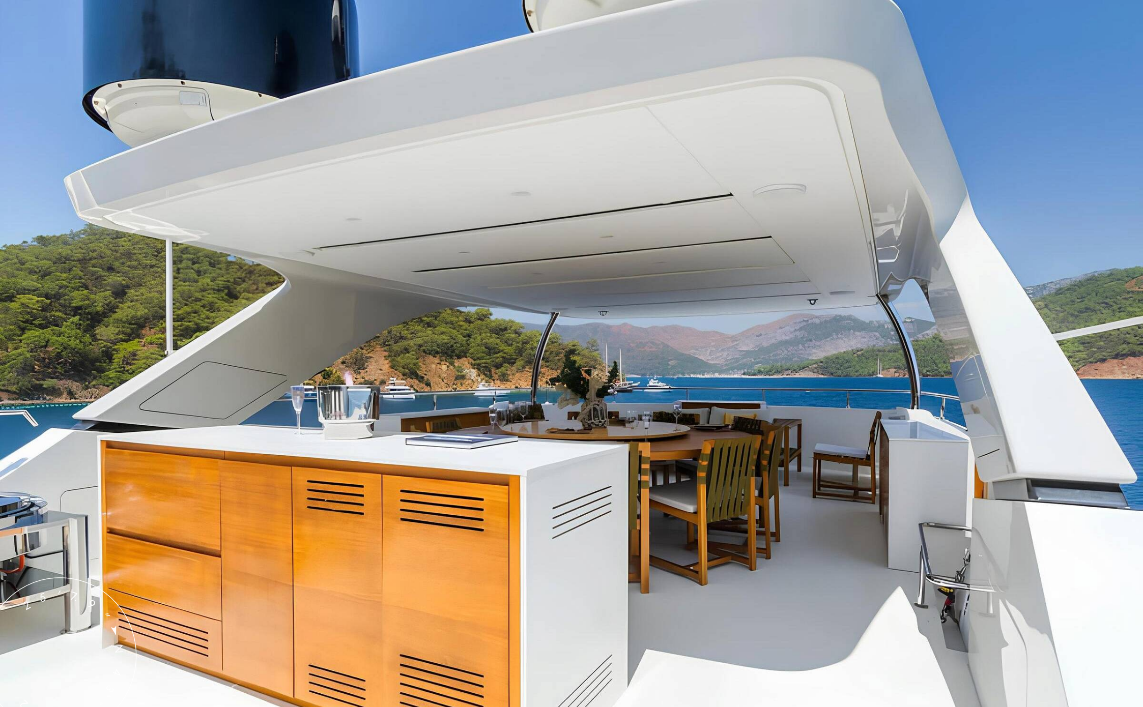
SUNDECK DINING AREA