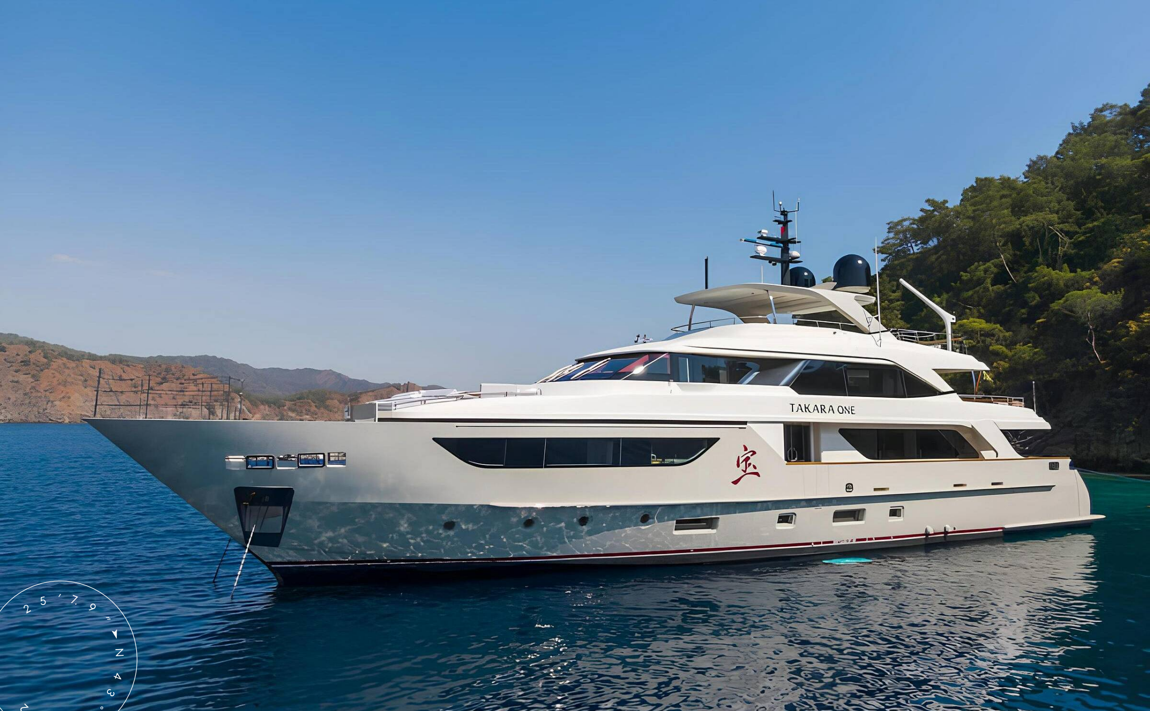
EXTERIOR SANLORENZO SD126 2016 MY TAKARA ONE