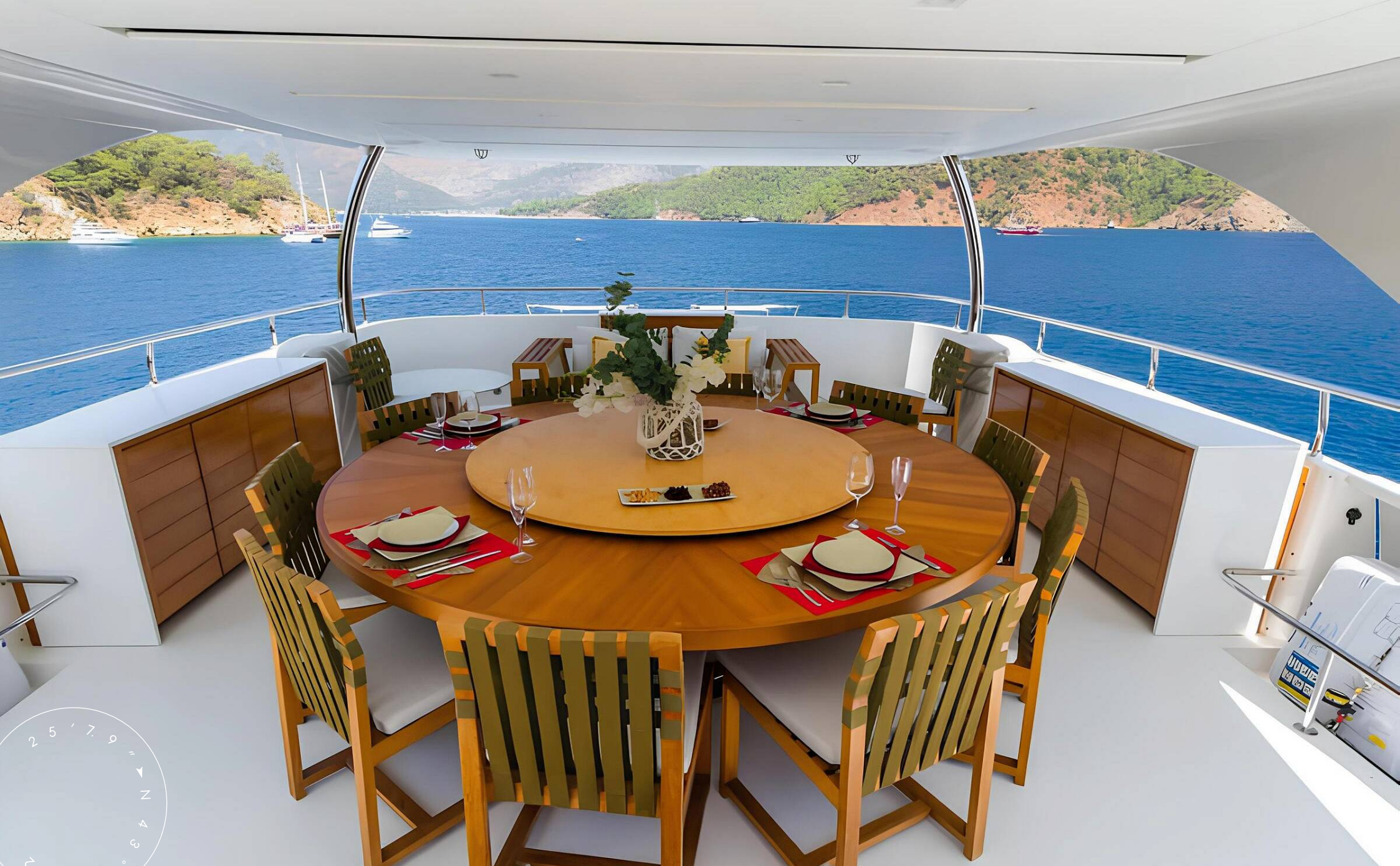
SUNDECK DINING AREA