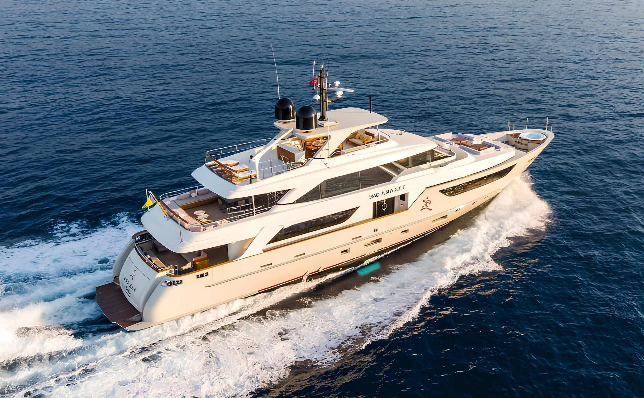
EXTERIOR SANLORENZO SD126 2016 MY TAKARA ONE