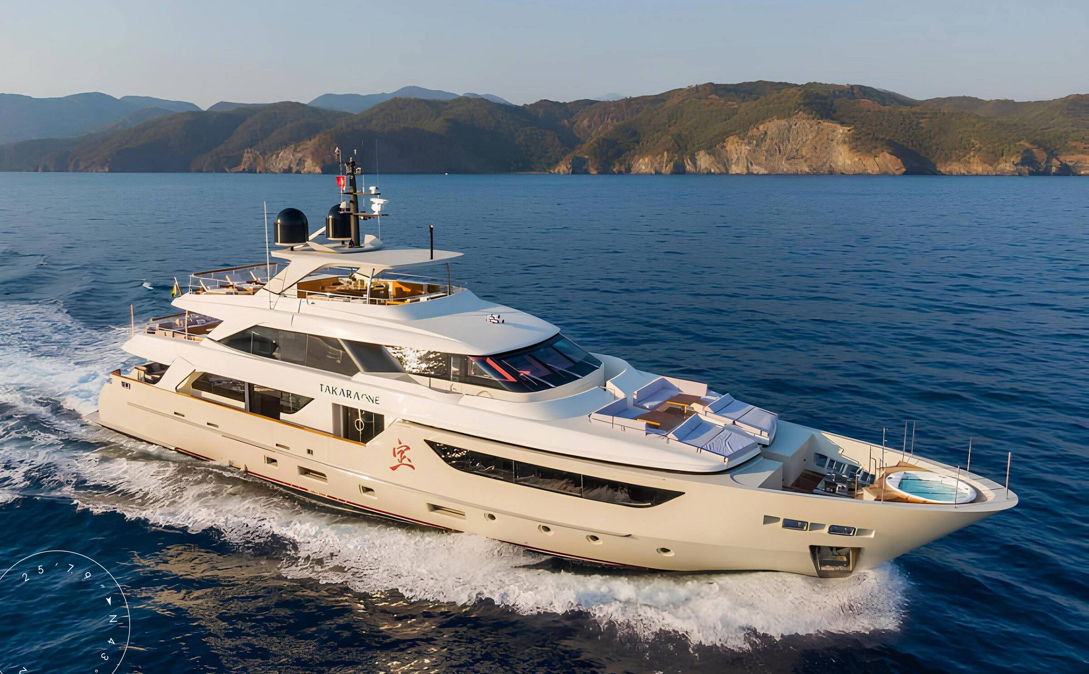
EXTERIOR SANLORENZO SD126 2016 MY TAKARA ONE