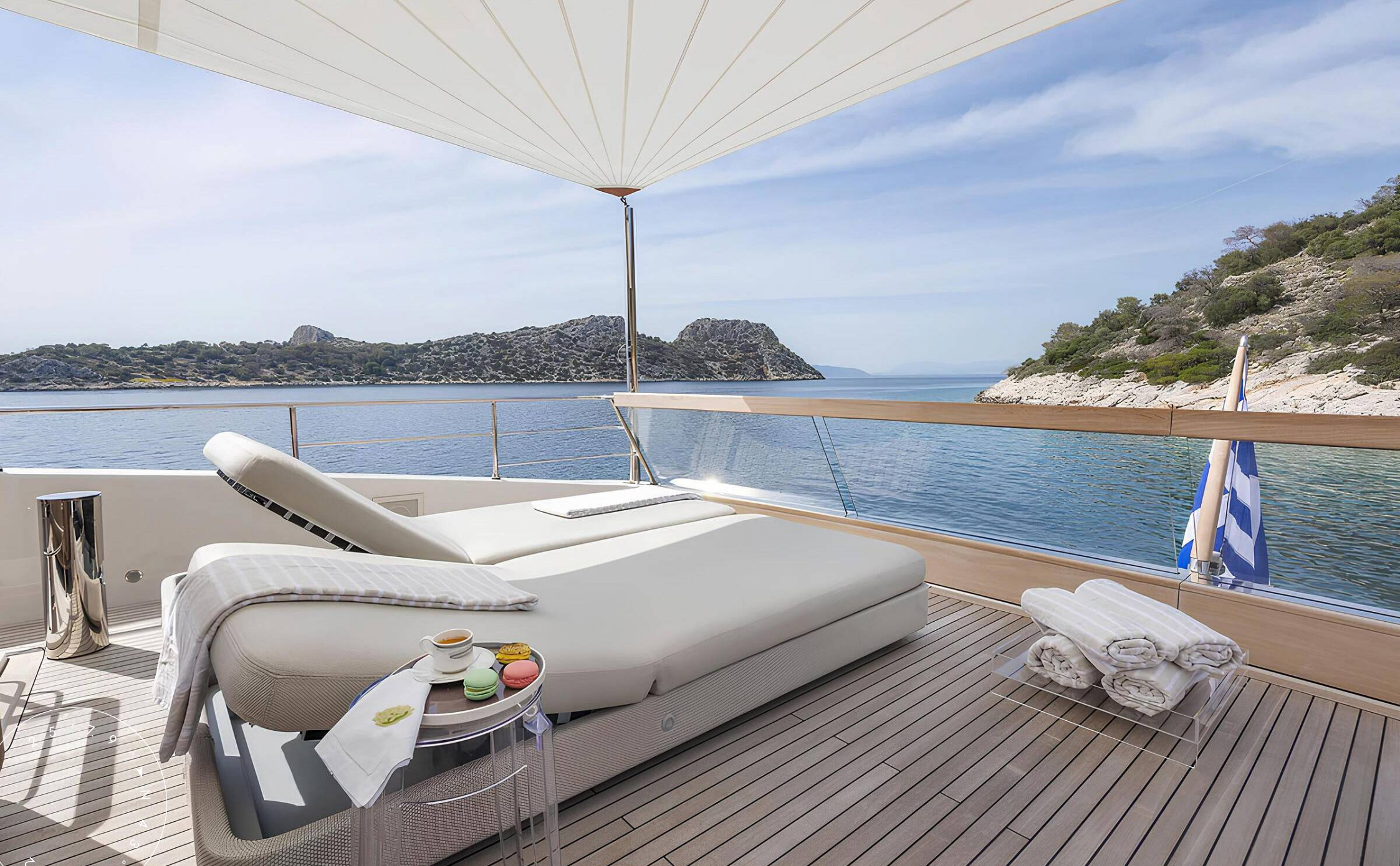
FLYBRIDGE AFT SUNBATHING AREA