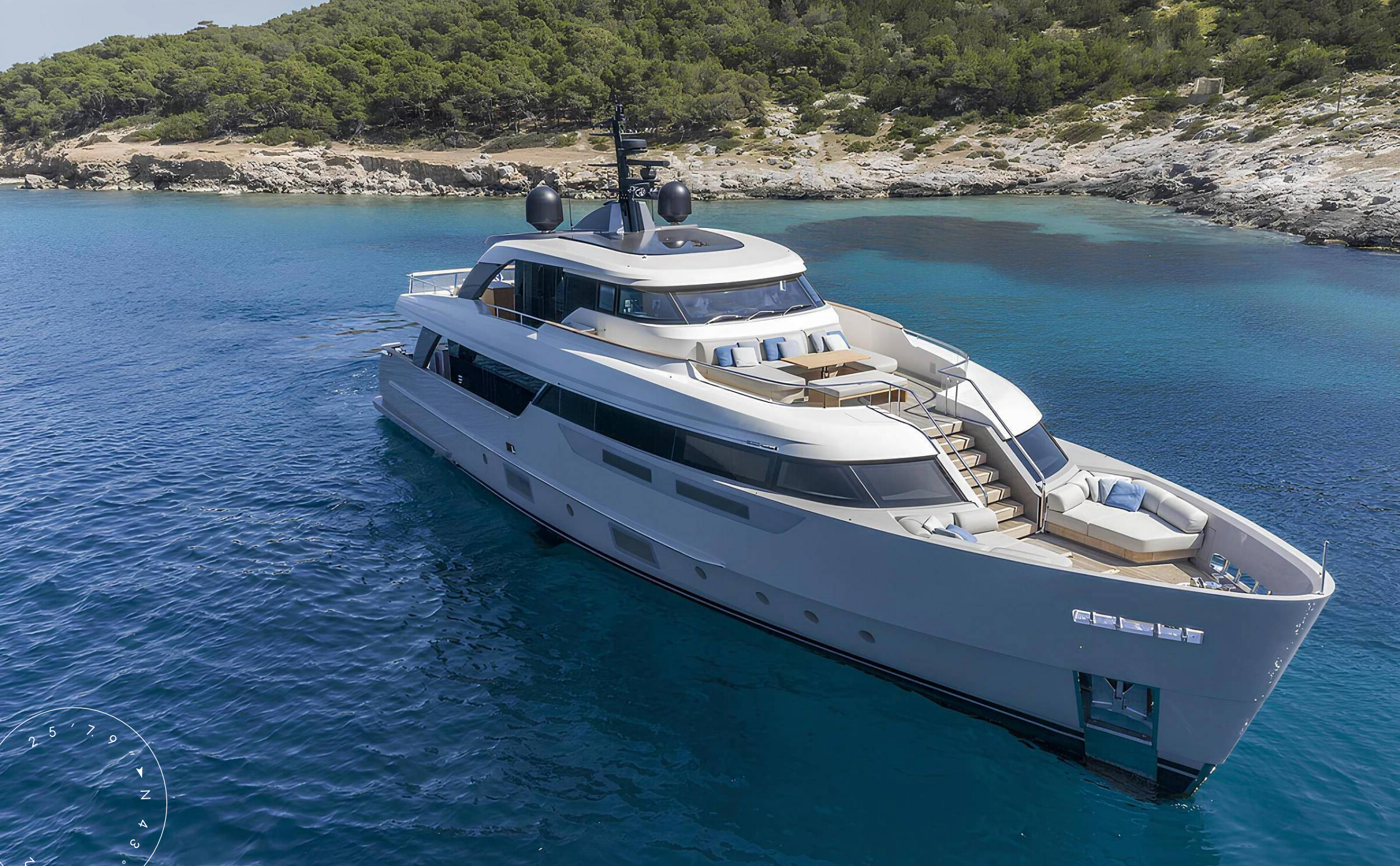
EXTERIOR SANLORENZO SD96 2021 MY FASTA