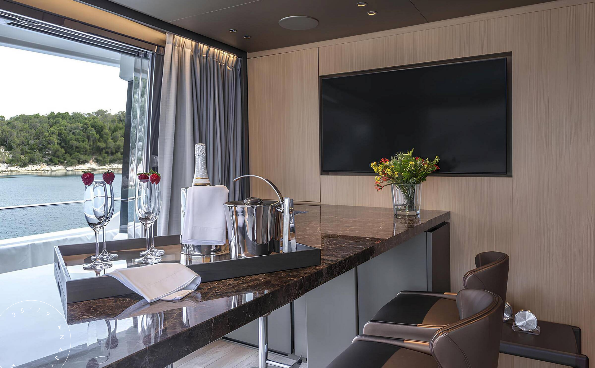
MAIN SALON BAR