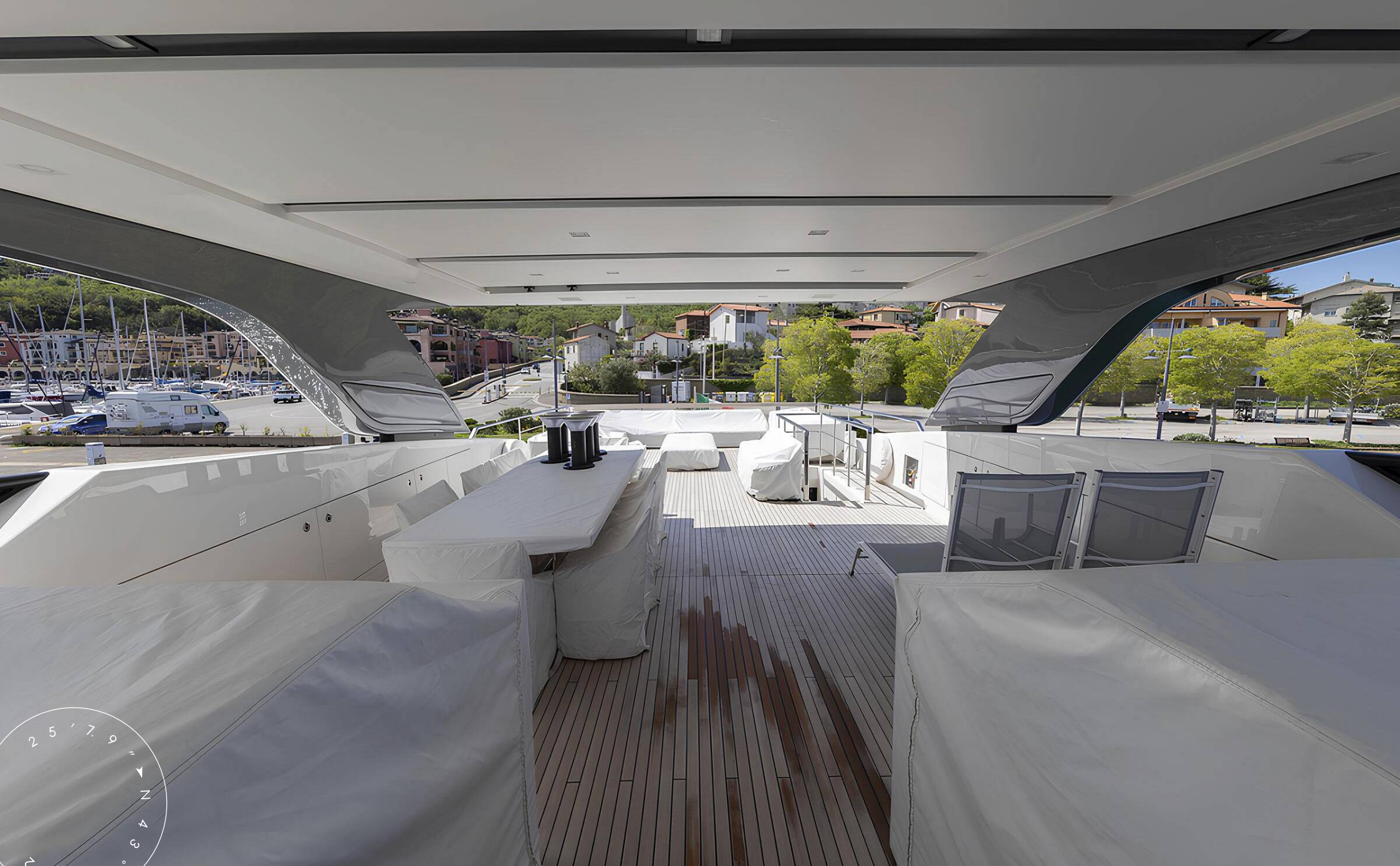
FLYBRIDGE LOUNGE AREA