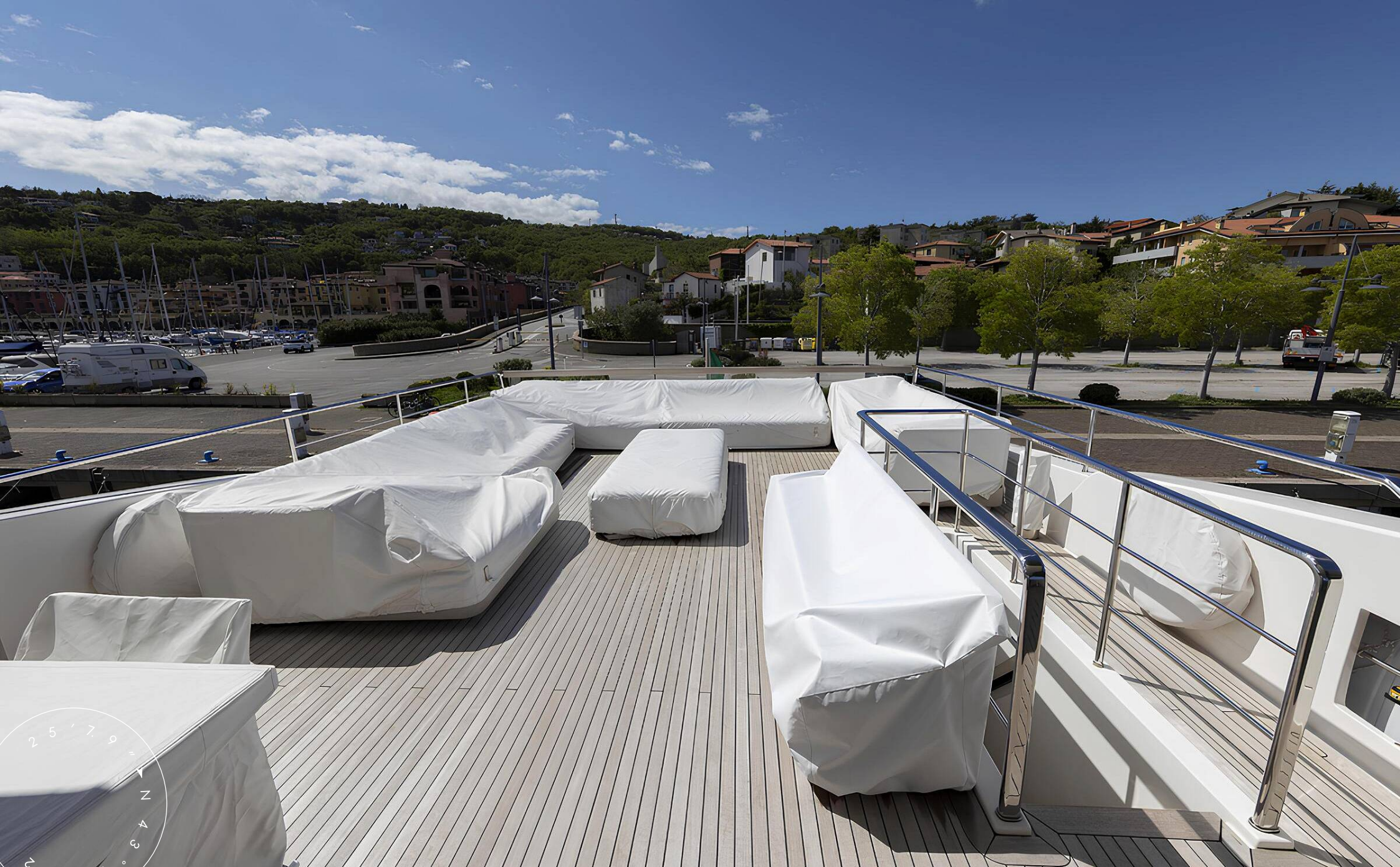
FLYBRIDGE LOUNGE AREA