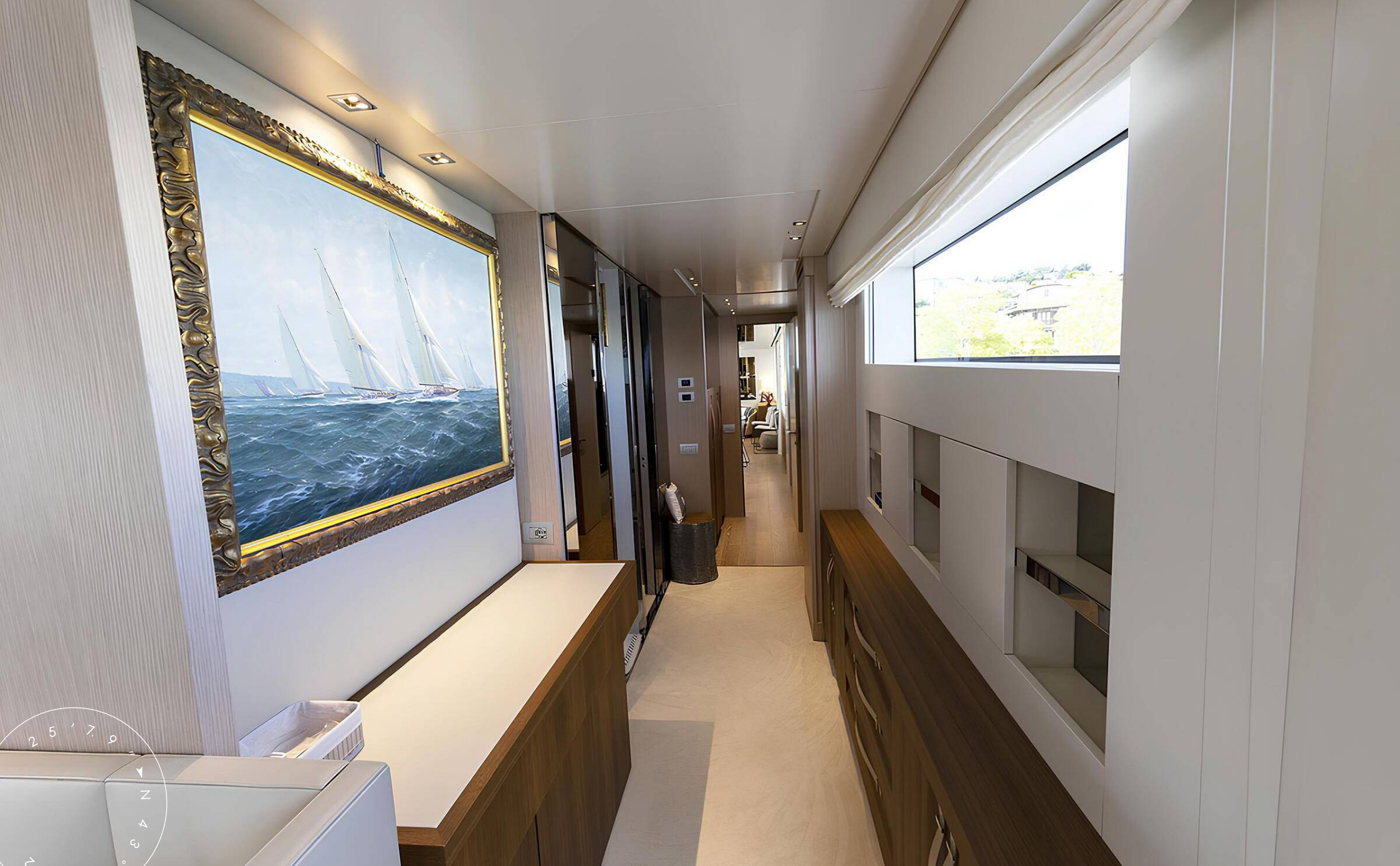
MAIN SALON LOBBY