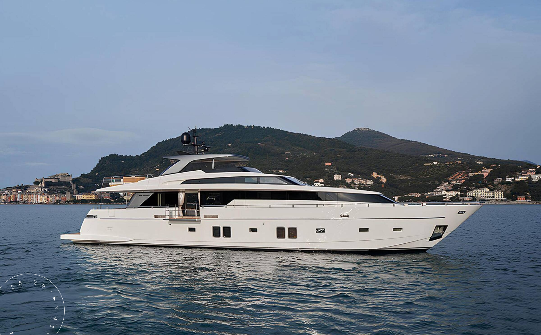
EXTERIOR SANLORENZO SL106 2020 MY VITTORIA