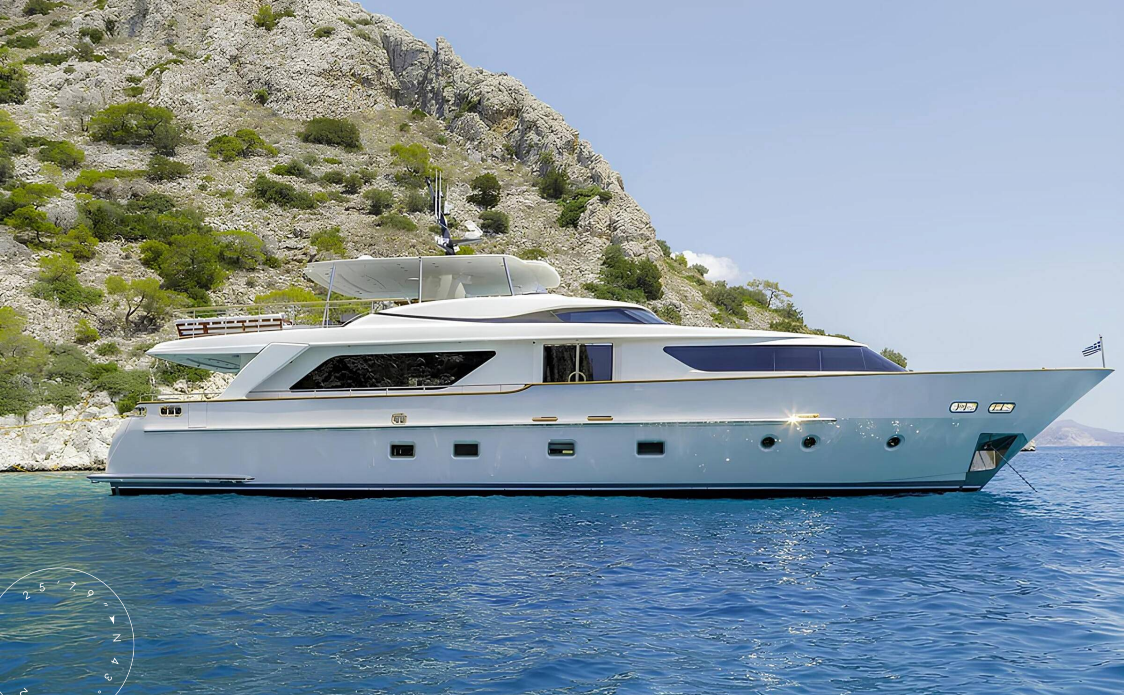
EXTERIOR SANLORENZO SD92 2010 MY ELYSIUM