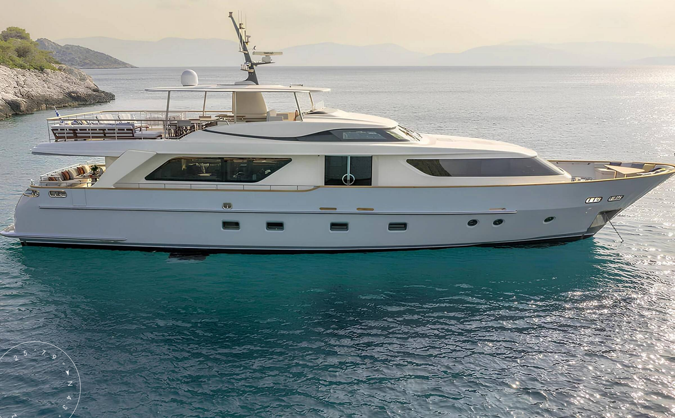
EXTERIOR SANLORENZO SD92 2010 M/Y ELYSIUM