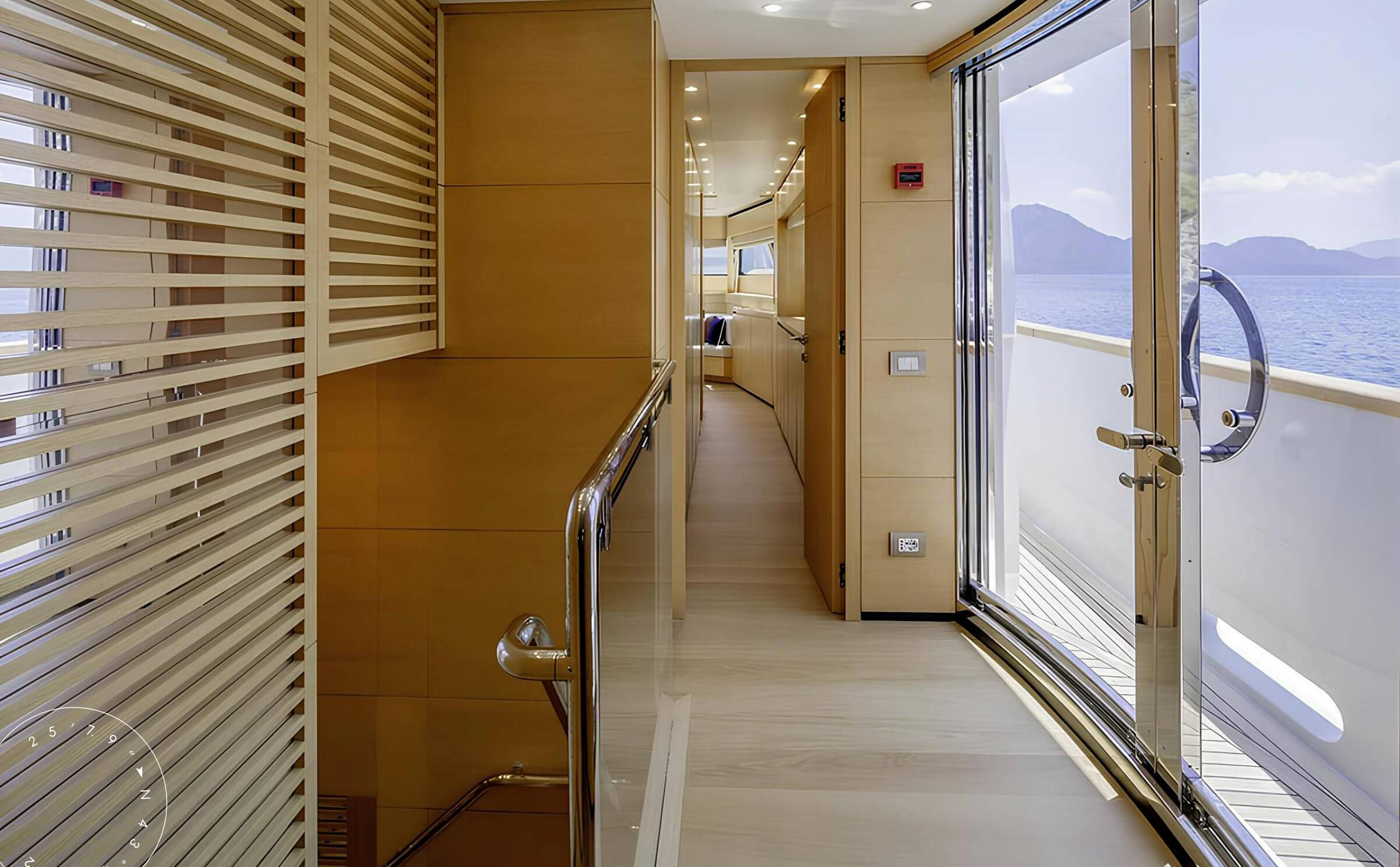
MAIN SALON LOBBY