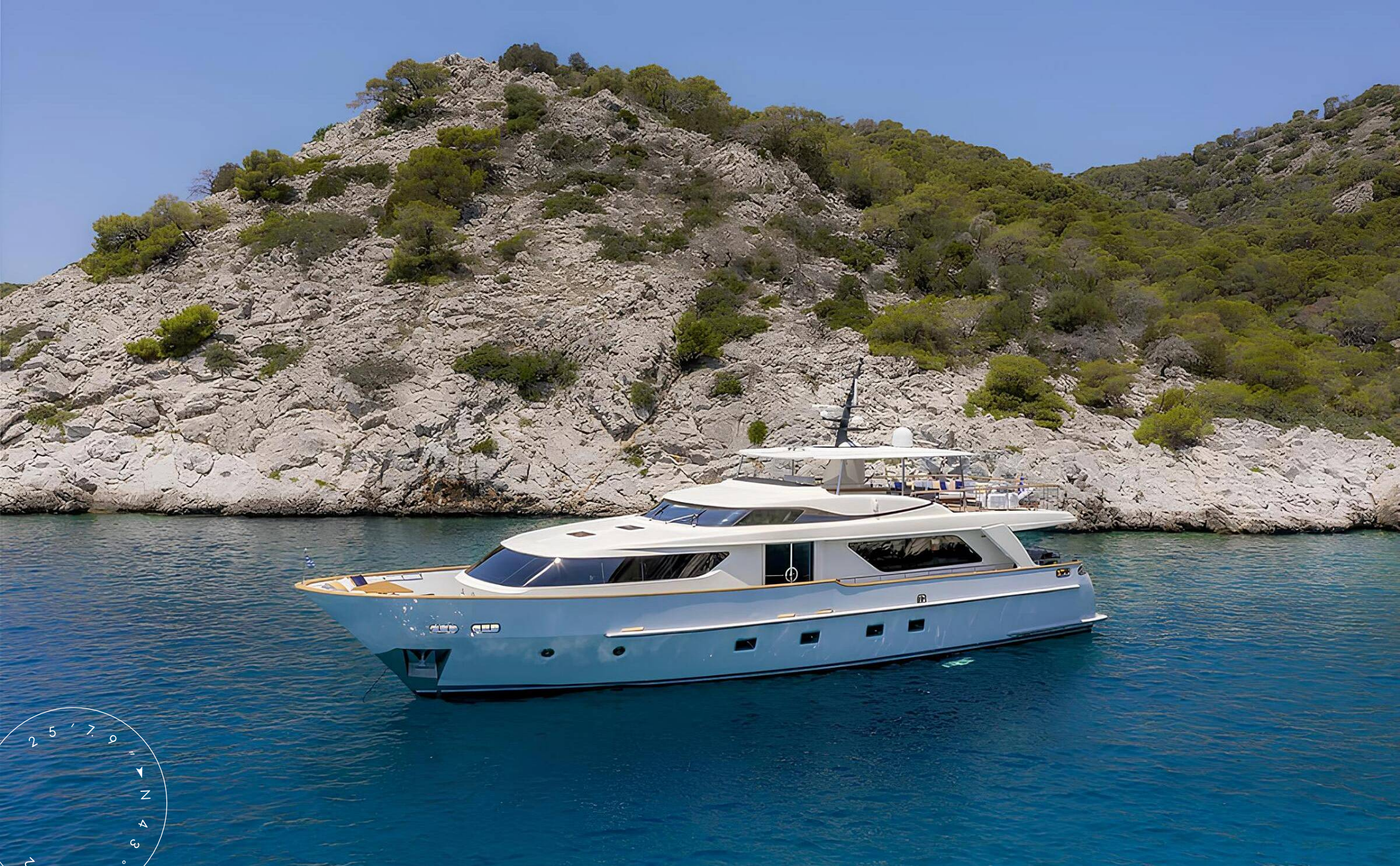
EXTERIOR SANLORENZO SD92 2010 MY ELYSIUM