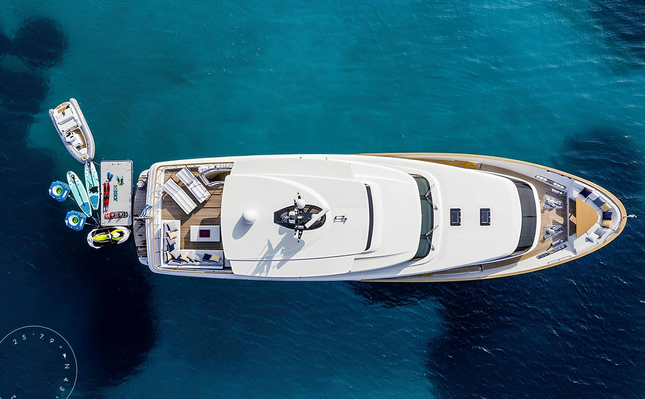
EXTERIOR SANLORENZO SD92 2010 MY ELYSIUM