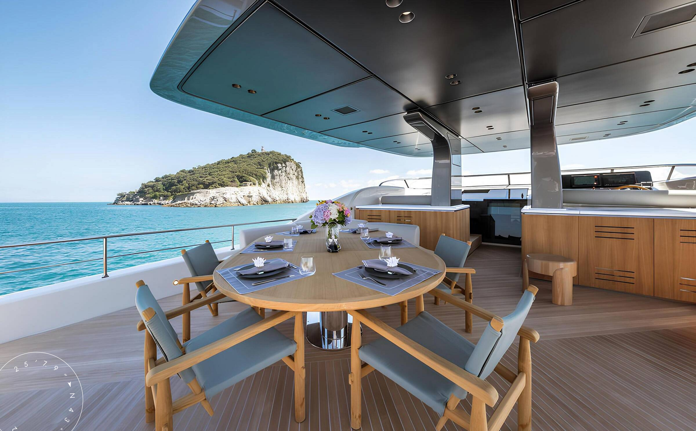
FLYBRIDGE DINING AREA