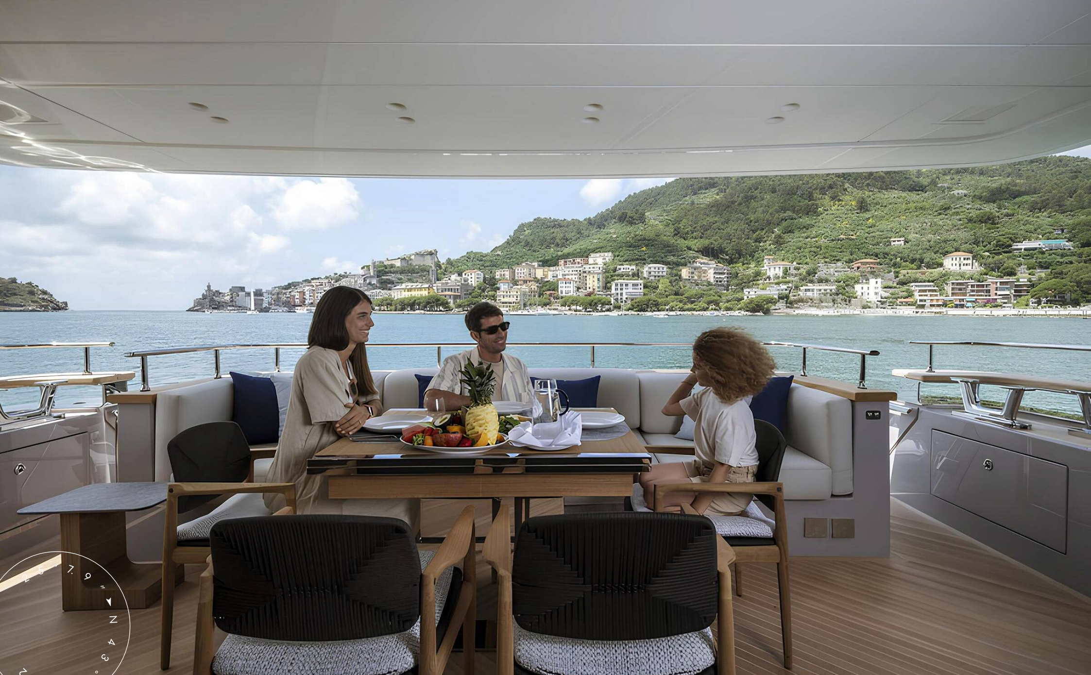
COCKPIT DINING AREA