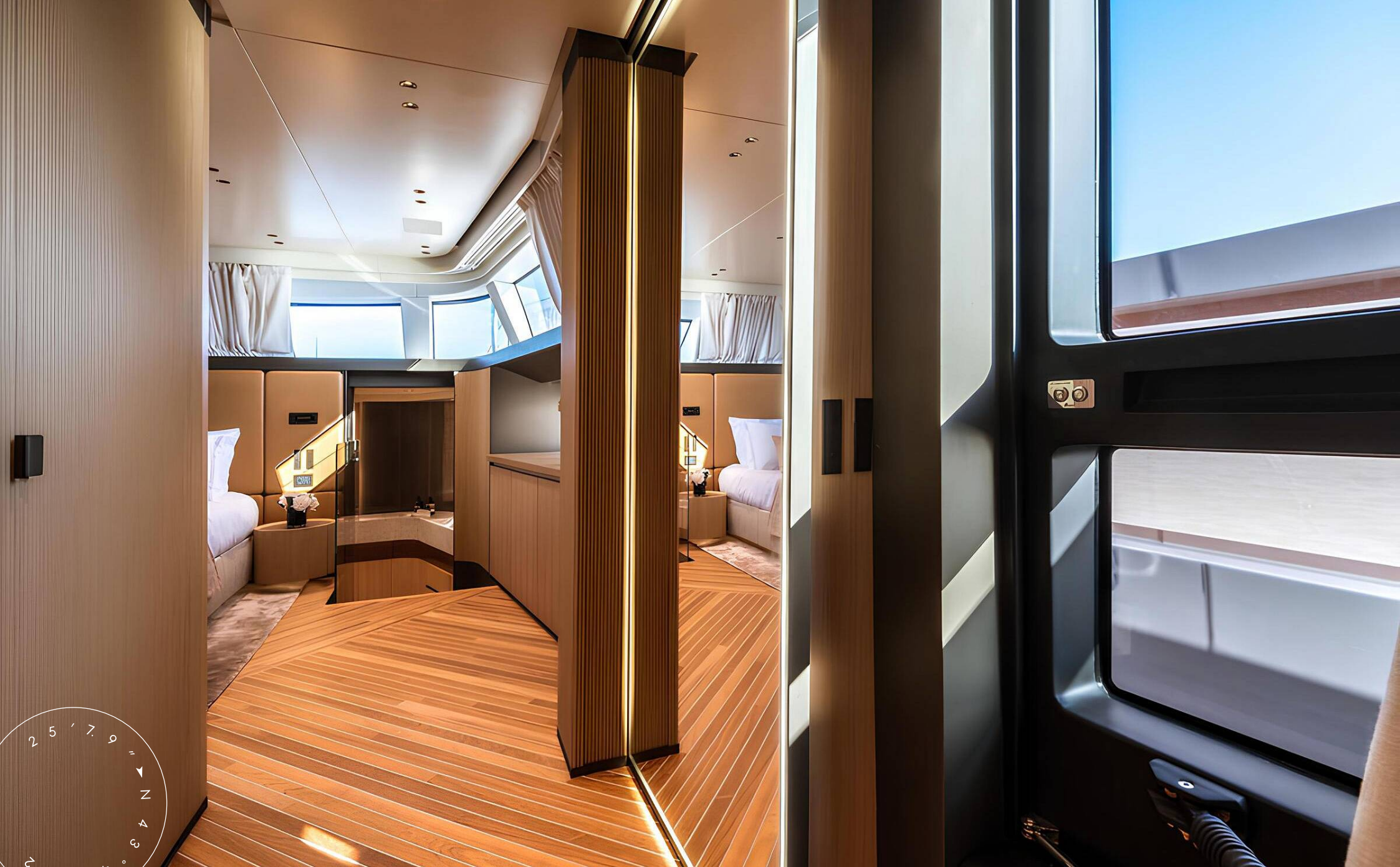
MAIN SALON DINING AREA