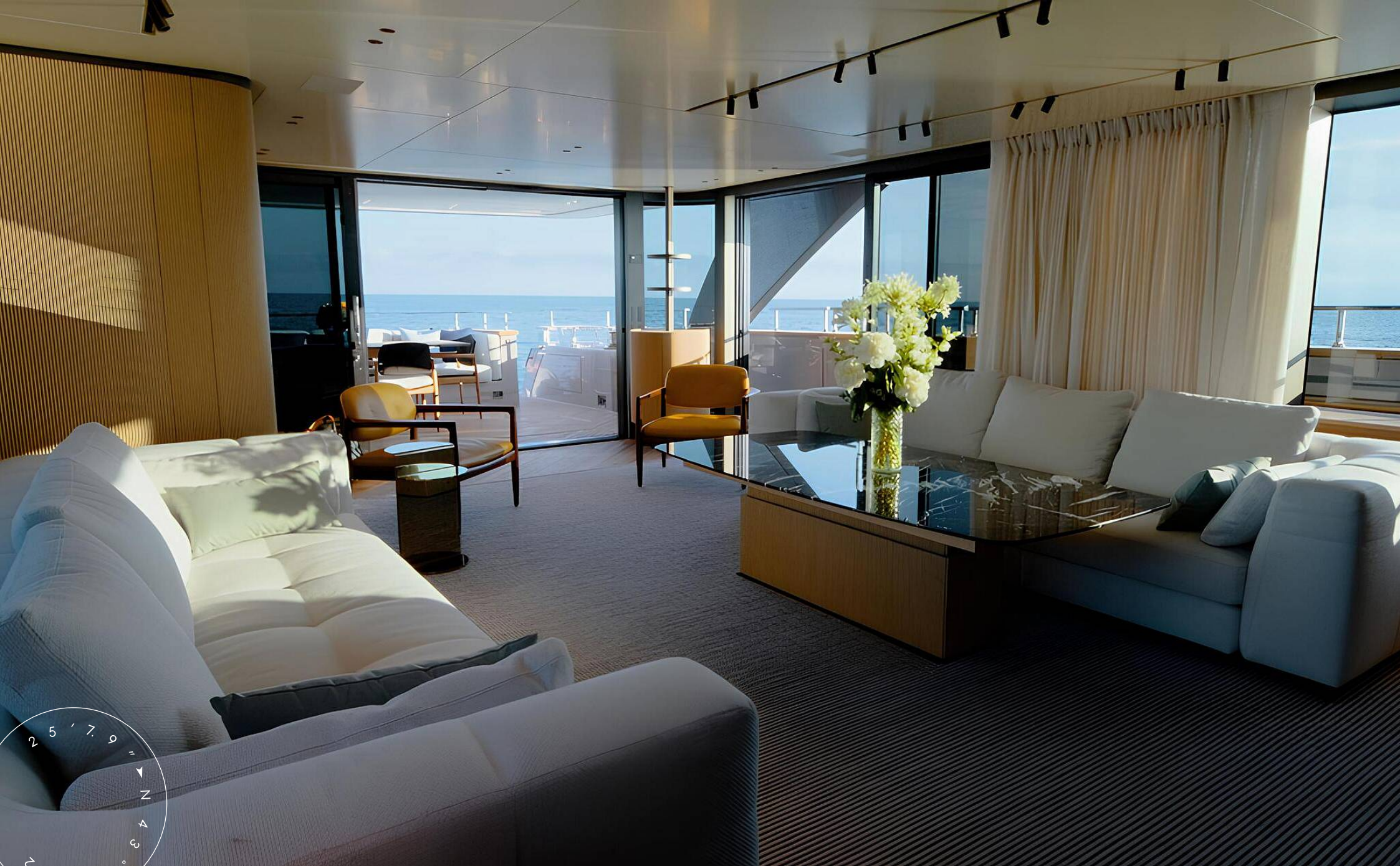
MAIN SALON LOUNGE AREA