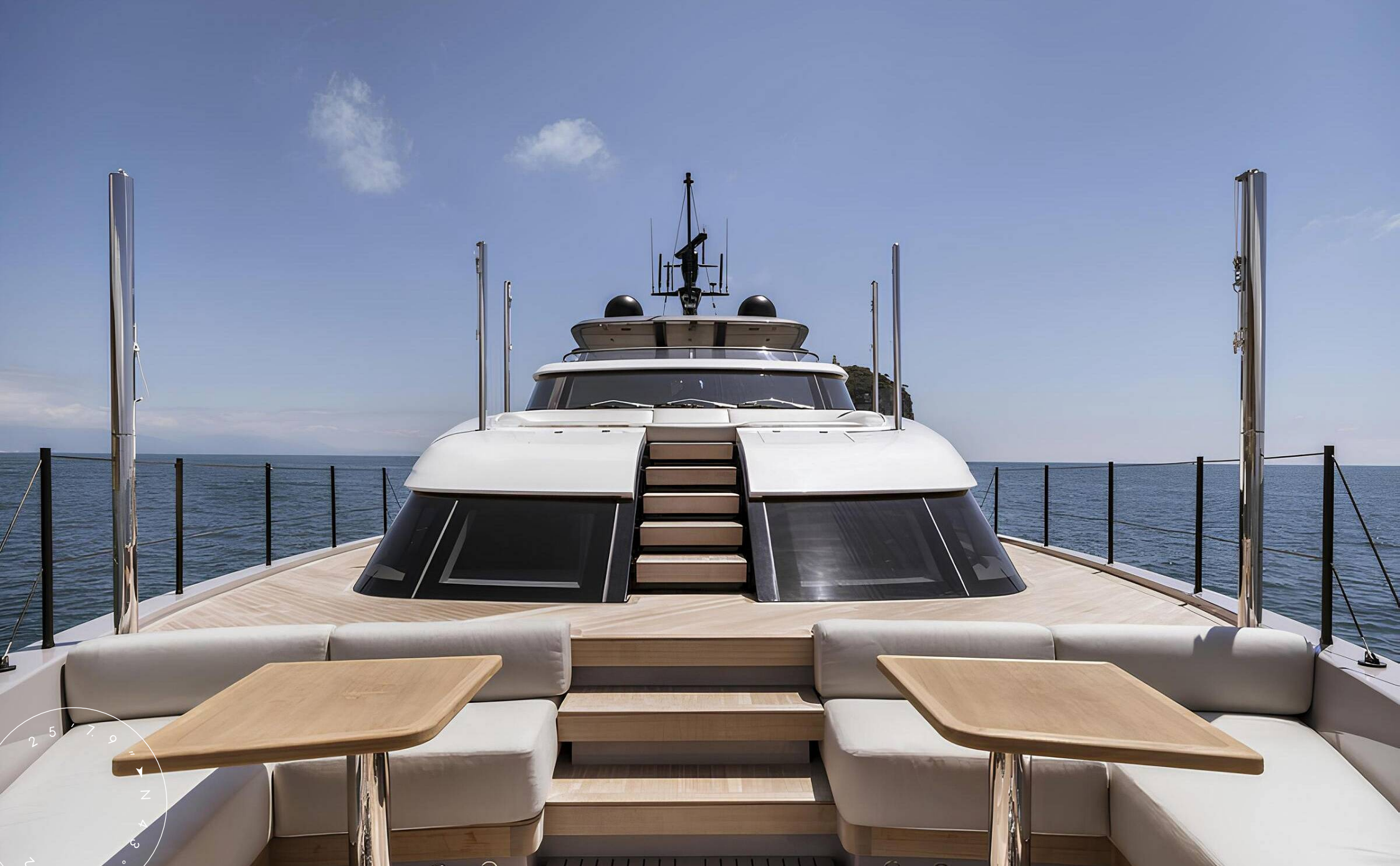
BOW LOUNGE AREA