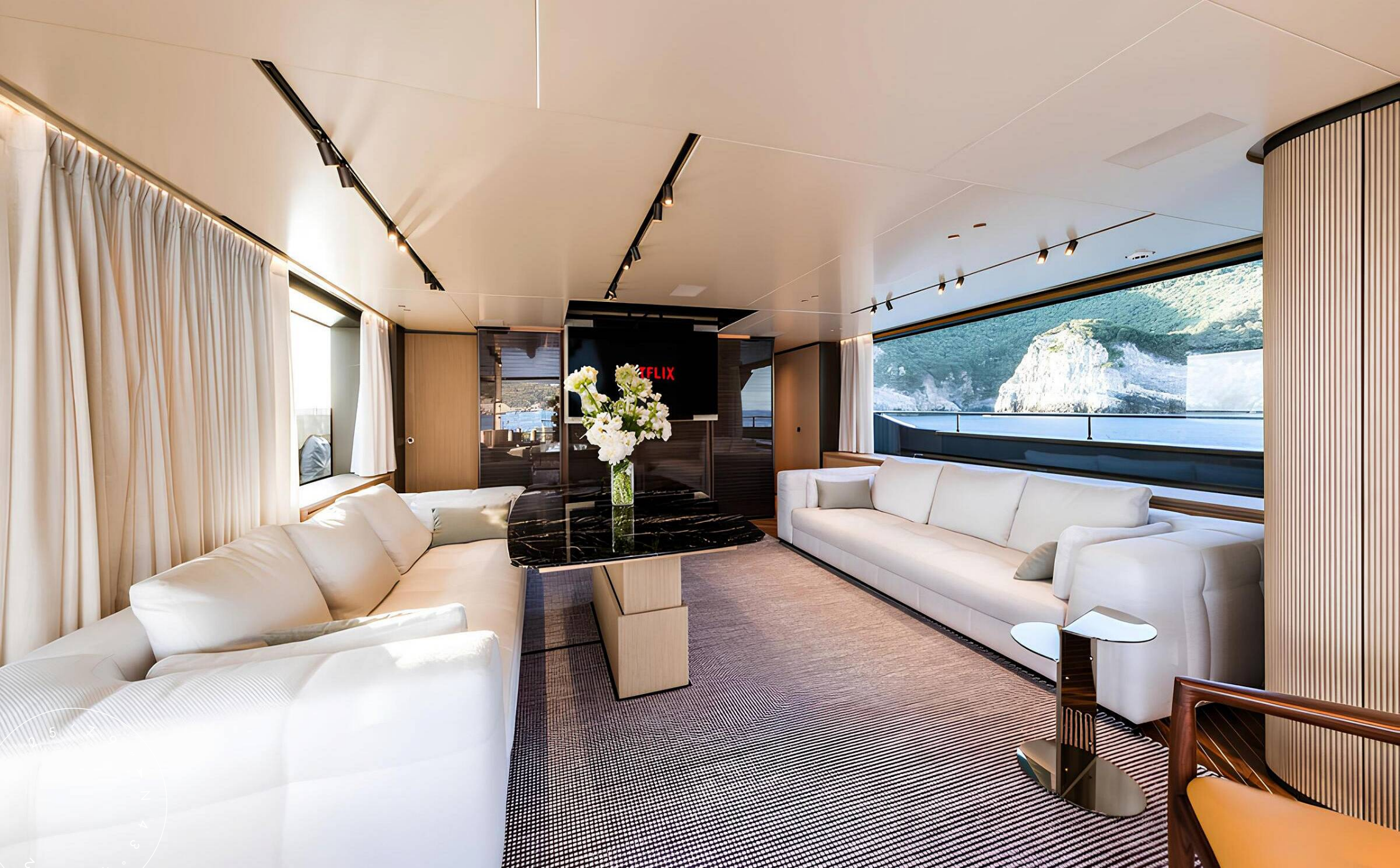
MAIN SALON LOUNGE AREA