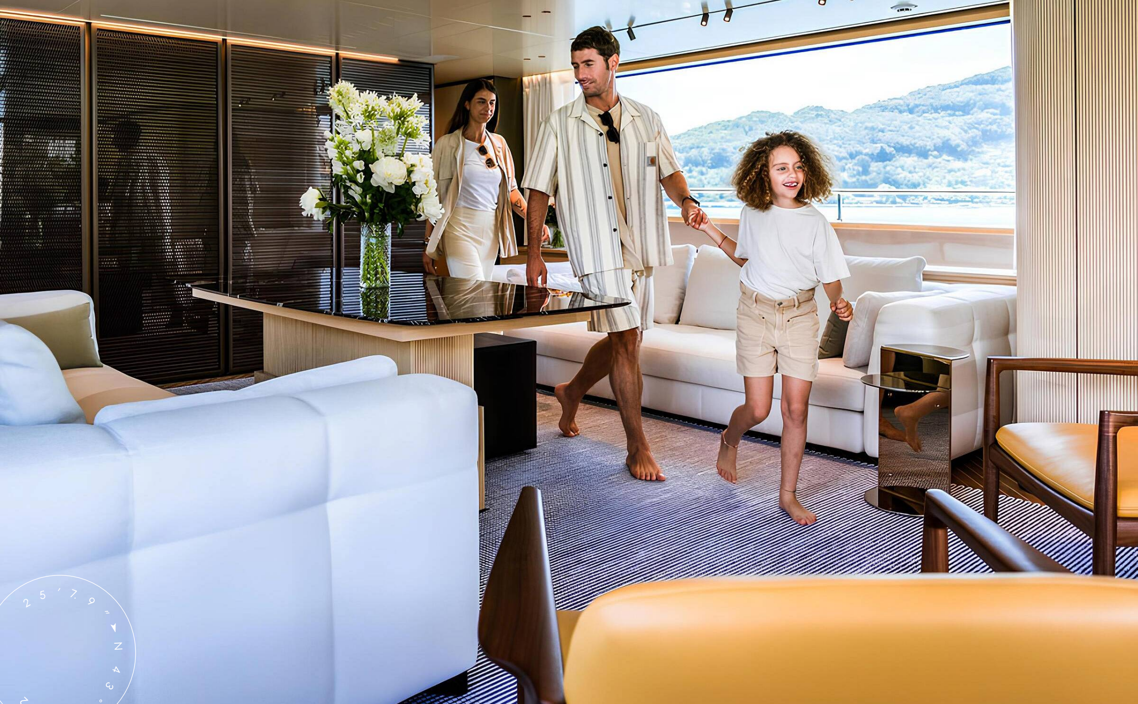
MAIN SALON LOUNGE AREA