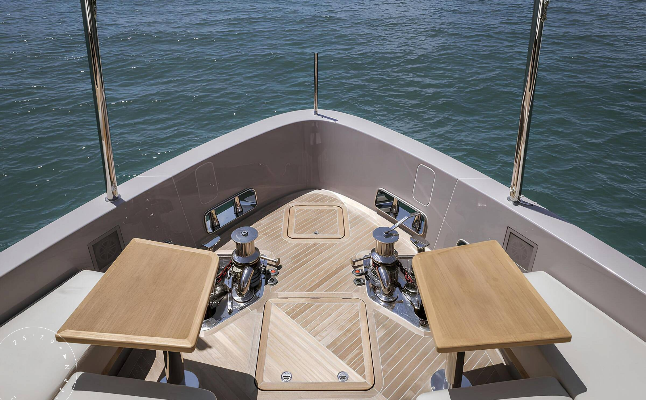
BOW LOUNGE AREA