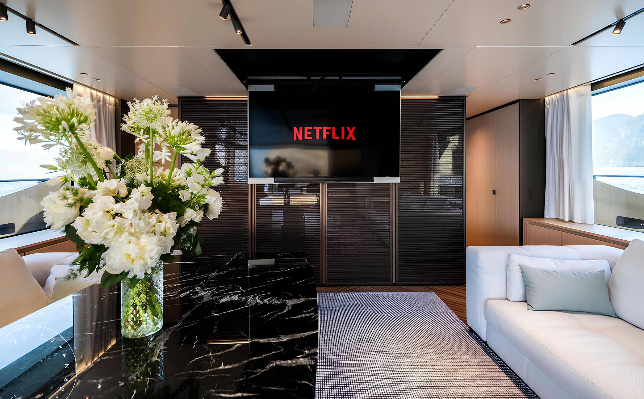
MAIN SALON LOUNGE AREA