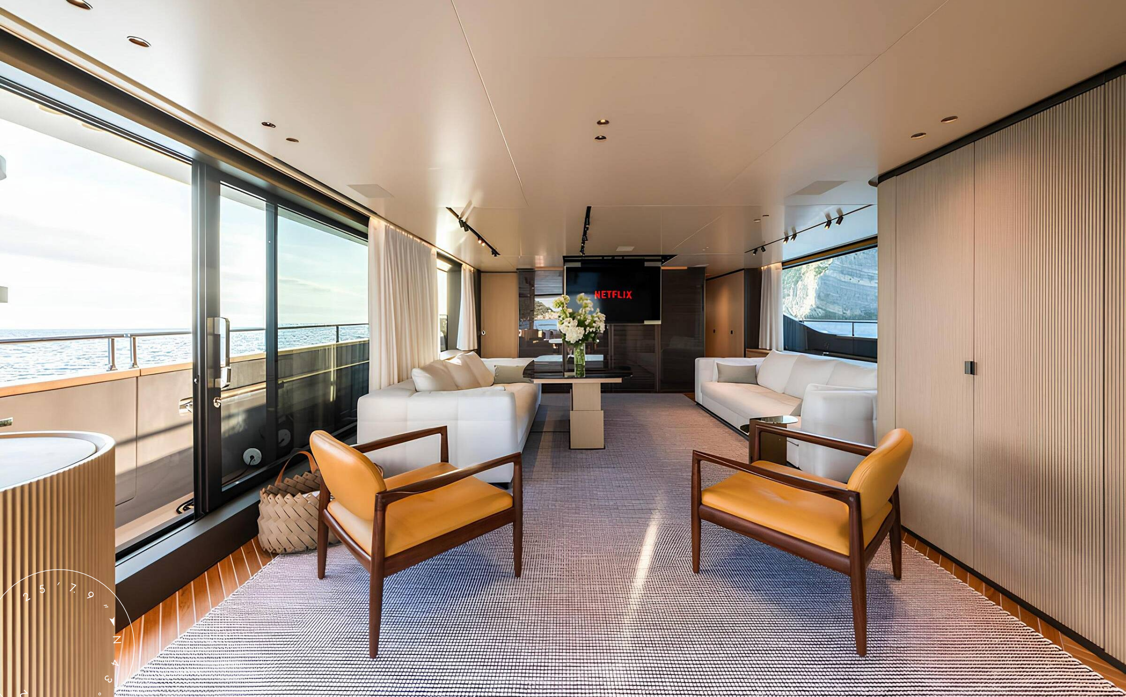
MAIN SALON LOUNGE AREA