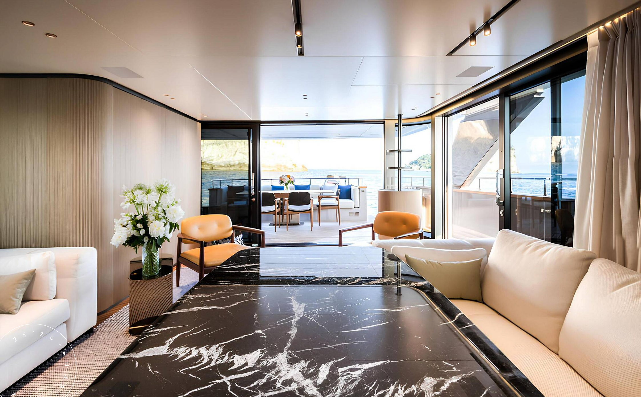
MAIN SALON LOUNGE AREA