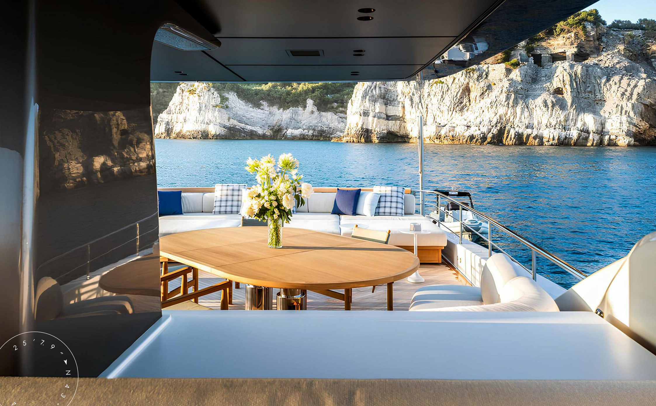
FLYBRIDGE DINING AREA