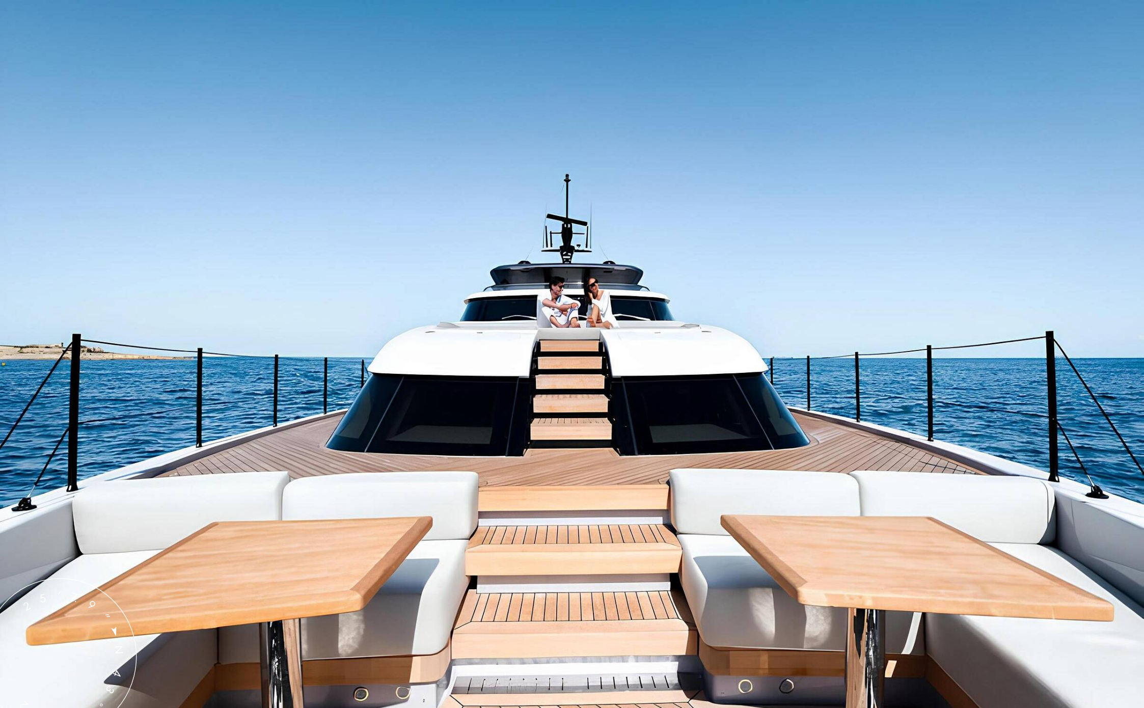
BOW LOUNGE AREA