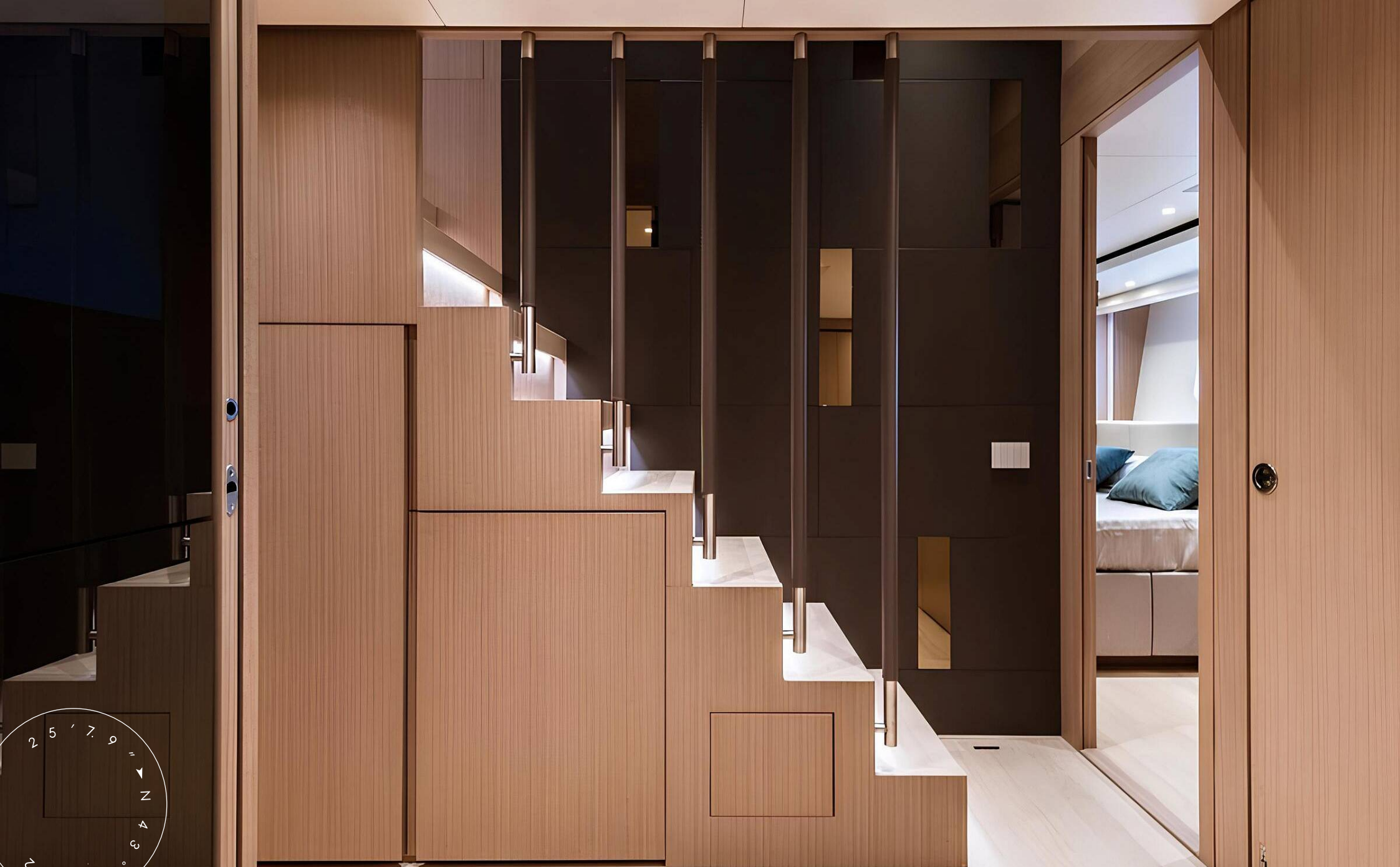
STAIRS FROM MD TO LD