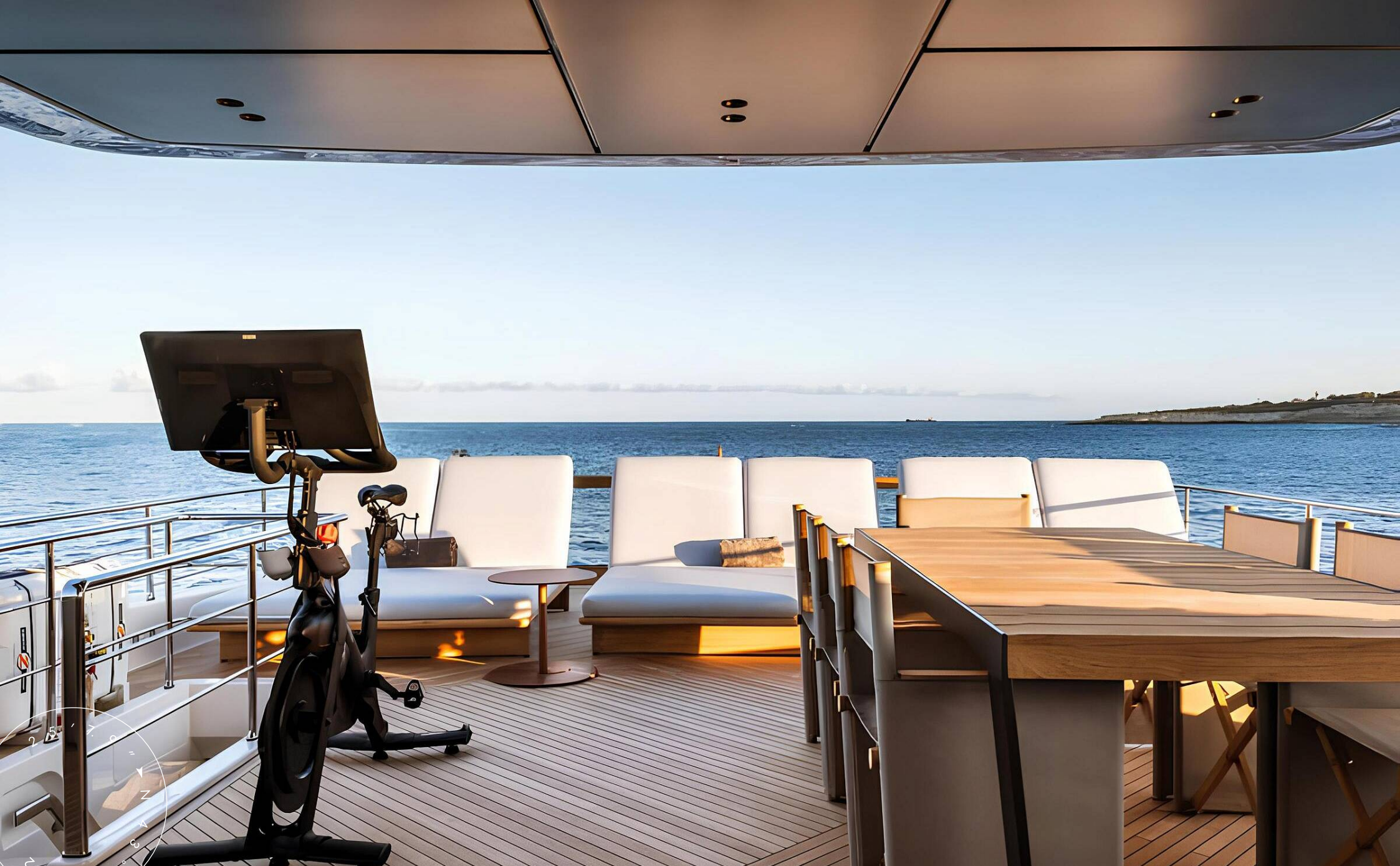
FLYBRIDGE AFT SUNBATHING AREA