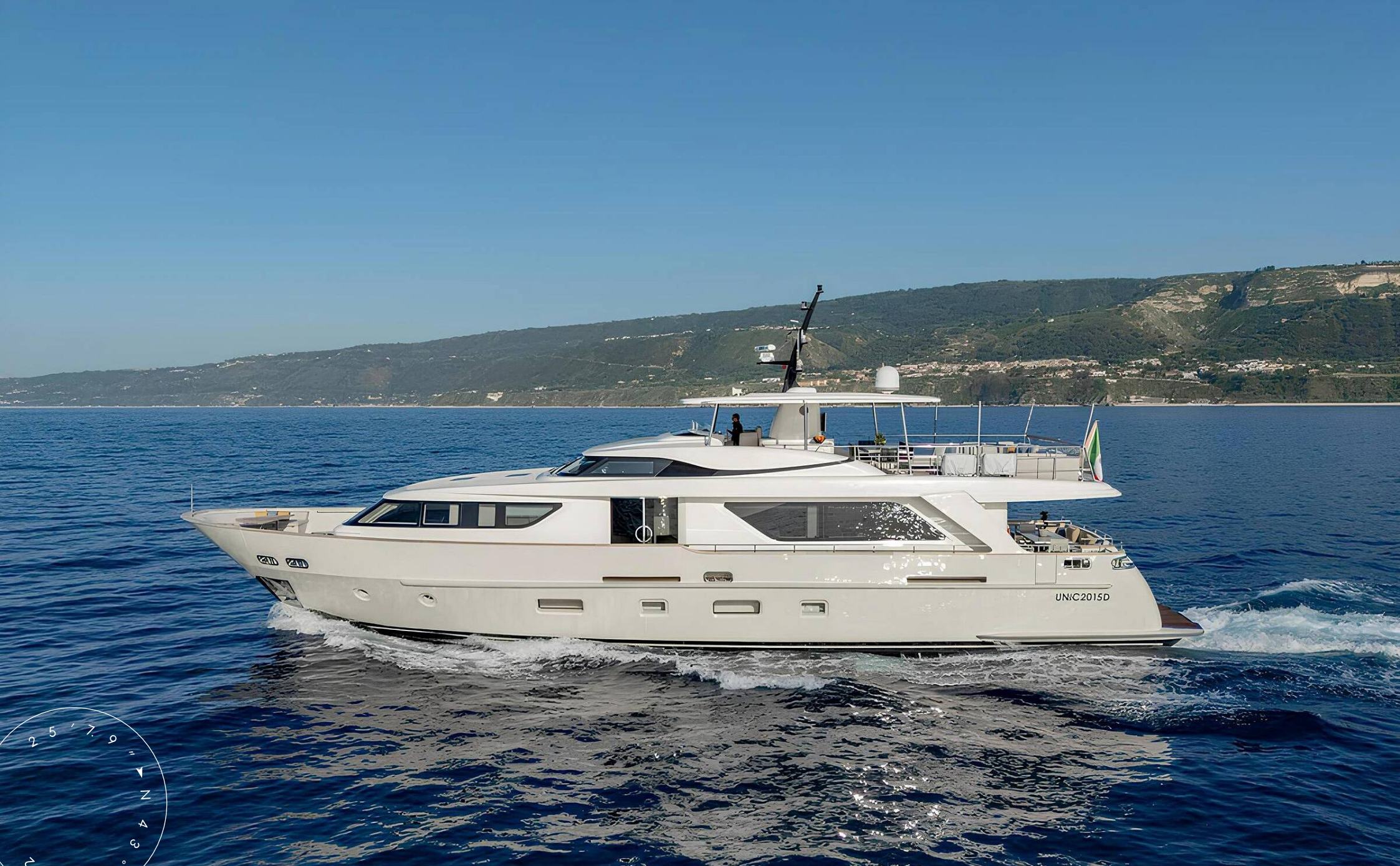
EXTERIOR SANLORENZO SD92 2015 MY UNICKA