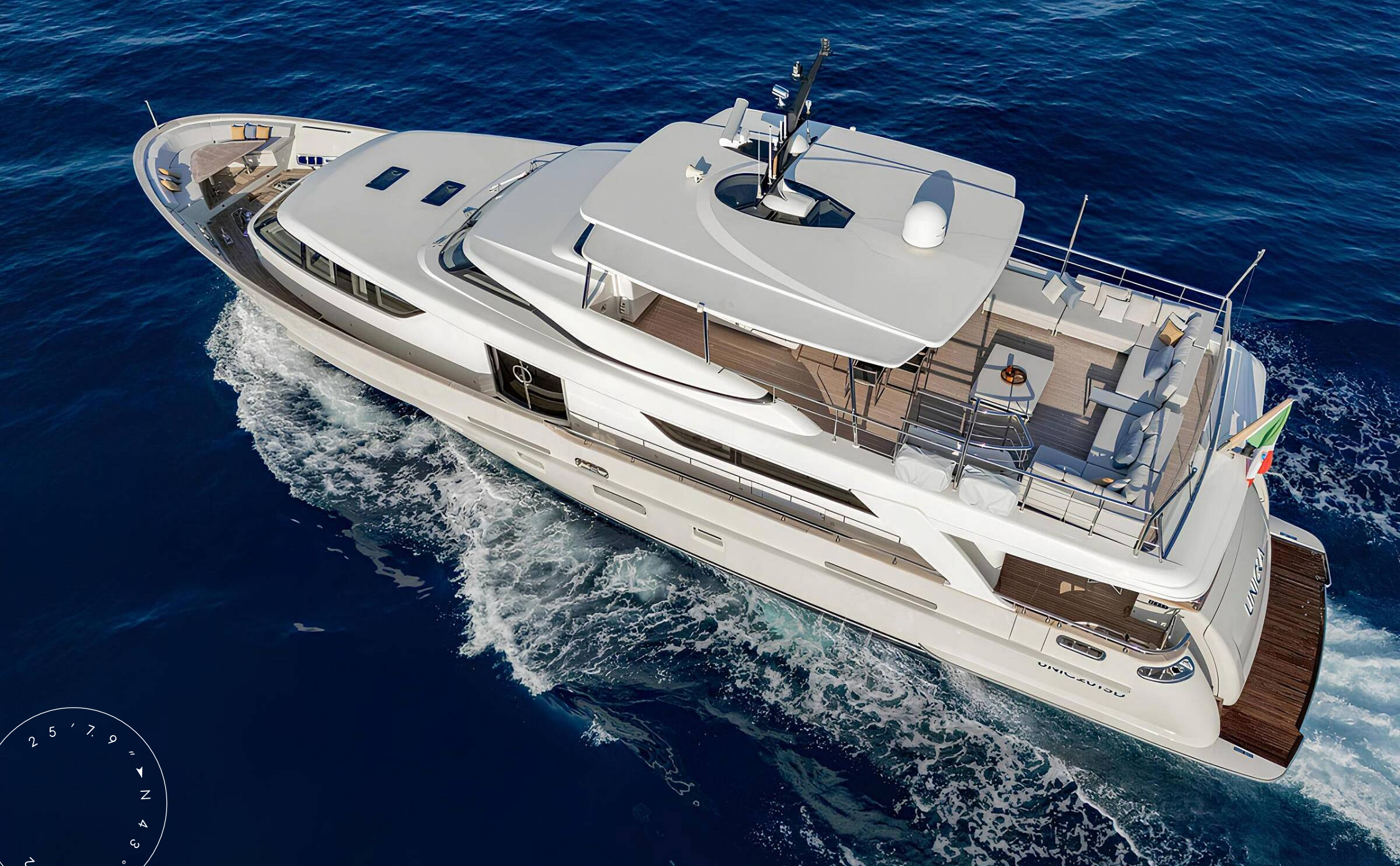
EXTERIOR SANLORENZO SD92 2015 MY UNICKA