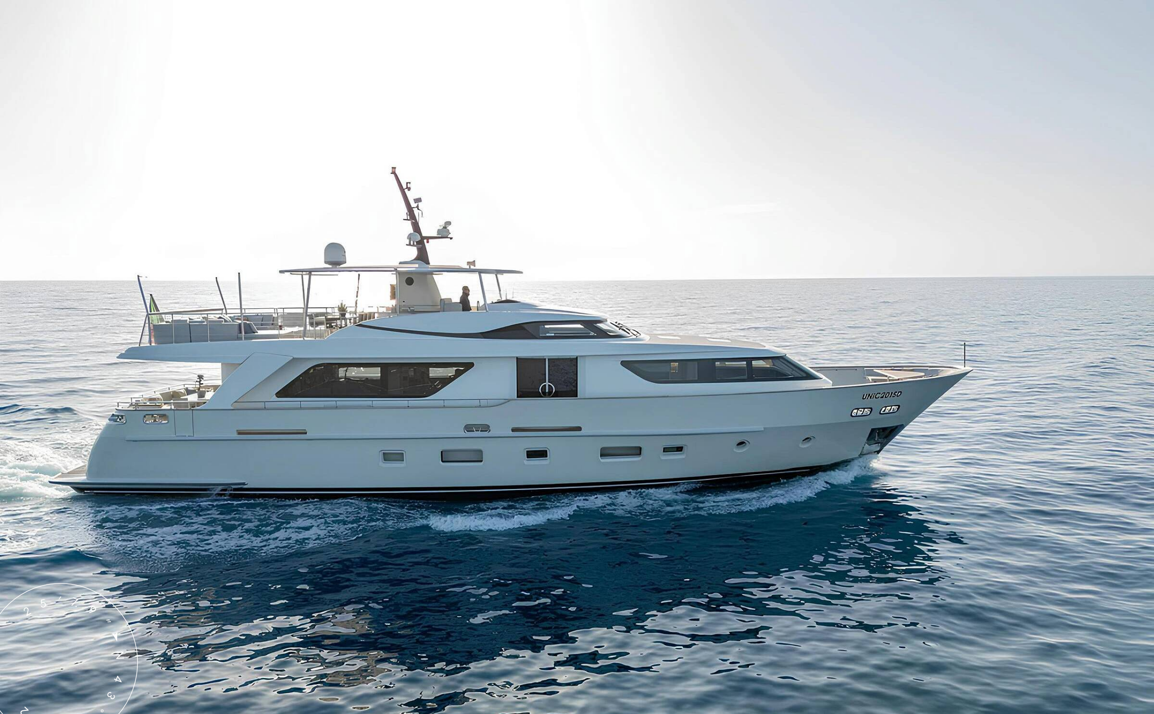
EXTERIOR SANLORENZO SD92 2015 MY UNICKA