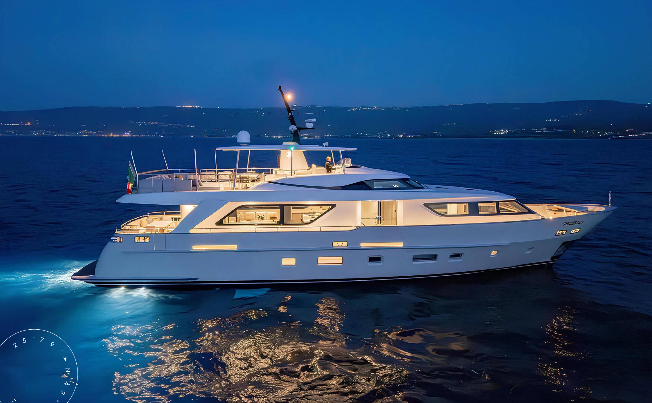
EXTERIOR SANLORENZO SD92 2015 MY UNICKA