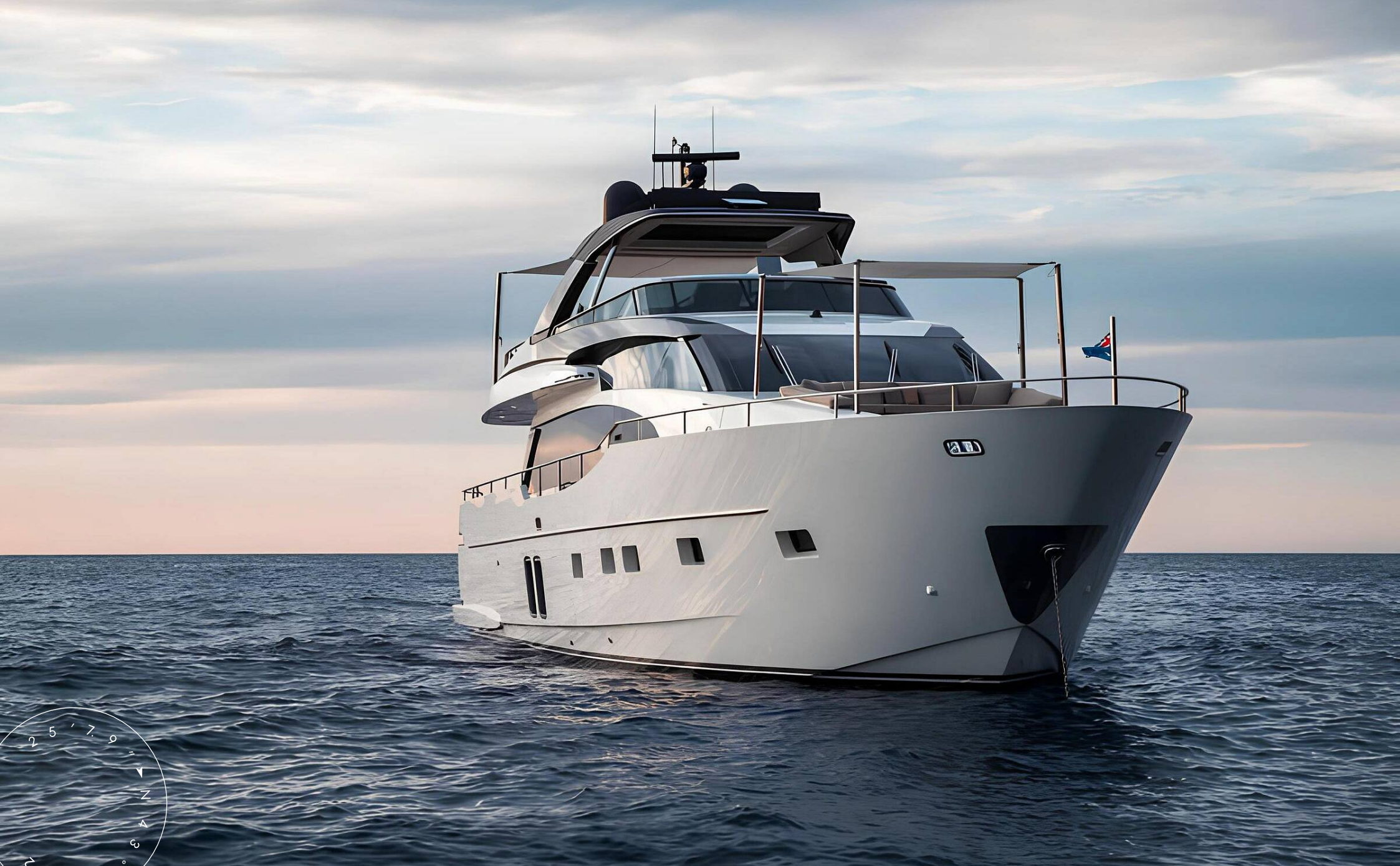
EXTERIOR SANLORENZO SL78 2018 MY MOONSHOT