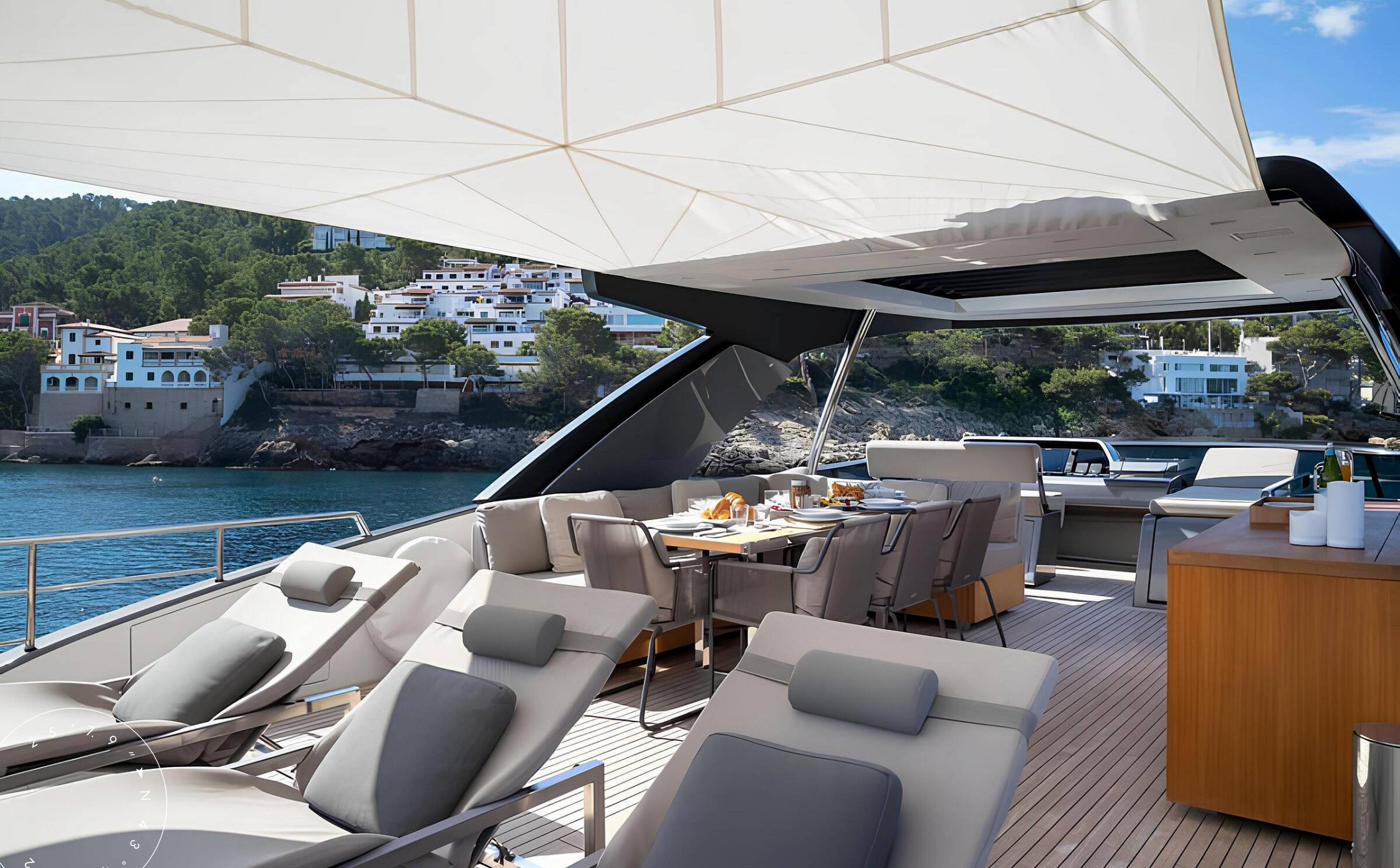
FLYBRIDGE AFT SUNBATHING AREA