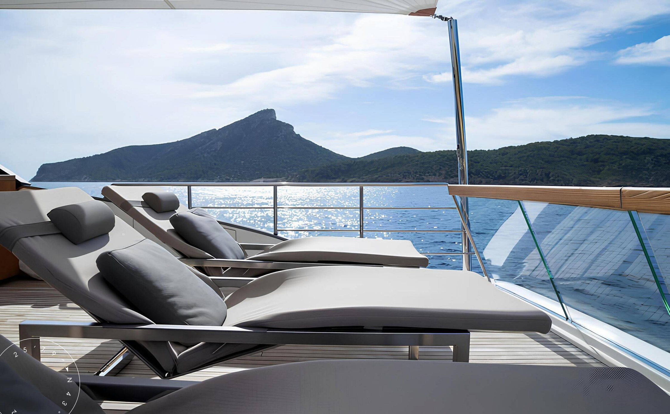
FLYBRIDGE AFT SUNBATHING AREA