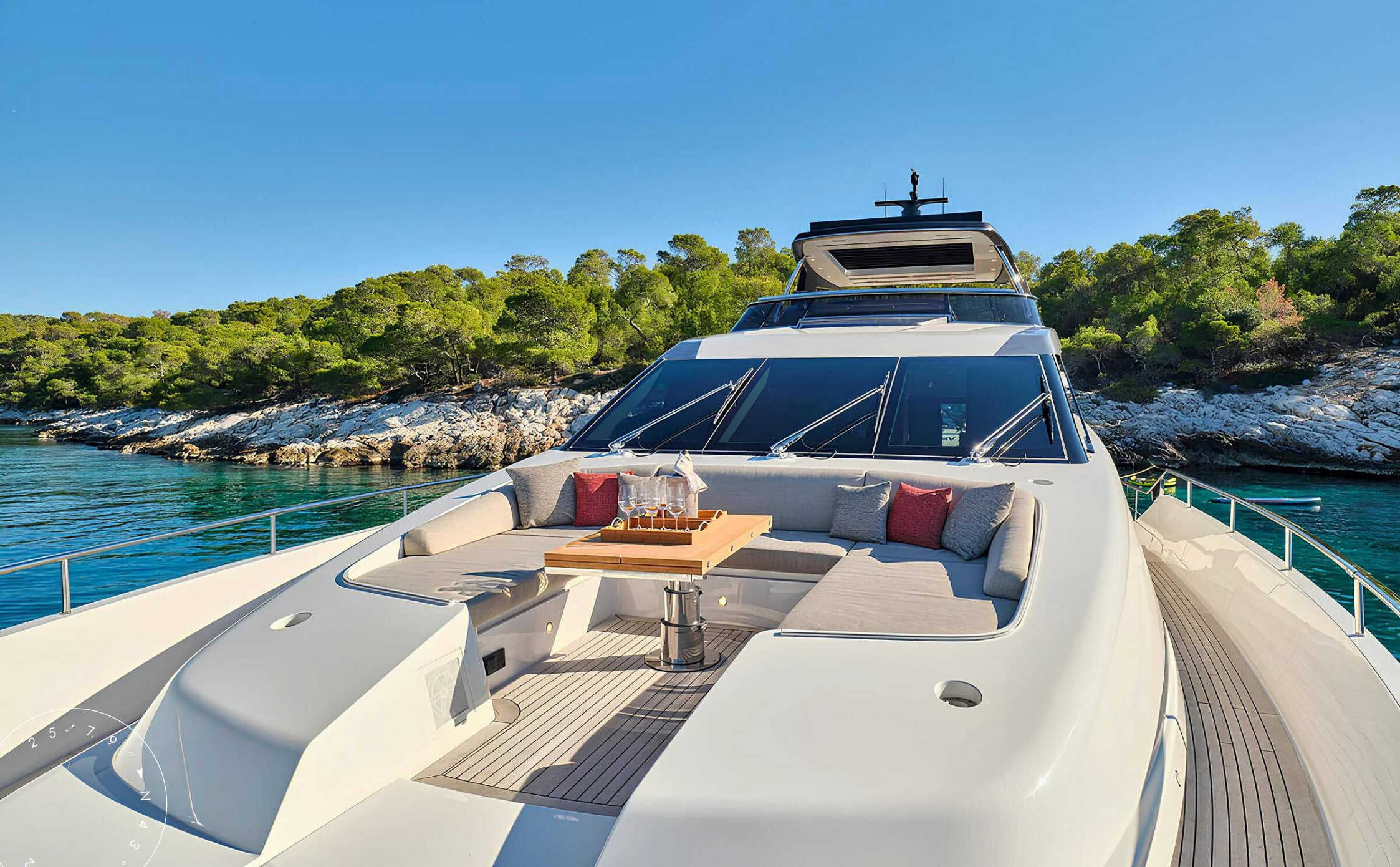
BOW LOUNGE AREA