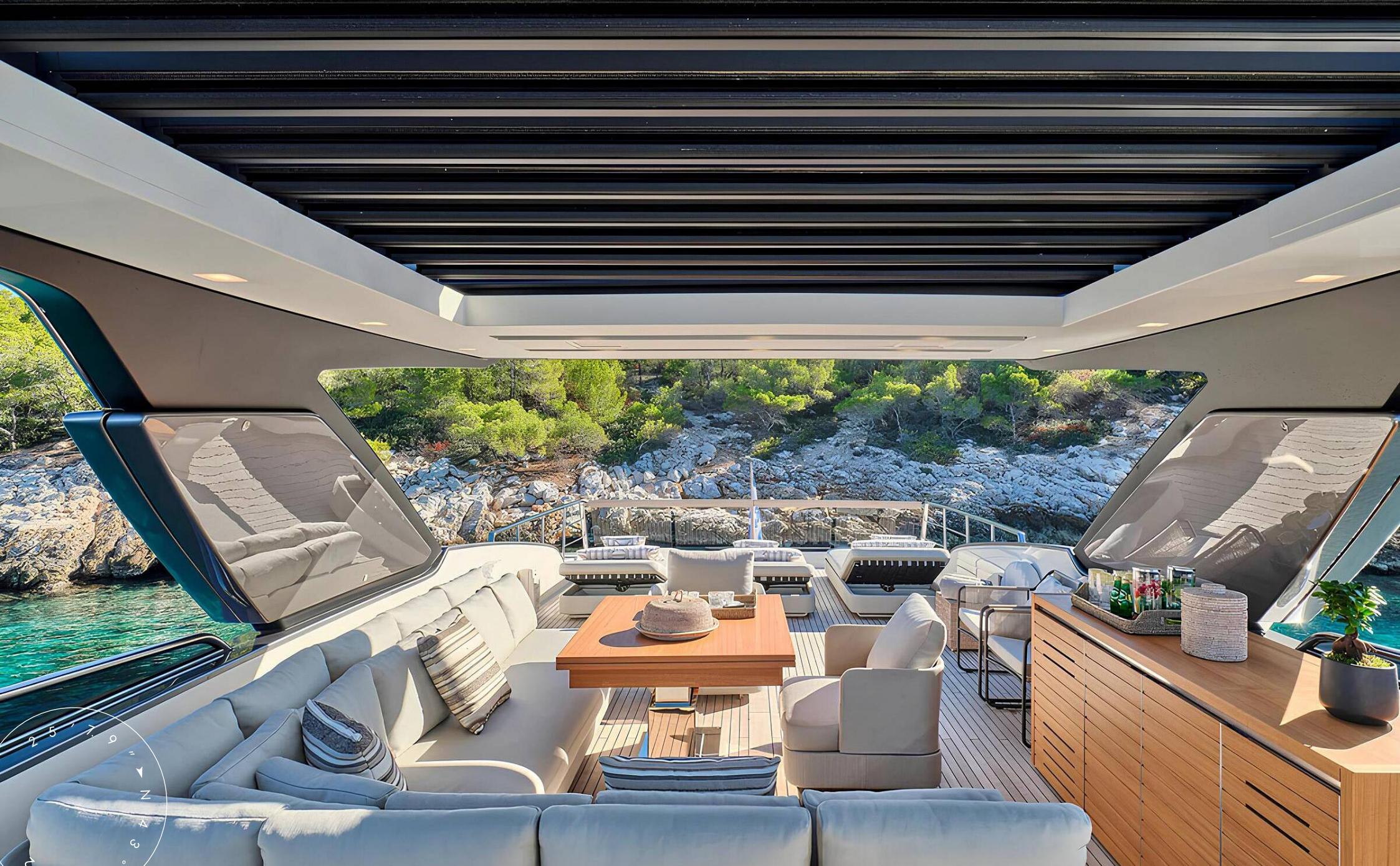
FLYBRIDGE LOUNGE AREA