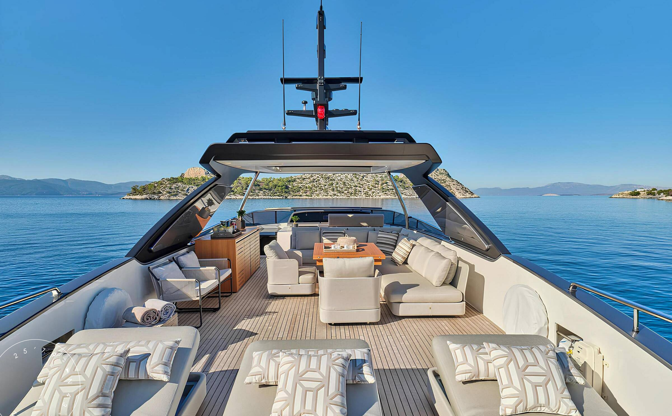
FLYBRIDGE AFT SUNBATHING AREA