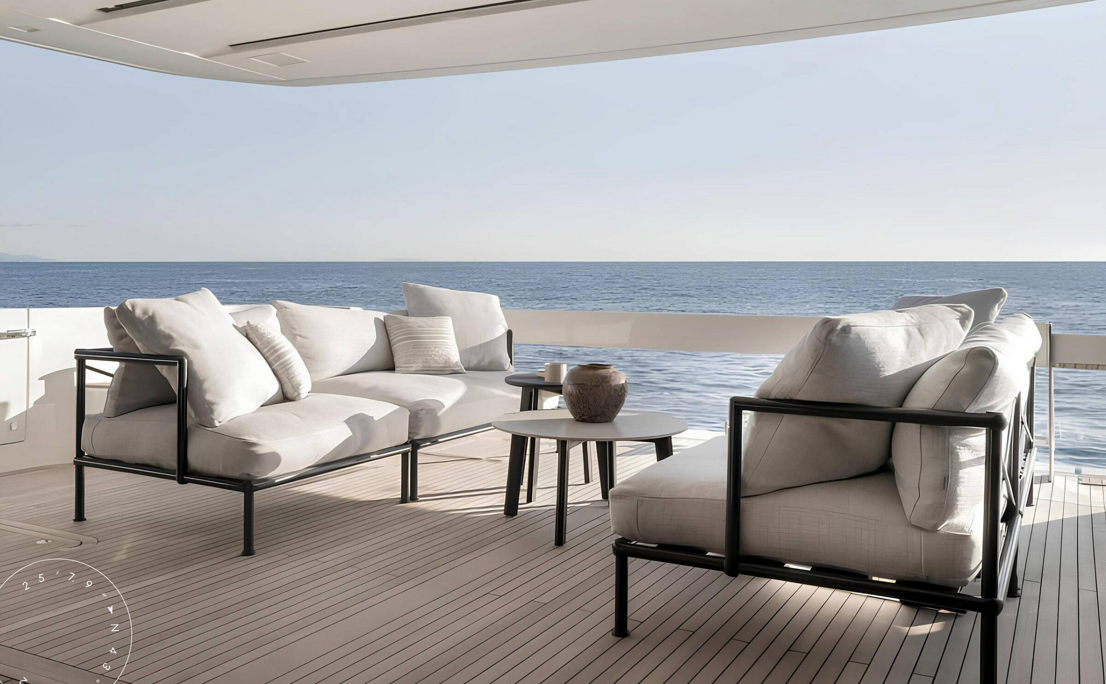
COCKPIT SEATING AREA