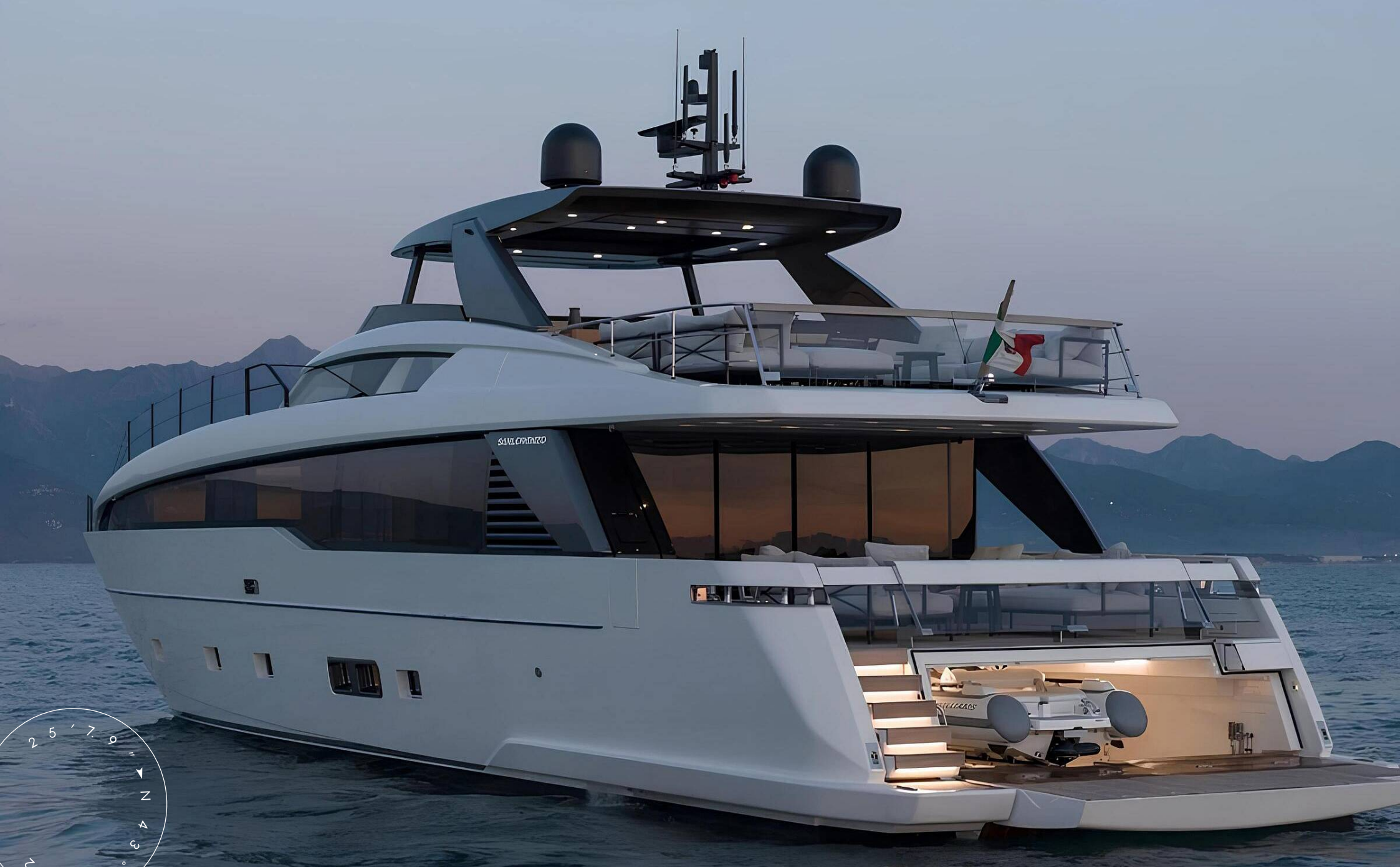
EXTERIOR SANLORENZO SL86A 2025 MY ALMA BLU