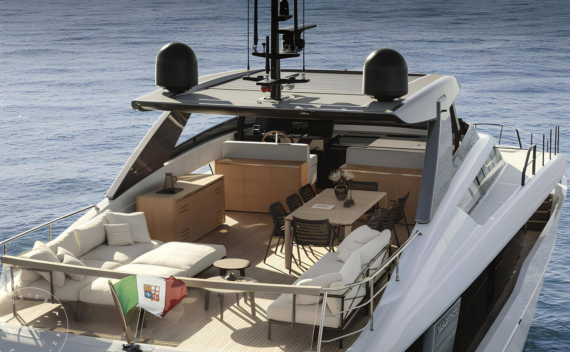
FLYBRIDGE LOUNGE AREA