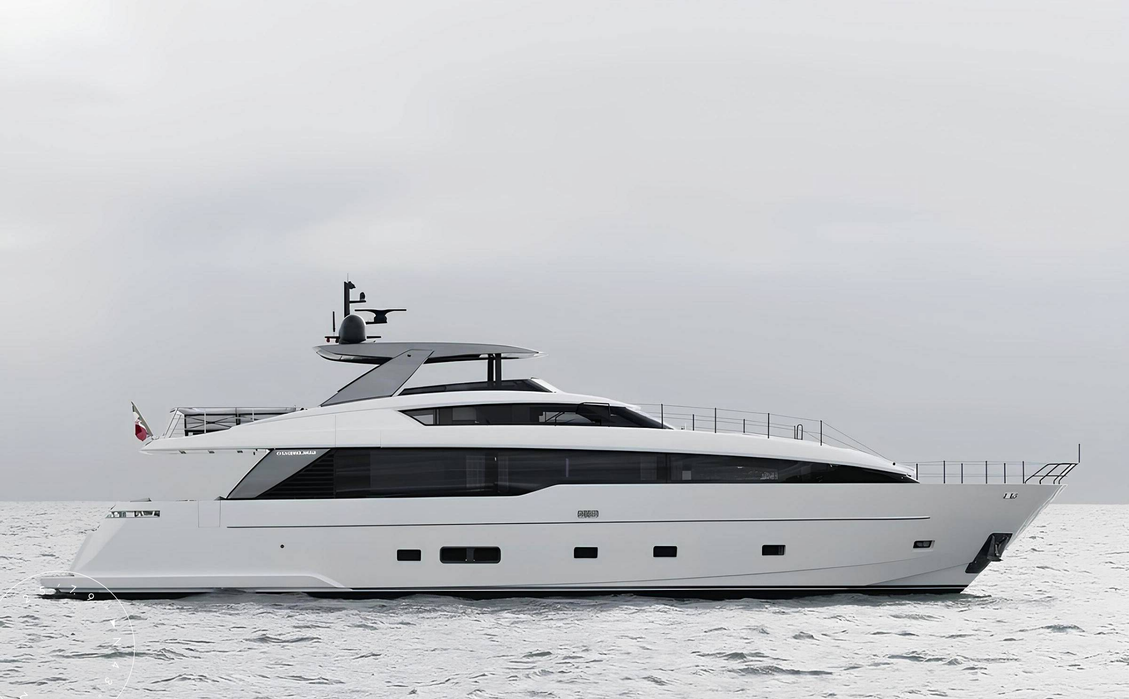
EXTERIOR SANLORENZO SL86A 2025 MY ALMA BLU