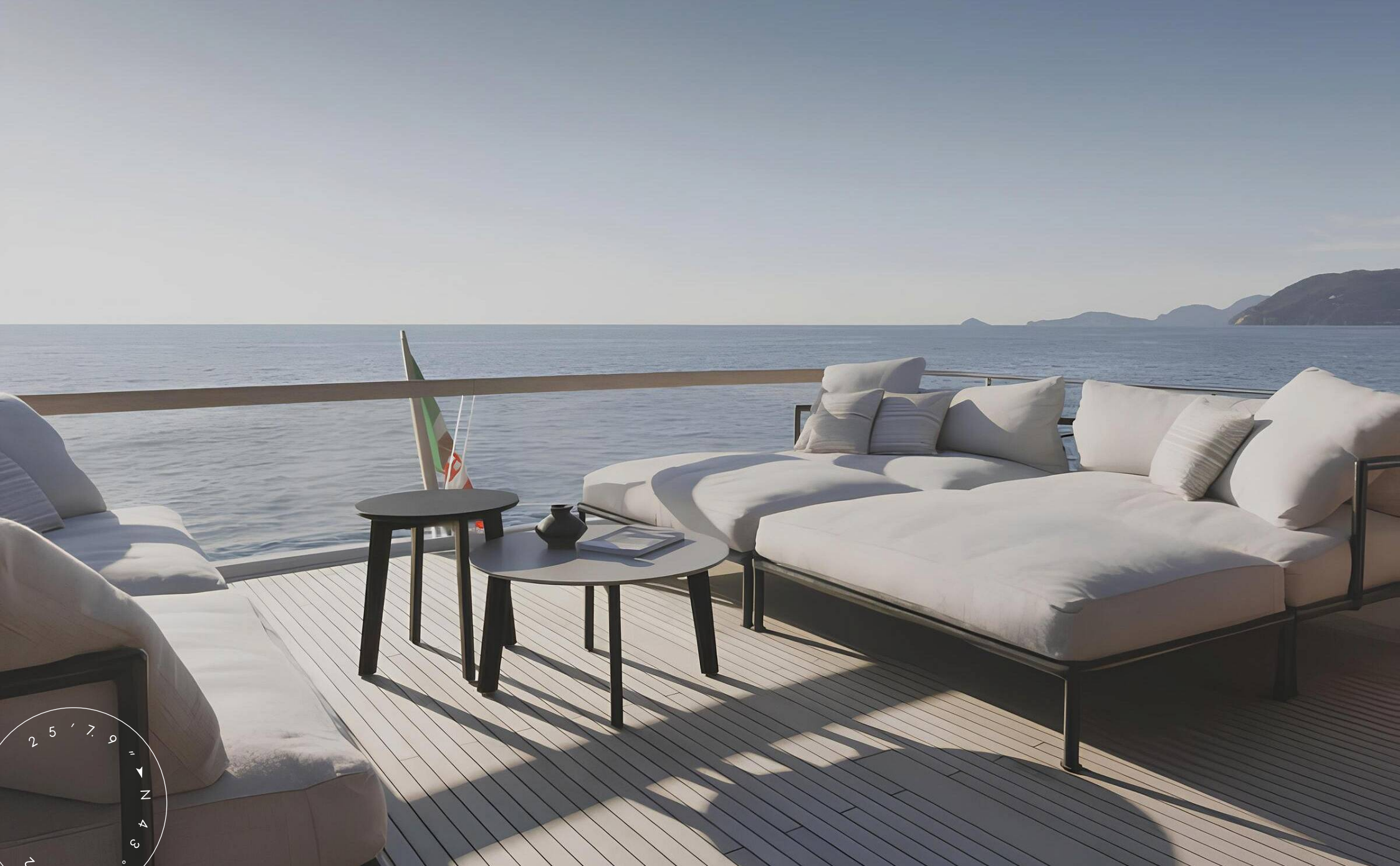
FLYBRIDGE LOUNGE AREA