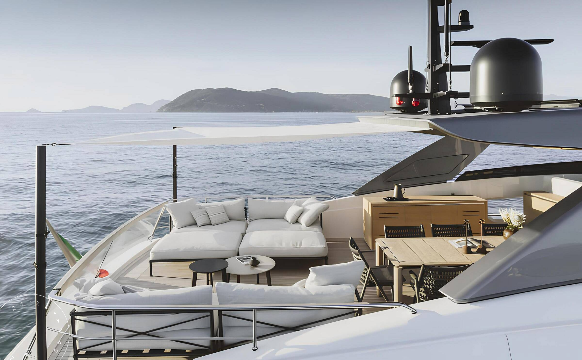
FLYBRIDGE LOUNGE AREA