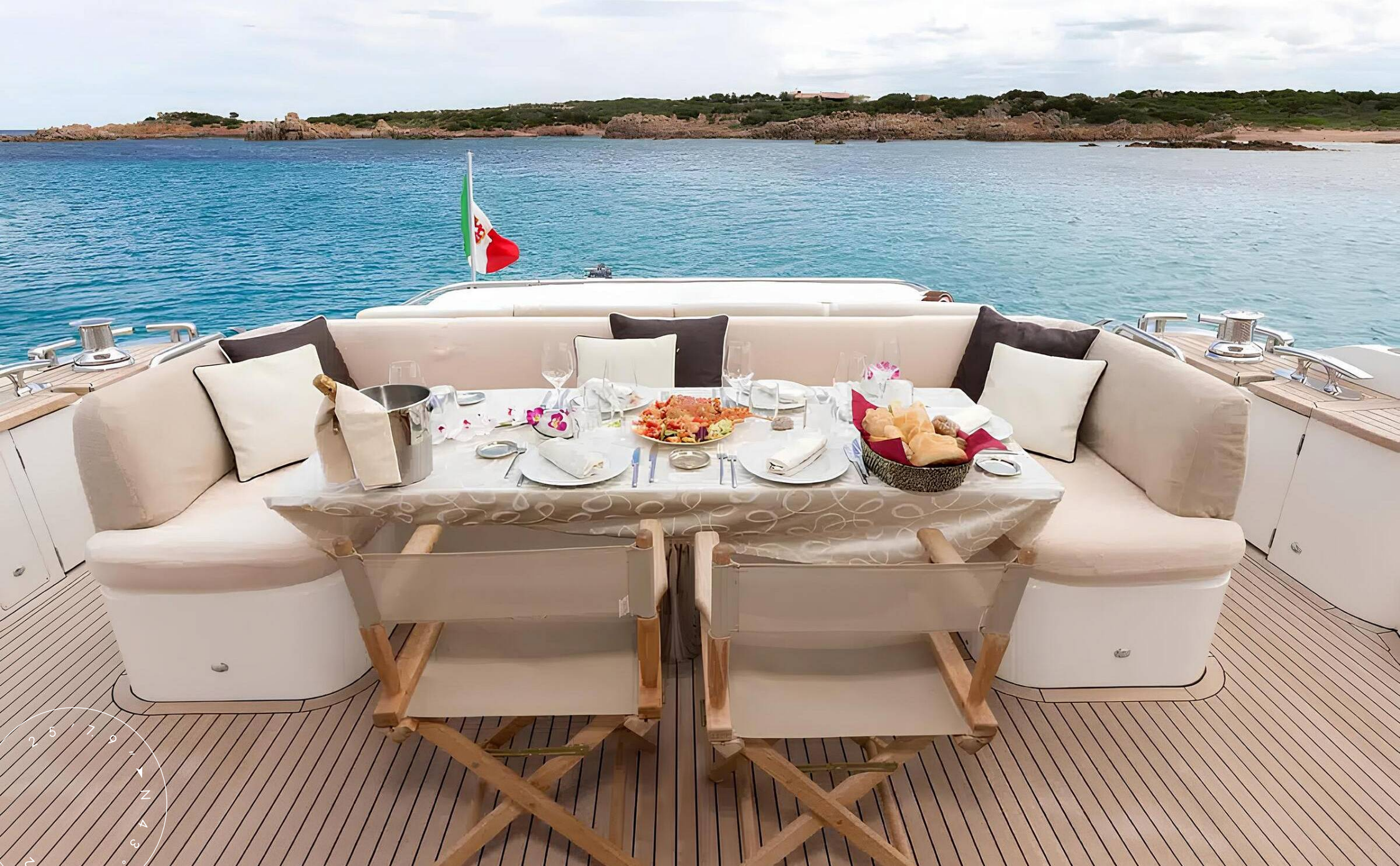
AFT MAIN DECK DINING AREA