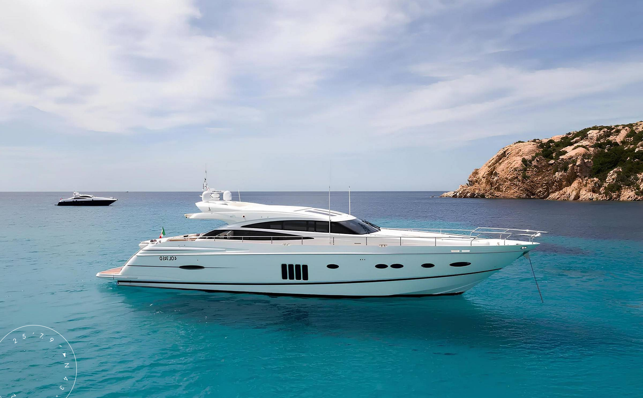
EXTERIOR PRINCESS V78 2011 MY ARAMIS