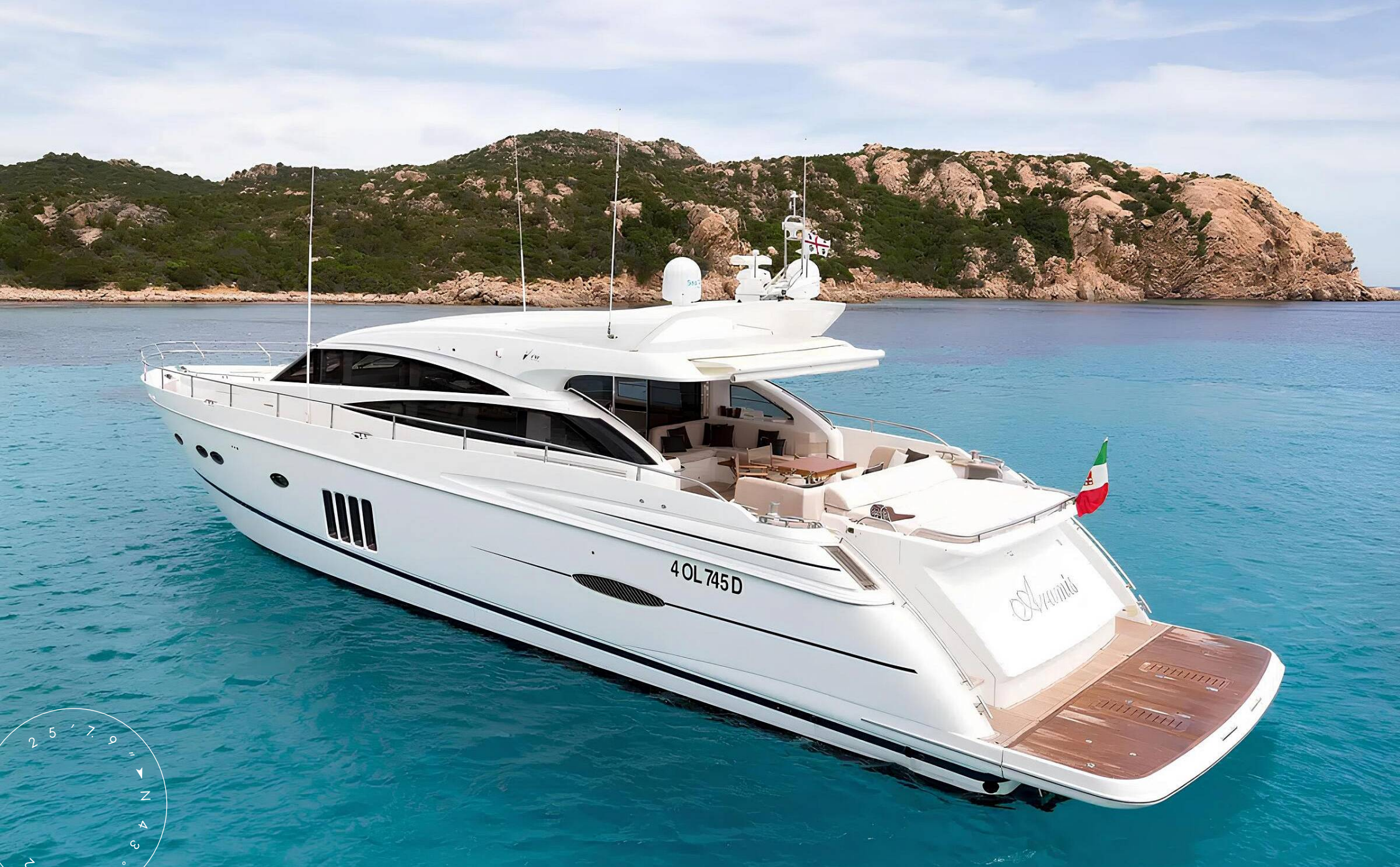
EXTERIOR PRINCESS V78 2011 MY ARAMIS