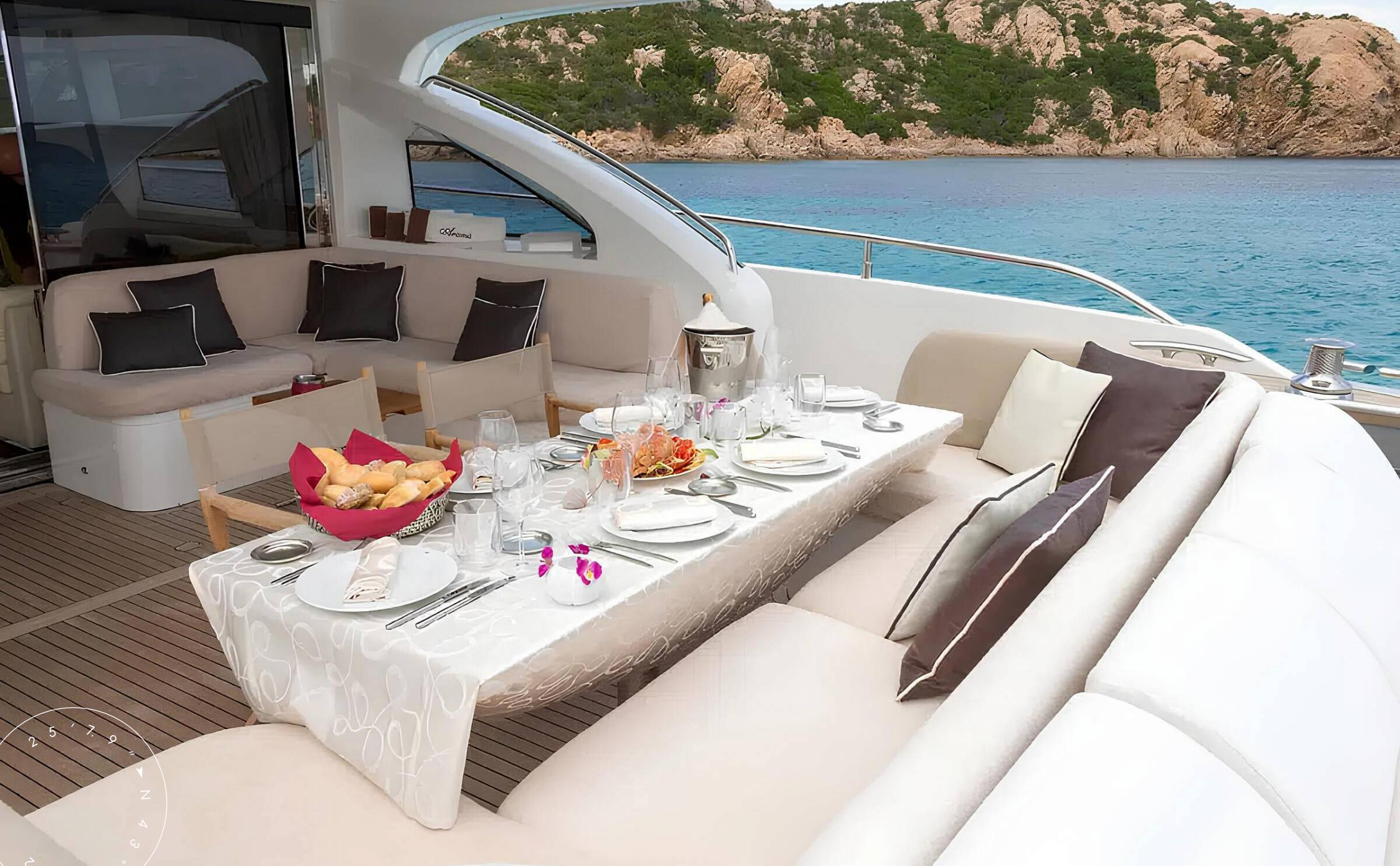
AFT MAIN DECK DINING AREA