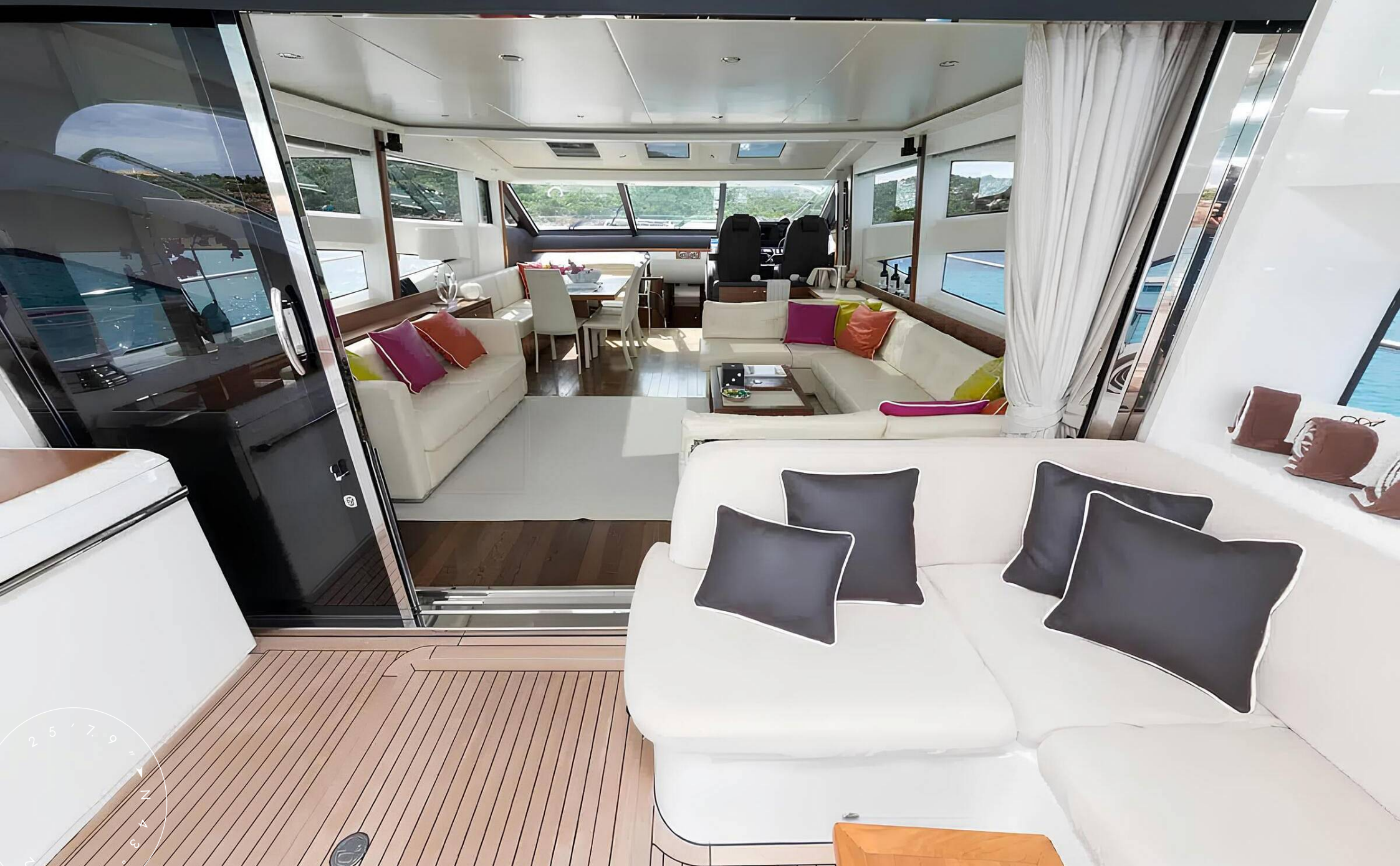
AFT MAIN DECK LOUNGE AREA