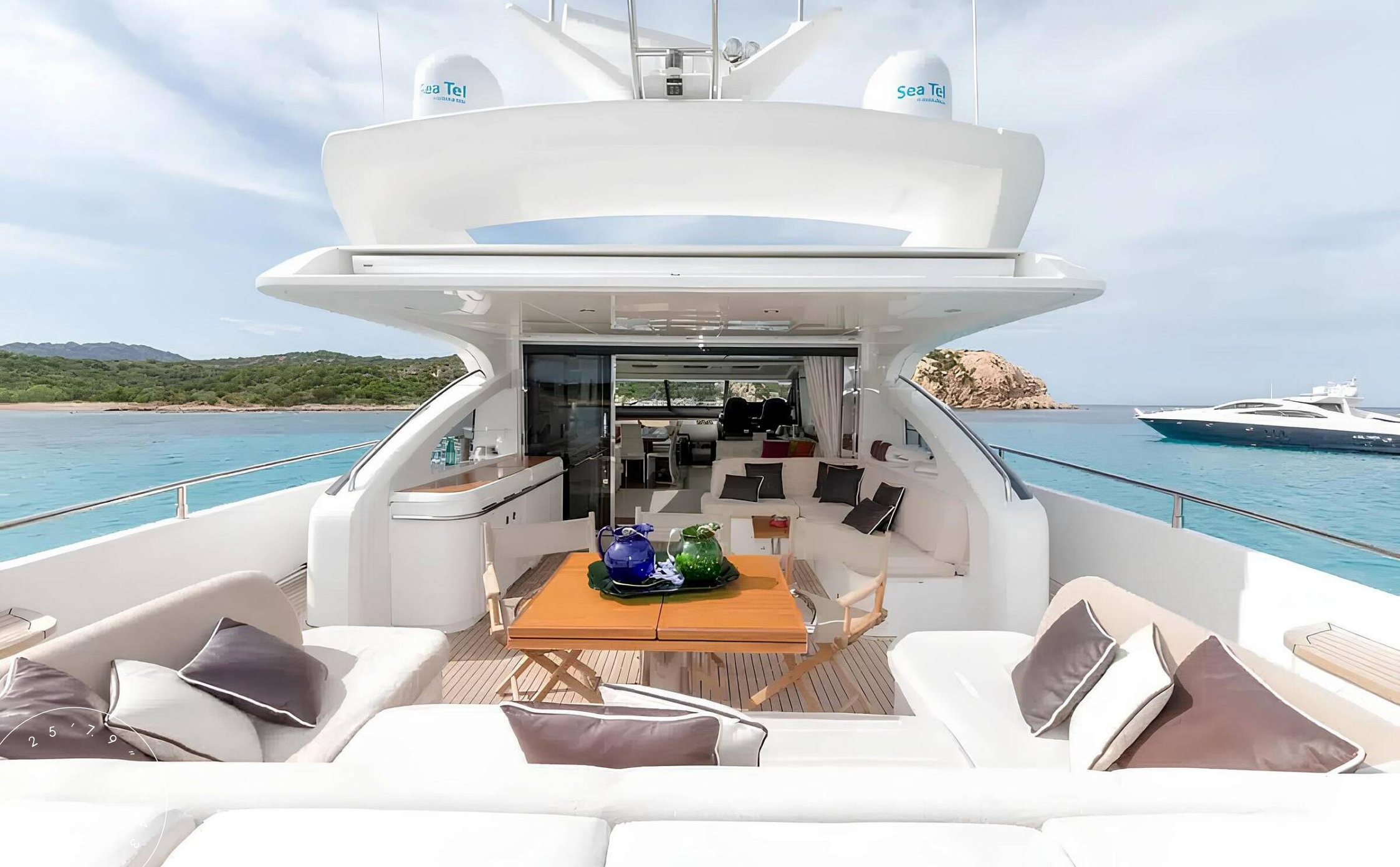
AFT MAIN DECK LOUNGE AREA