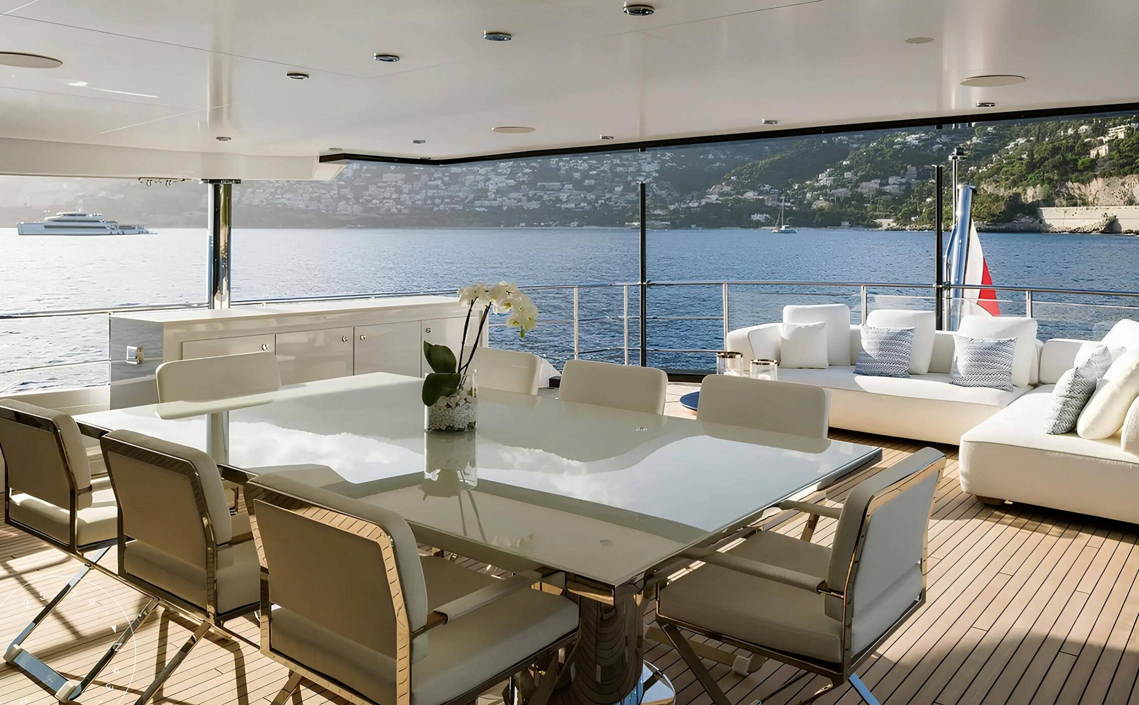
AFT UPPER DECK DINING AREA