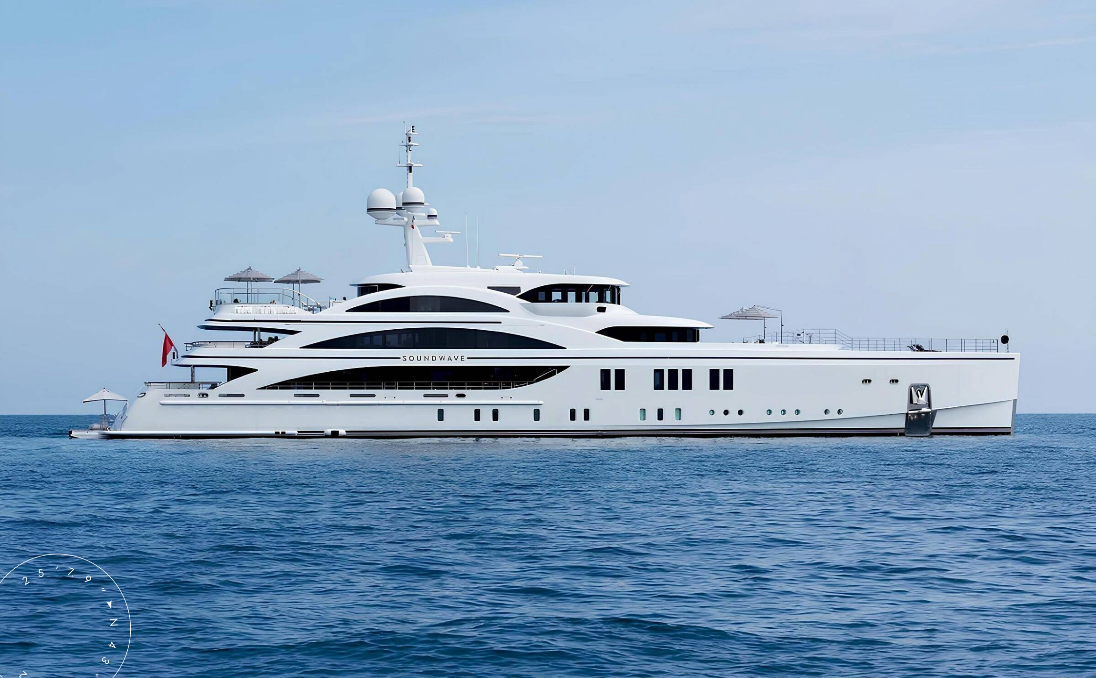
EXTERIOR BENETTI 63M 2015 MY SOUNDWAVE