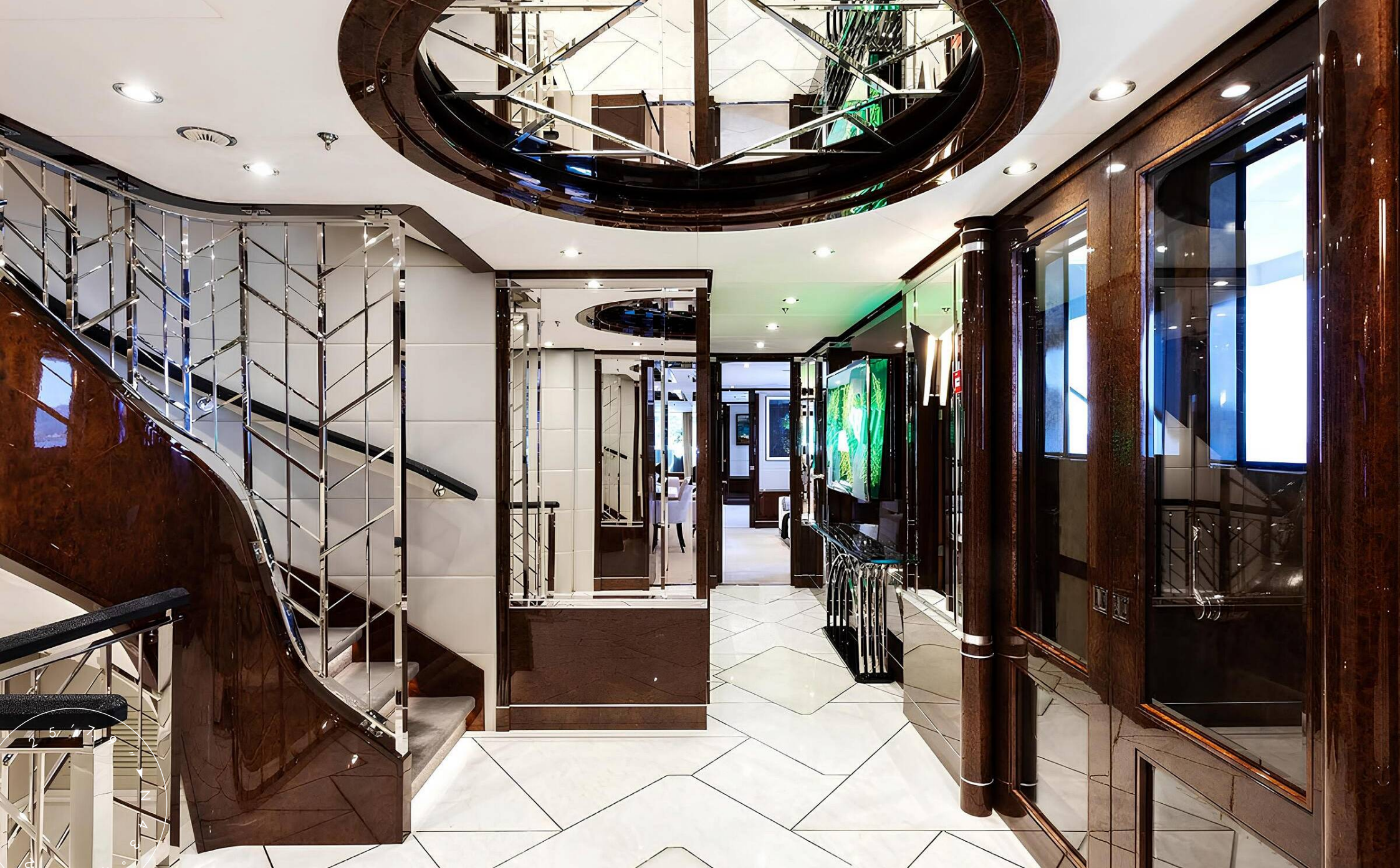
MAIN SALON LOBBY