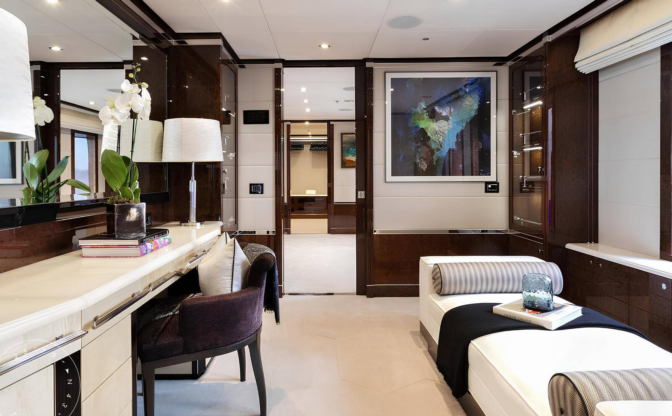
OFFICE IN THE MASTER CABIN