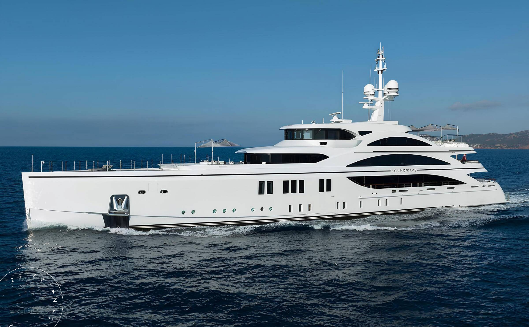
EXTERIOR BENETTI 63M 2015 MY SOUNDWAVE