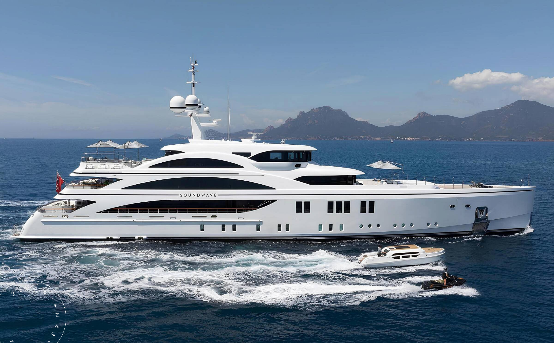
EXTERIOR BENETTI 63M 2015 MY SOUNDWAVE