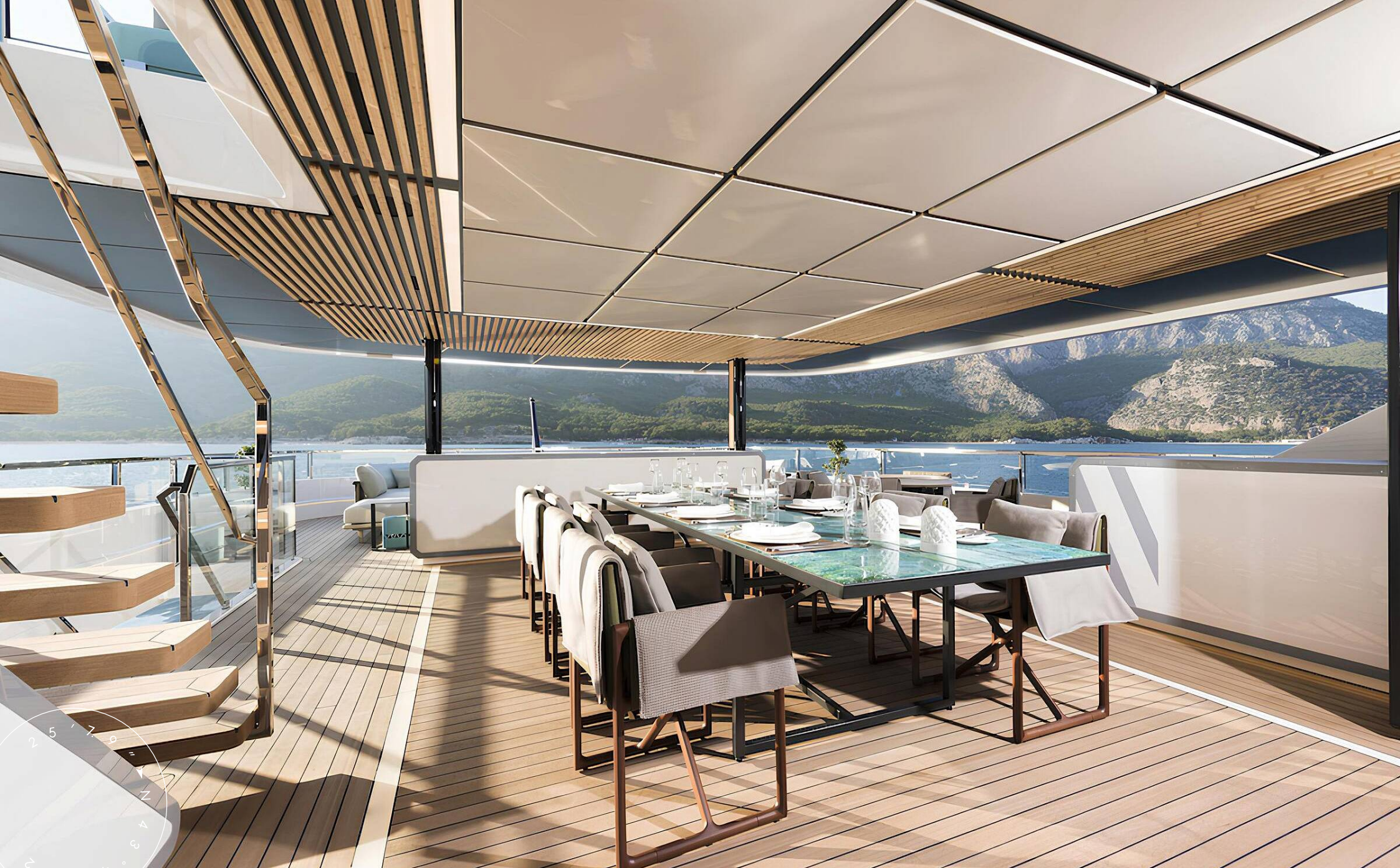
AFT UPPER DECK DINING AREA