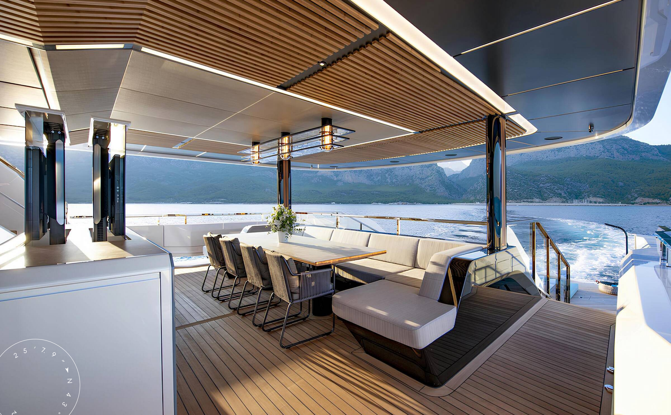
AFT MAIN DECK DINING AREA