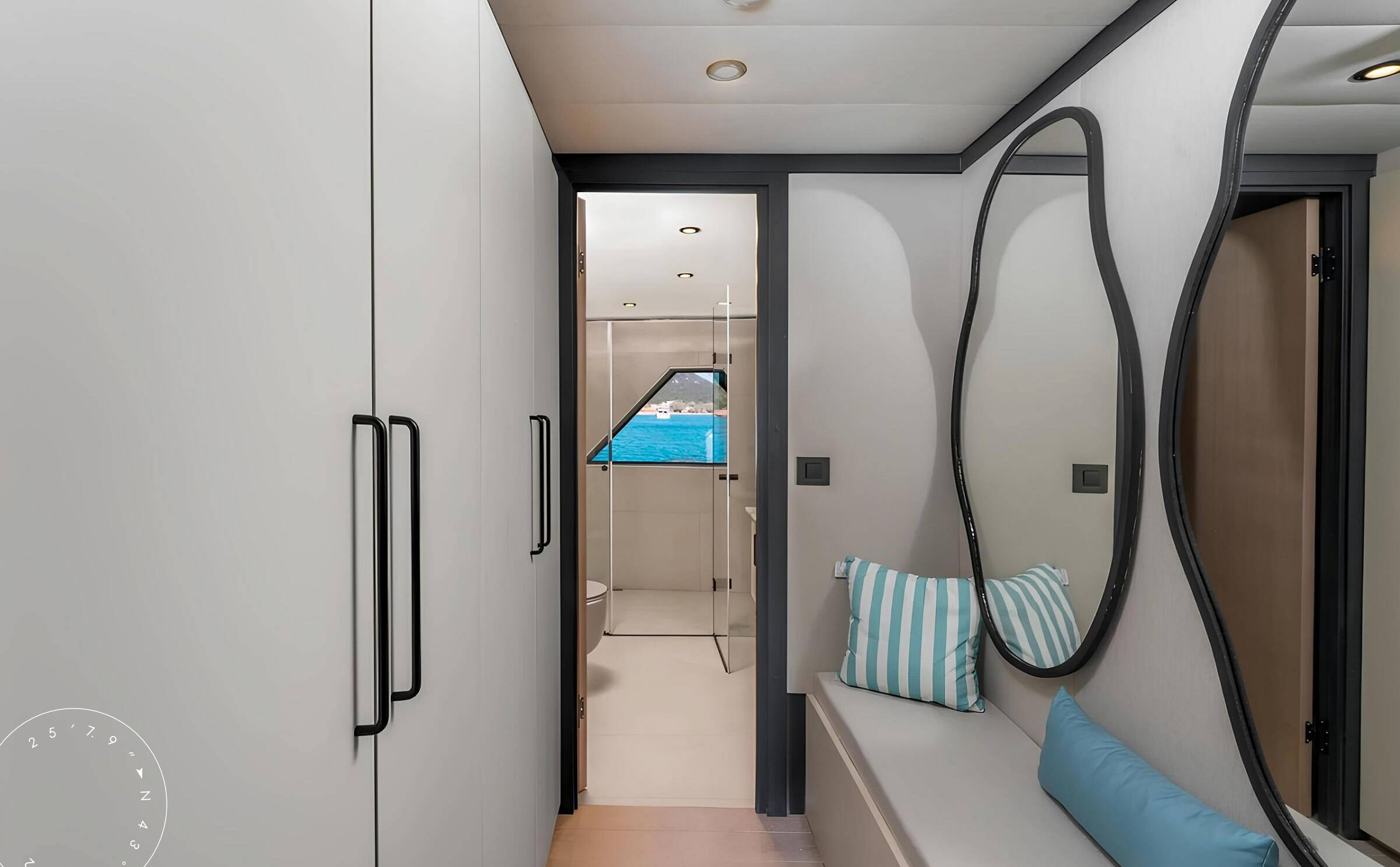
MASTER CABIN DRESSING ROOM