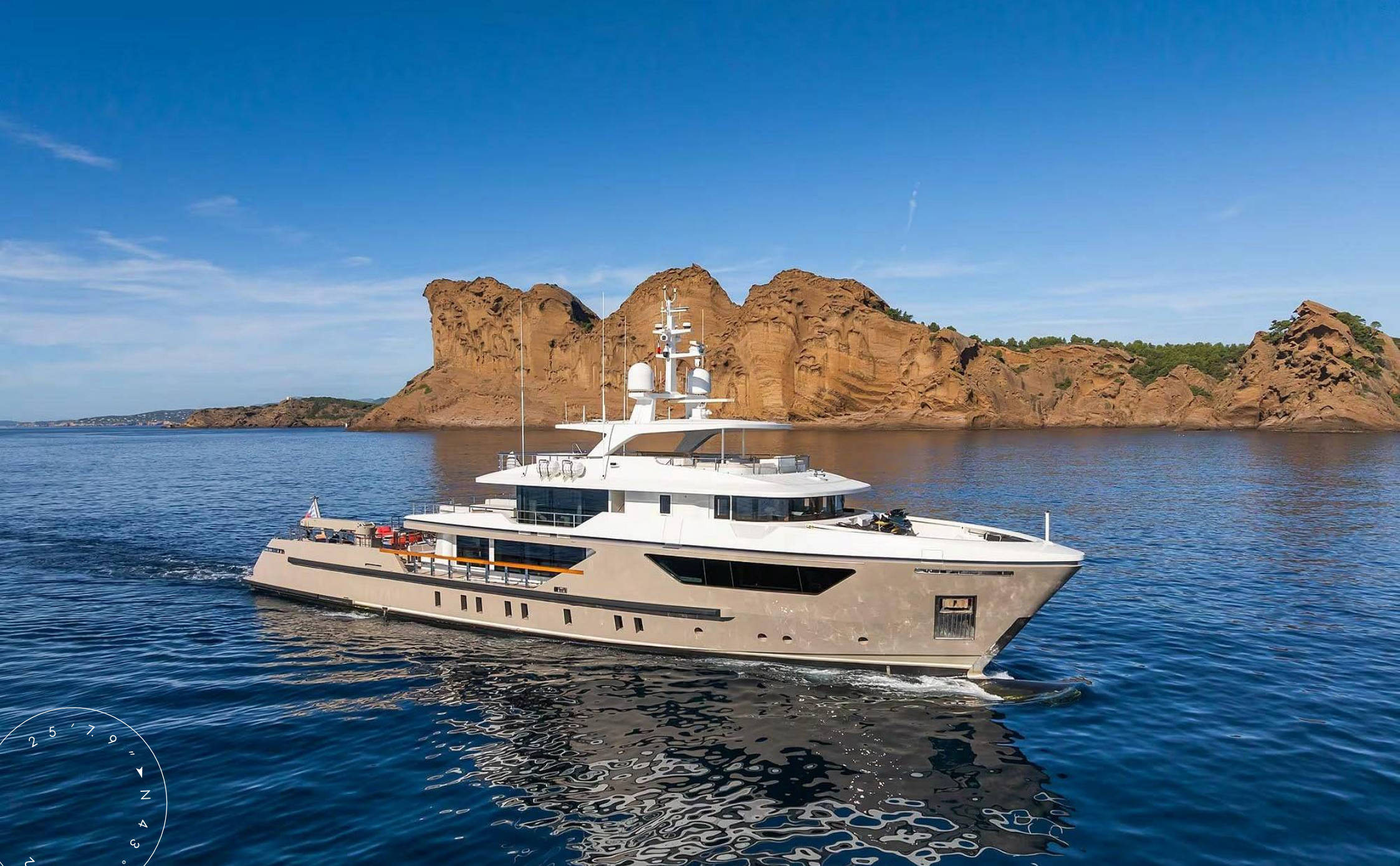
EXTERIOR SANLORENZO 500EXP 2020 MY AMIKA