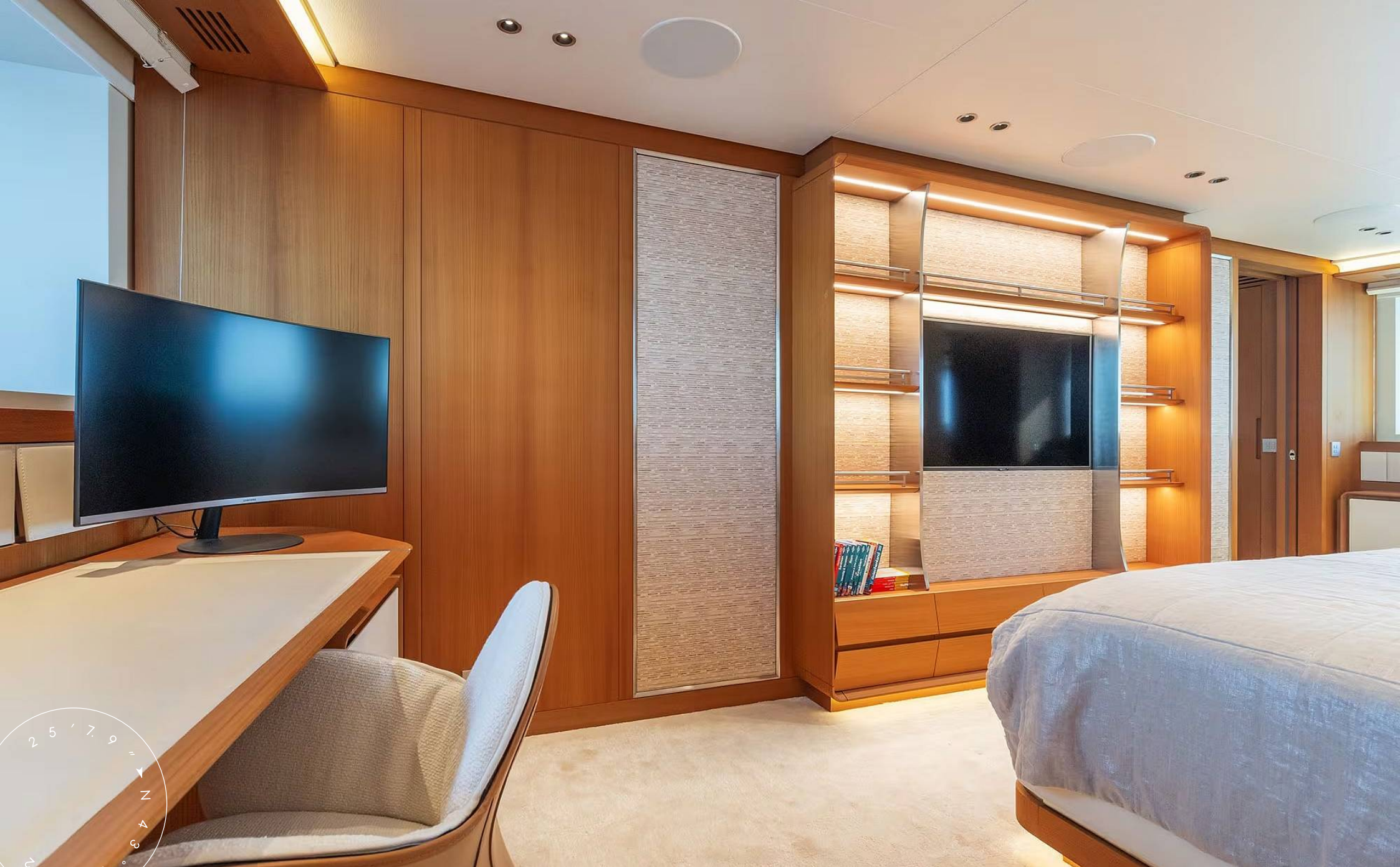
MAKE-UP TABLE IN MASTER CABIN