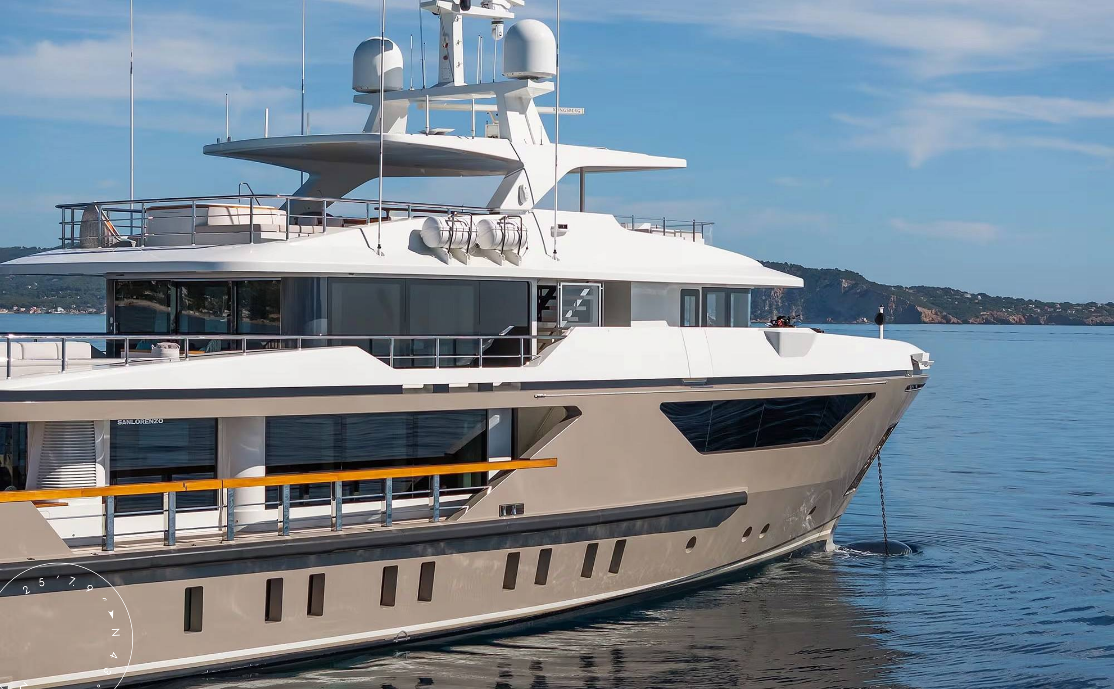
EXTERIOR SANLORENZO 500EXP 2020 MY AMIKA