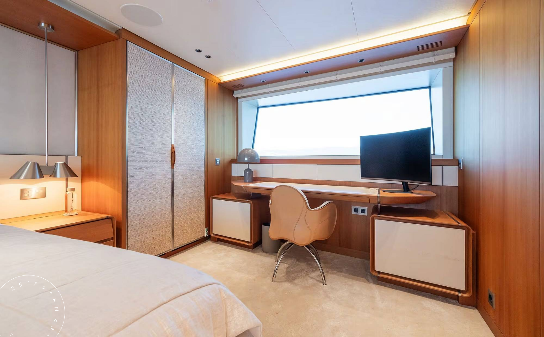
MAKE-UP TABLE IN MASTER CABIN