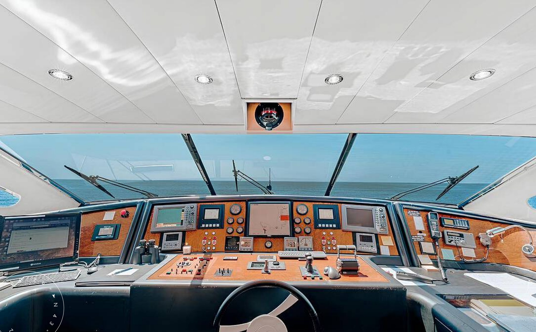
MAIN HELM STATION