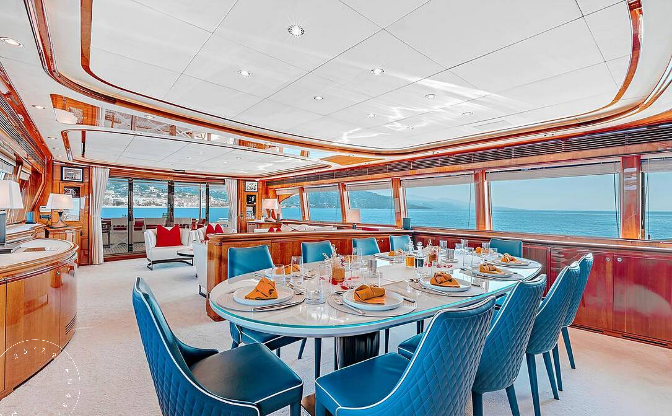
MAIN SALON DINING AREA