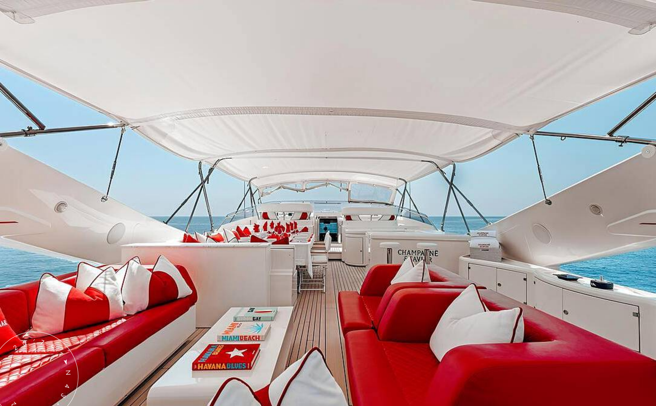
FLYBRIDGE LOUNGE AREA