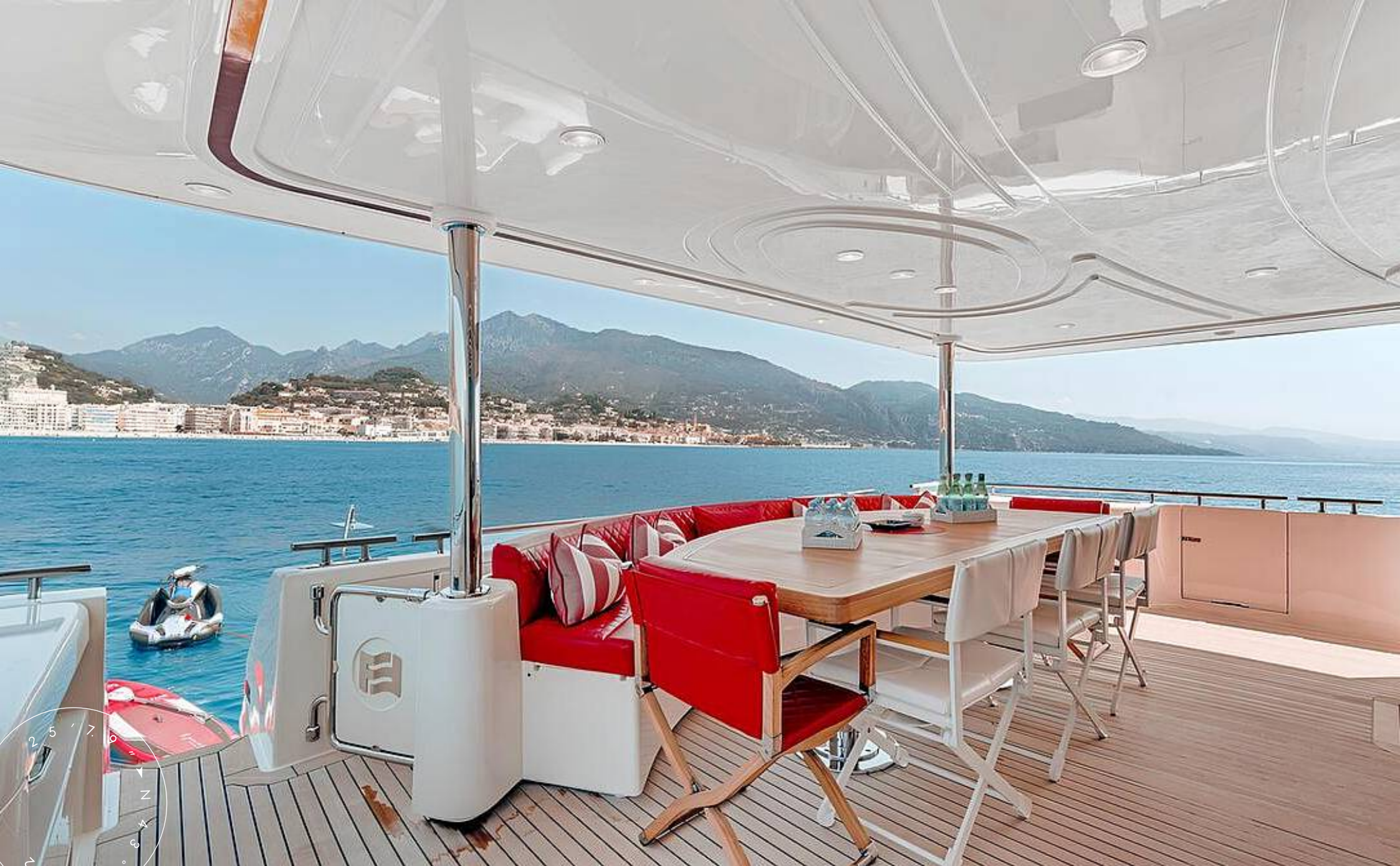
COCKPIT DINING AREA