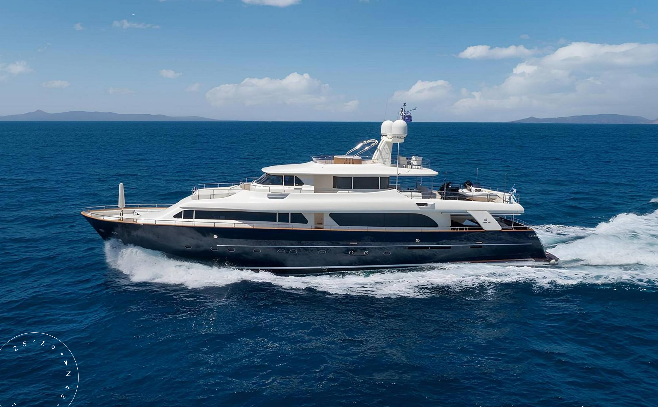
EXTERIOR CUSTOM LINE NAVETTA 30 2007 MY HAG