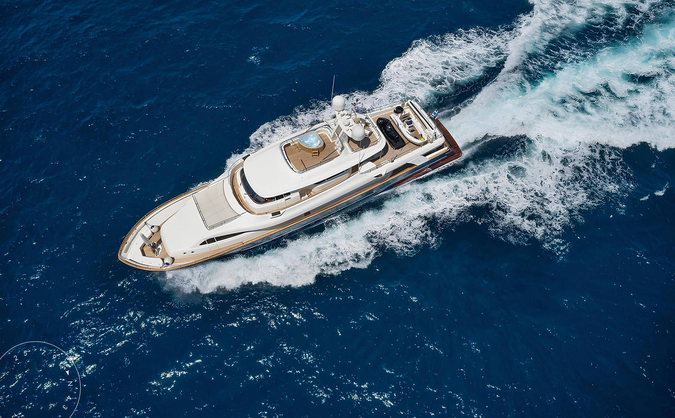
EXTERIOR CUSTOM LINE NAVETTA 30 2007 M/Y HAG