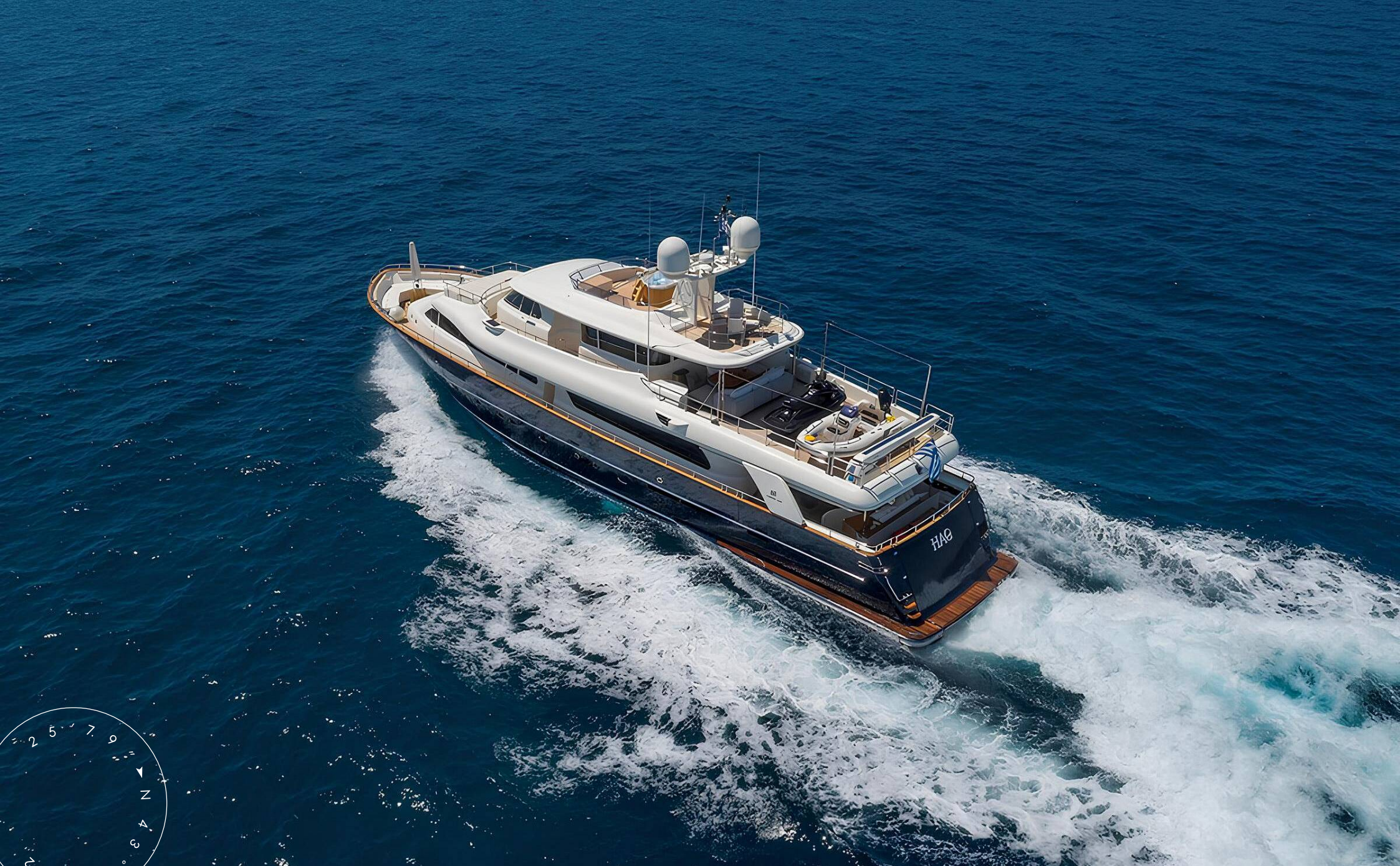
EXTERIOR CUSTOM LINE NAVETTA 30 2007 MY HAG