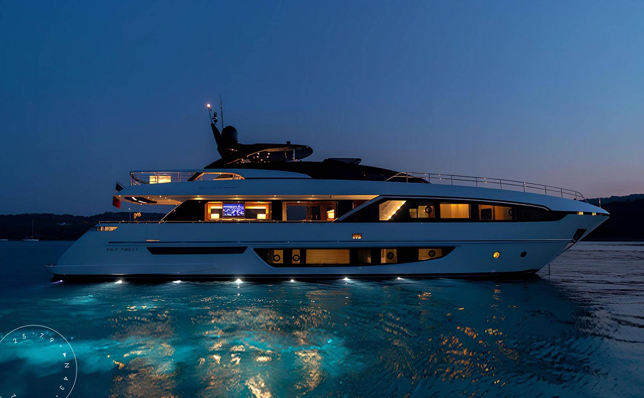
EXTERIOR RIVA 100 CORSARO 2018 MY RAPH SEVEN II