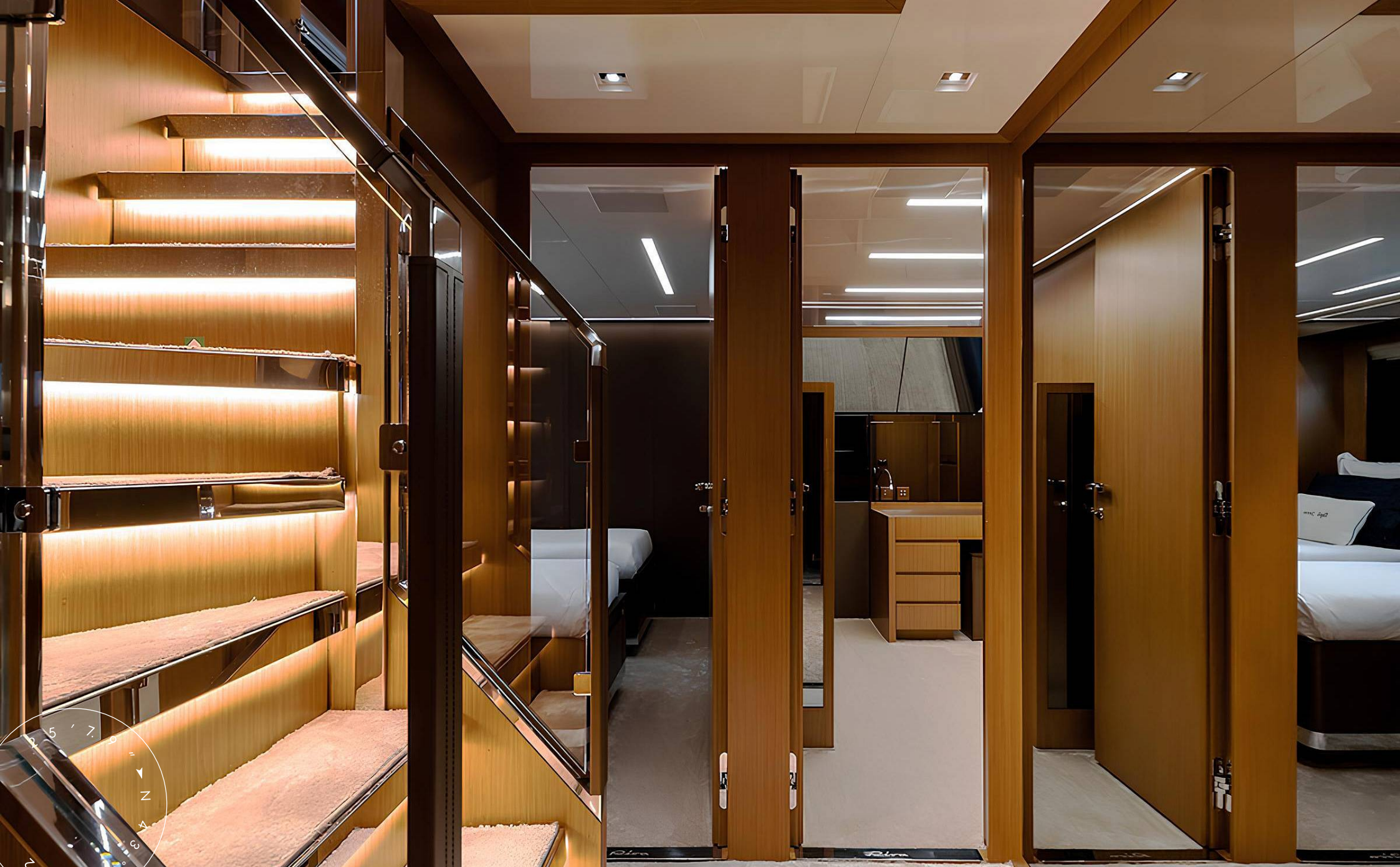
STAIRS FROM MD TO LD