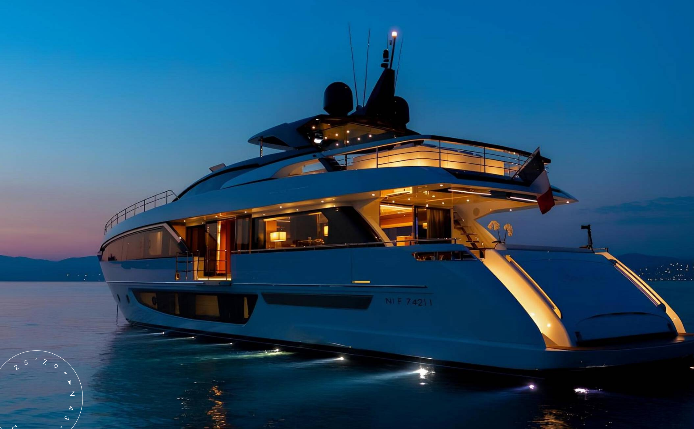
EXTERIOR RIVA 100 CORSARO 2018 MY RAPH SEVEN II