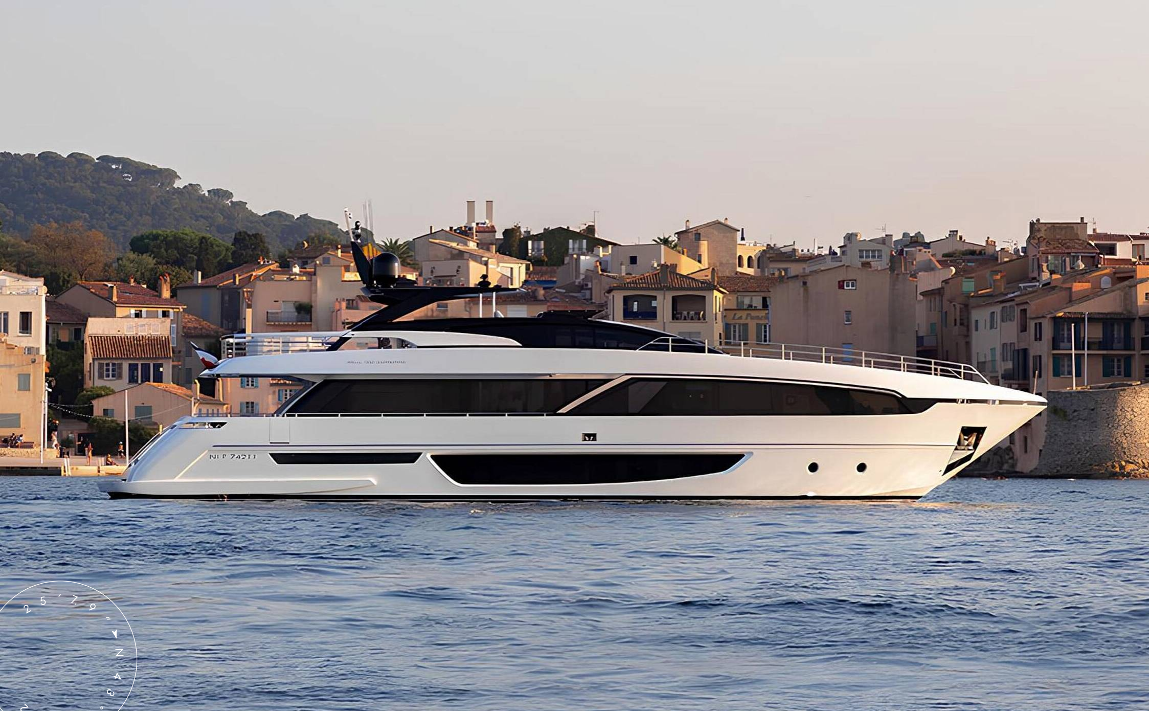
EXTERIOR RIVA 100 CORSARO 2018 MY RAPH SEVEN II