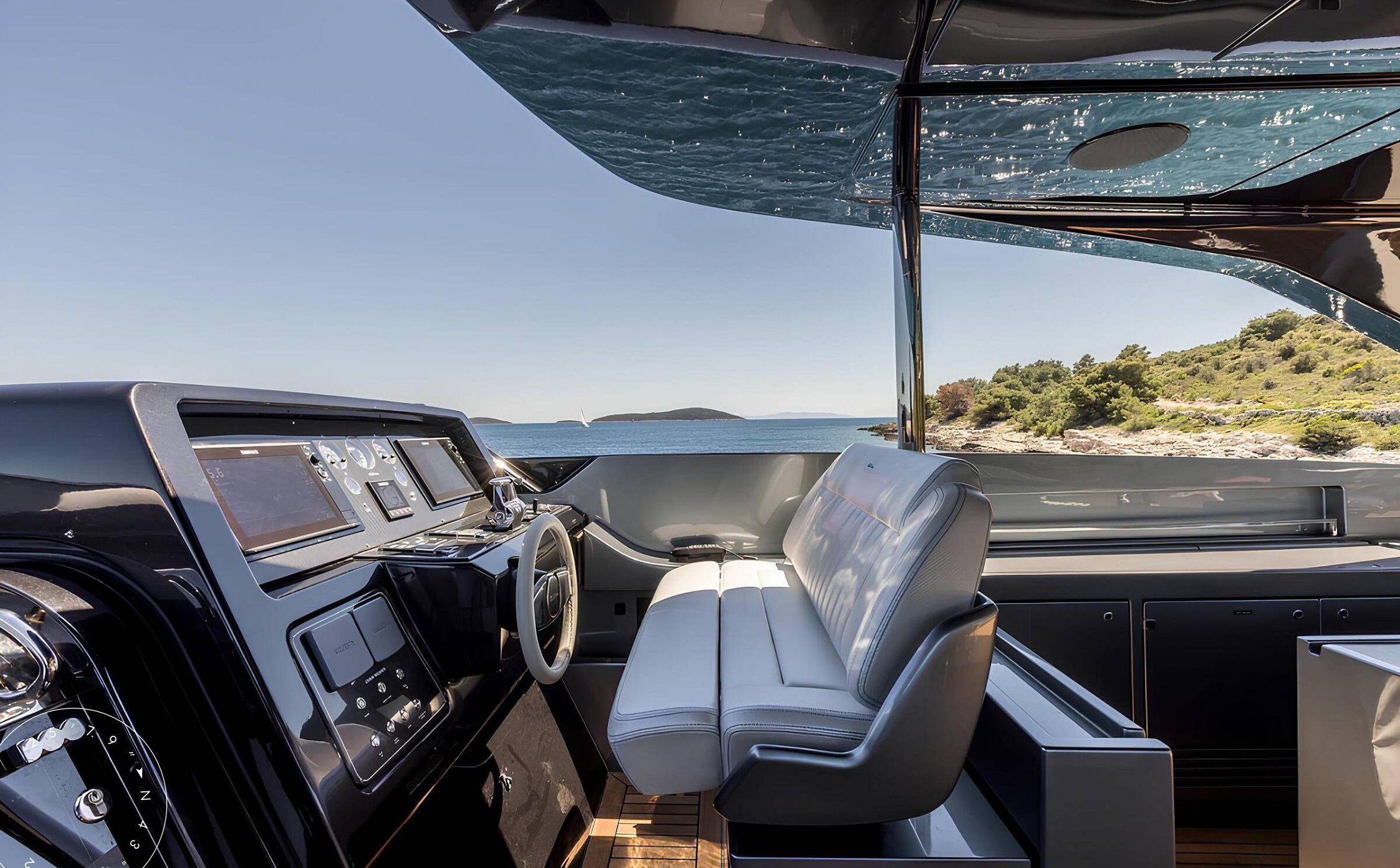
SECOND HELM STATION