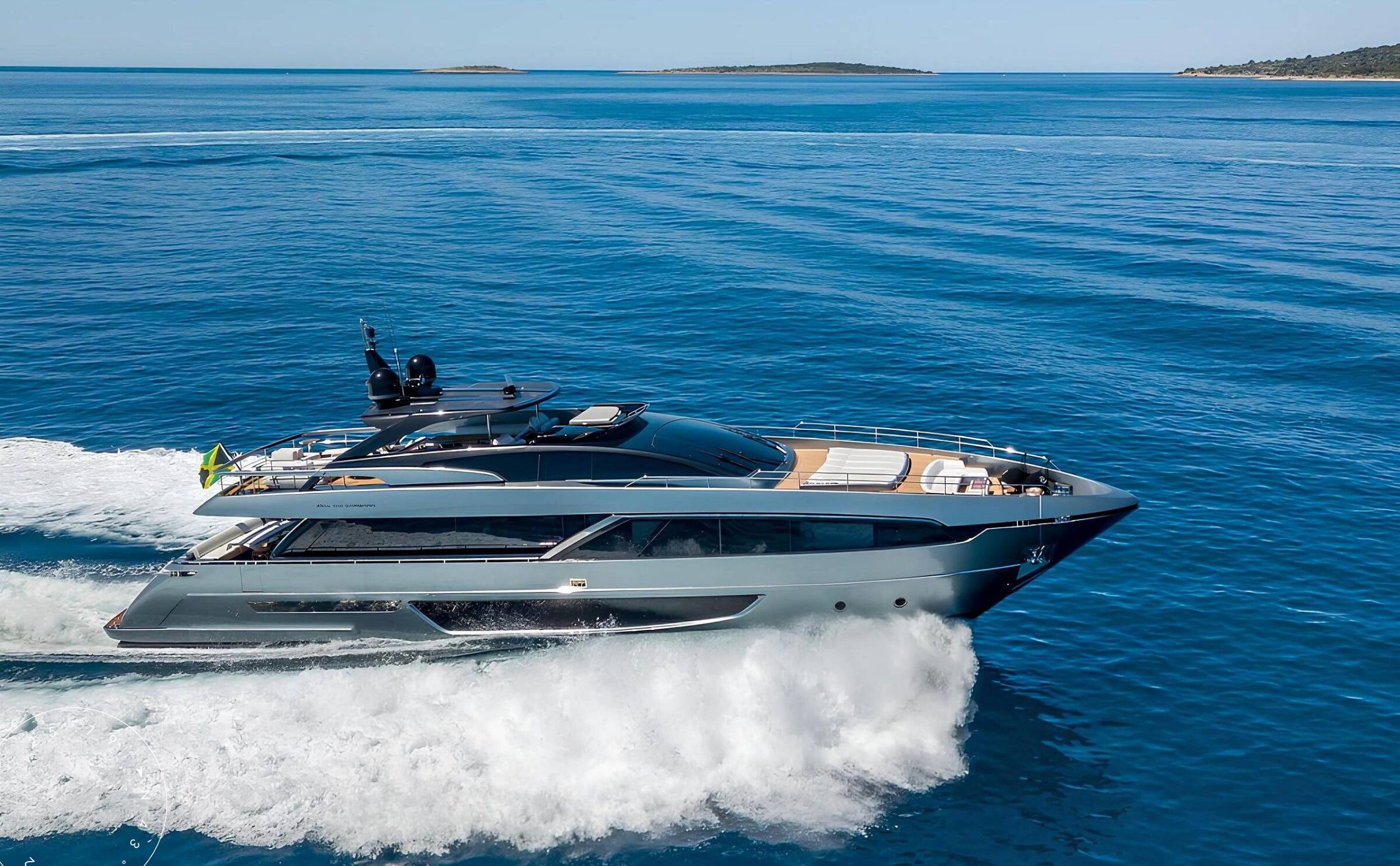
EXTERIOR RIVA 100 CORSARO 2017 MY YOYITA II