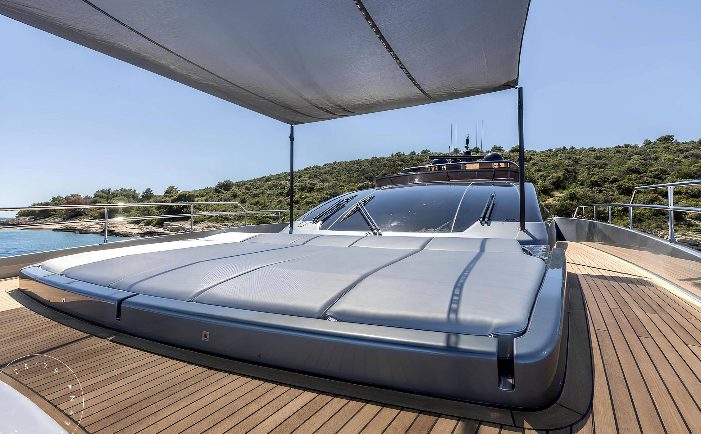
BOW SUNBATHING AREA