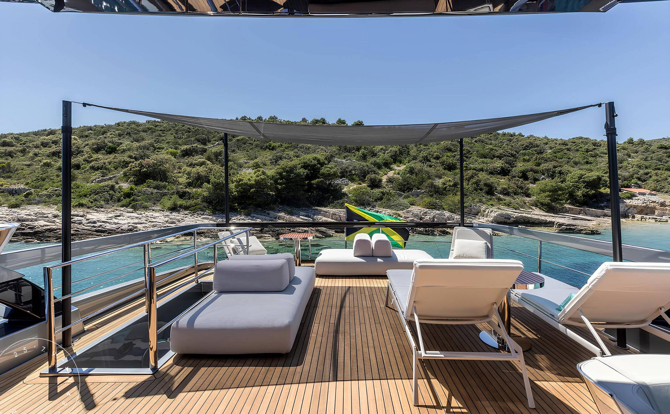
FLYBRIDGE AFT SUNBATHING AREA