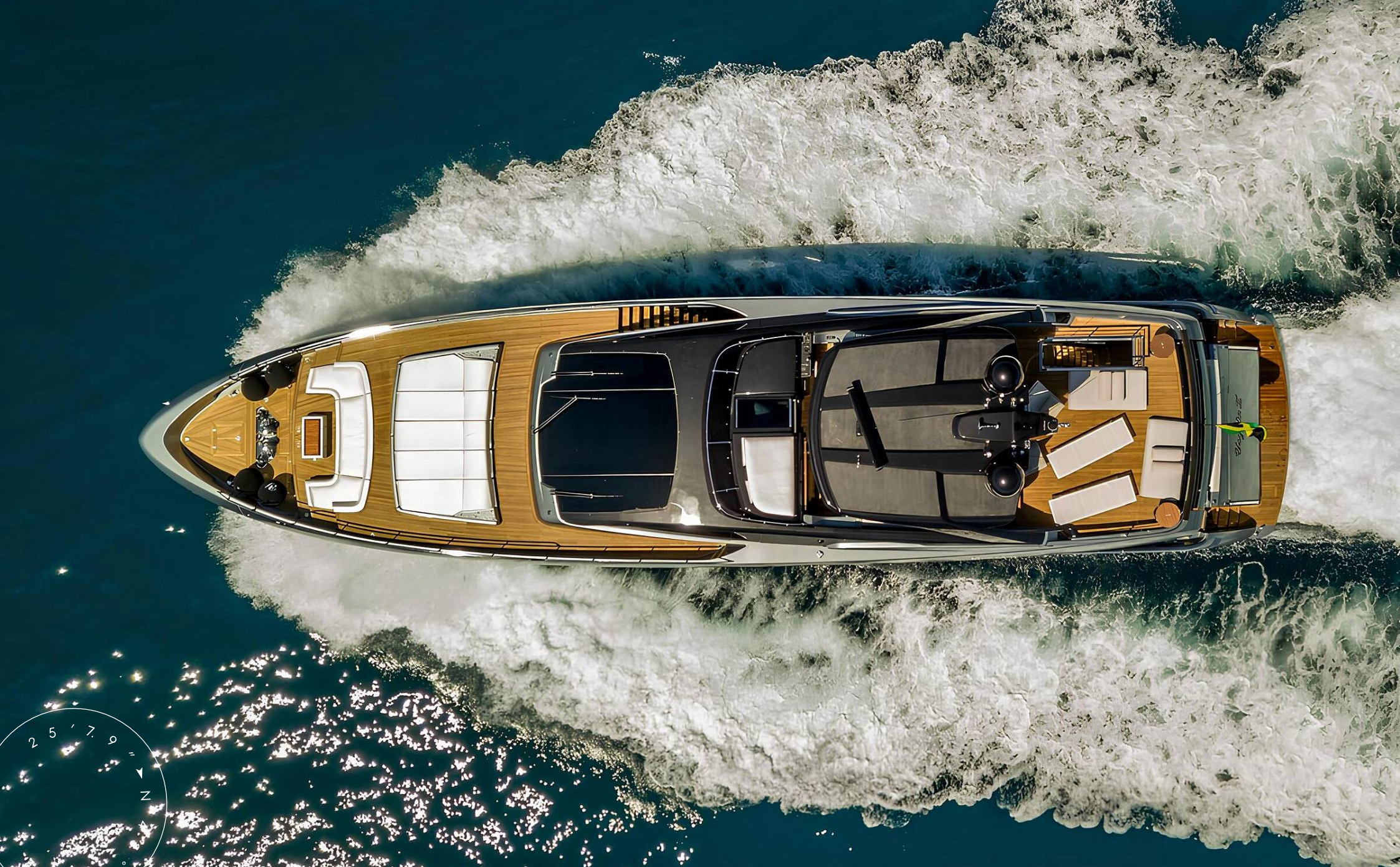
EXTERIOR RIVA 100 CORSARO 2017 MY YOYITA II