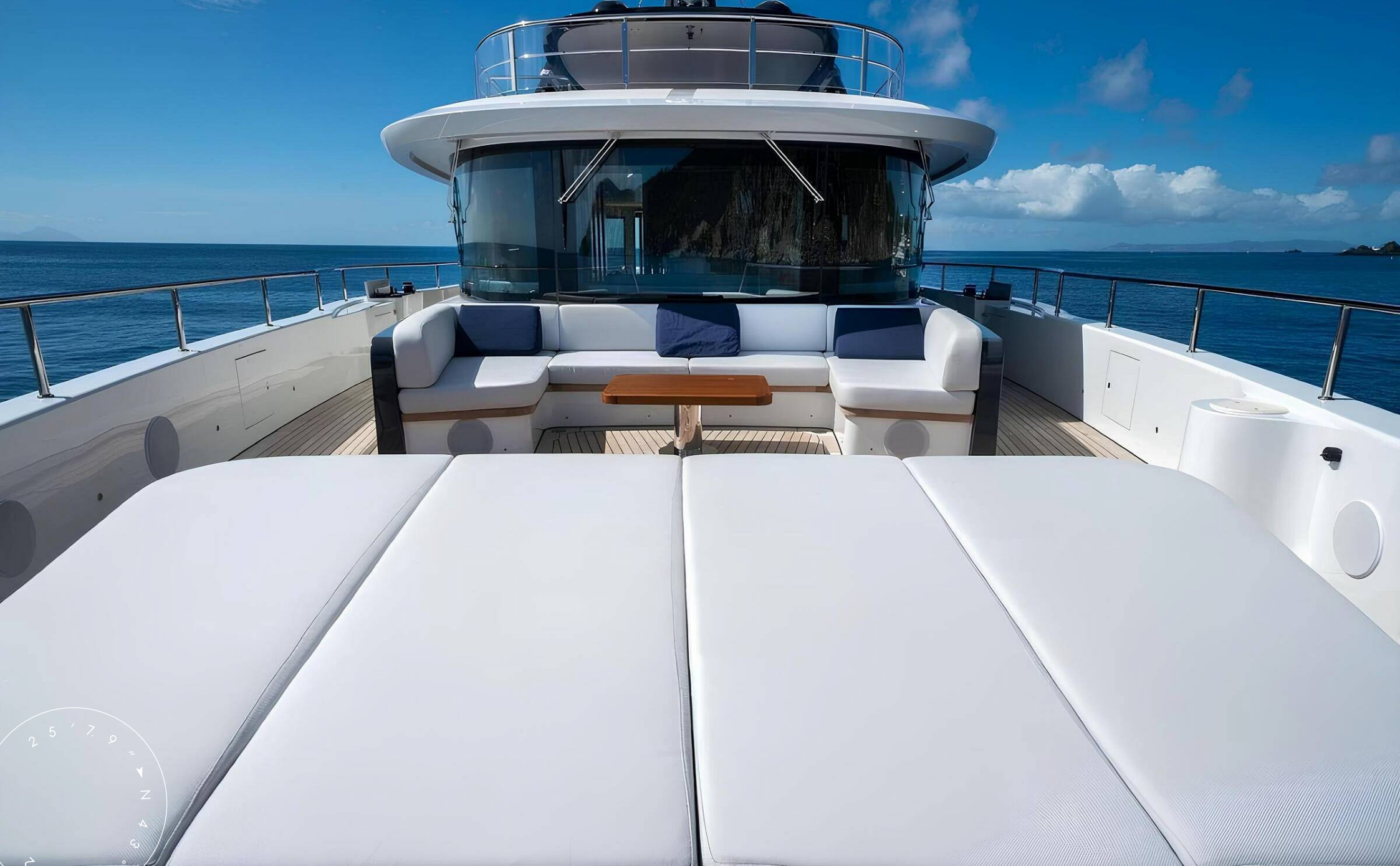
BOW LOUNGE AREA