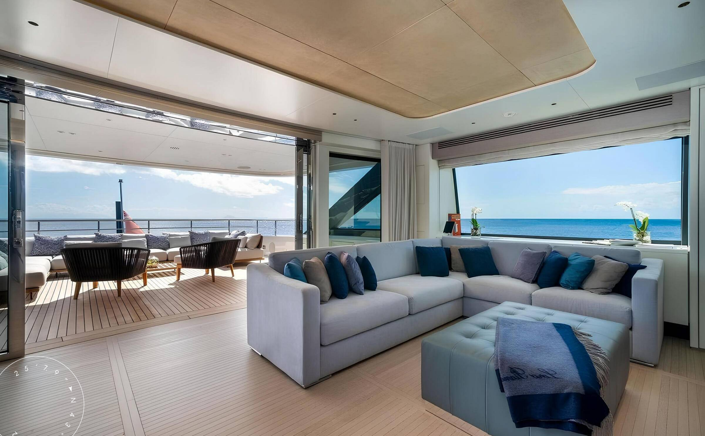
UPPER DECK SALOON