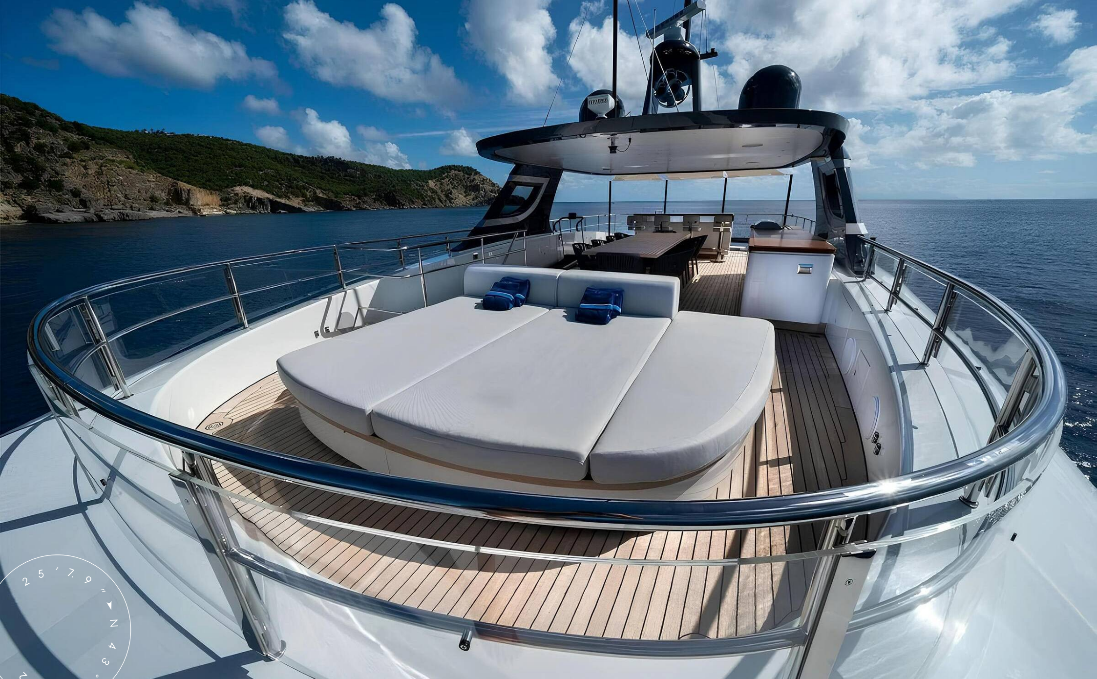
SUNDECK LOUNGE AREA