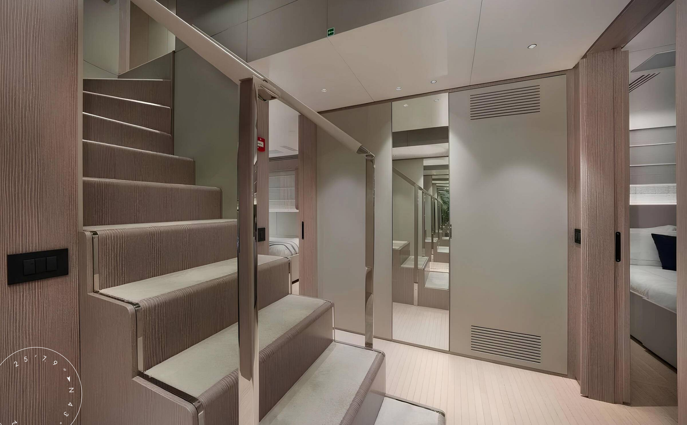
STAIRS FROM MD TO LD