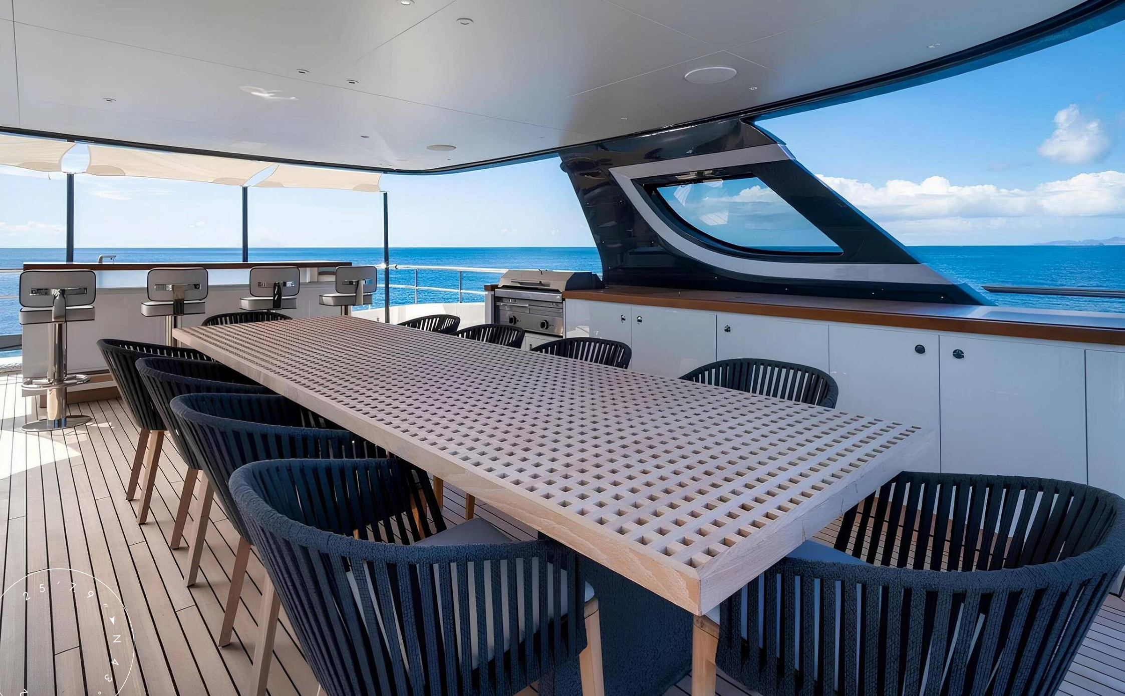
SUNDECK DINING AREA