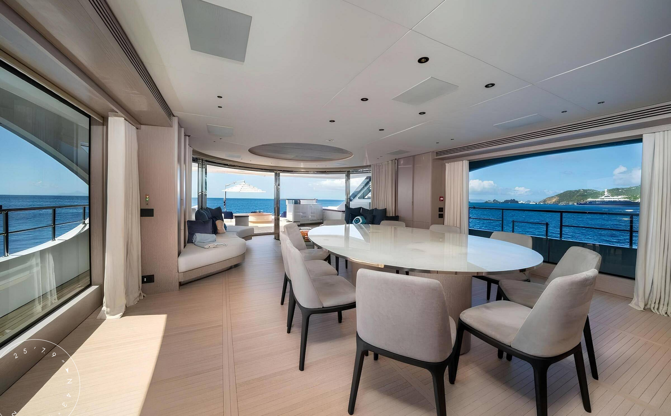
MAIN SALON DINING AREA