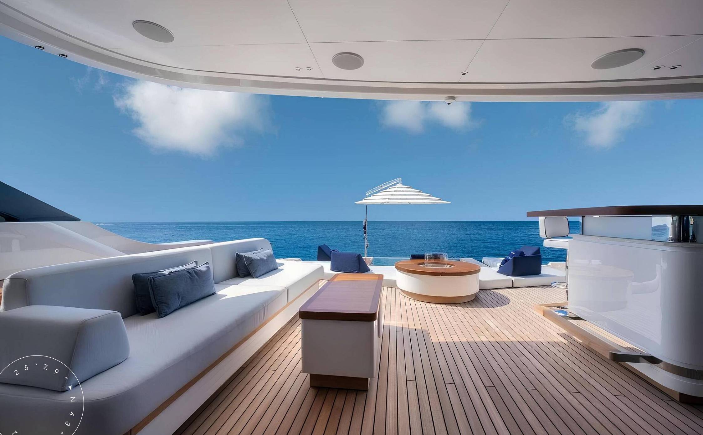
AFT MAIN DECK LOUNGE AREA