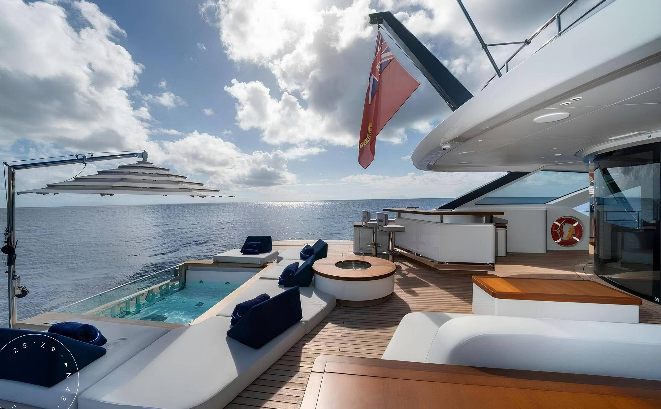
AFT MAIN DECK LOUNGE AREA