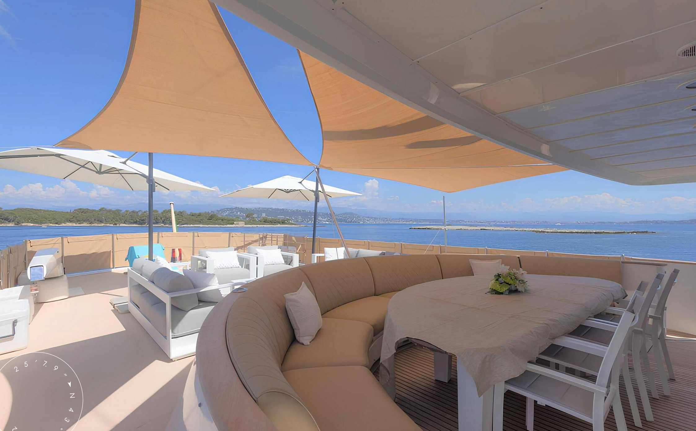
FLYBRIDGE DINING AREA