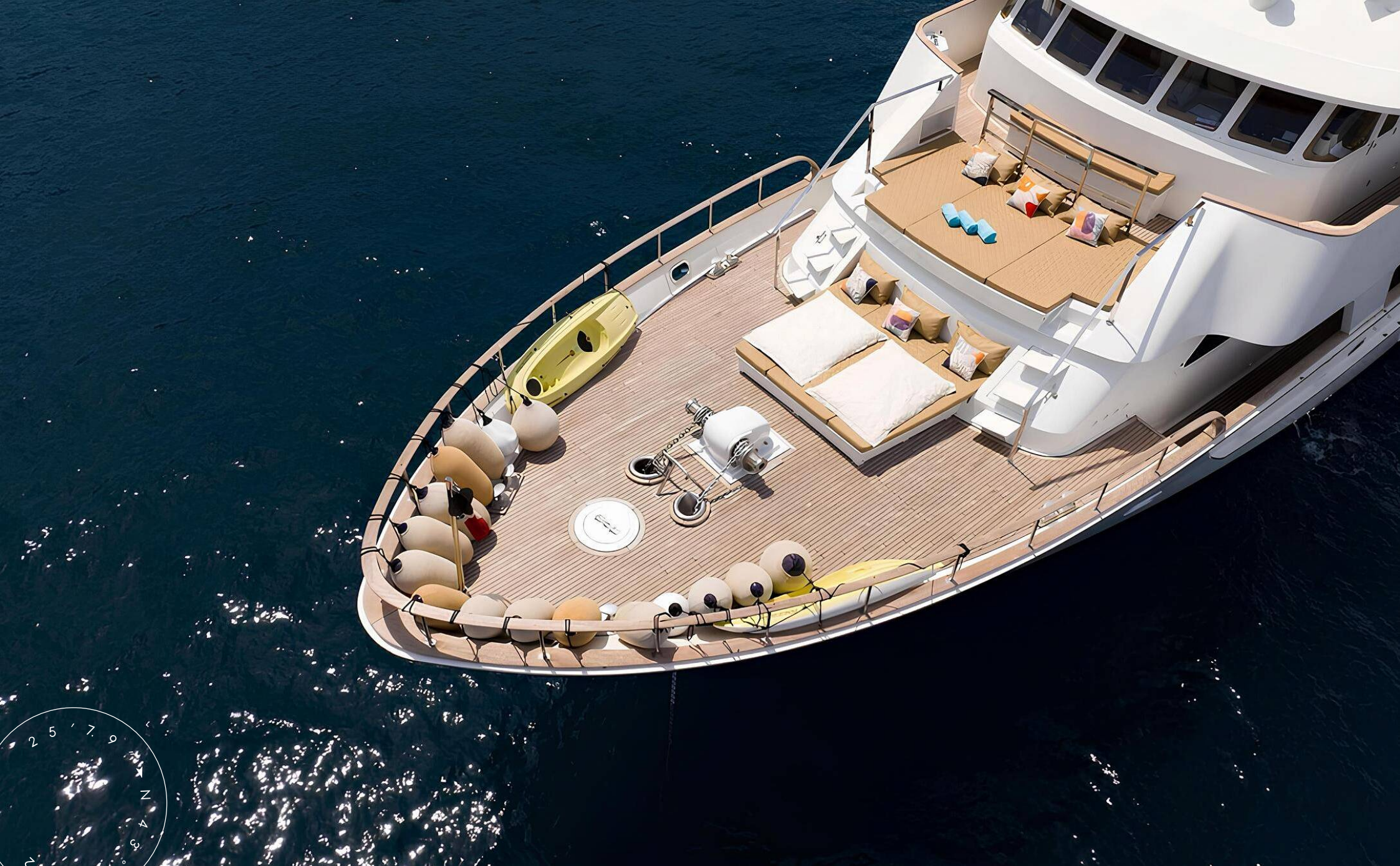
BOW LOUNGE AREA