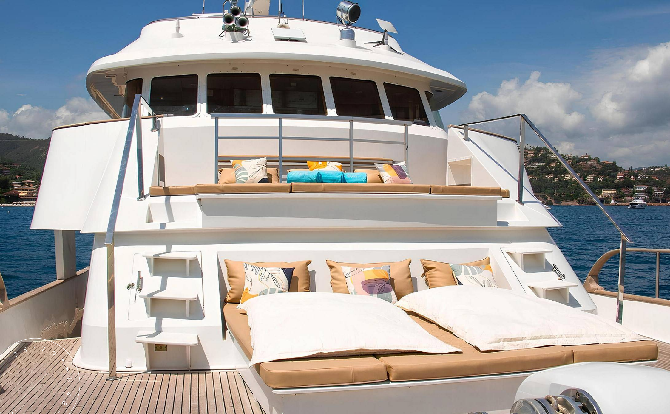
BOW LOUNGE AREA