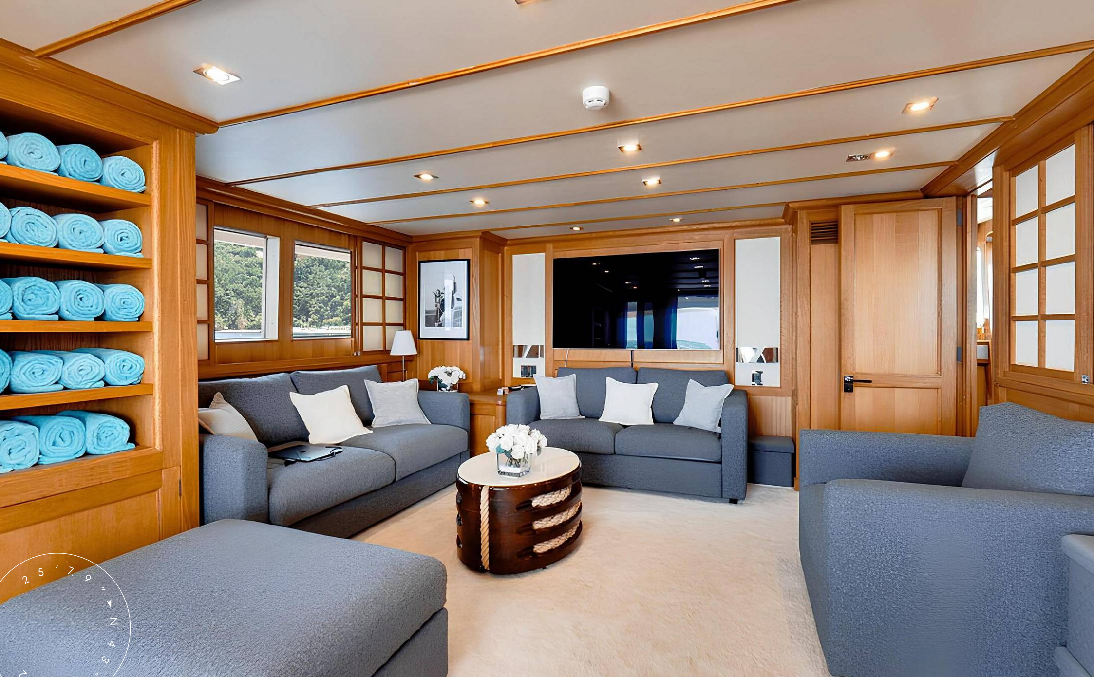
UPPER DECK SALOON