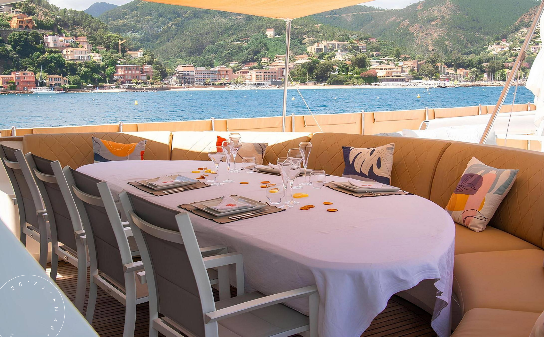
FLYBRIDGE DINING AREA