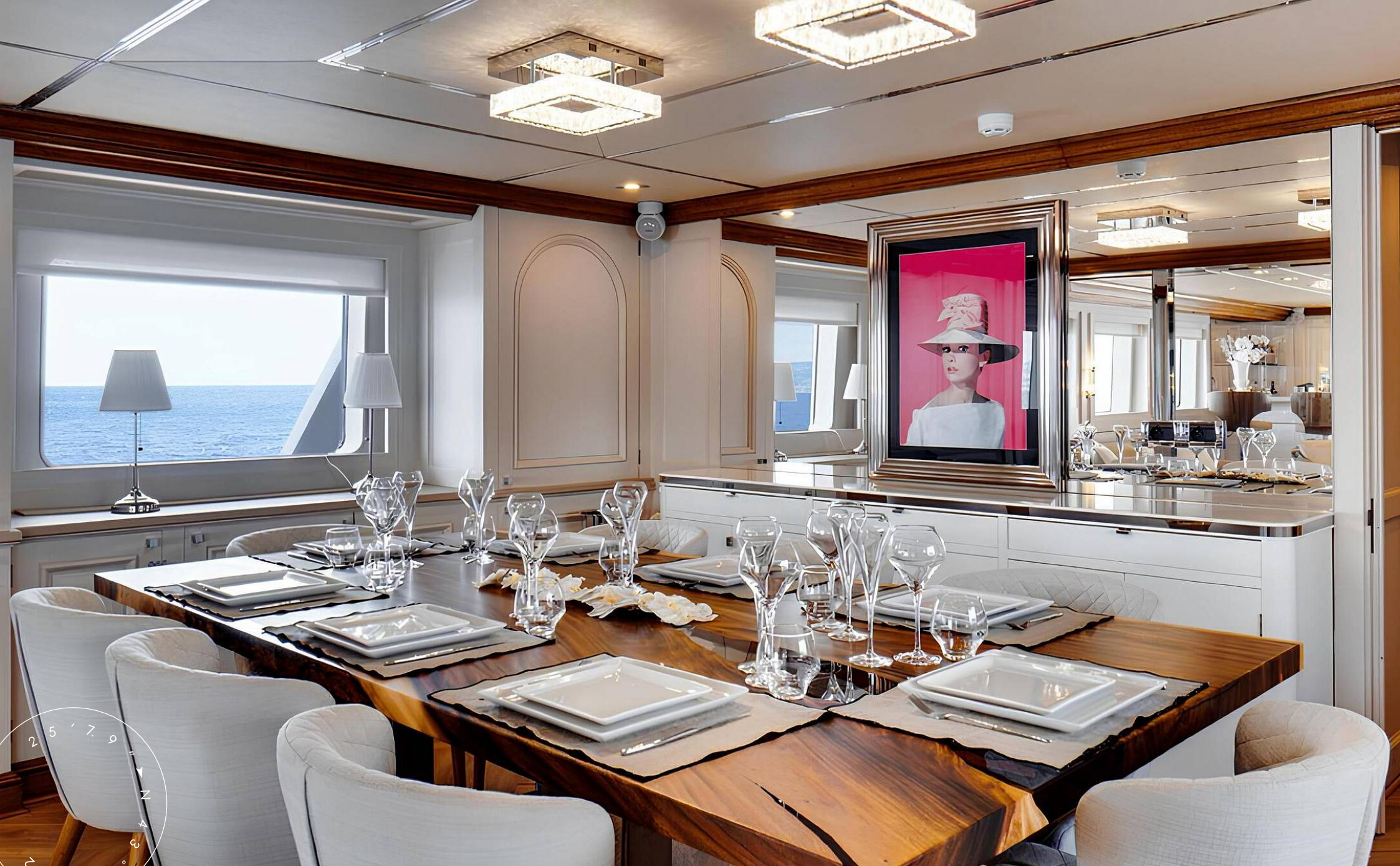
MAIN SALON DINING AREA