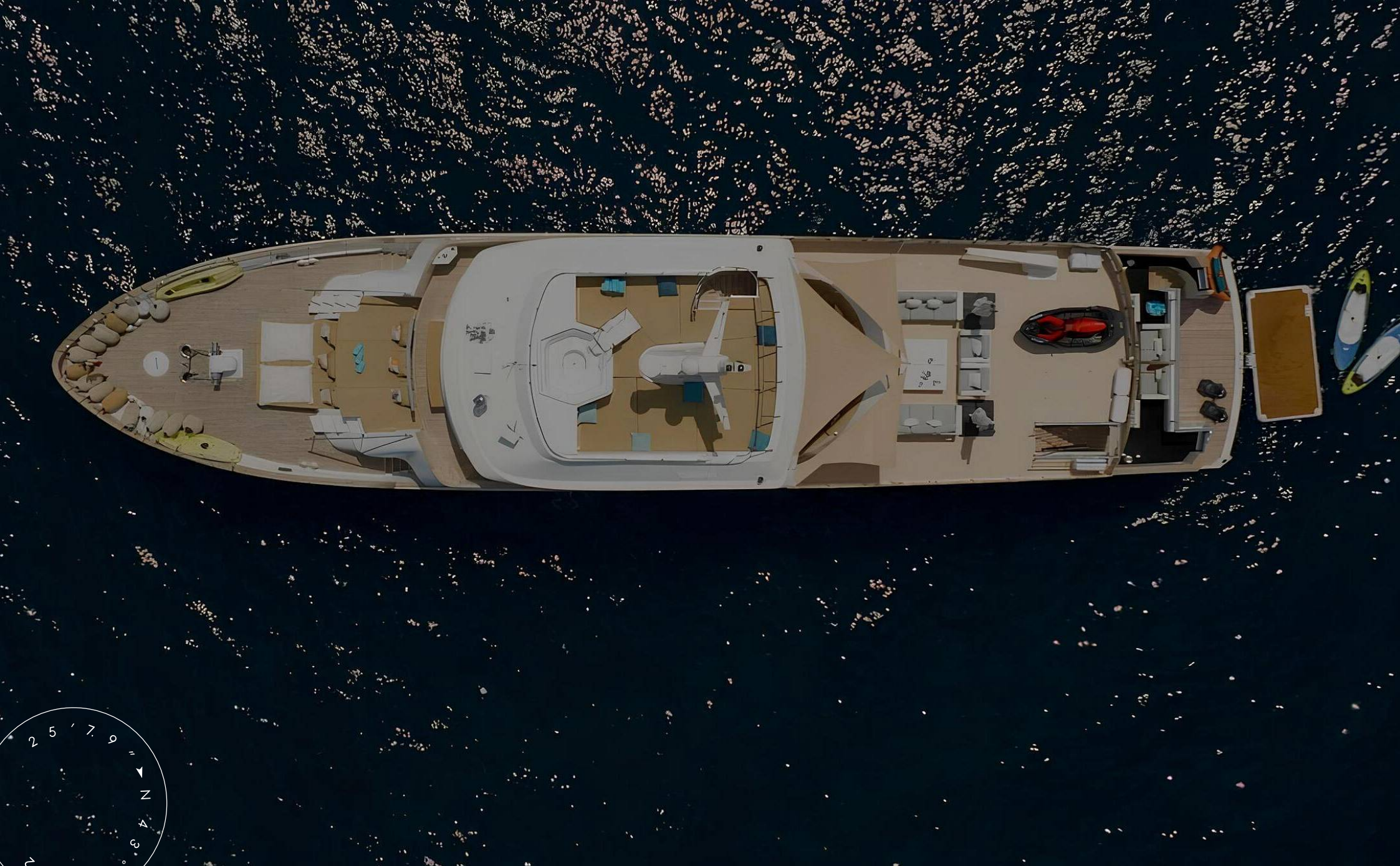
EXTERIOR CHEOY LEE 115 1993 MY EVA