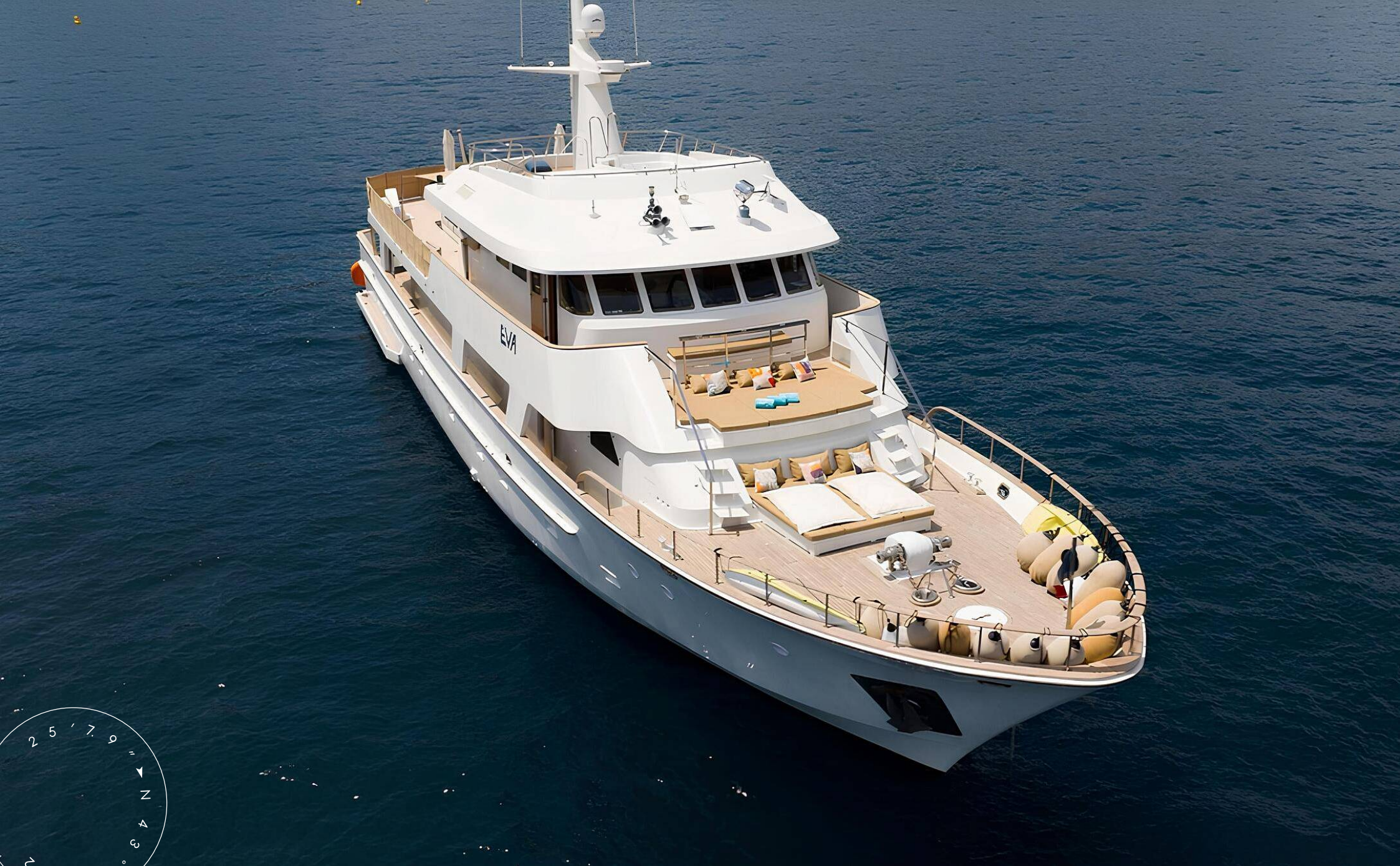
EXTERIOR CHEOY LEE 115 1993 MY EVA