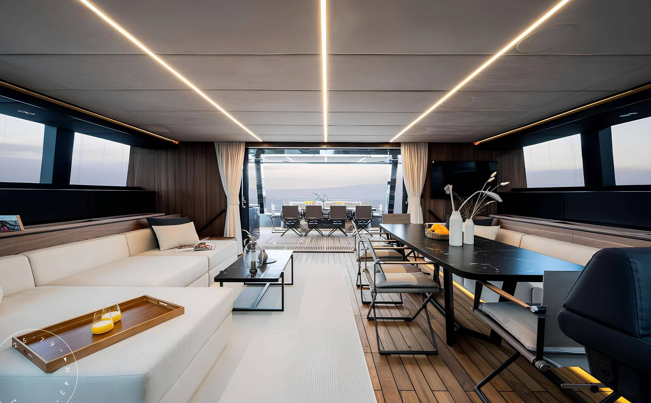
MAIN SALON LOUNGE AREA