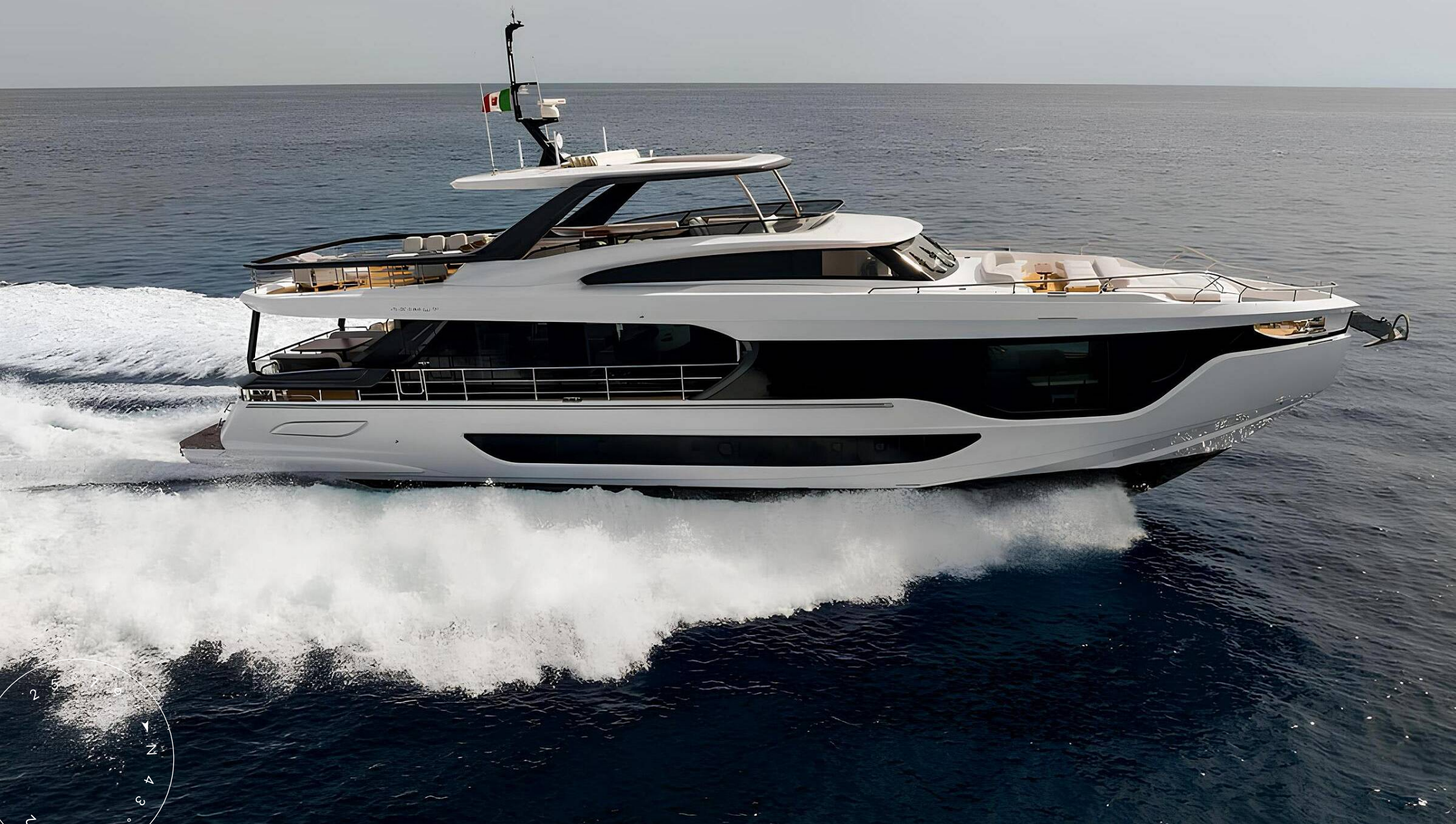
EXTERIOR AZIMUT GRANDE 26M 2025 MY BK