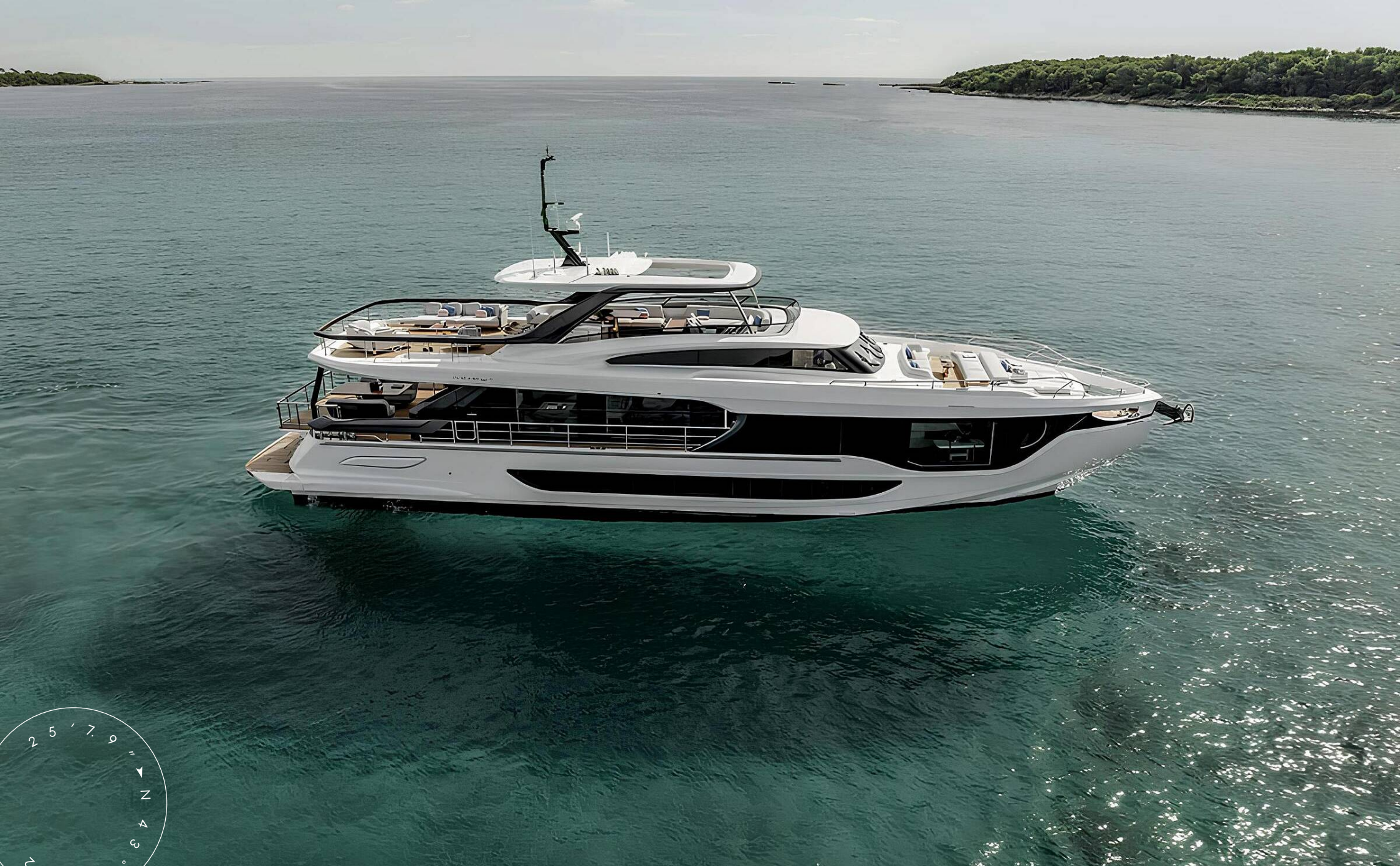
EXTERIOR AZIMUT GRANDE 26M 2025 MY BK