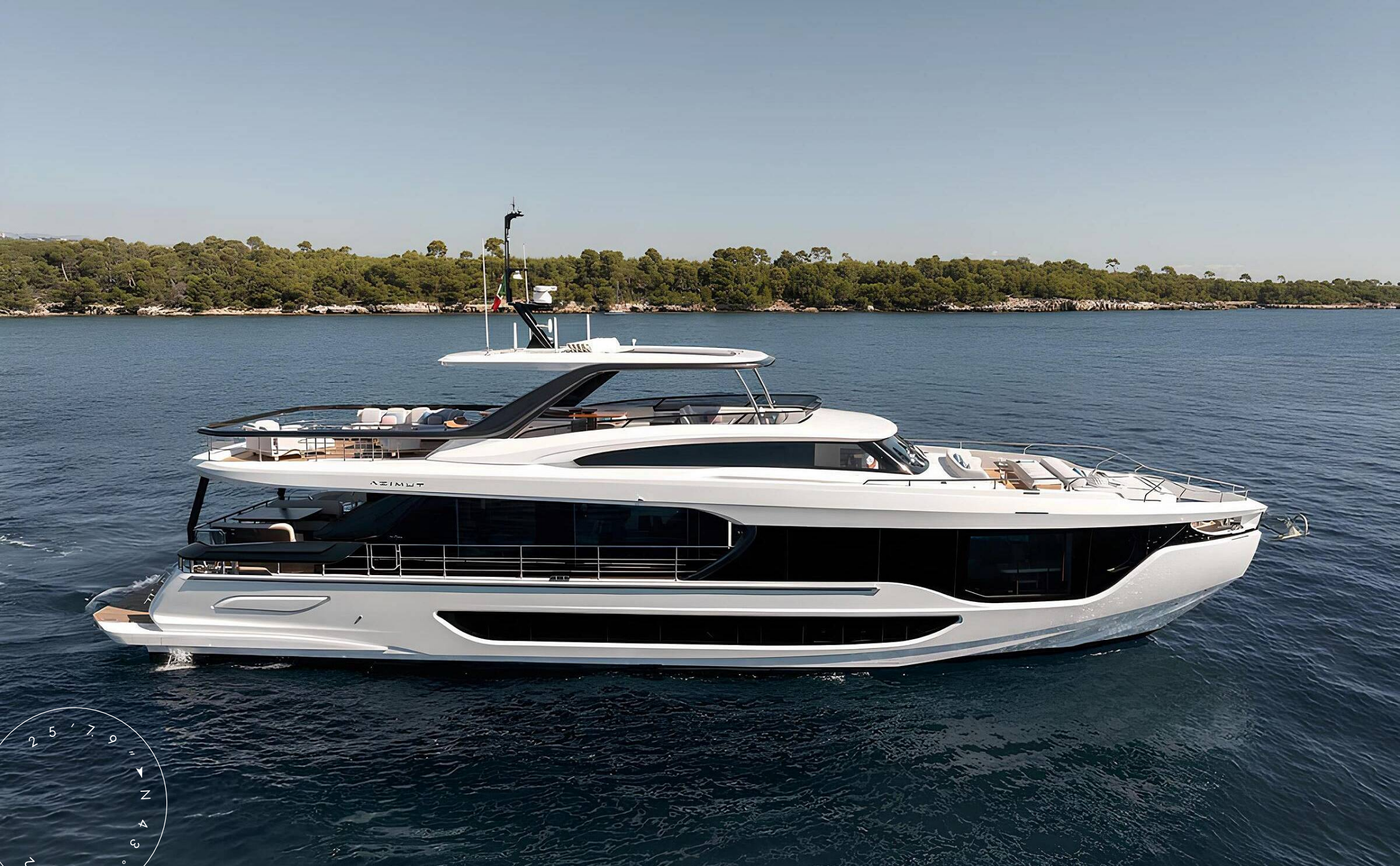
EXTERIOR AZIMUT GRANDE 26M 2025 MY BK