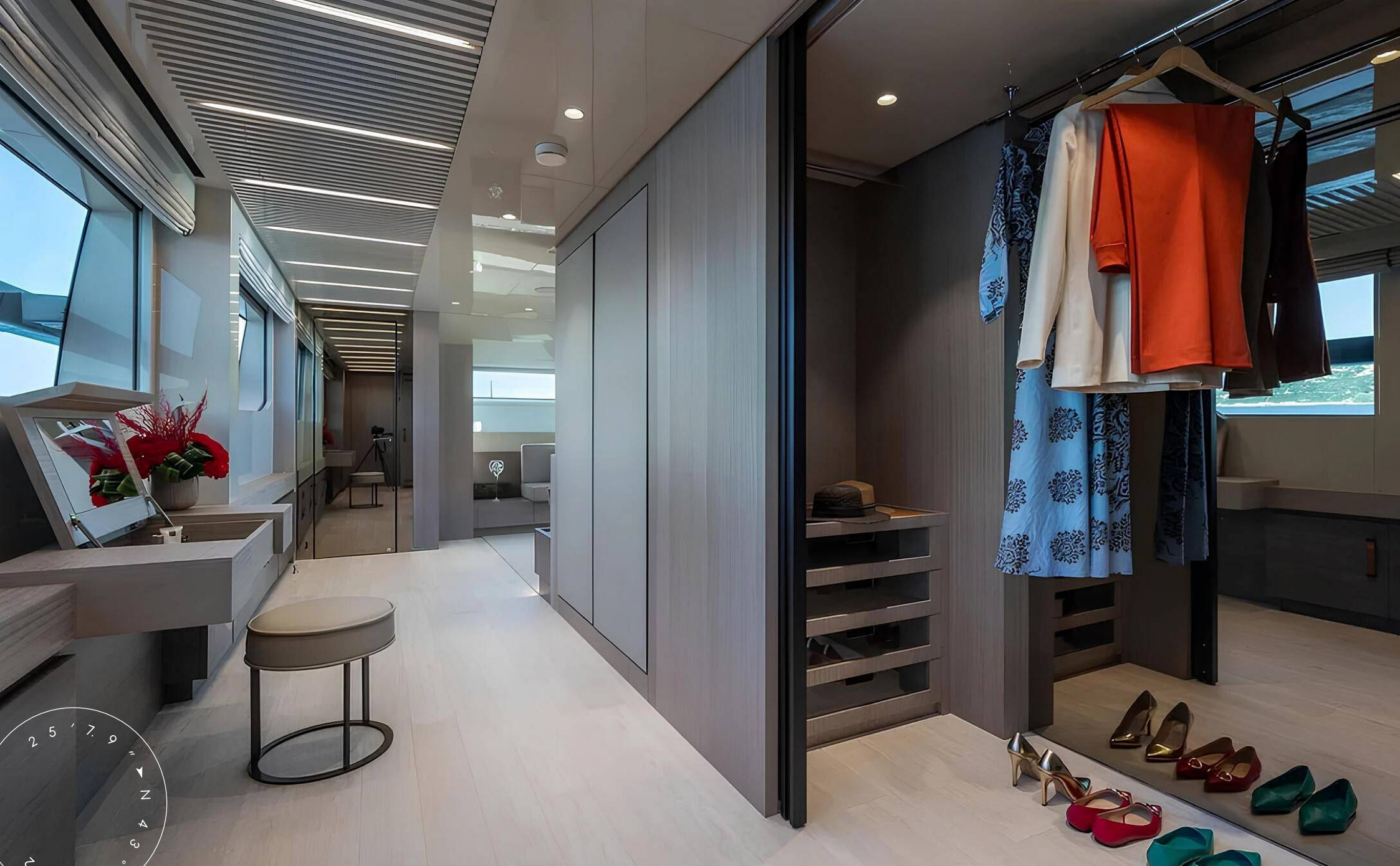
MASTER CABIN DRESSING ROOM