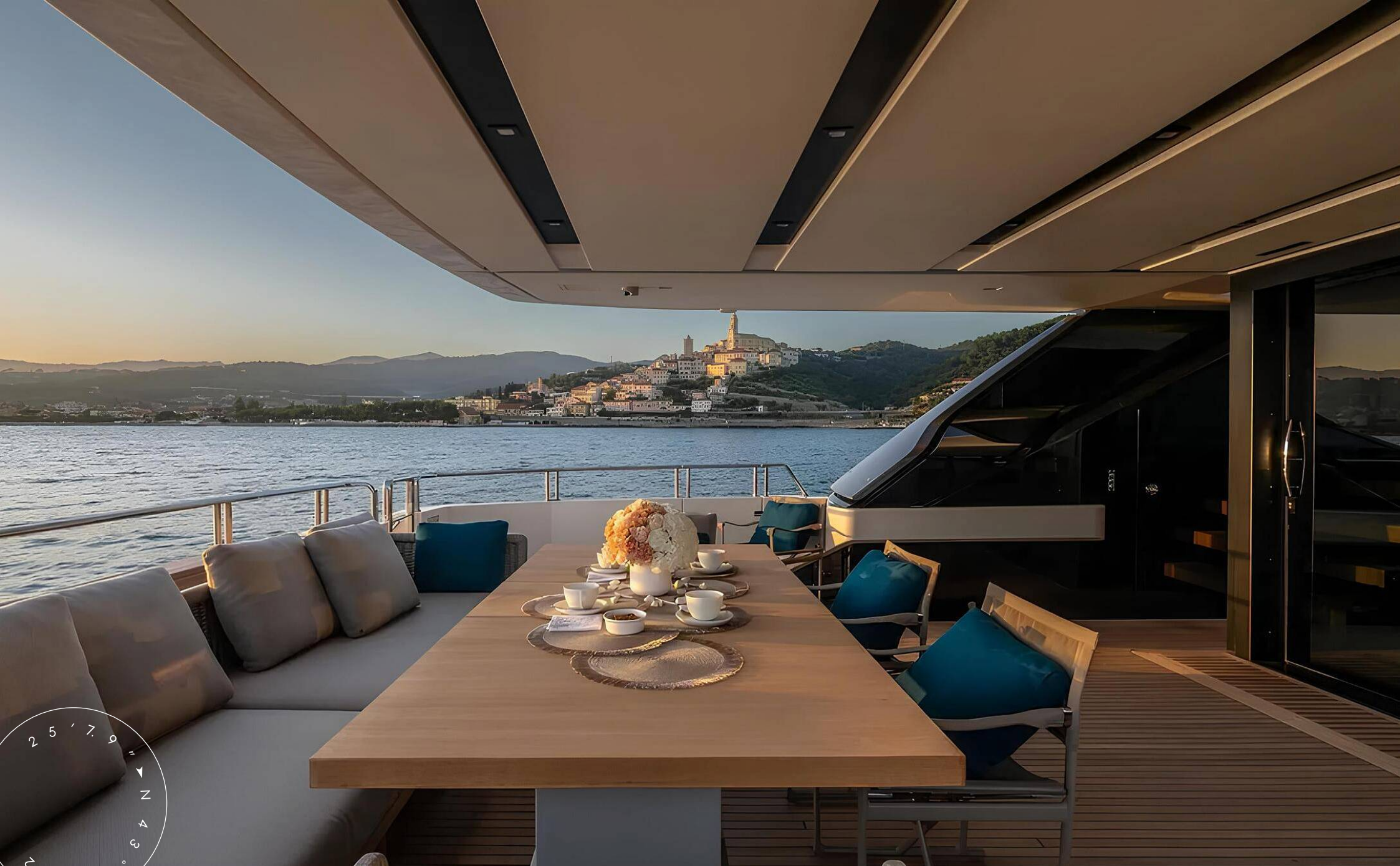
COCKPIT DINING AREA