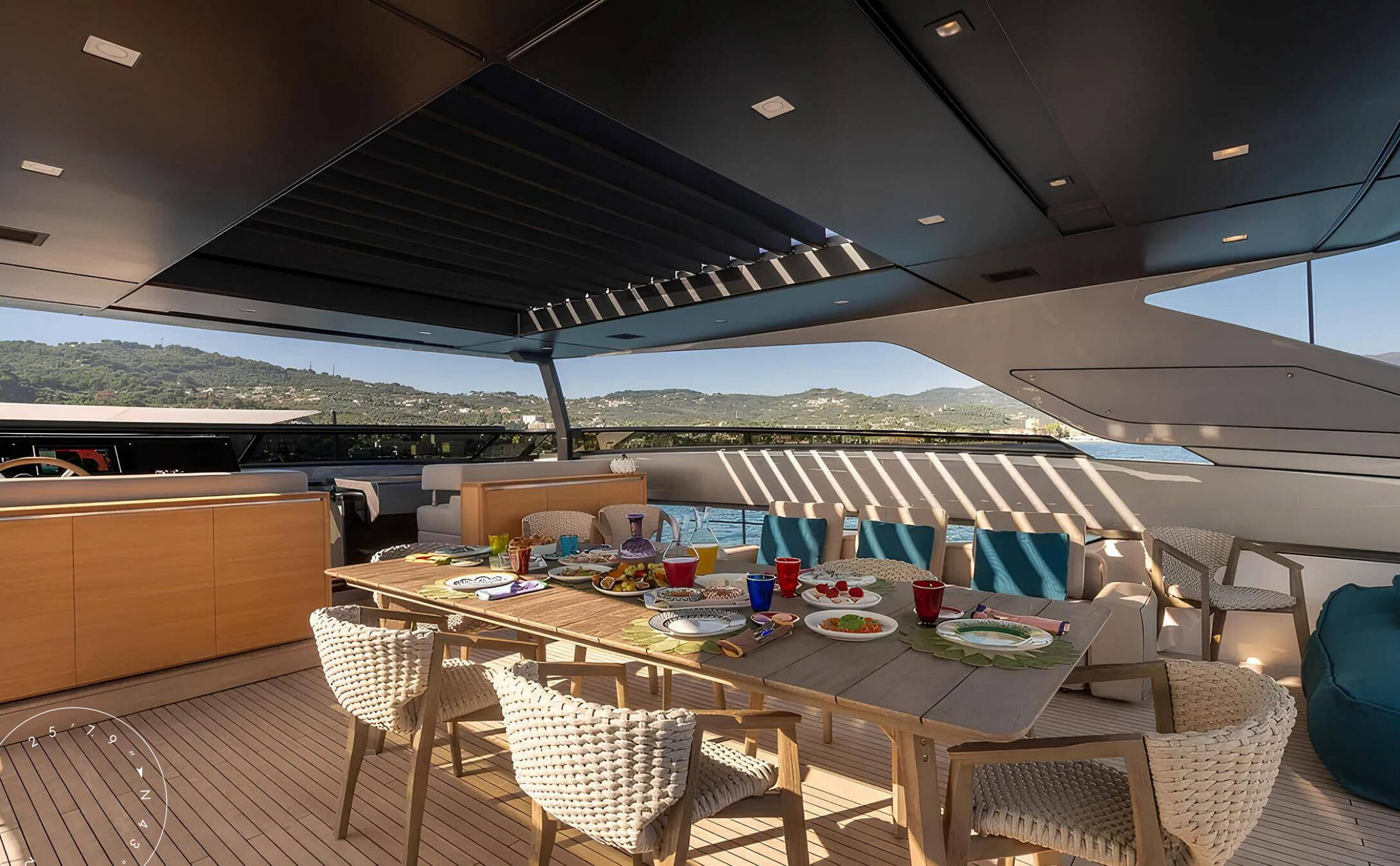
FLYBRIDGE DINING AREA