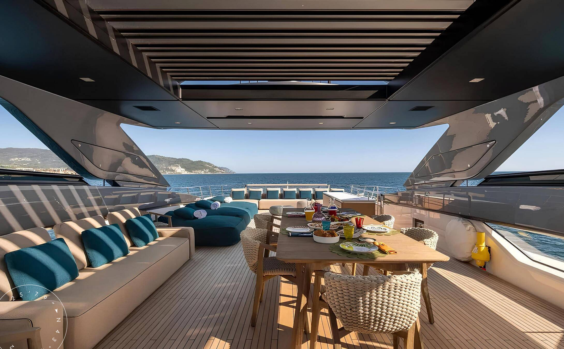
FLYBRIDGE LOUNGE AREA