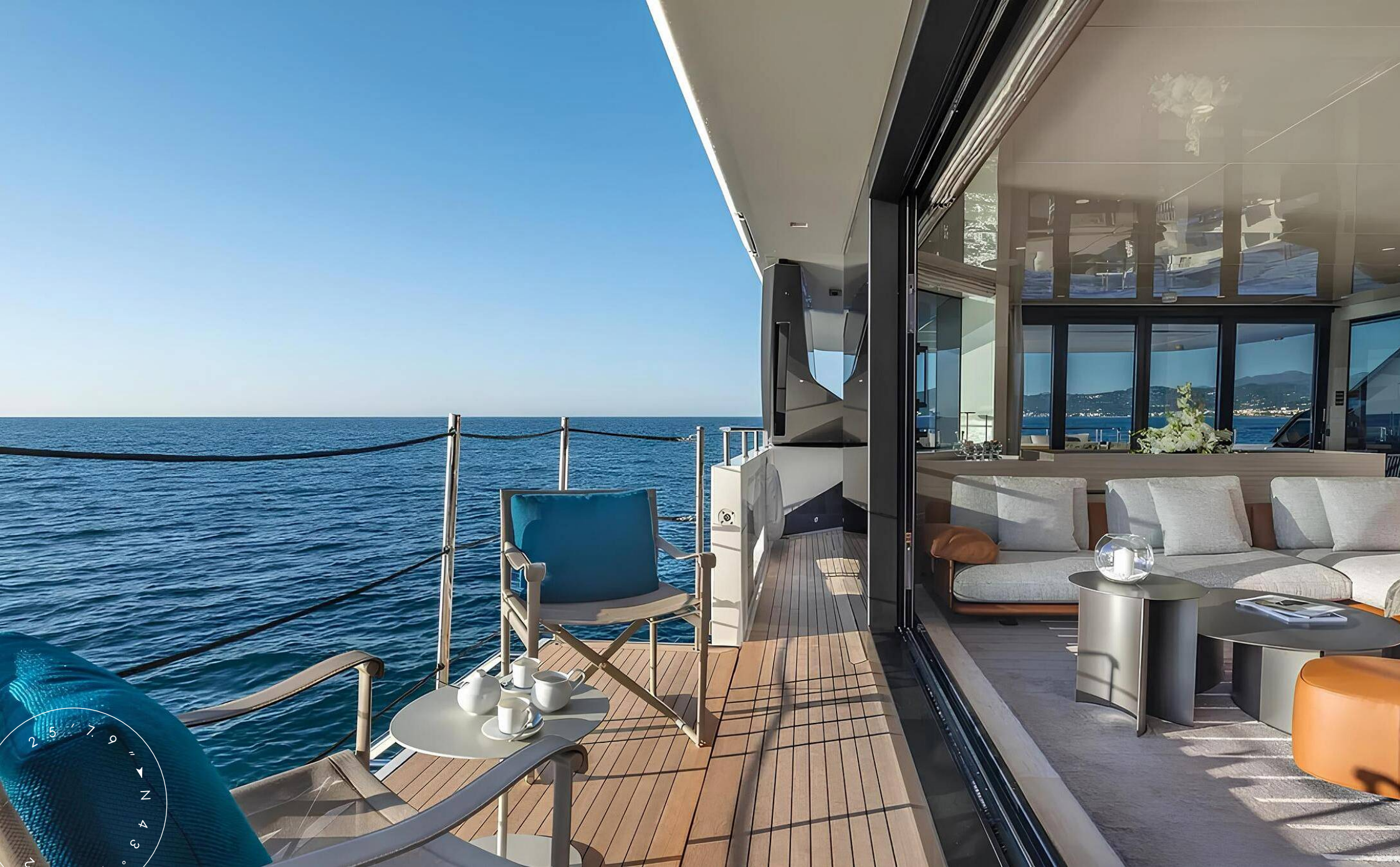
FOLDING STARBOARD BALCONY