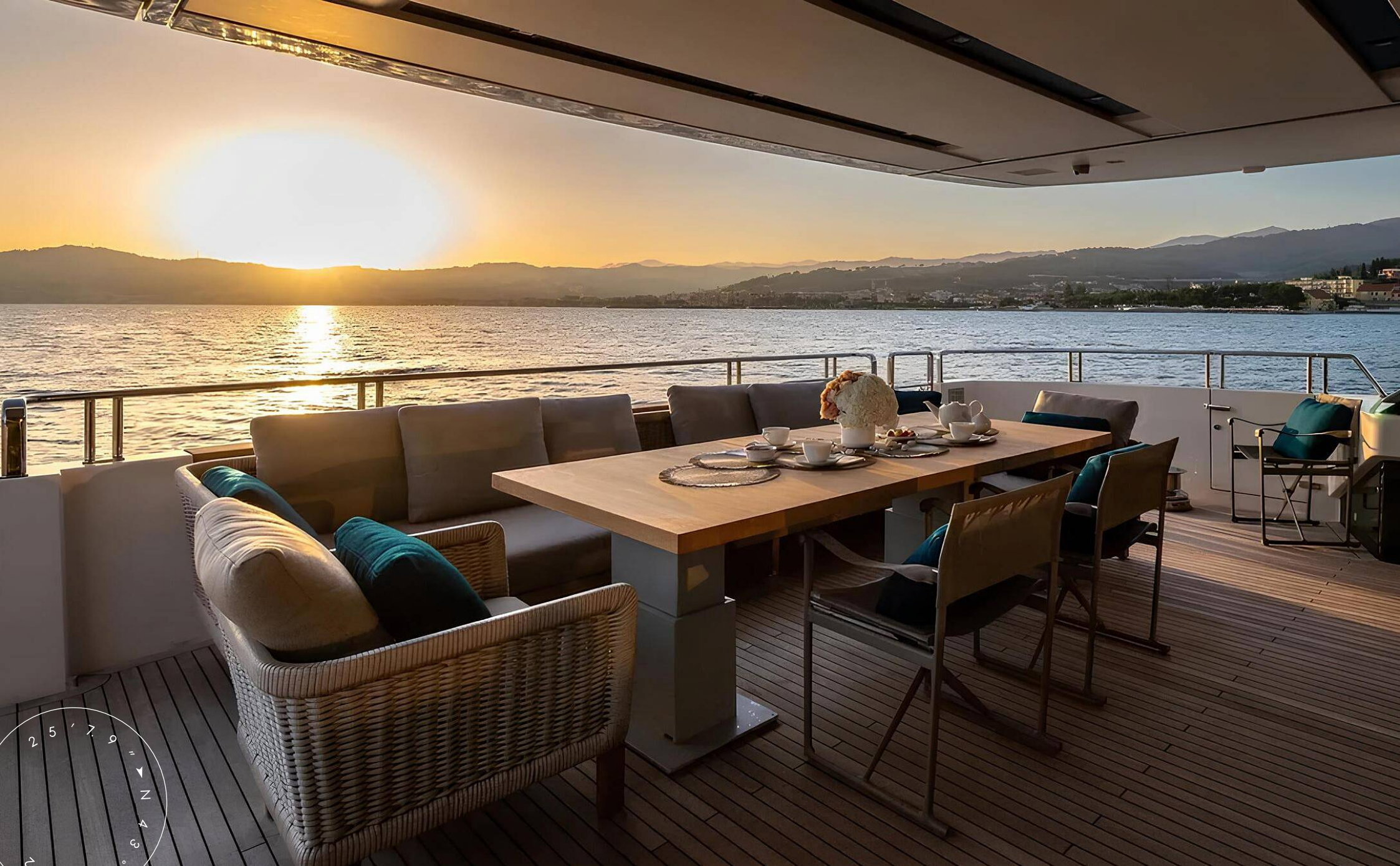
COCKPIT DINING AREA