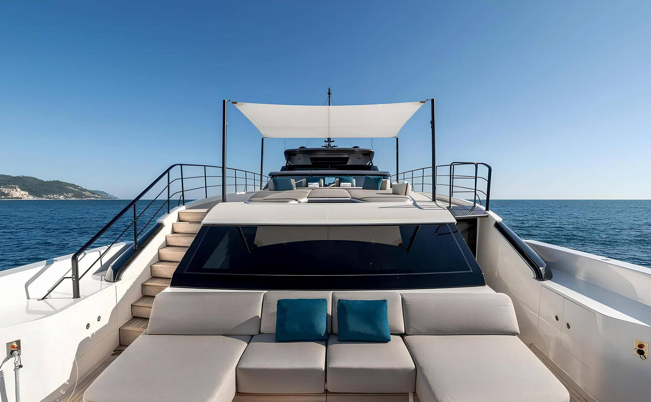
BOW LOUNGE AREA