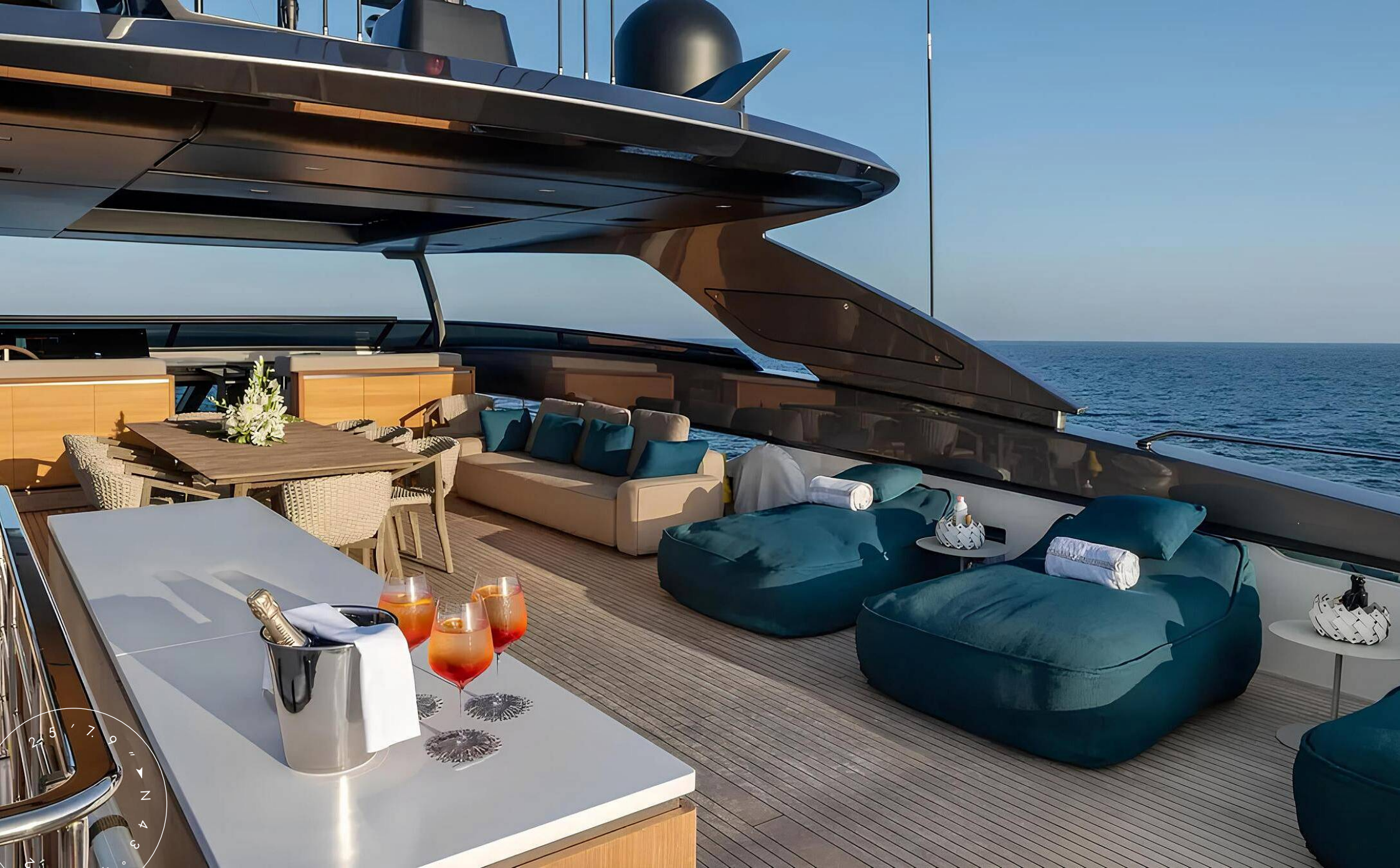
FLYBRIDGE LOUNGE AREA