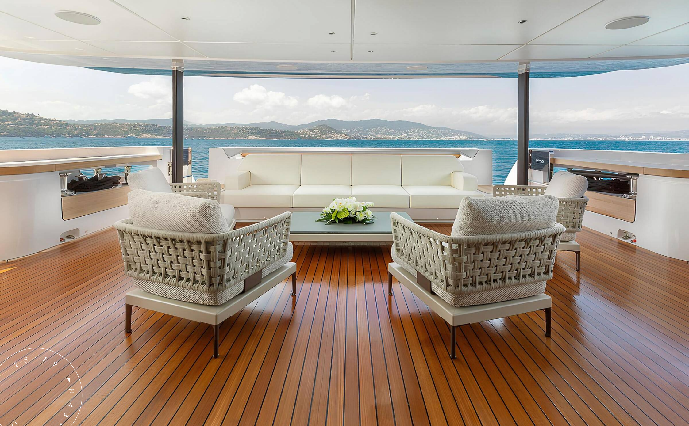
AFT MAIN DECK LOUNGE AREA