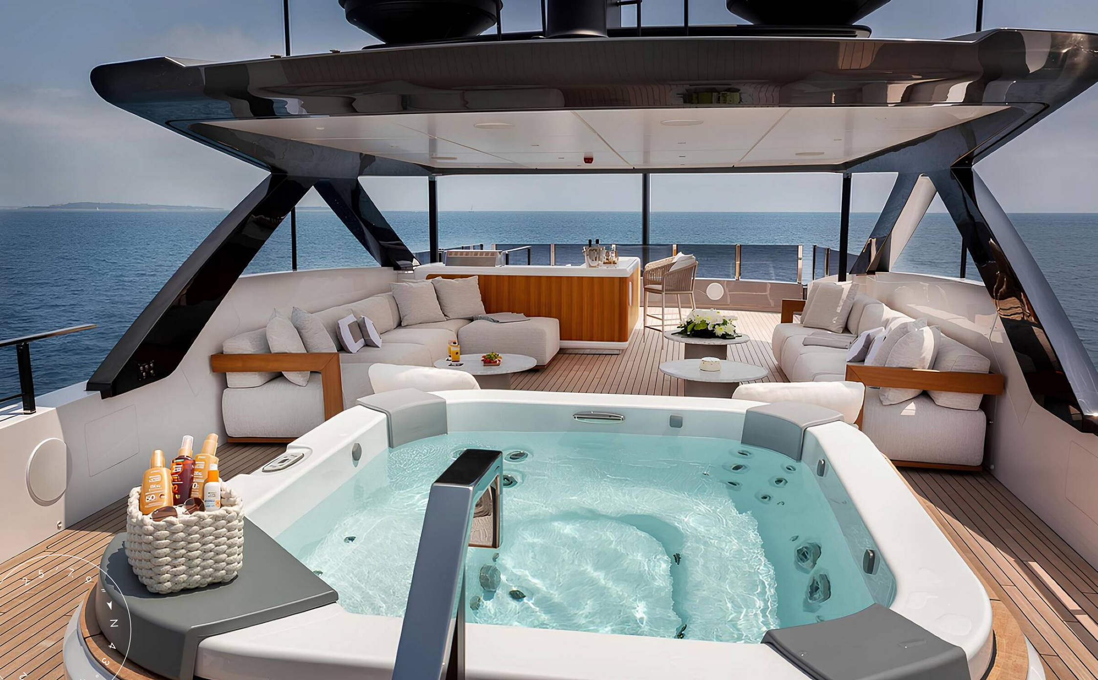
SUNDECK LOUNGE AREA