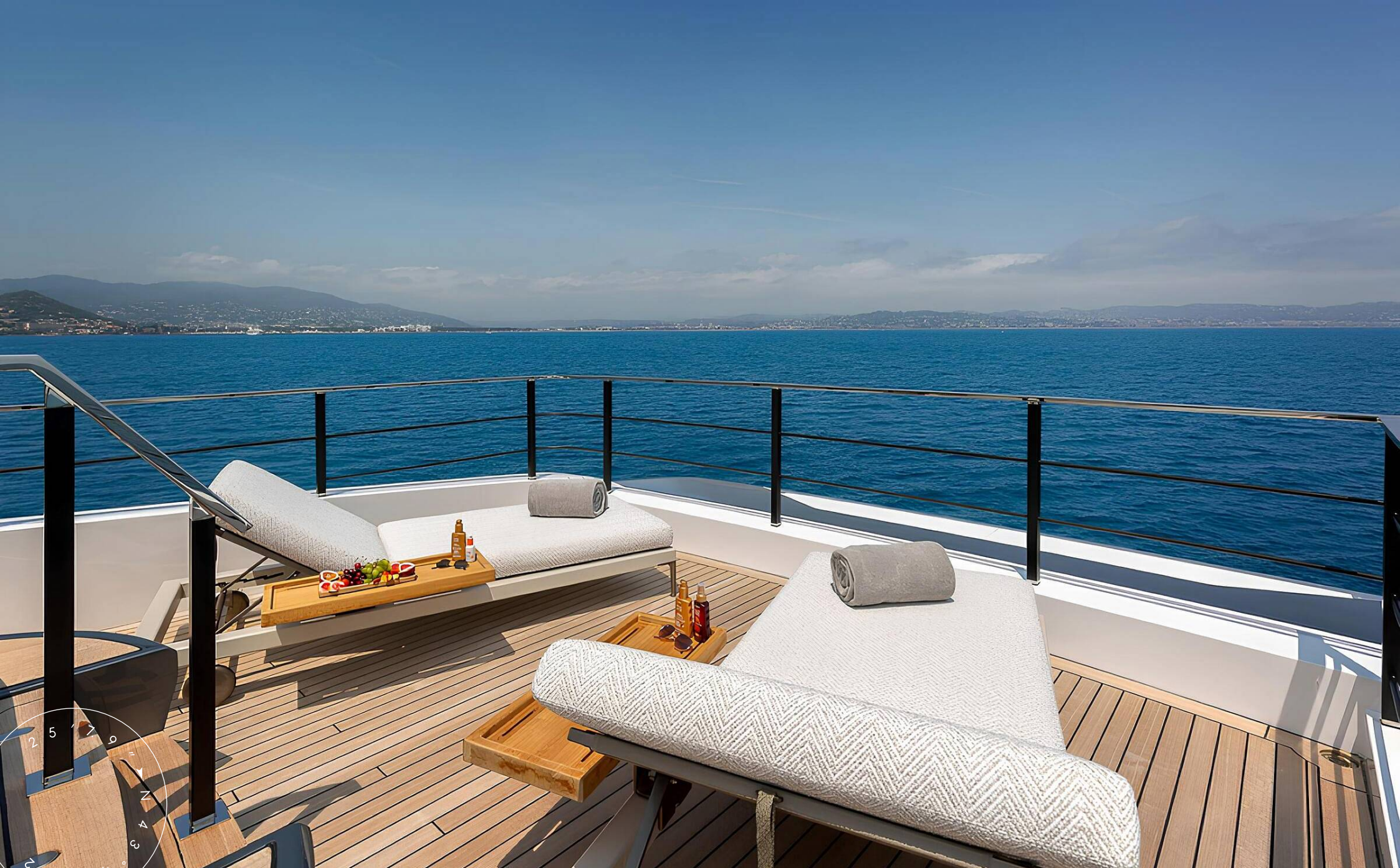
SUNDECK LOUNGE AREA