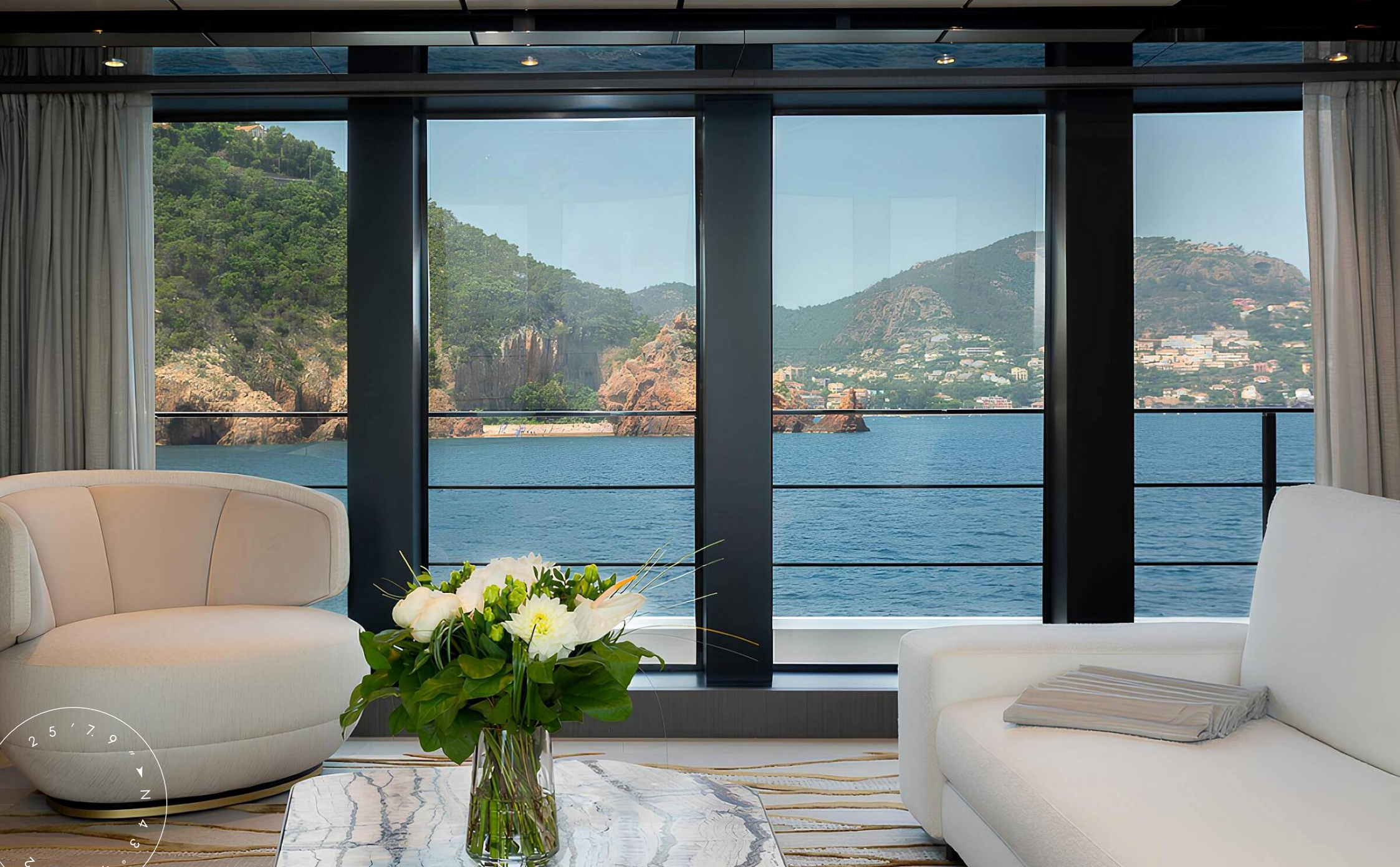
UPPER DECK SALOON