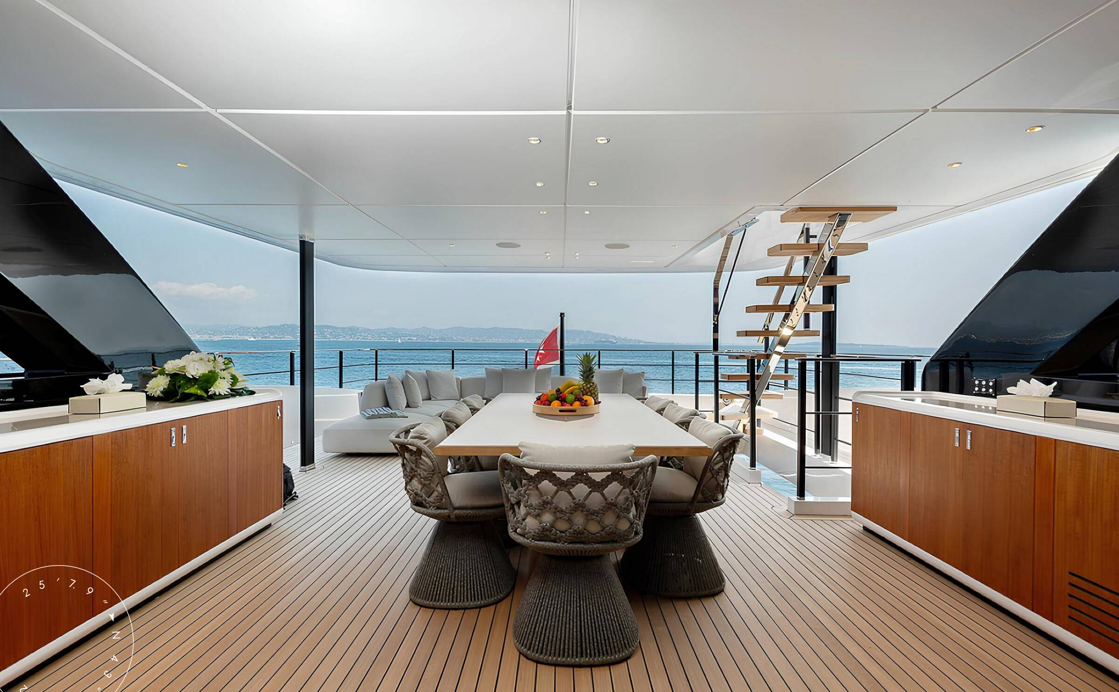
AFT UPPER DECK DINING AREA