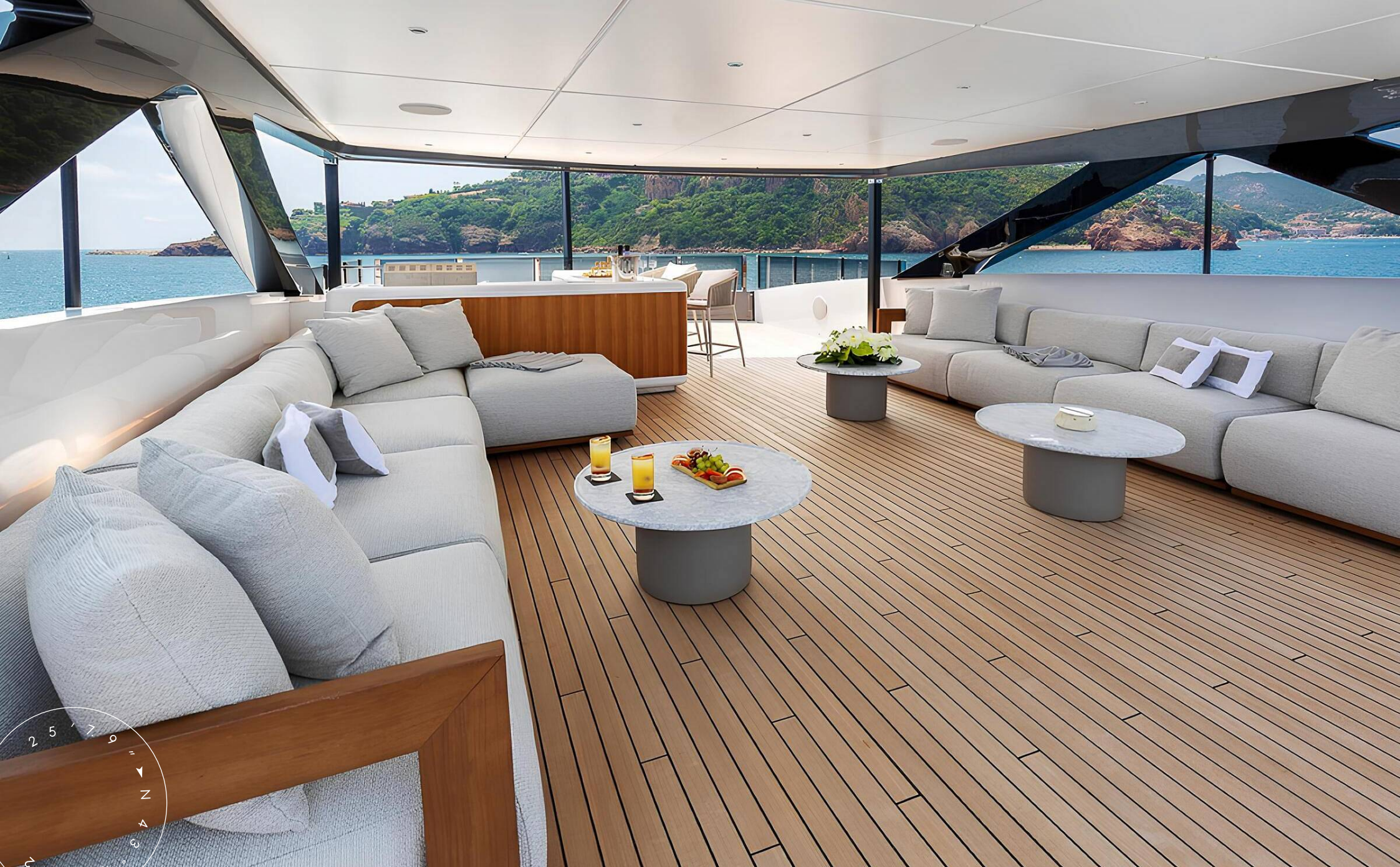
SUNDECK LOUNGE AREA