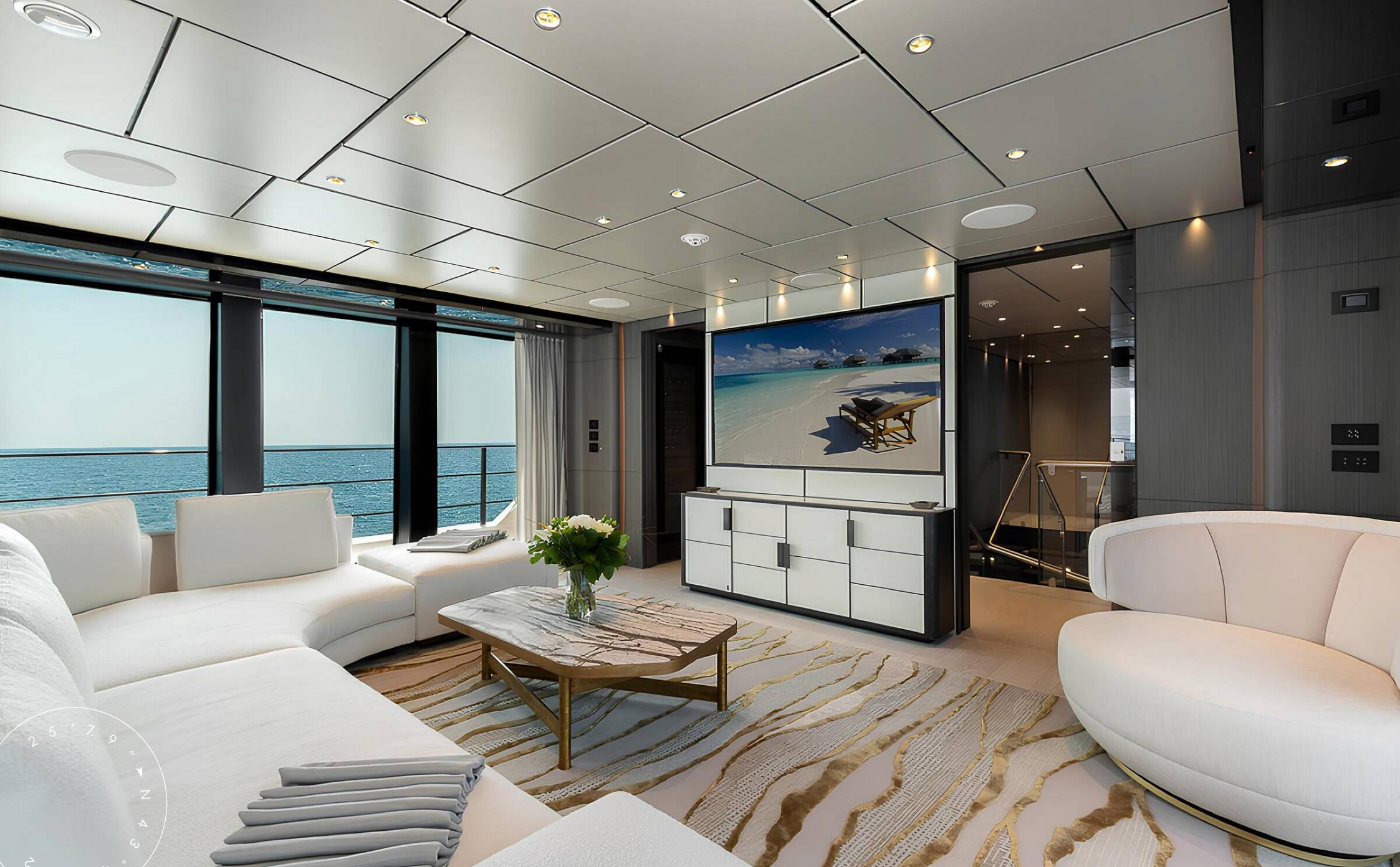
UPPER DECK SALOON