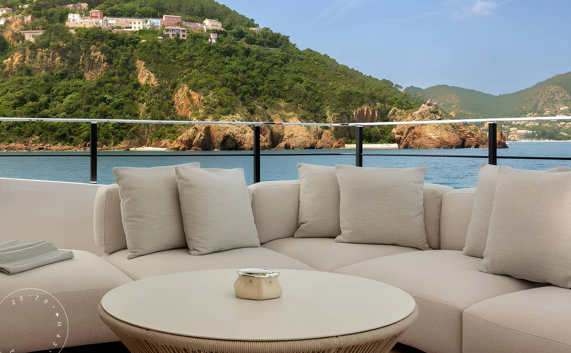
AFT UPPER DECK LOUNGE AREA