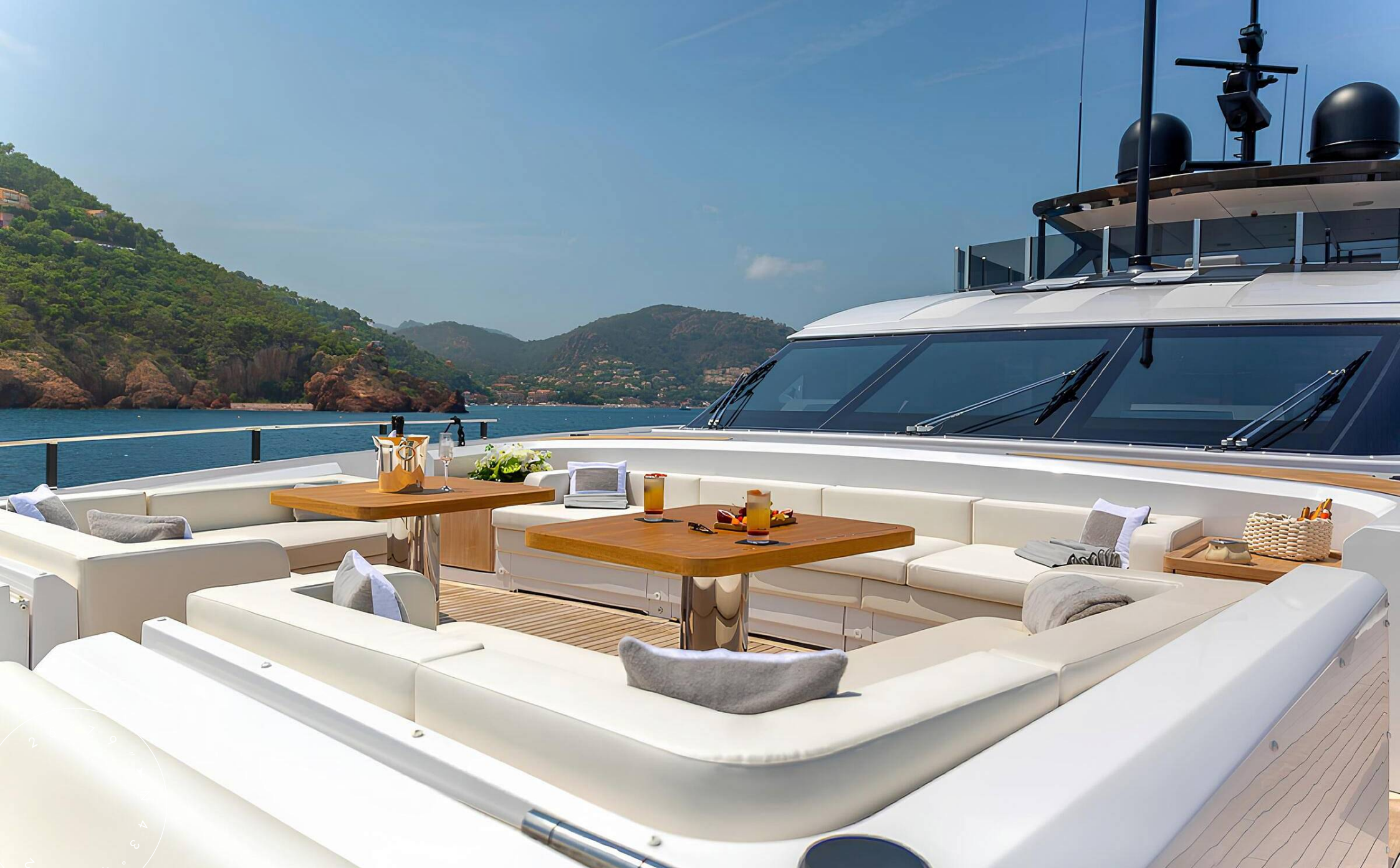
BOW LOUNGE AREA