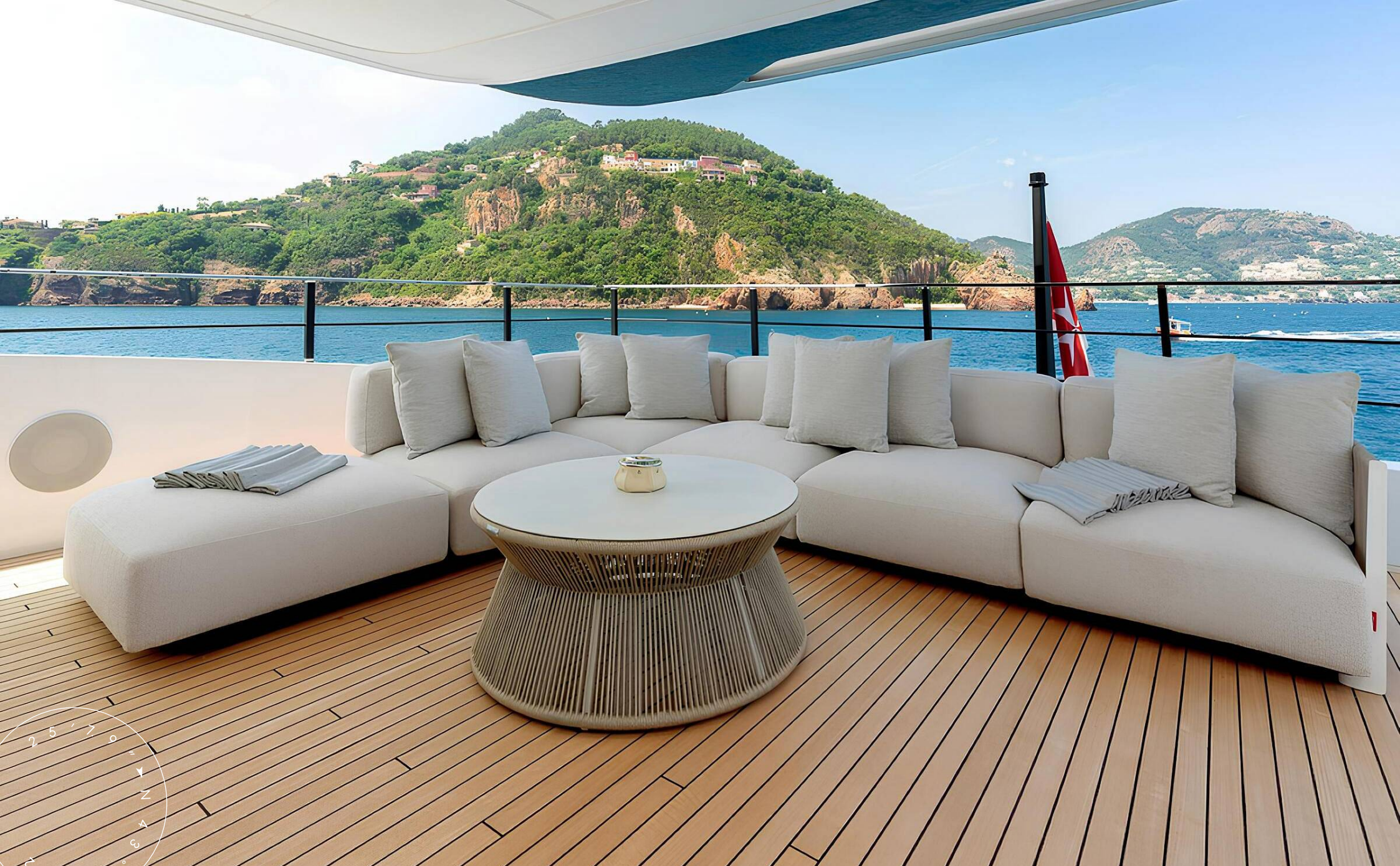
AFT UPPER DECK LOUNGE AREA