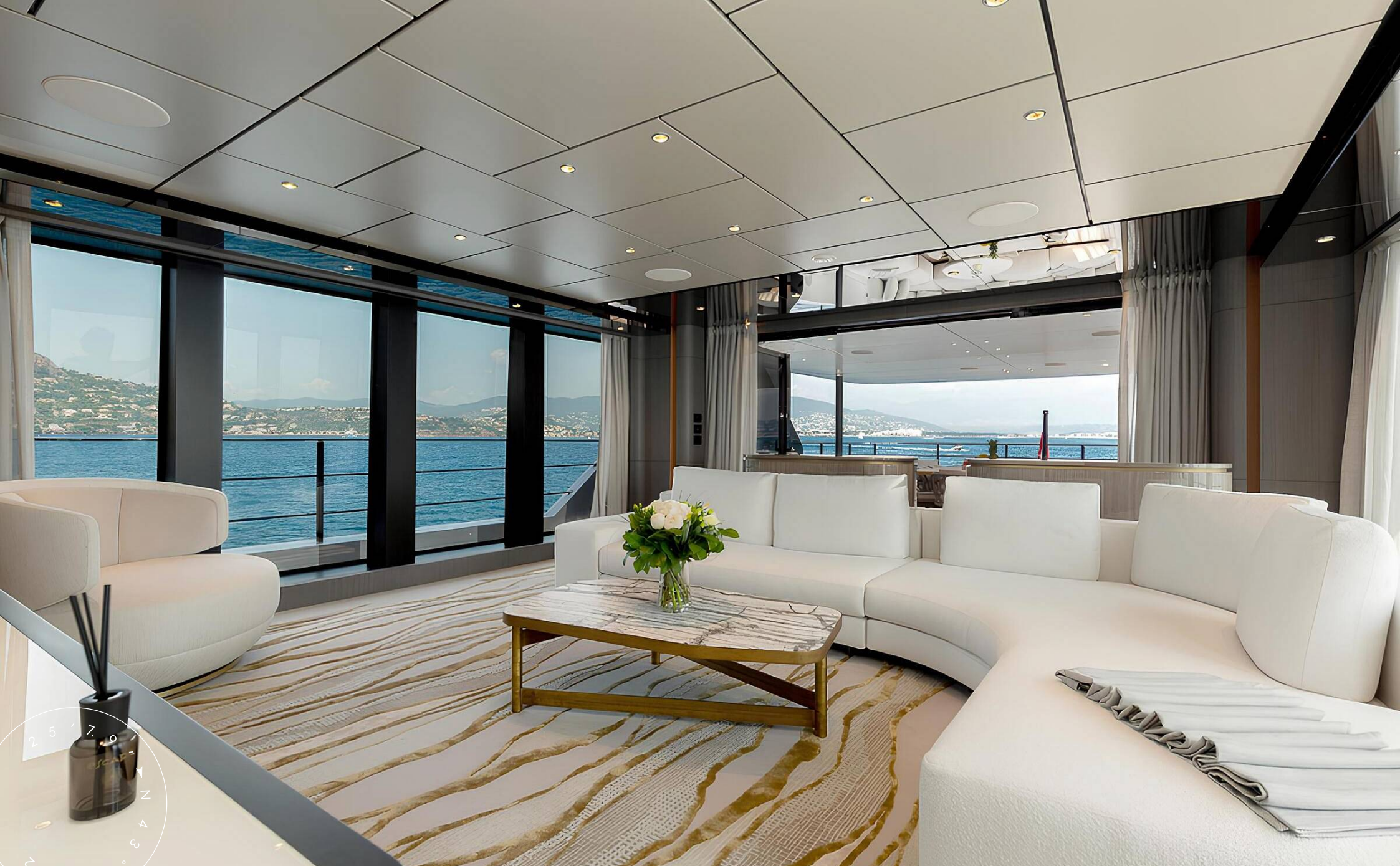
UPPER DECK SALOON