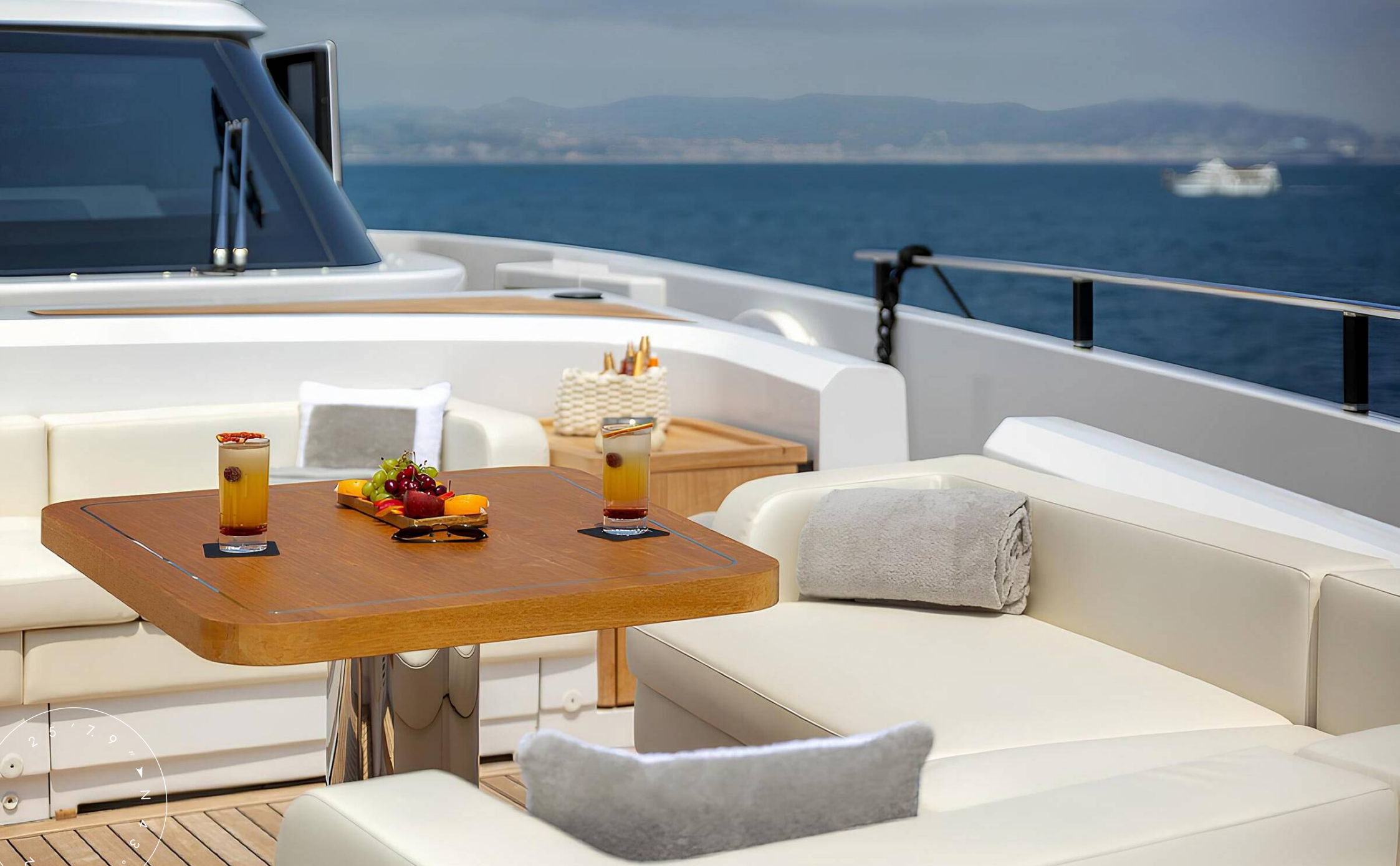
BOW LOUNGE AREA