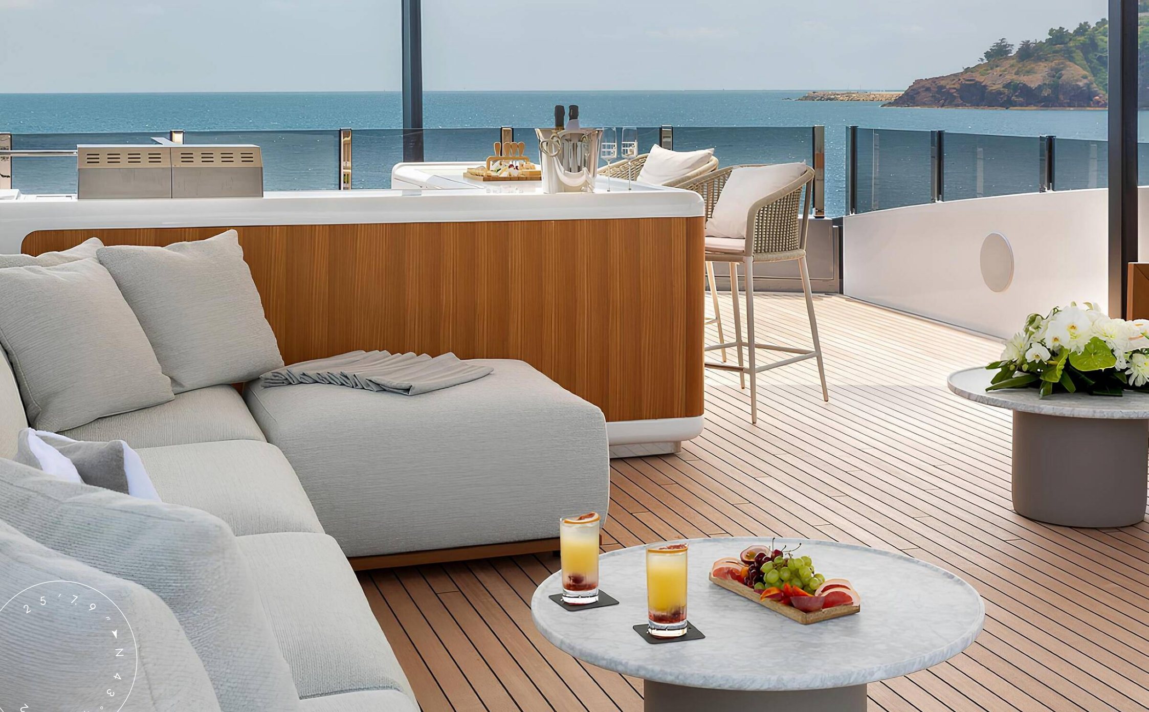
SUNDECK LOUNGE AREA