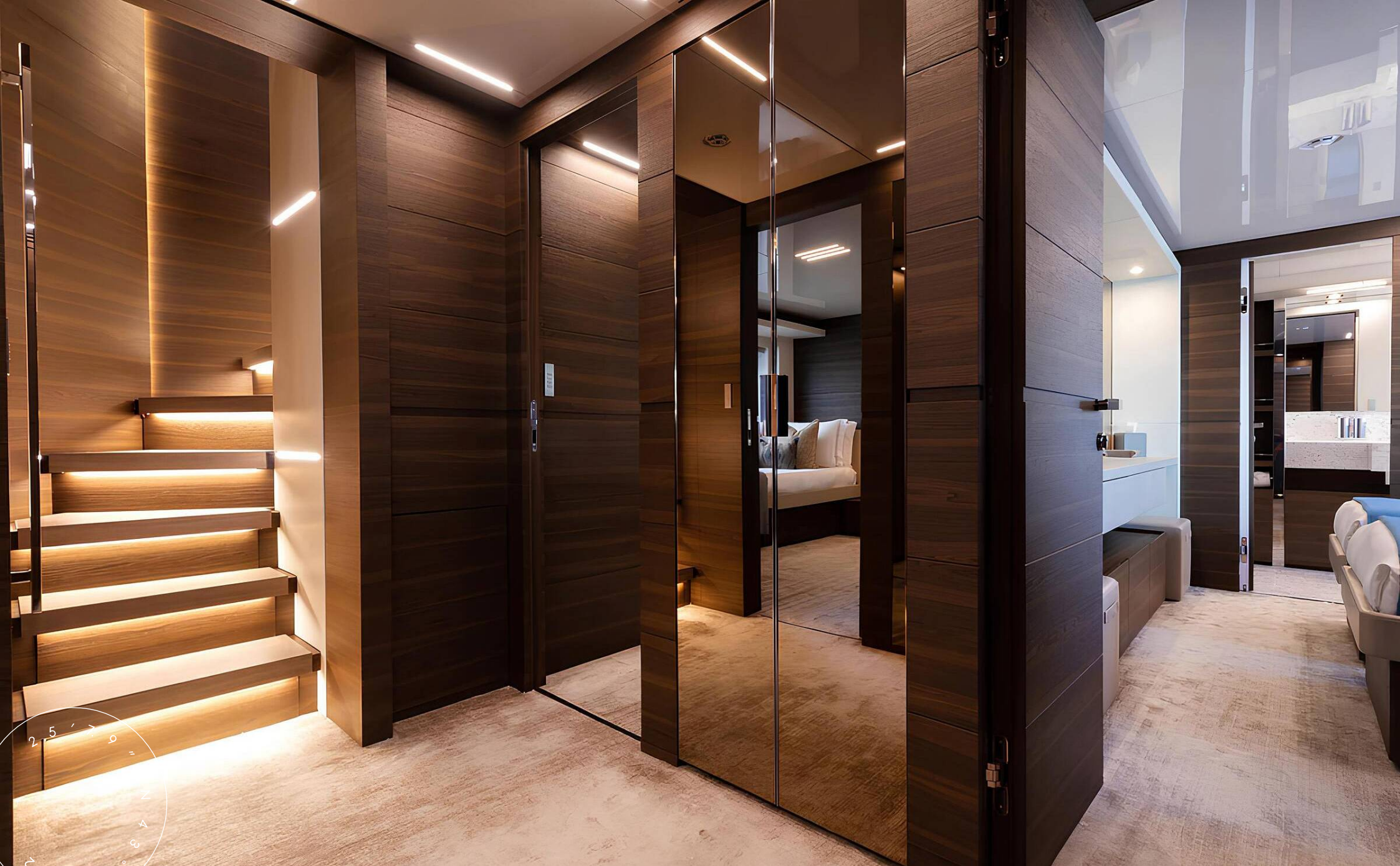
LOWER DECK LOBBY