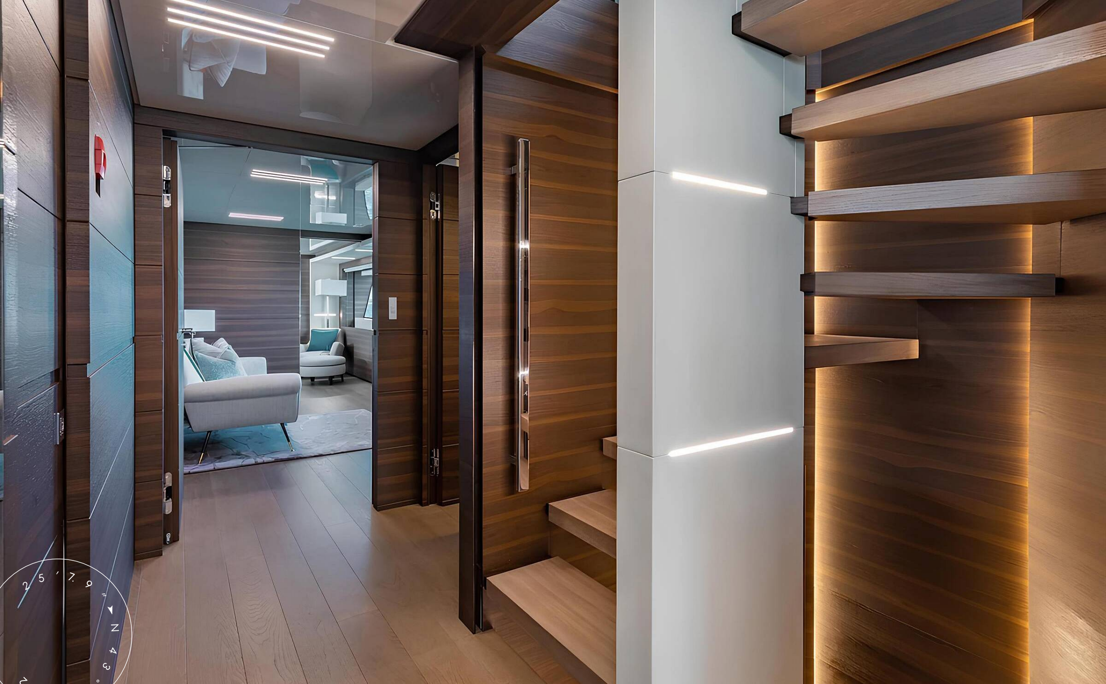
MASTER CABIN DRESSING ROOM