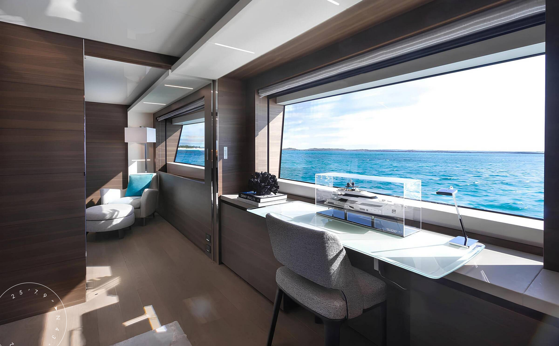
OFFICE IN THE MASTER CABIN