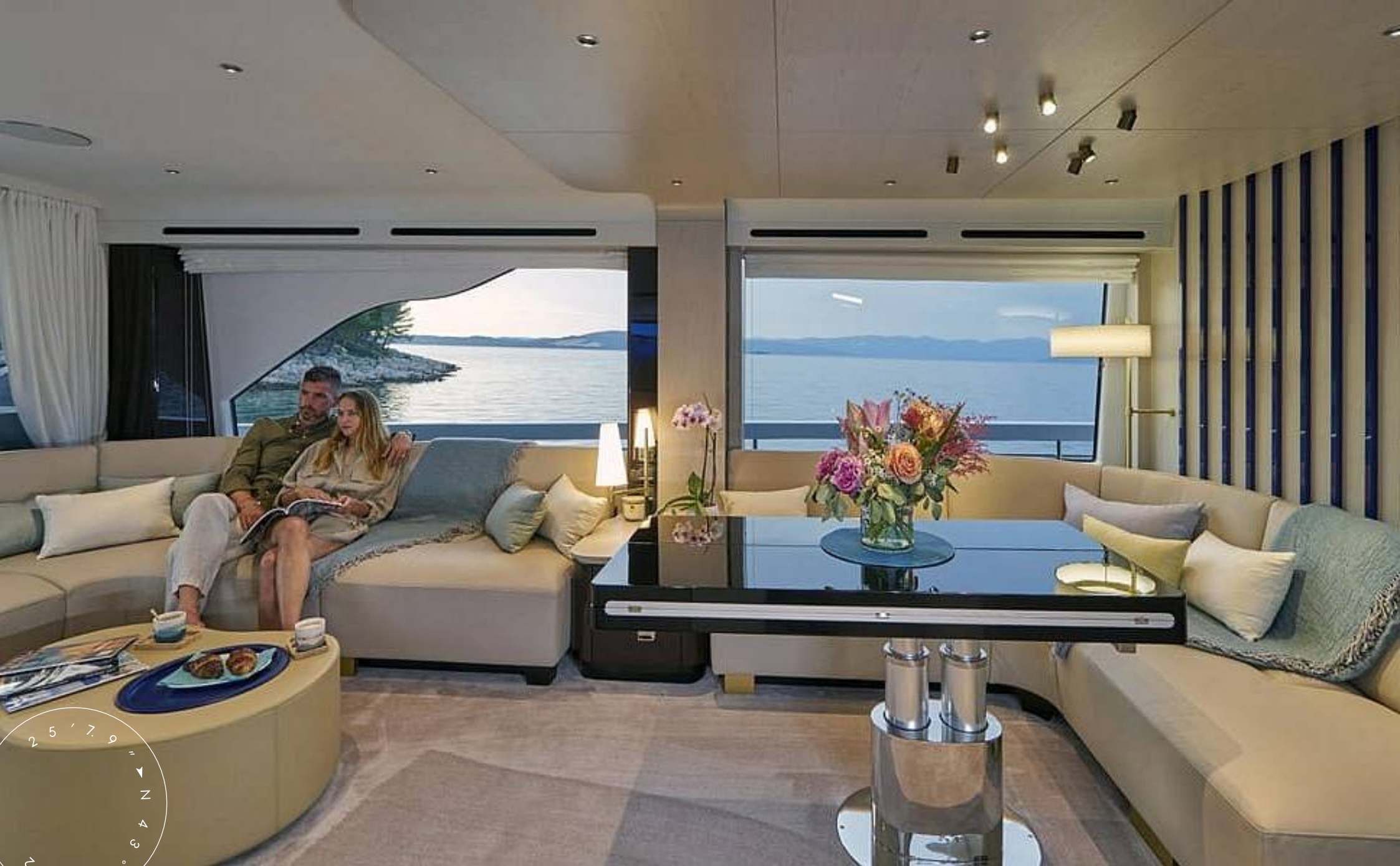
LOUNGE AREA IN THE MAIN SALON