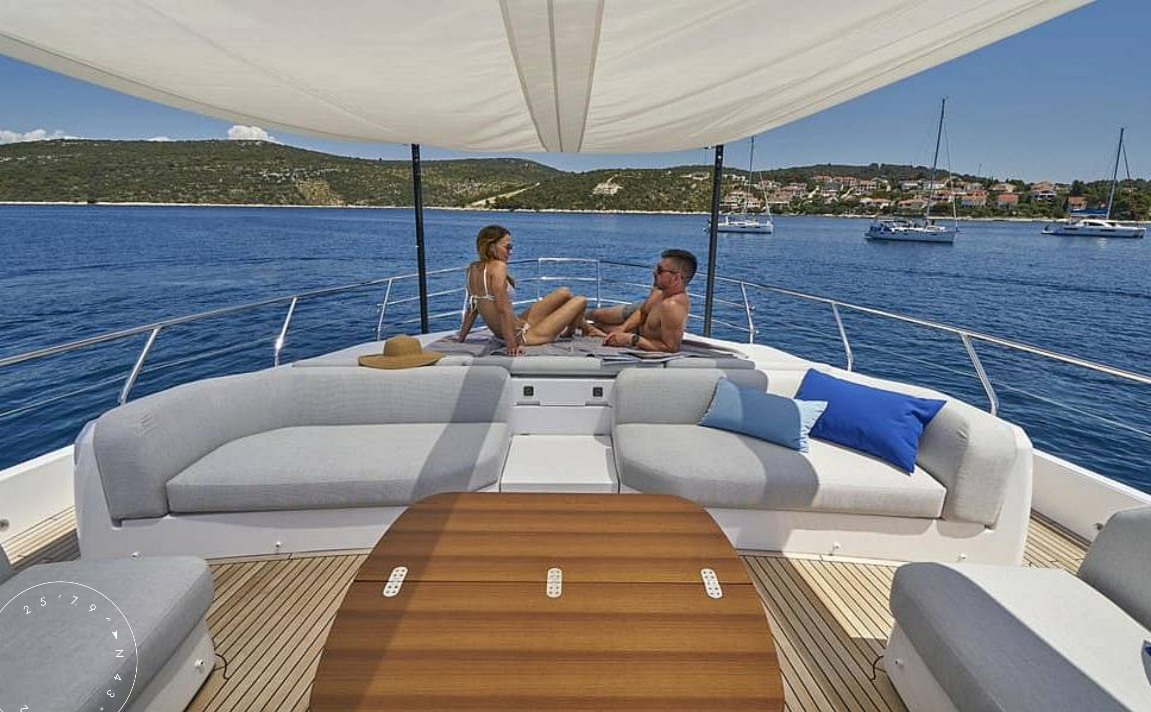
LOUNGE AREA ON THE FOREDECK