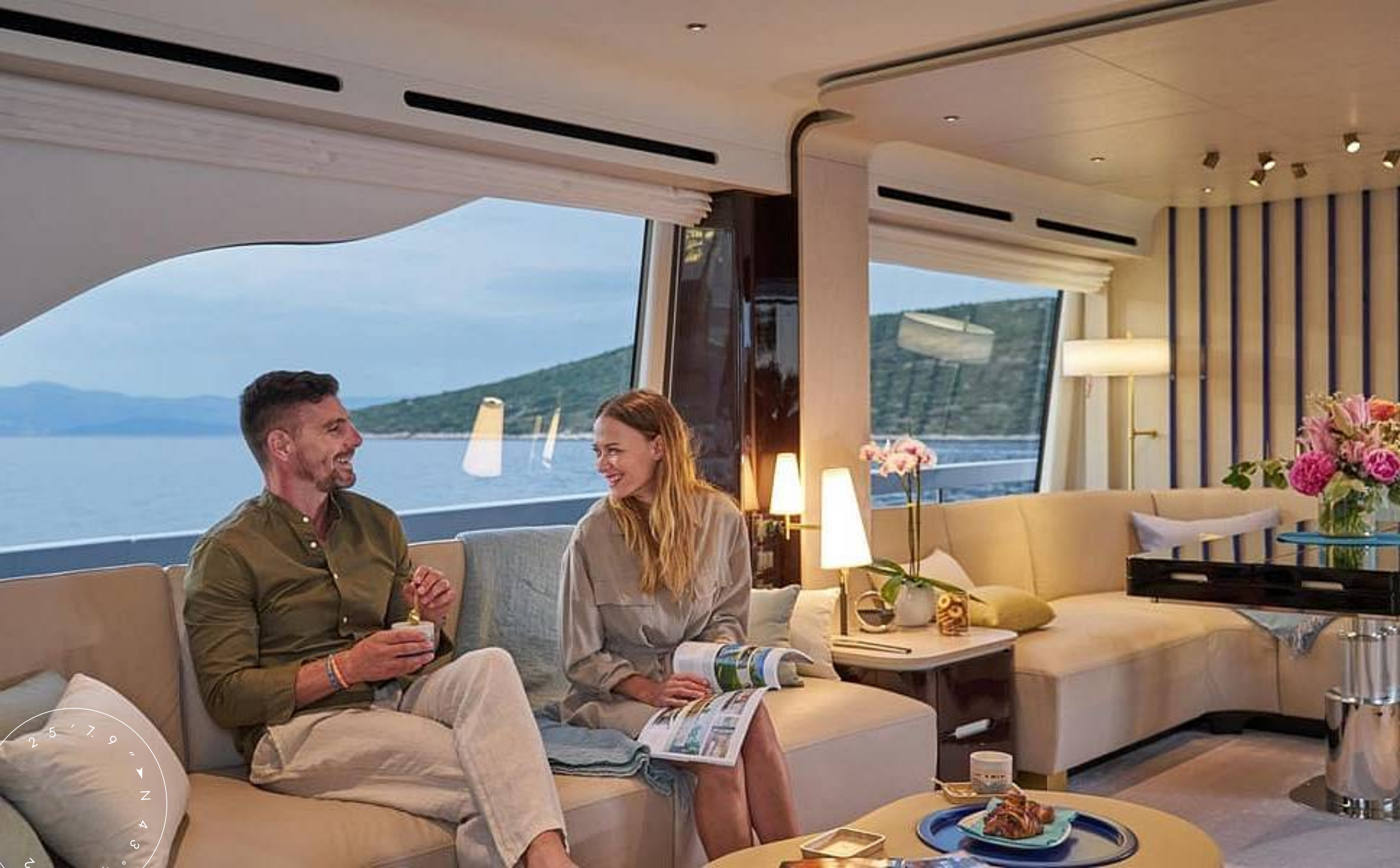
LOUNGE AREA IN THE MAIN SALON