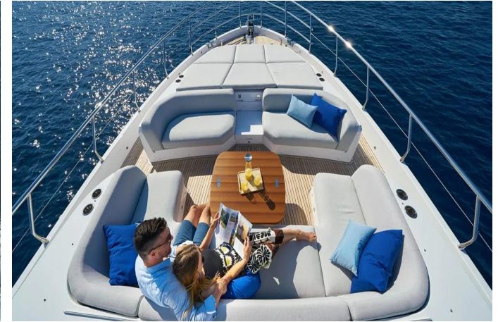
Opening skylight on the flybridge