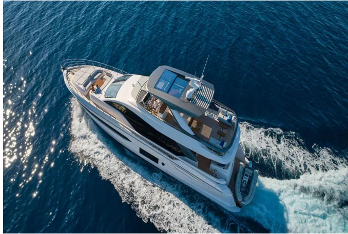
Hydraulic swim platform and Seakeeper for maximum comfort at anchor and underway