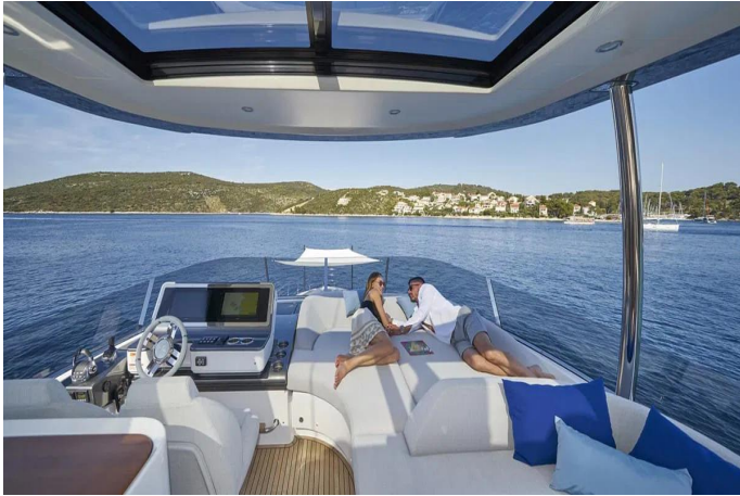
Comfortable sunbathing area on the foredeck with large sunbeds