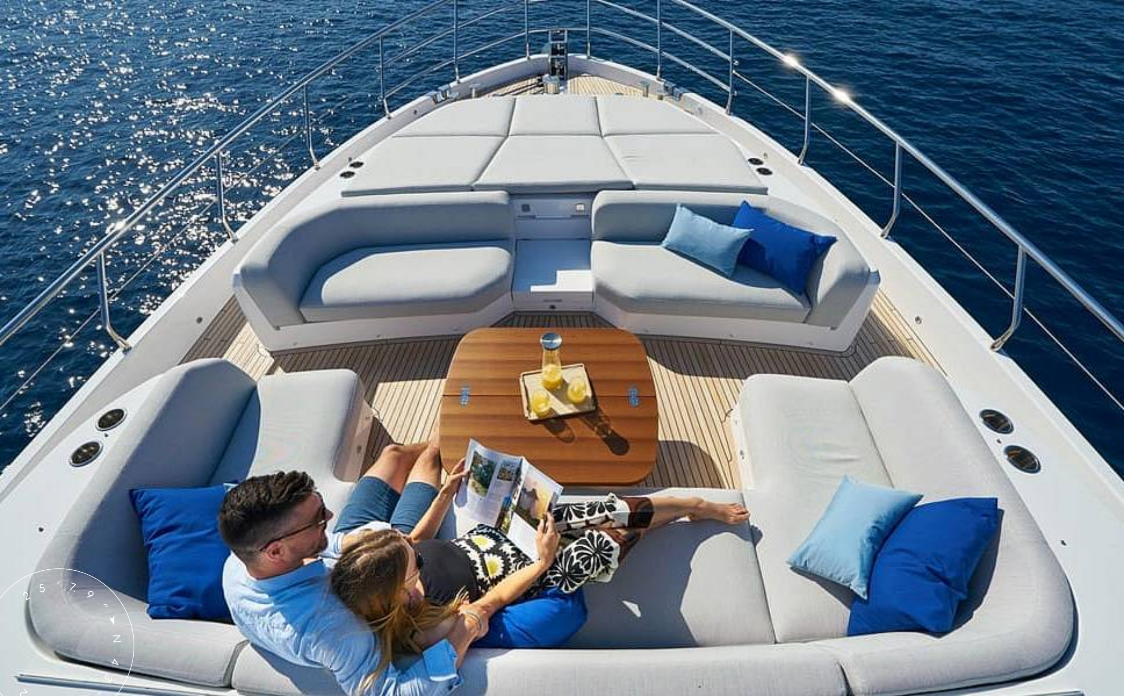
LOUNGE AREA ON THE FOREDECK