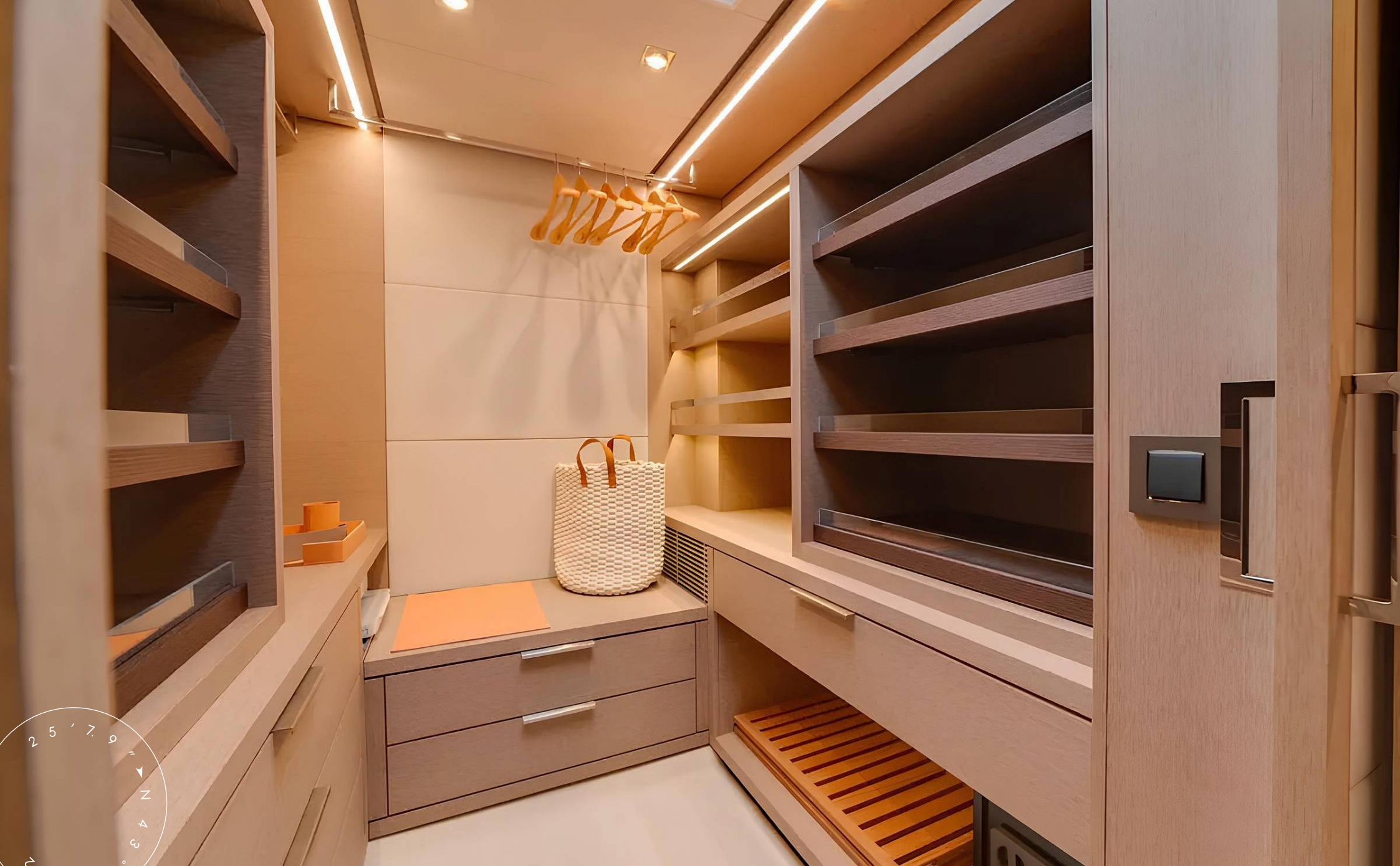
MASTER CABIN DRESSING ROOM