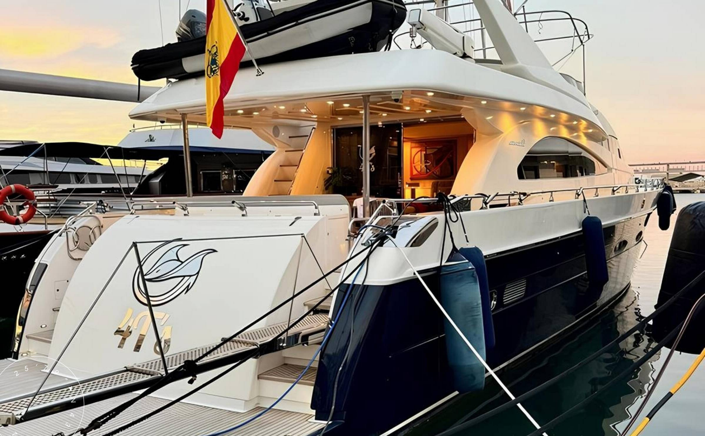
EXTERIOR ASTONDOA 82 GLX 2002 MY 4T'S