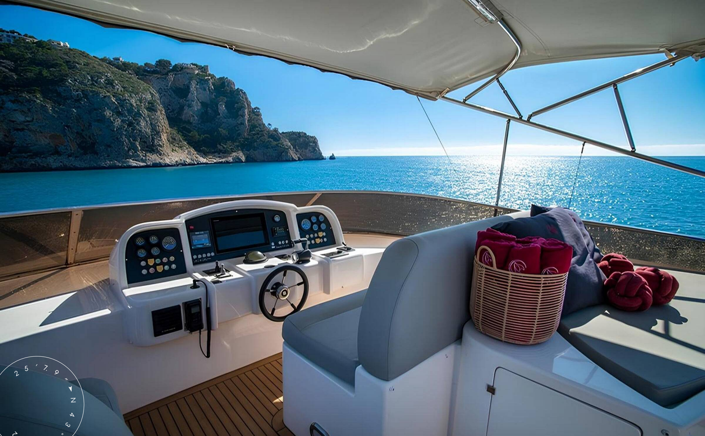
SECOND HELM STATION