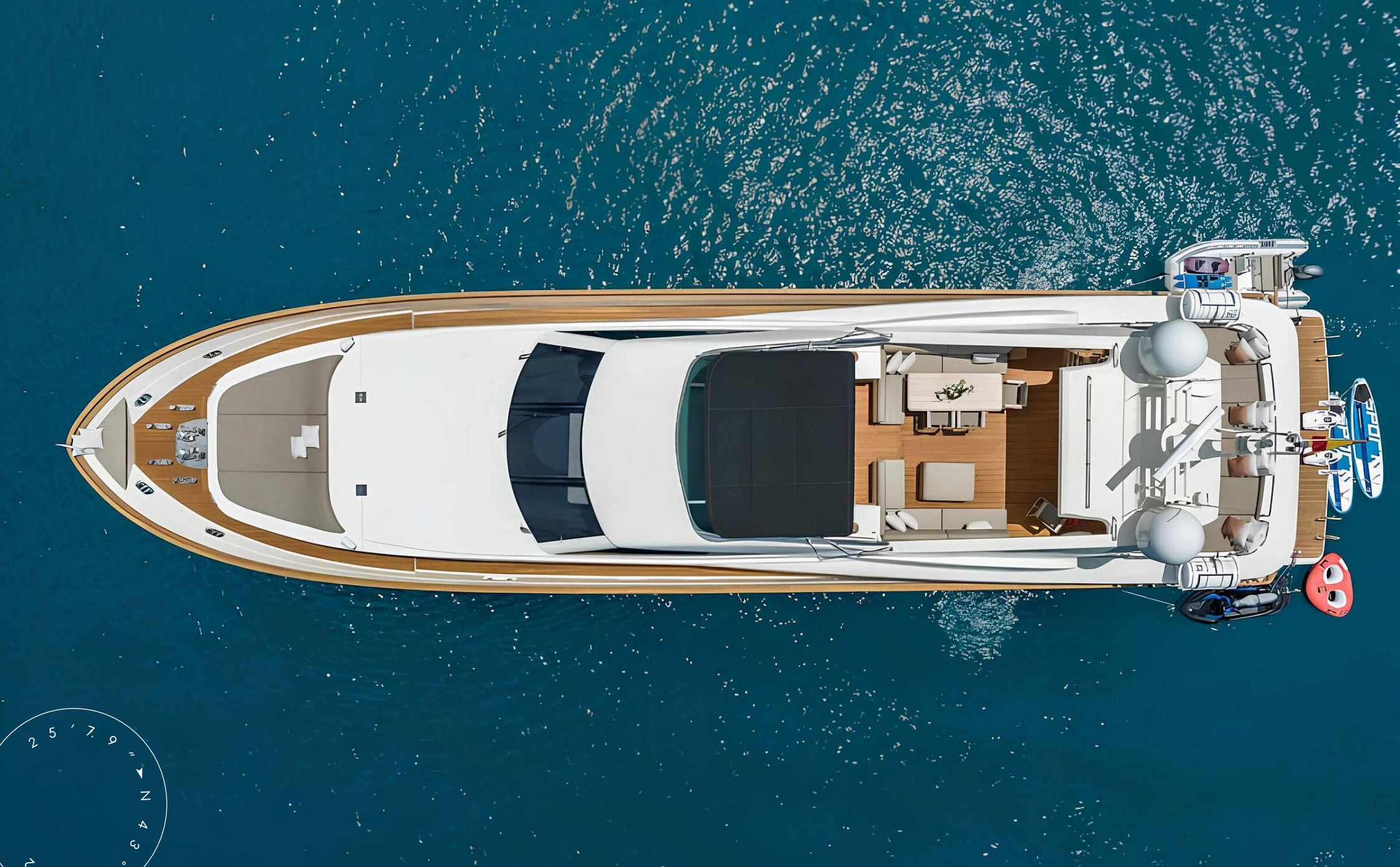
EXTERIOR ASTONDOA 102 GLX 2005 MY B4