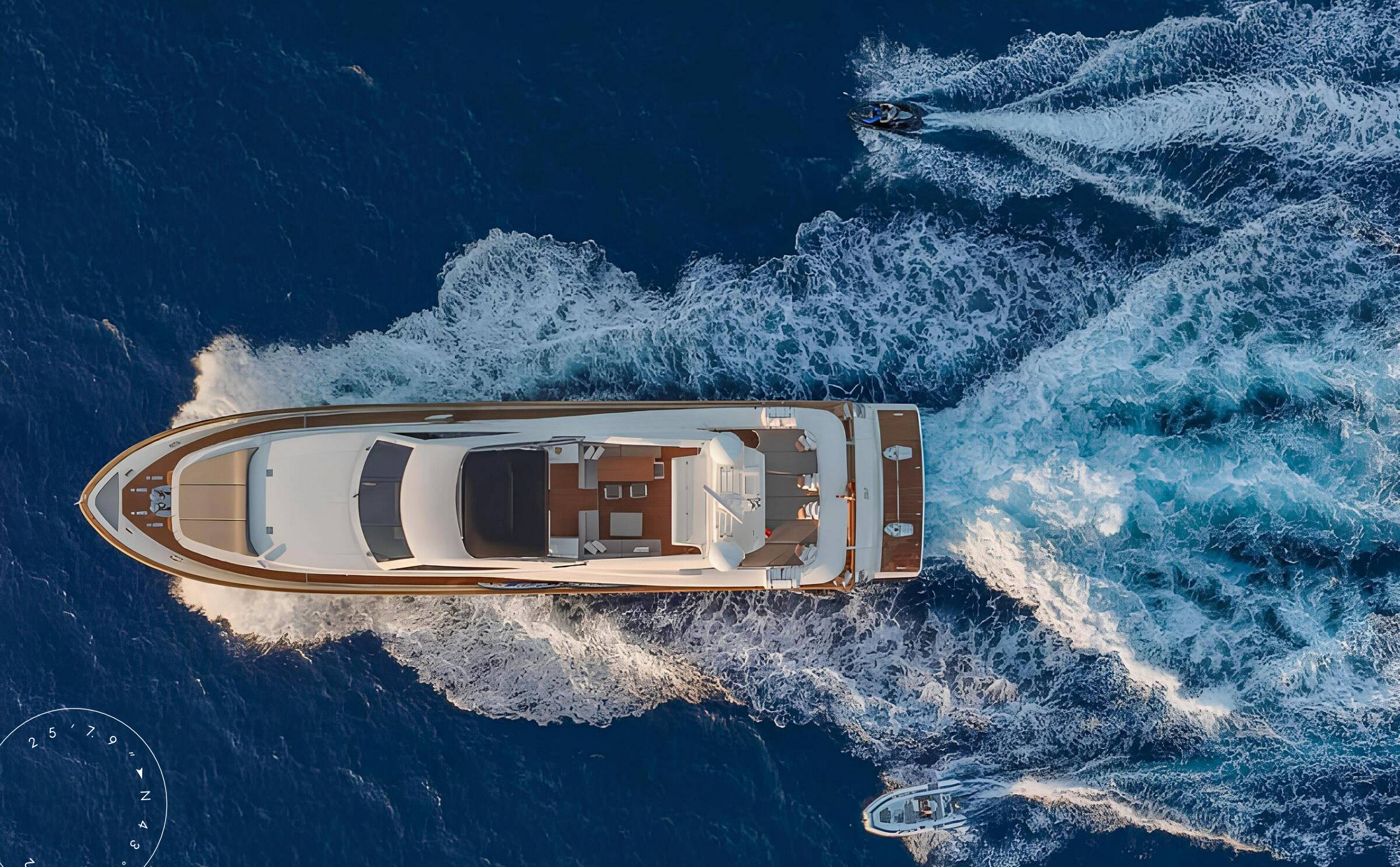
EXTERIOR ASTONDOA 102 GLX 2005 MY B4