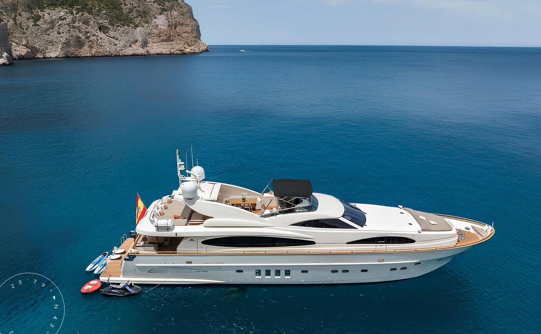
EXTERIOR ASTONDOA 102 GLX 2005 MY B4