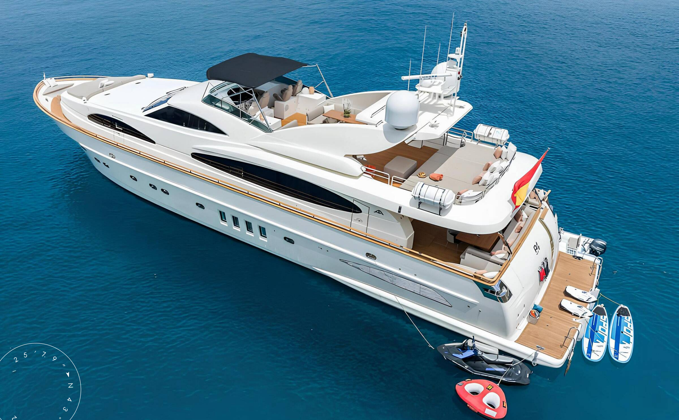
EXTERIOR ASTONDOA 102 GLX 2005 MY B4