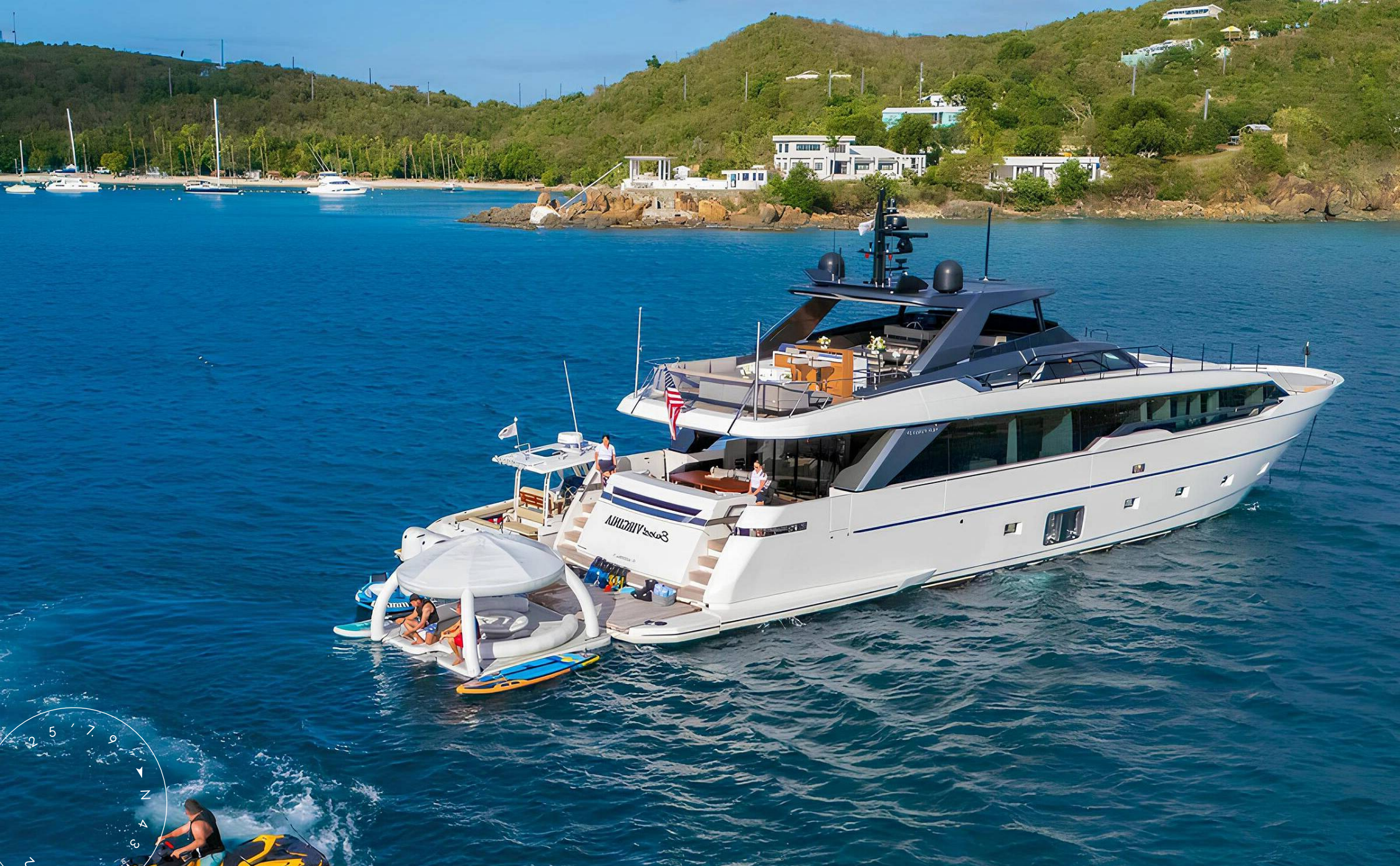
EXTERIOR SANLORENZO SL96A 2022 MY SWEET VIRGINIA