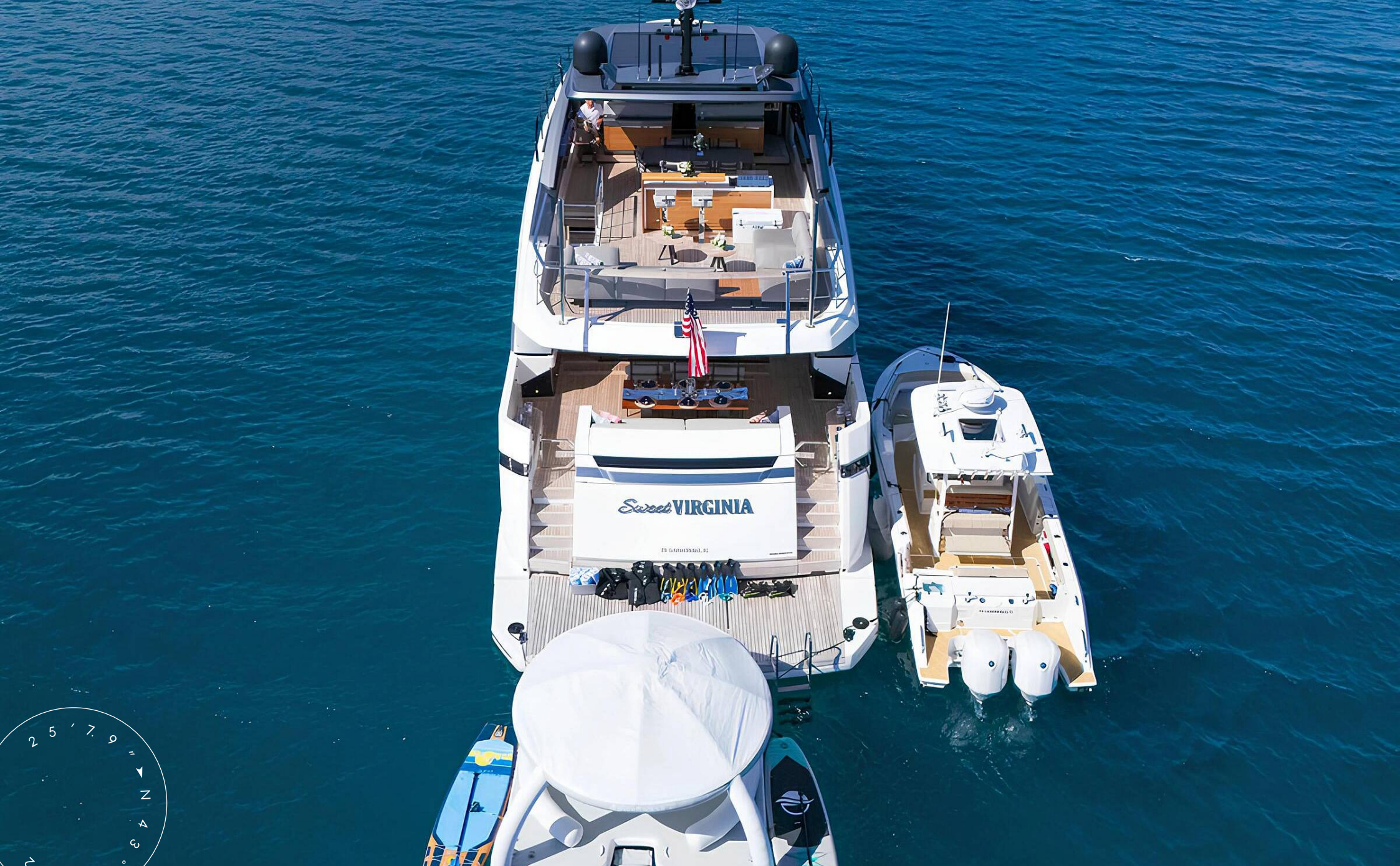
EXTERIOR SANLORENZO SL96A 2022 MY SWEET VIRGINIA