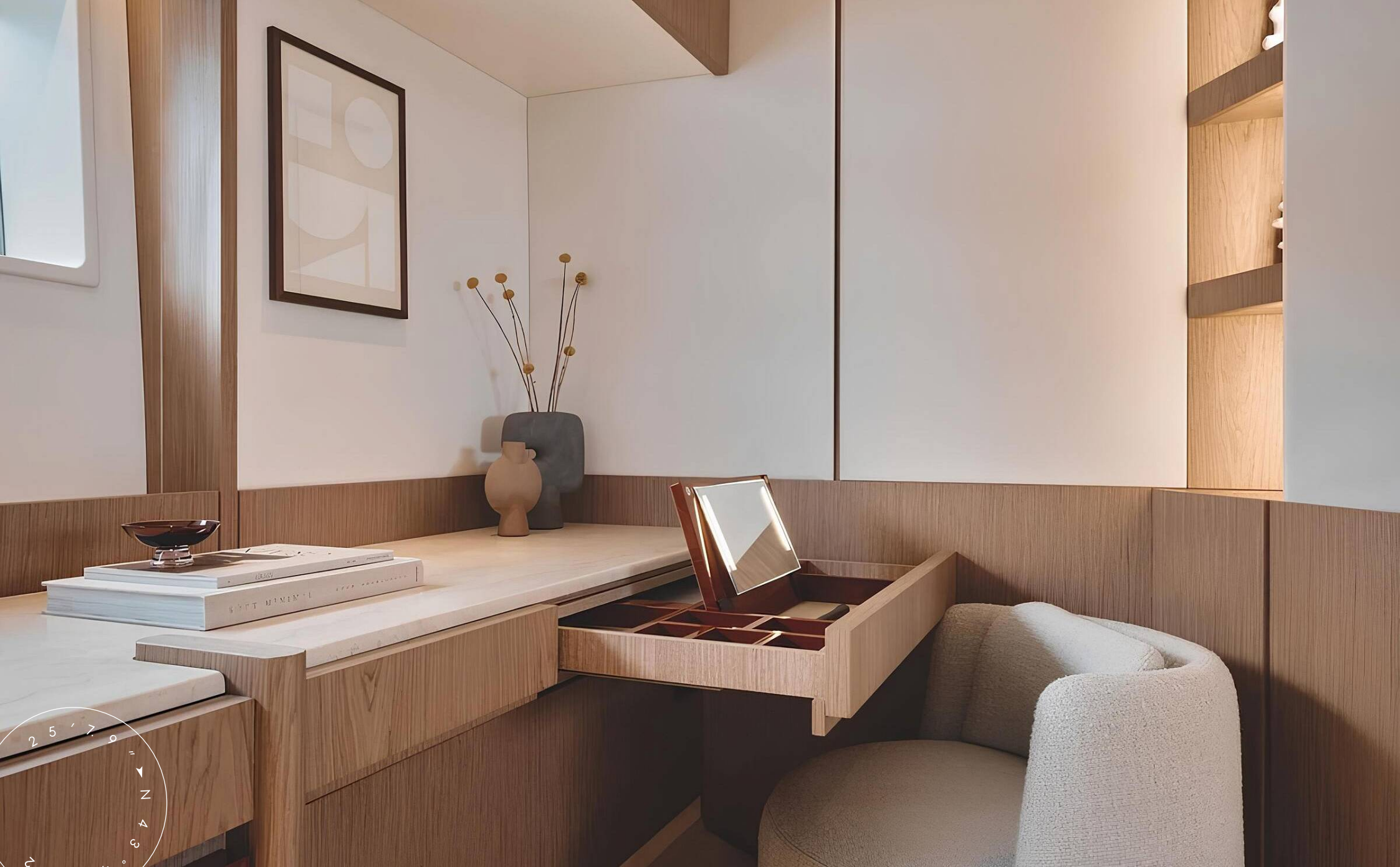
MAKE-UP TABLE IN MASTER CABIN