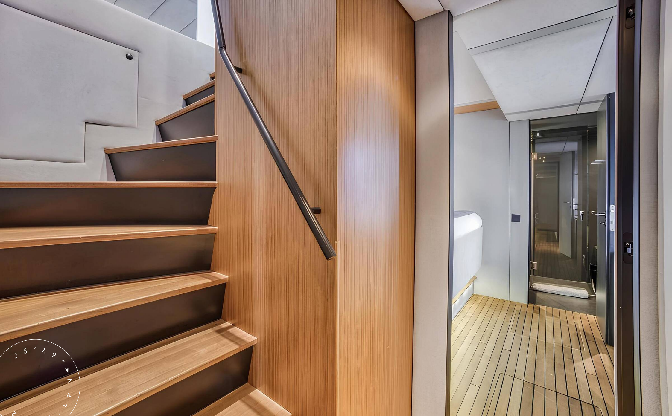
STAIRS FROM MD TO LD