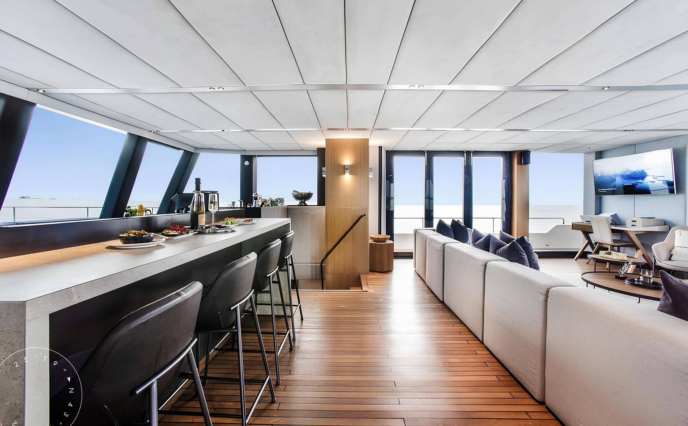
MAIN SALON BAR