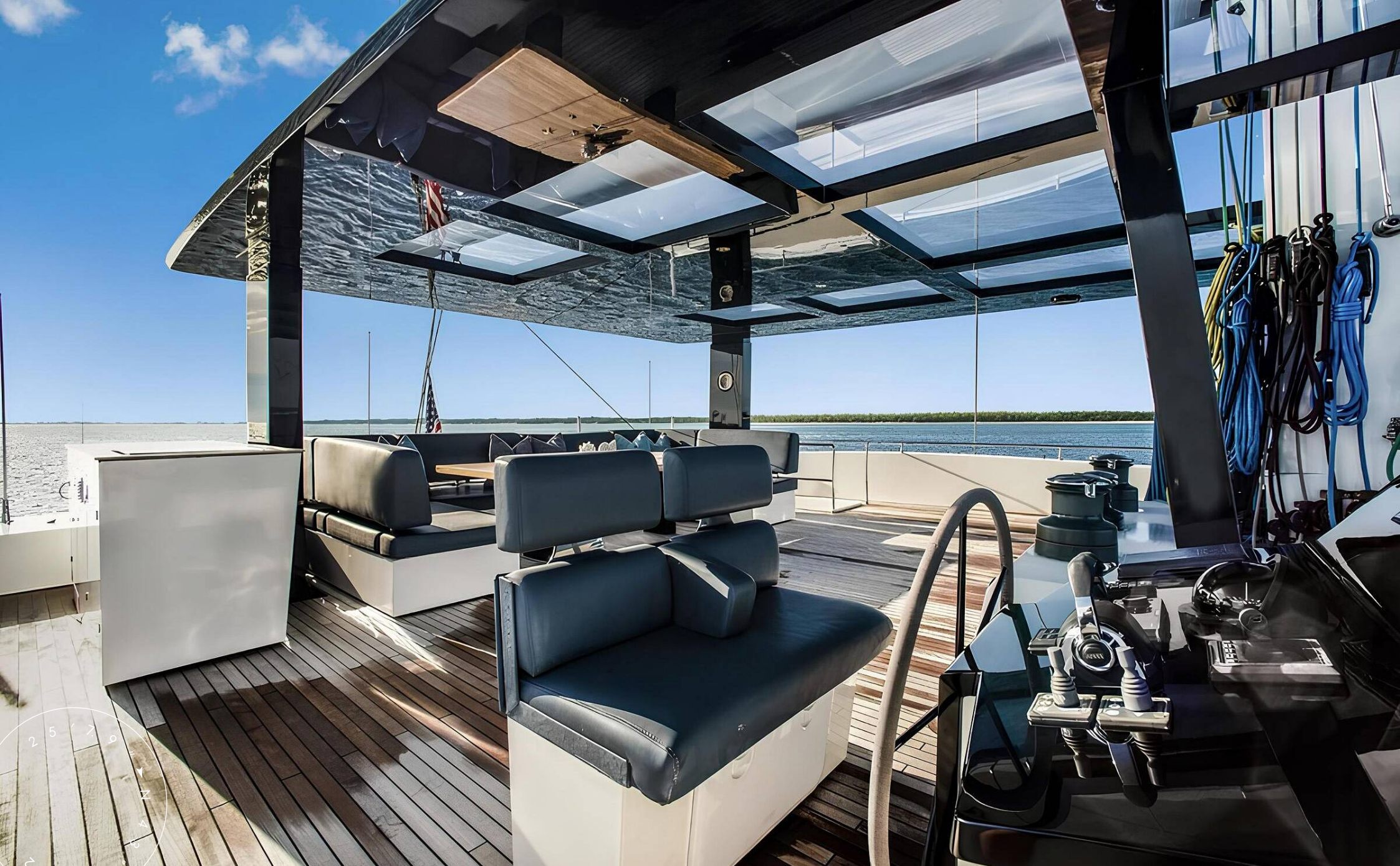
SECOND HELM STATION