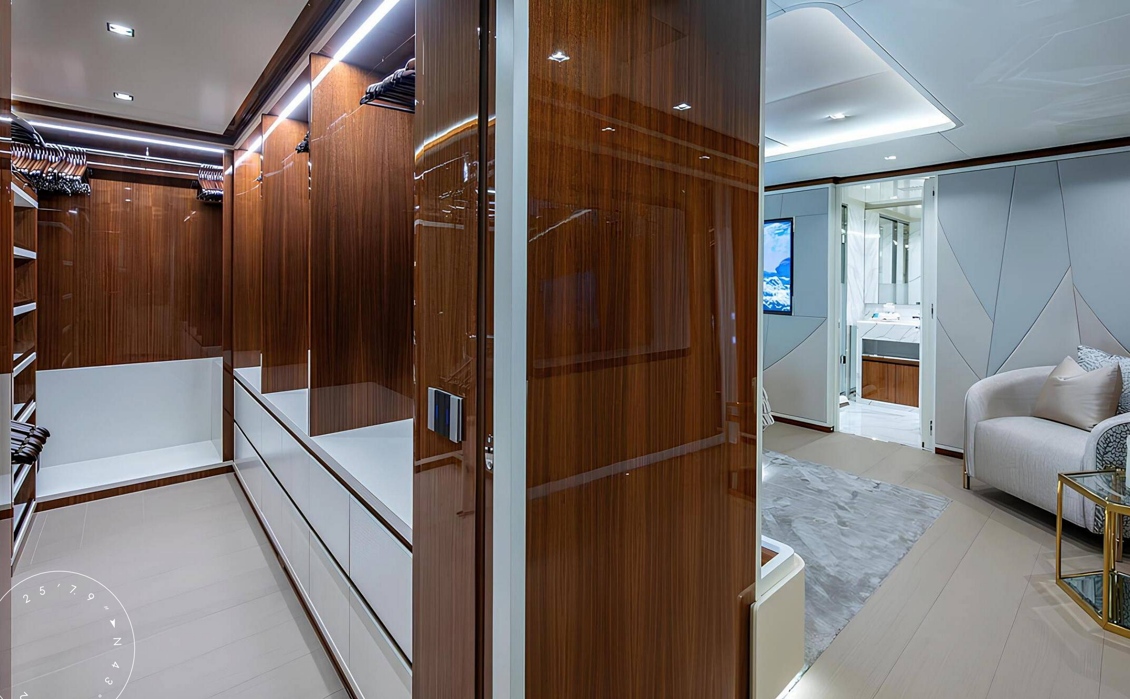
MASTER CABIN DRESSING ROOM