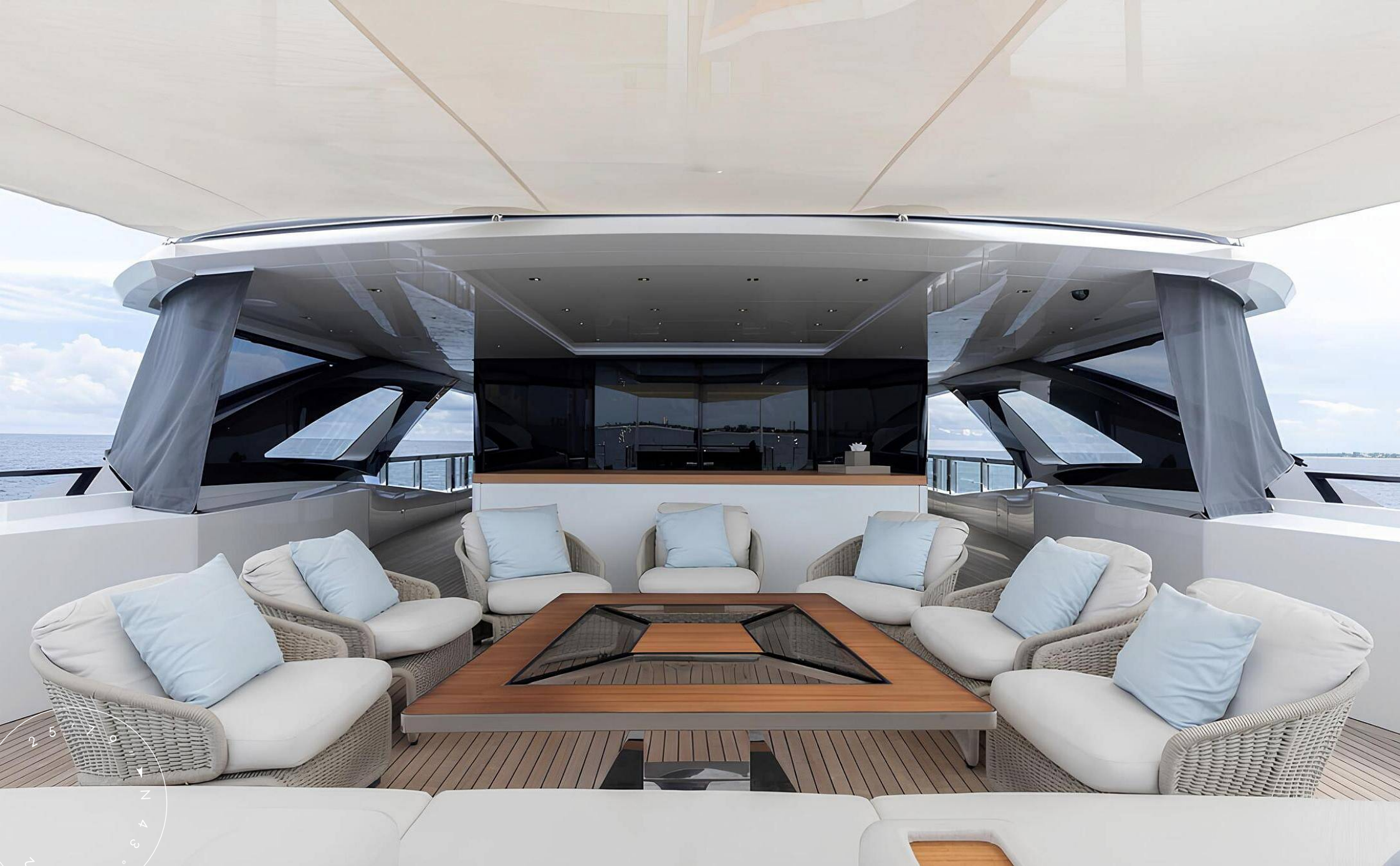
UPPER DECK LOUNGE AREA