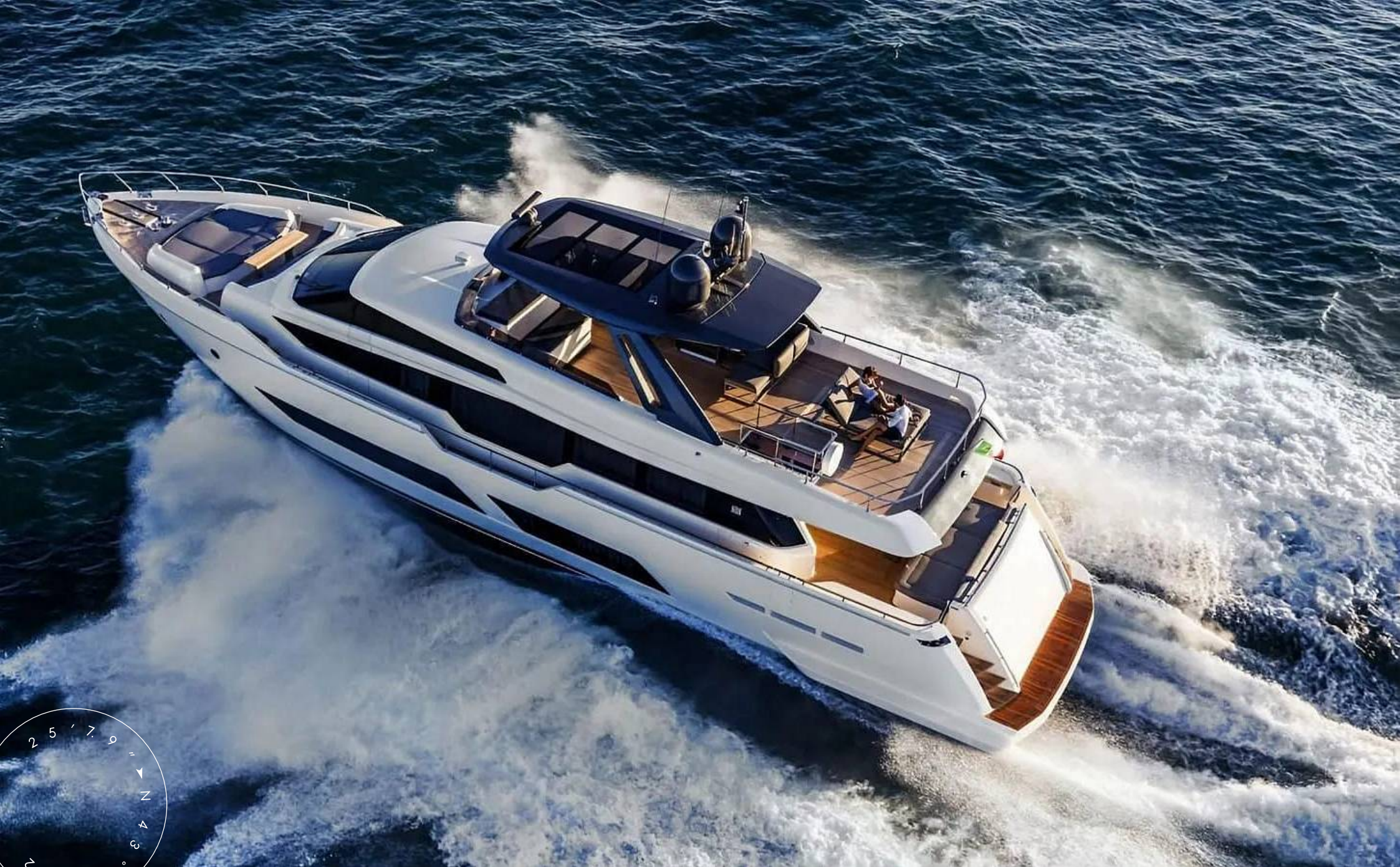
EXTERIOR FERRETTI 850 2019 MY E3