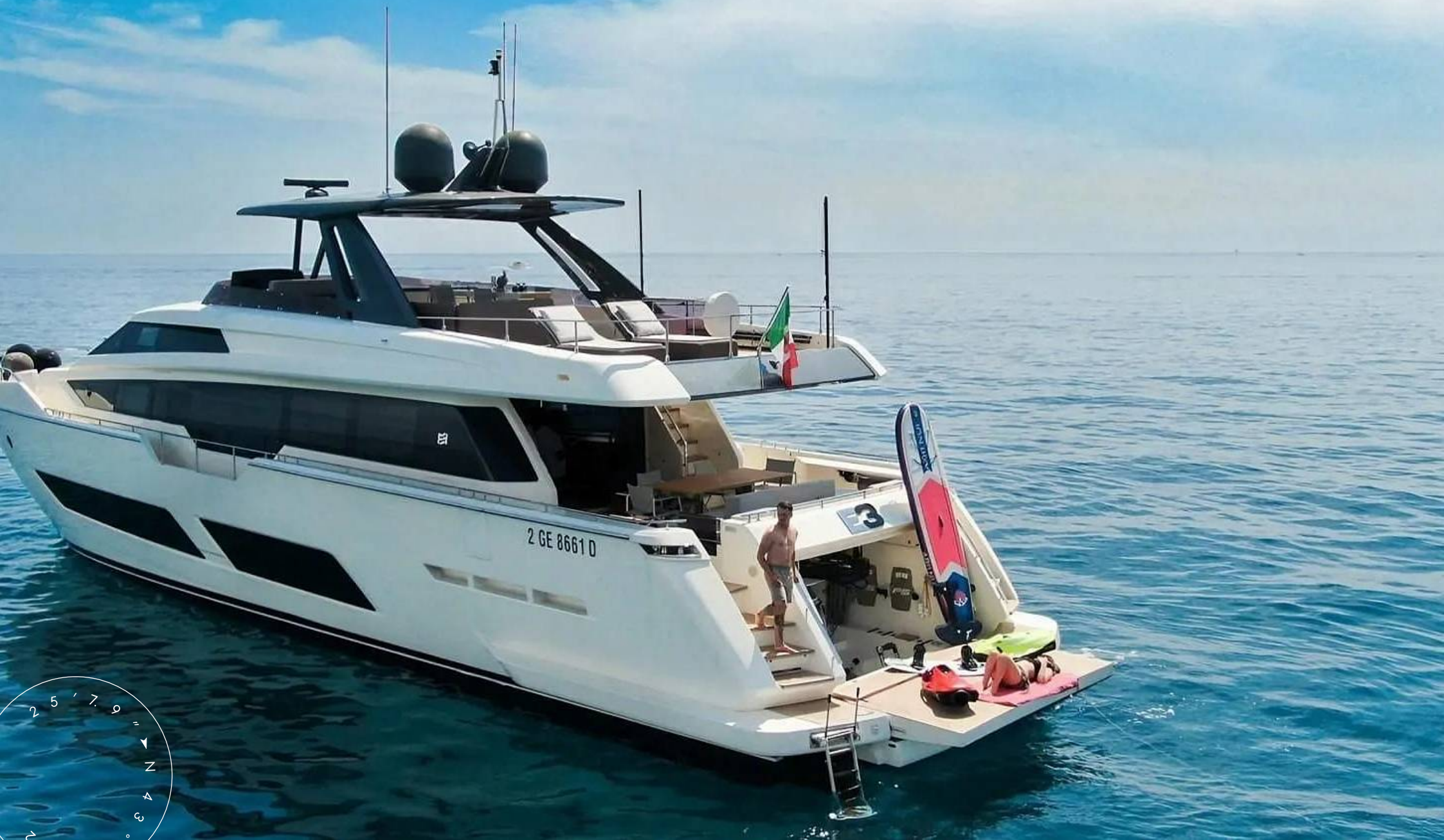
EXTERIOR FERRETTI 850 2019 MY E3