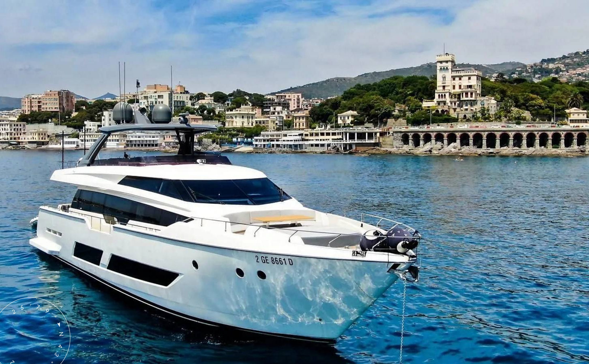
EXTERIOR FERRETTI 850 2019 MY E3