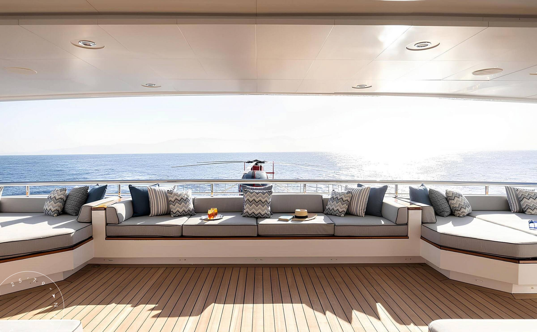
AFT UPPER DECK LOUNGE AREA