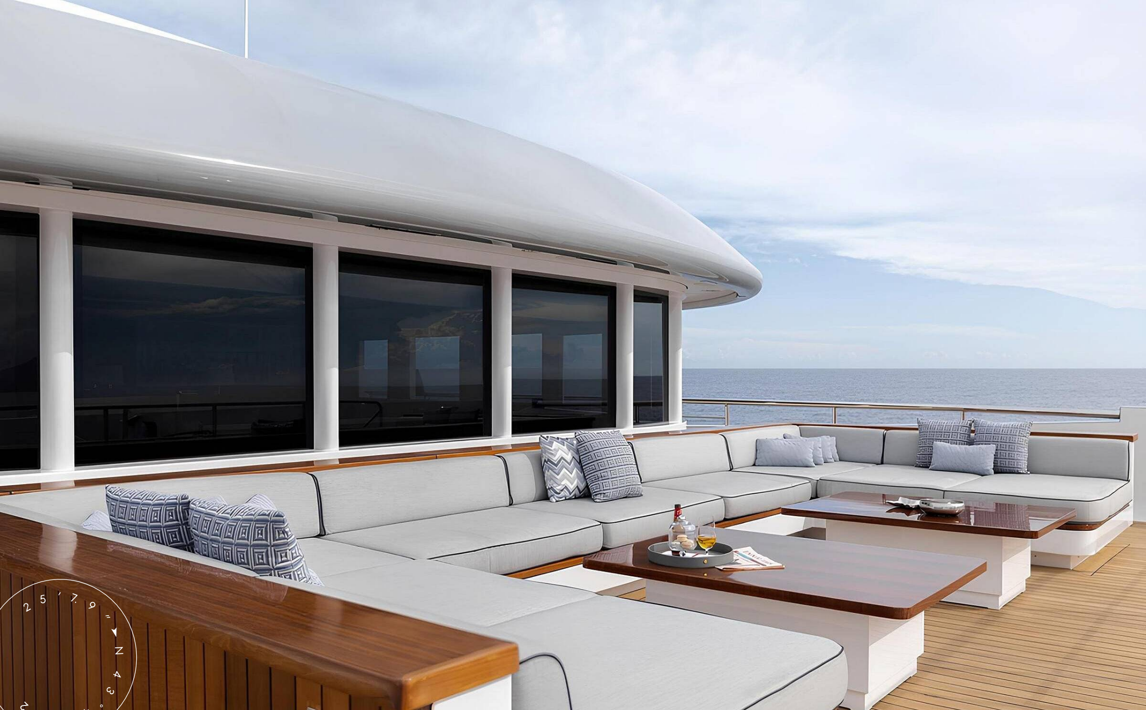
BOW LOUNGE AREA