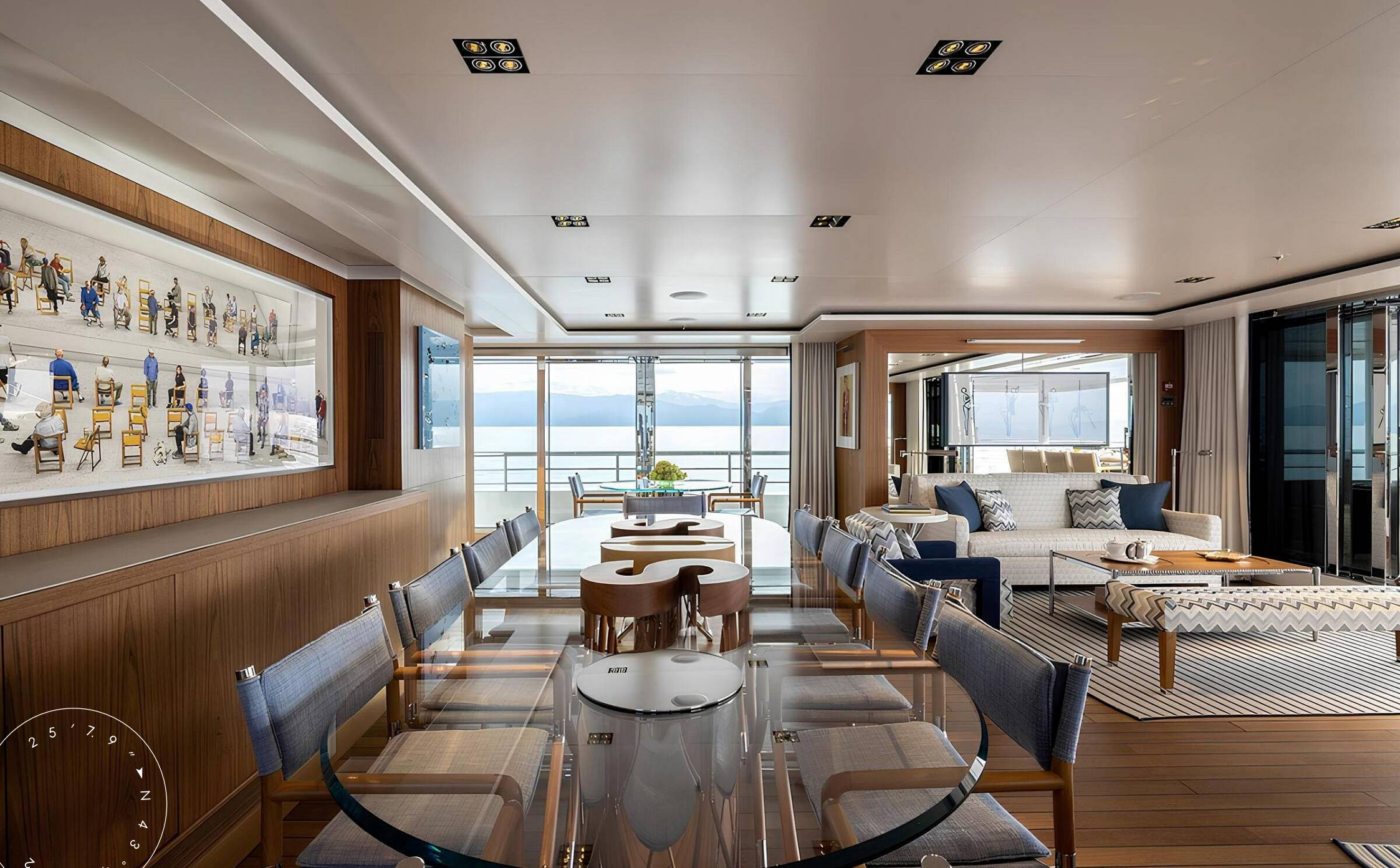
MAIN SALON DINING AREA