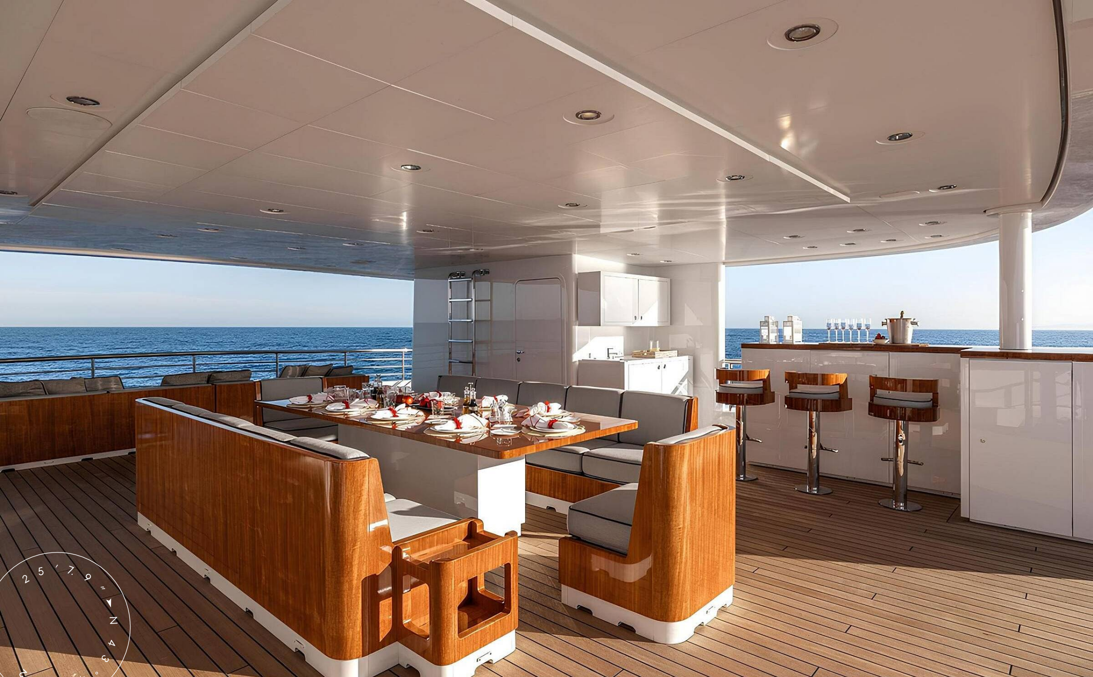
SUNDECK DINING AREA