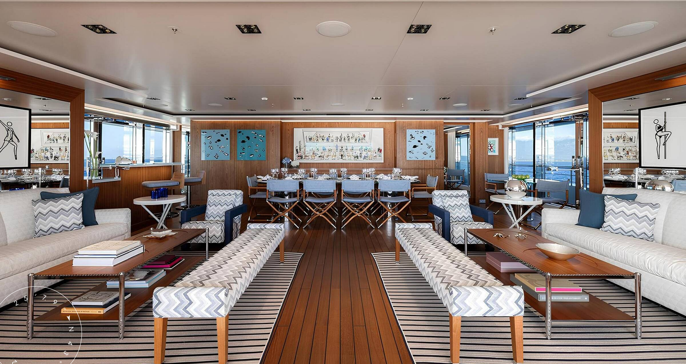
MAIN SALON LOUNGE AREA