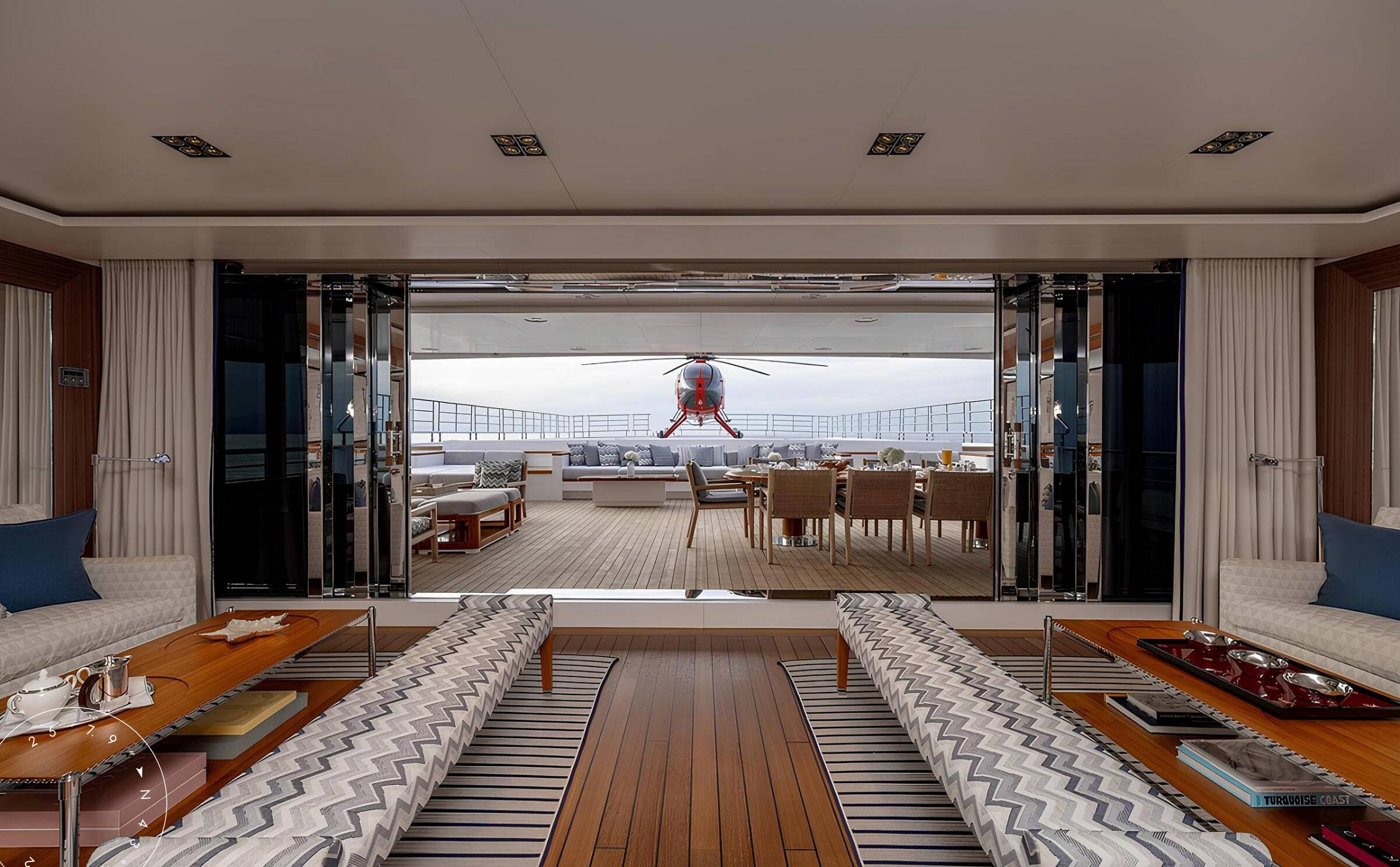
MAIN SALON LOUNGE AREA