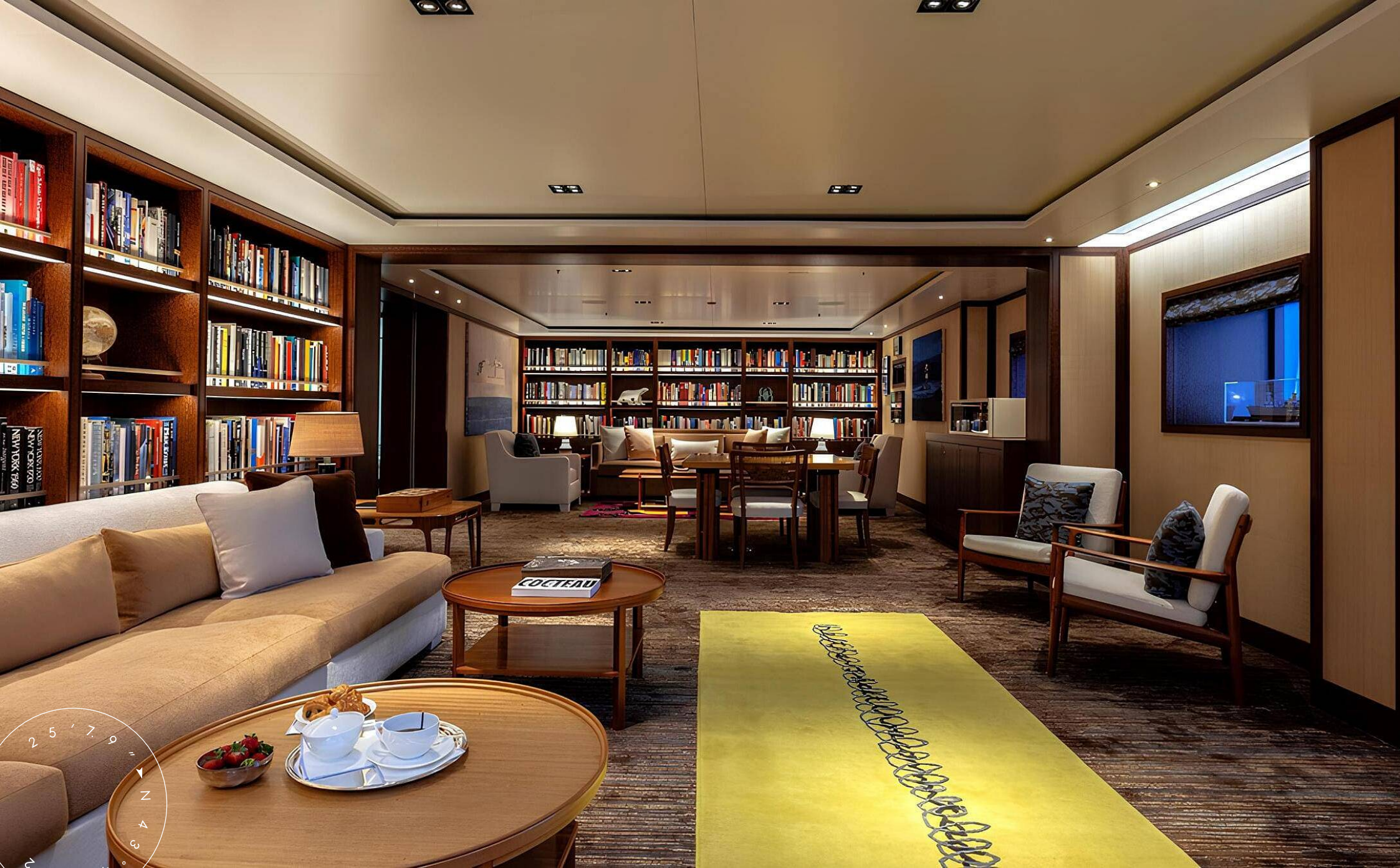
LOWER DECK LOBBY