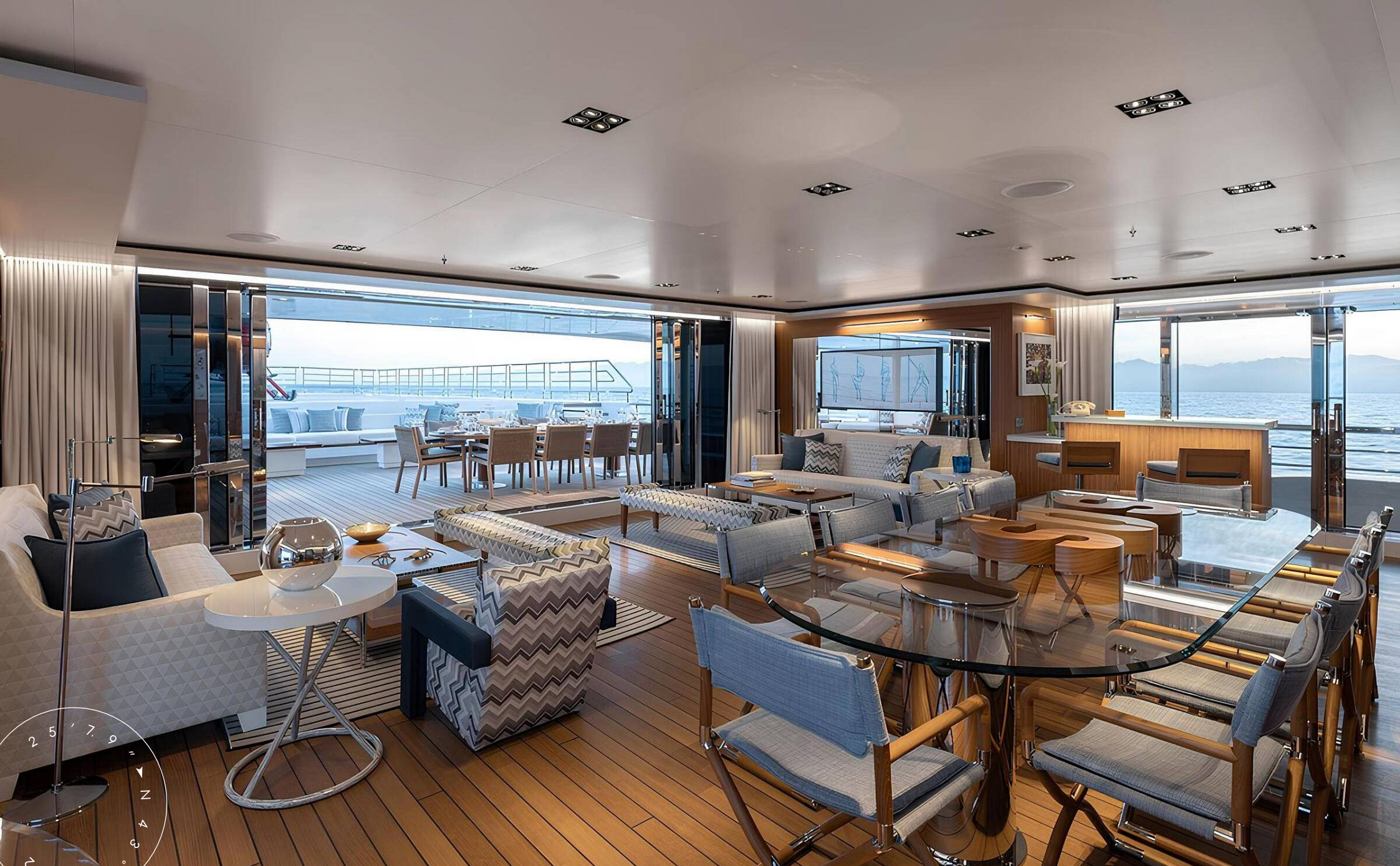
MAIN SALON DINING AREA