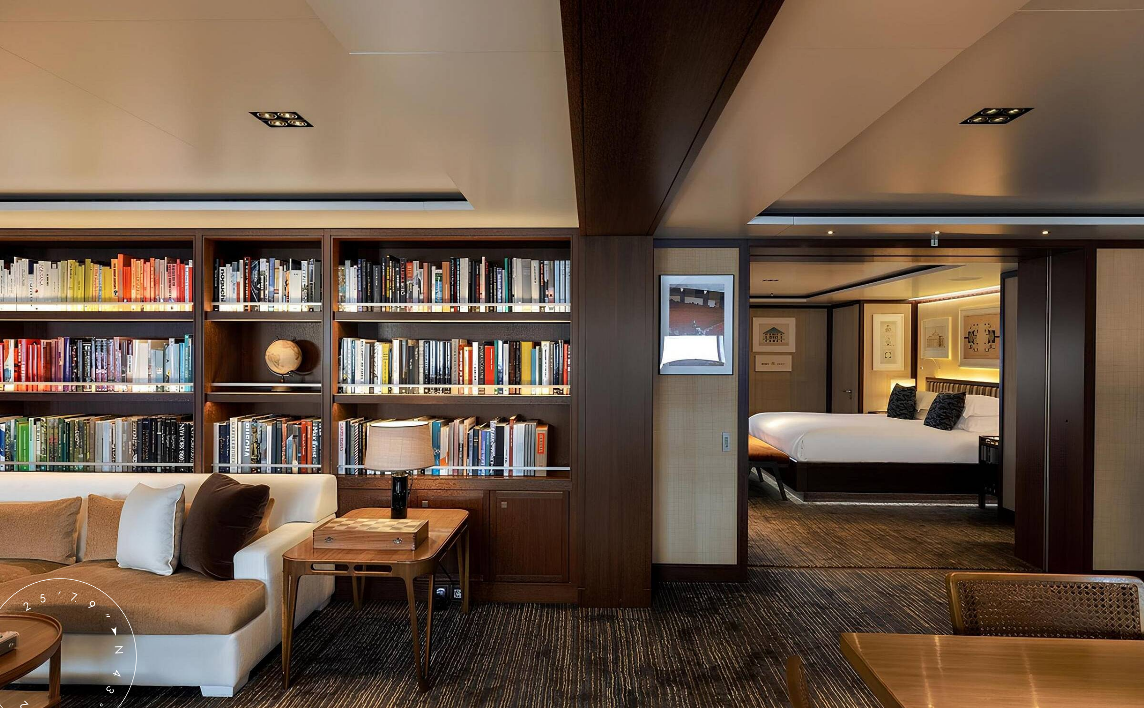
LOWER DECK LOBBY