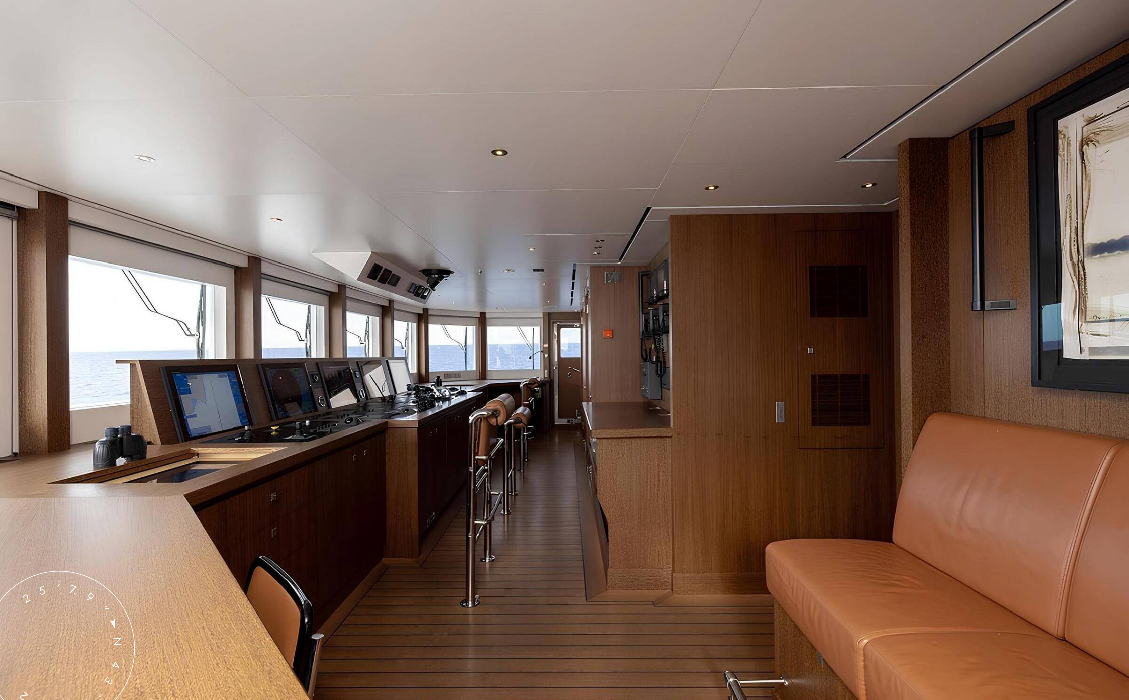
MAIN HELM STATION