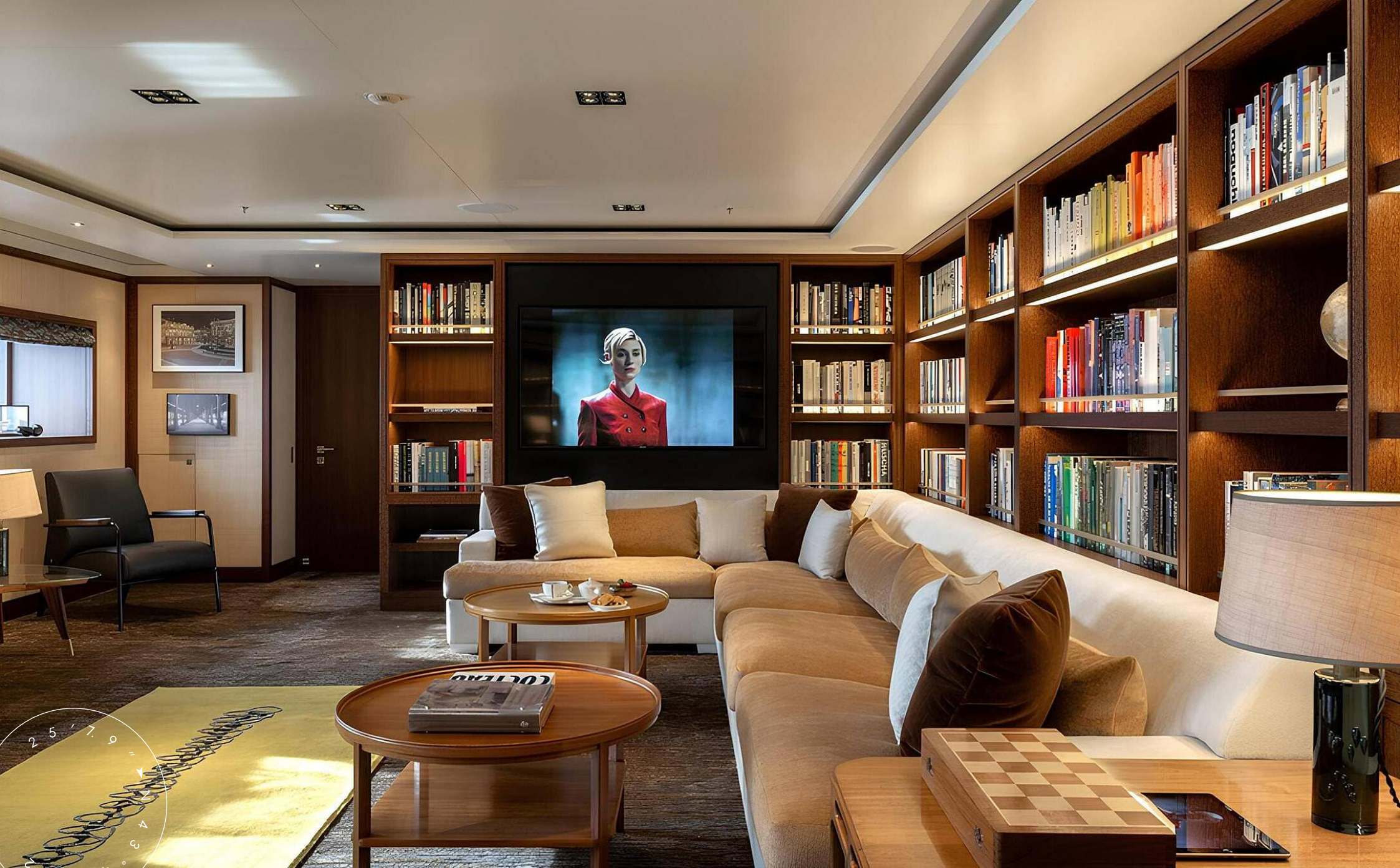
LOWER DECK LOBBY