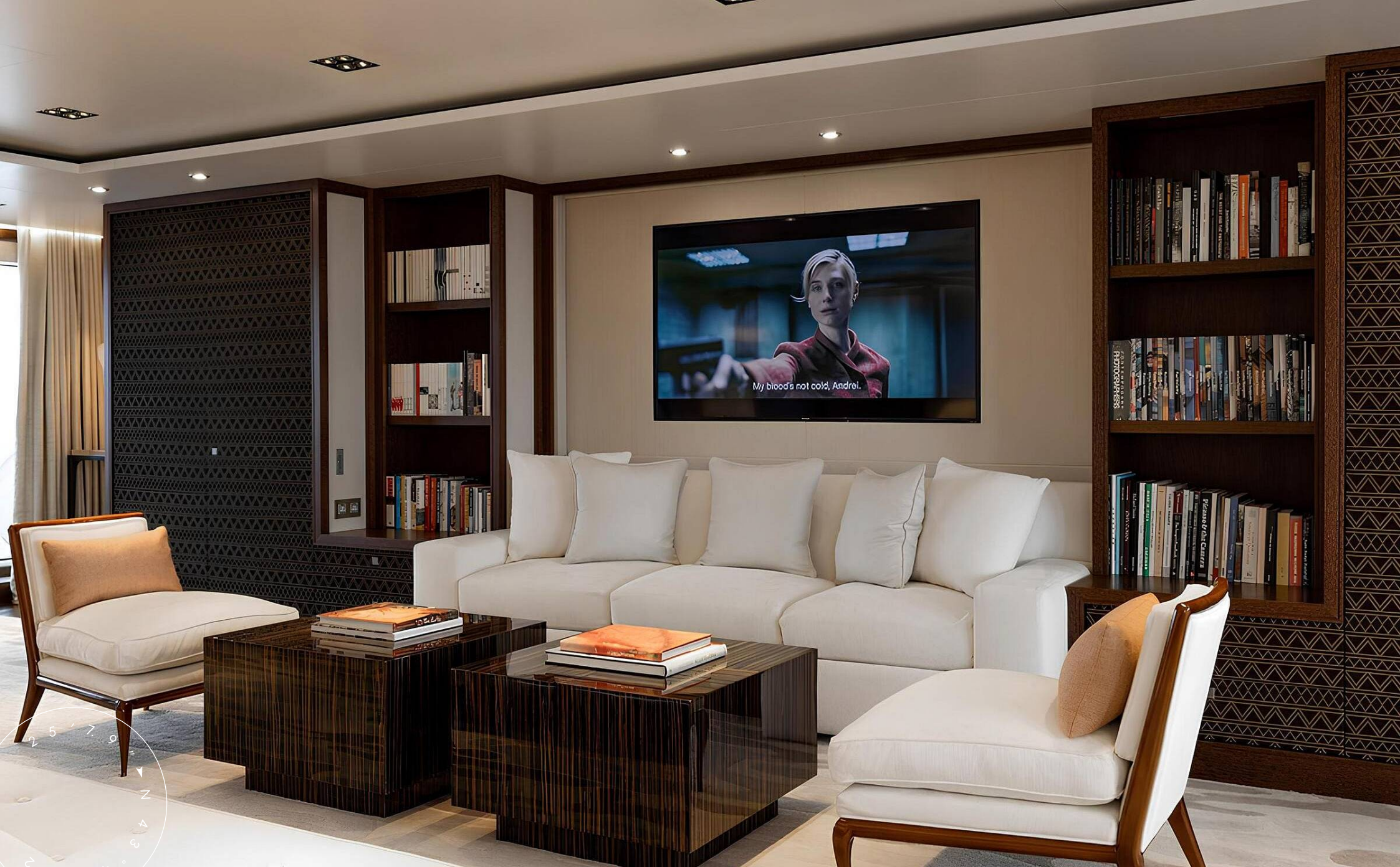
MASTER CABIN LOUNGE AREA