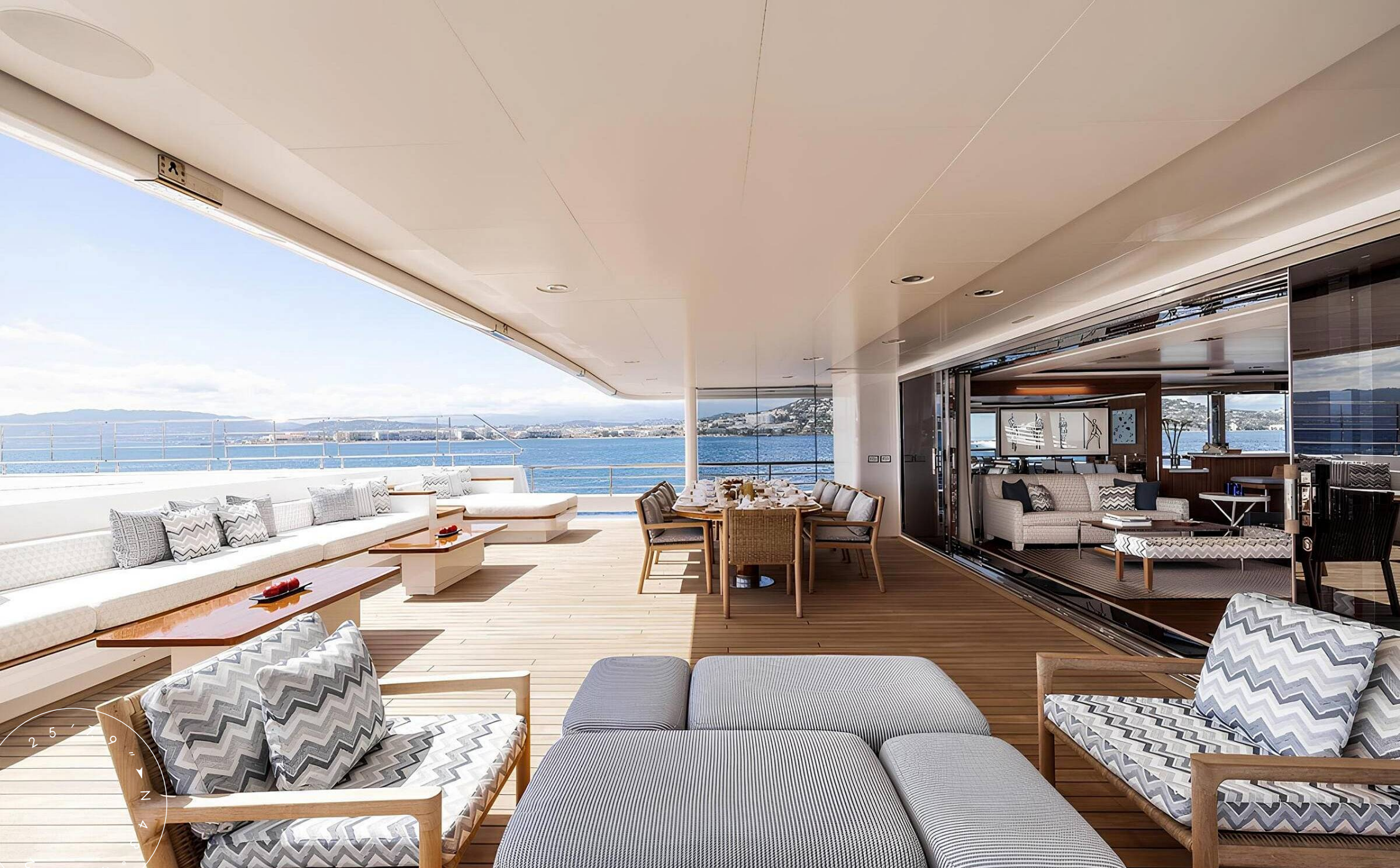
AFT MAIN DECK LOUNGE AREA