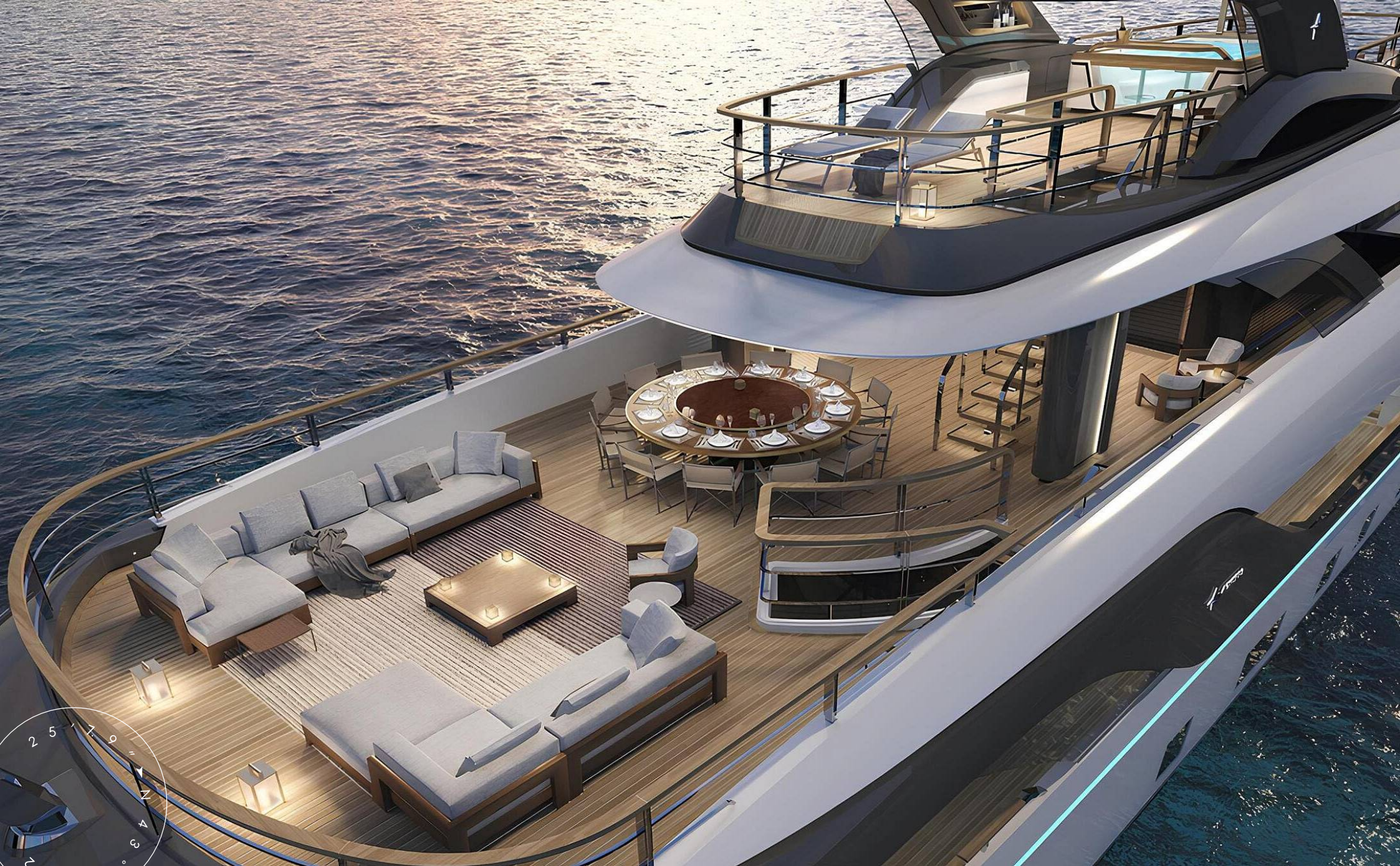
AFT UPPER DECK LOUNGE AREA