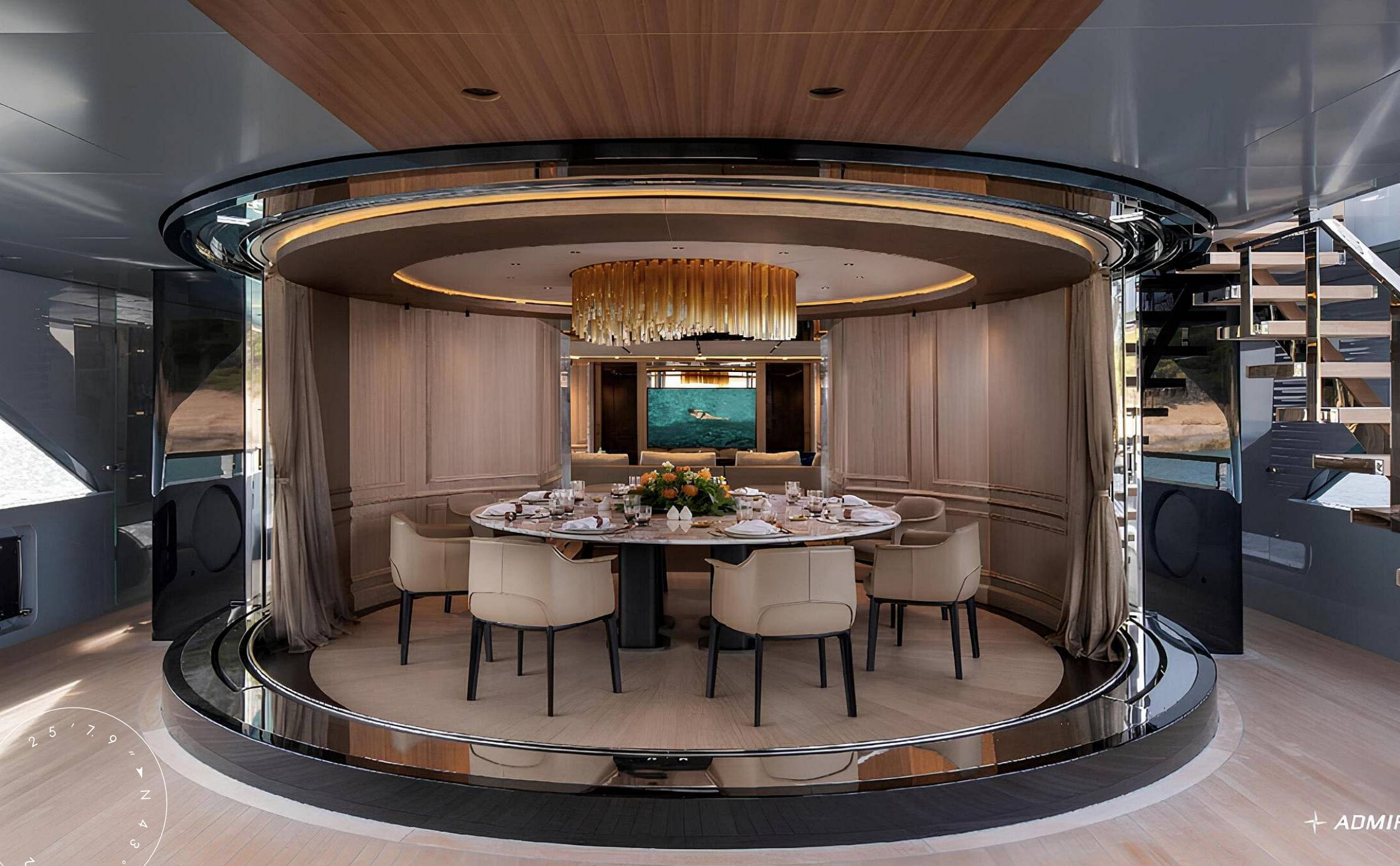
UPPER DECK SALOON DINING AREA