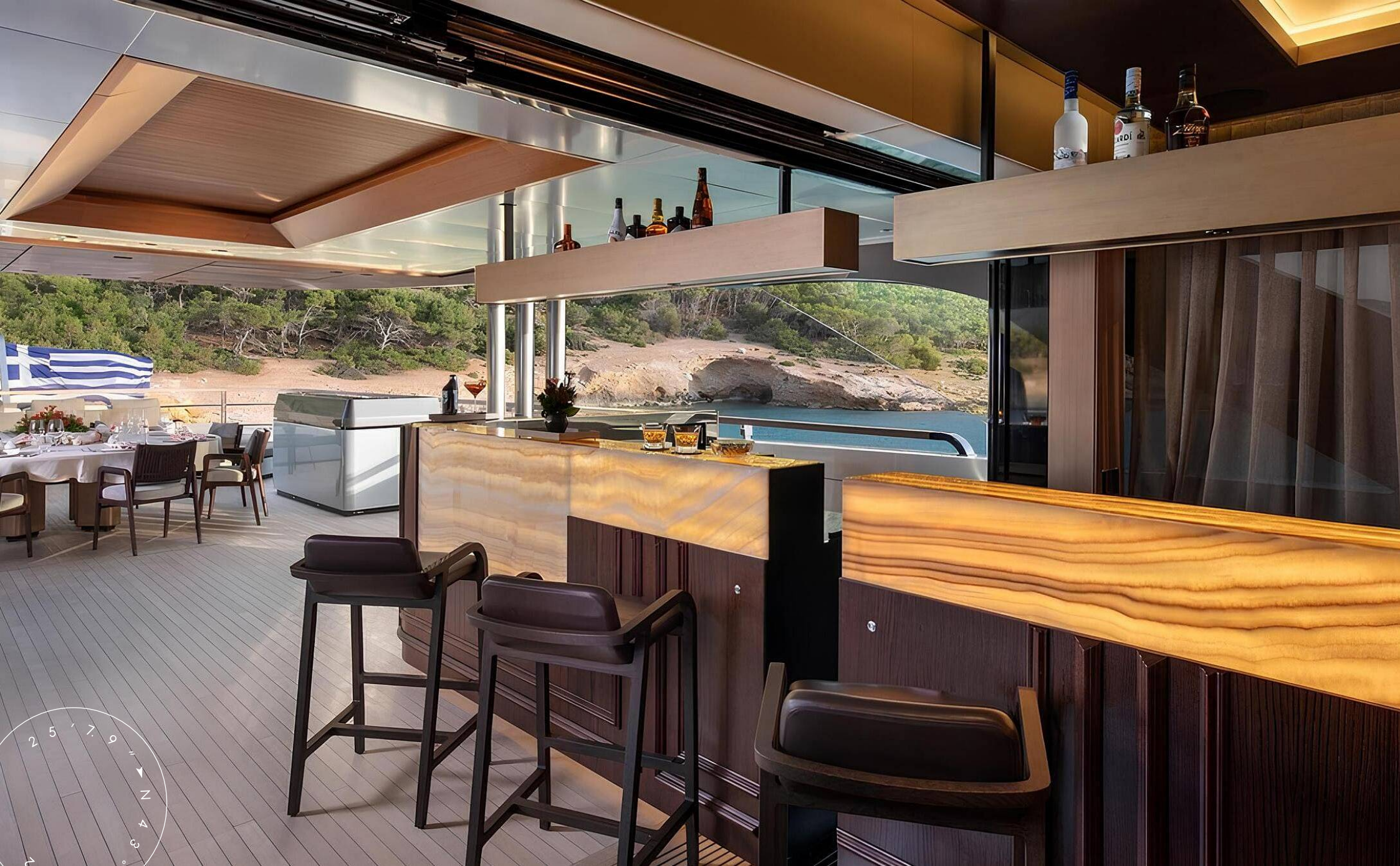
UPPER DECK BAR