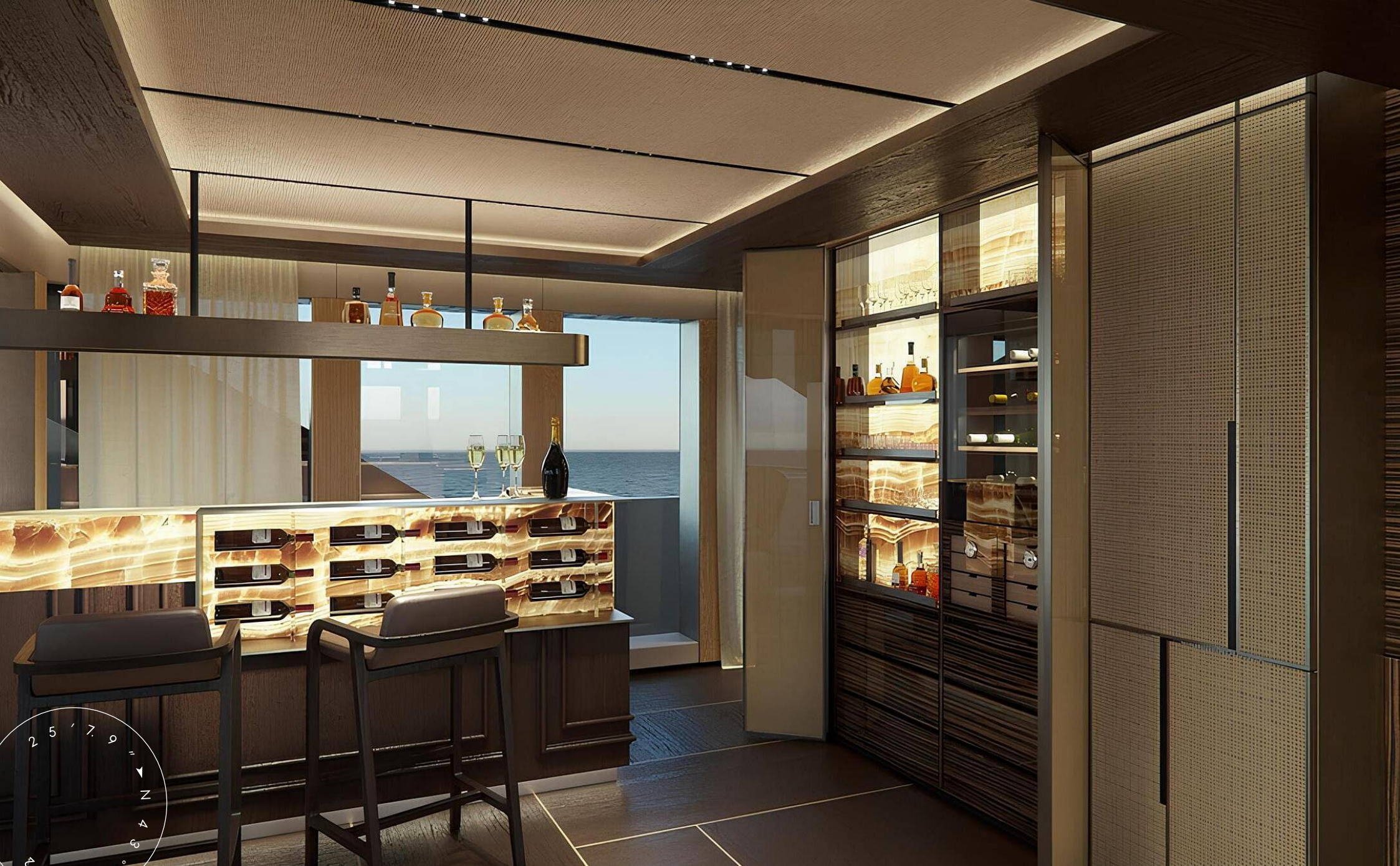
UPPER DECK SALON BAR