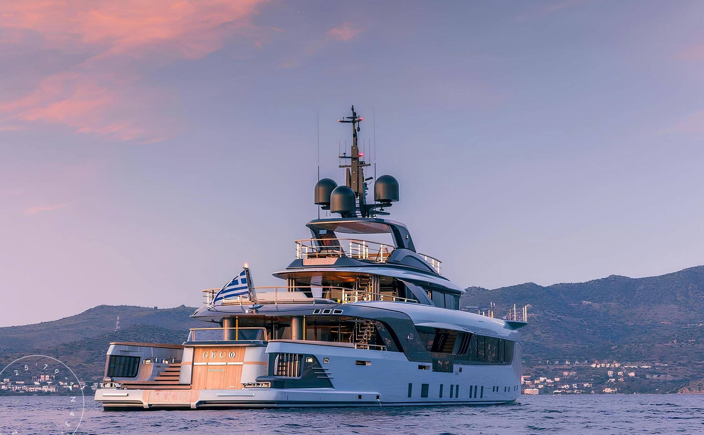
EXTERIOR ADMIRAL 55M 2020 MY GECO