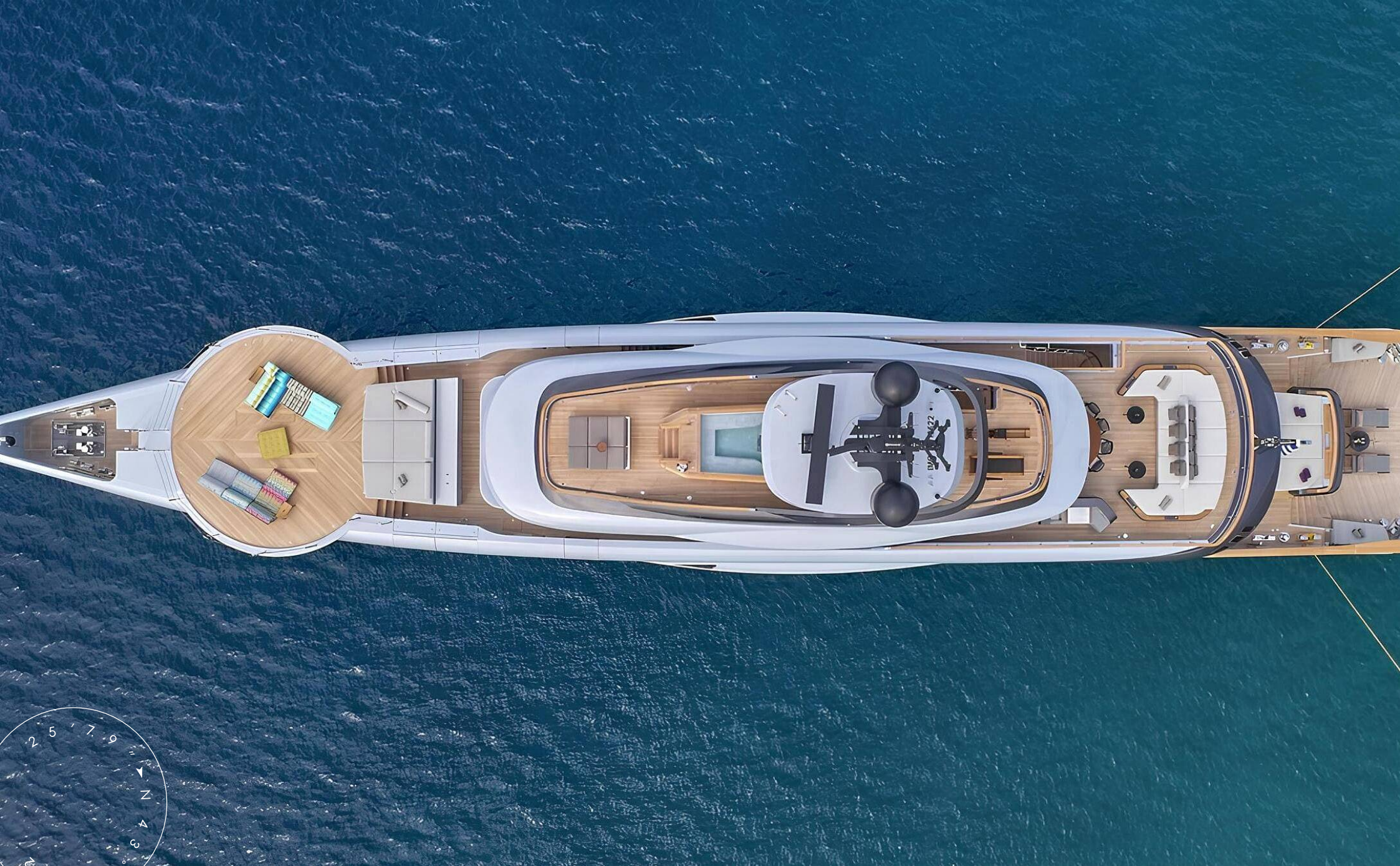
EXTERIOR ADMIRAL 55M 2020 MY GECO