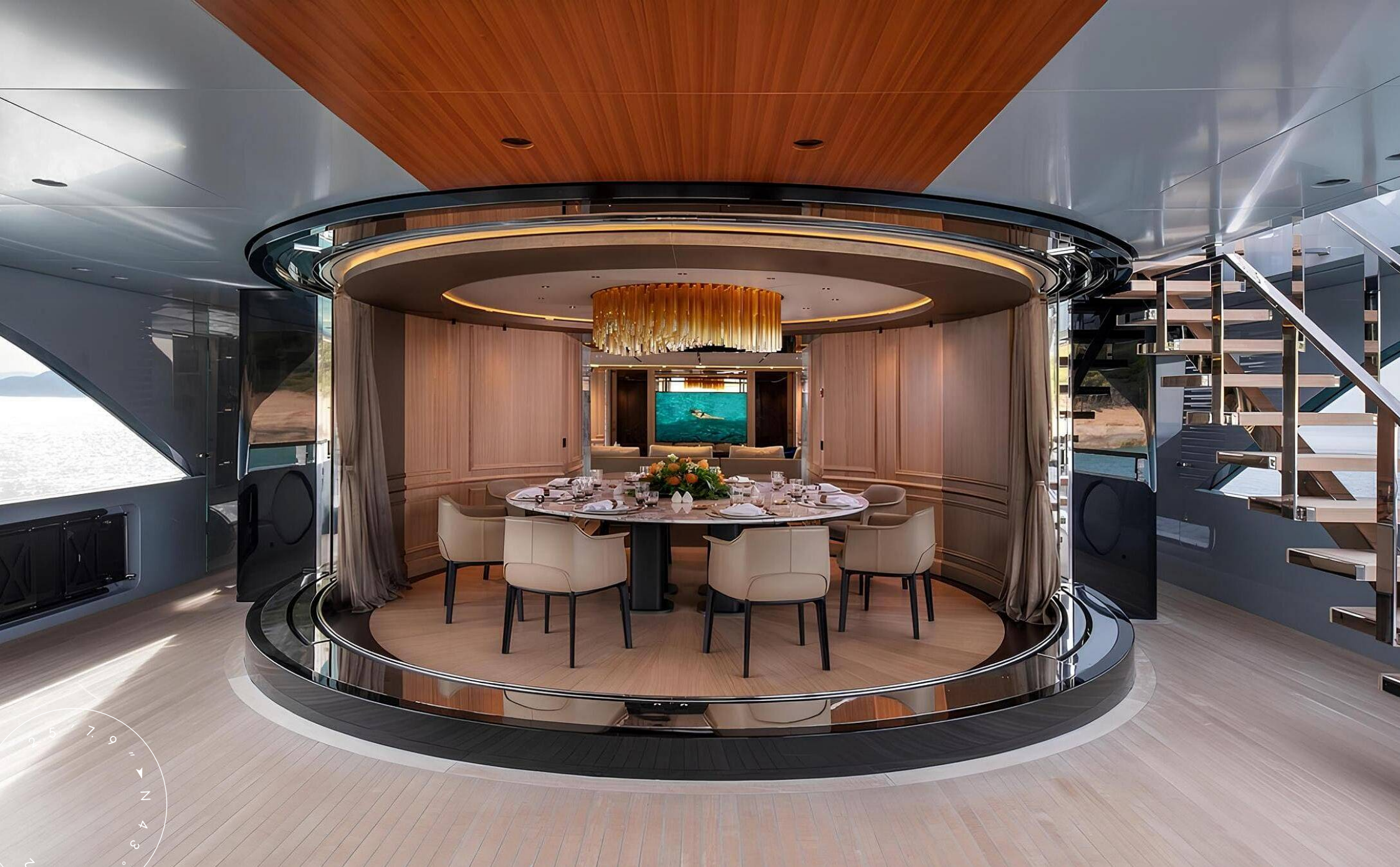
UPPER DECK SALOON DINING AREA