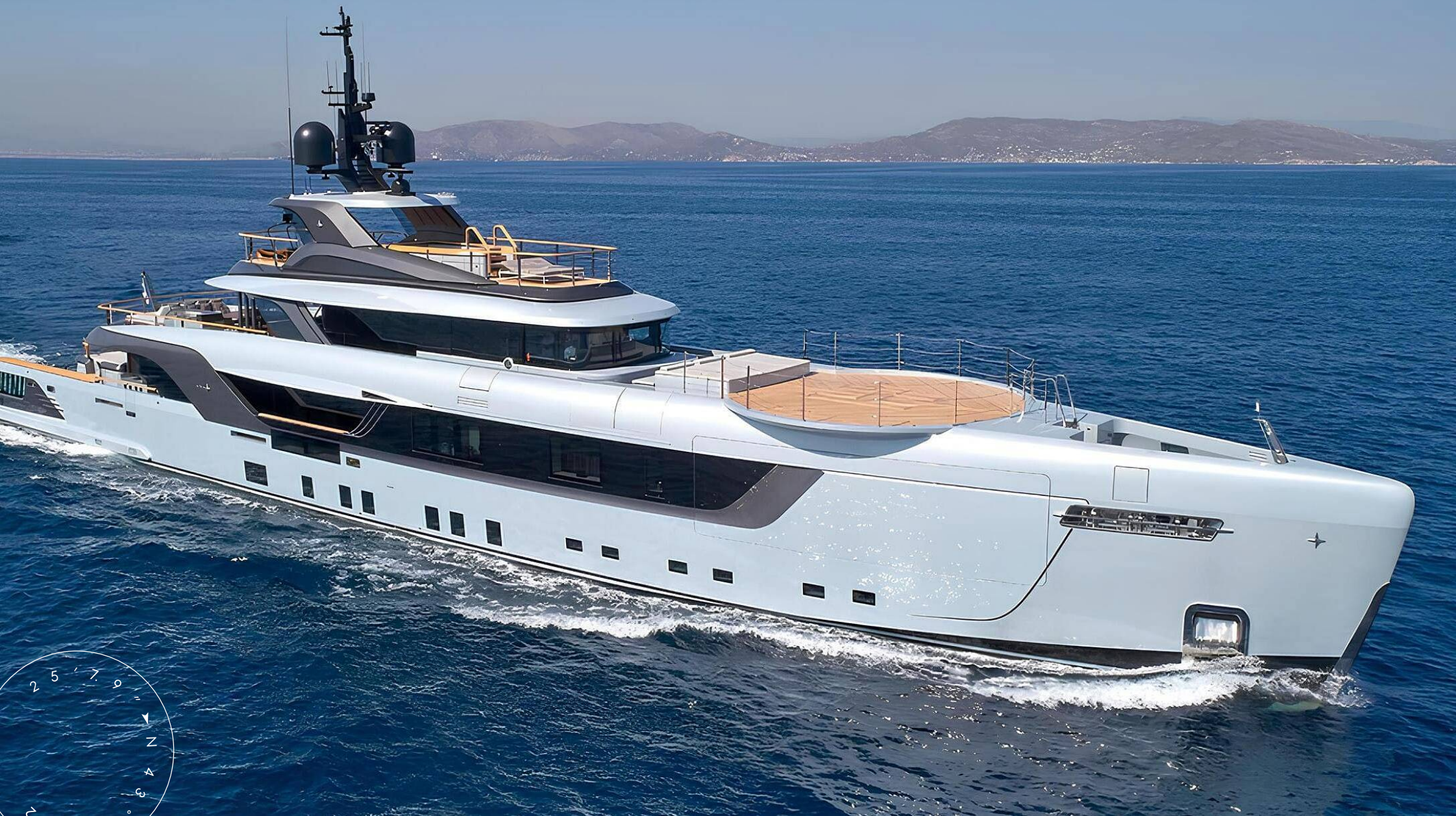
EXTERIOR ADMIRAL 55M 2020 MY GECCO