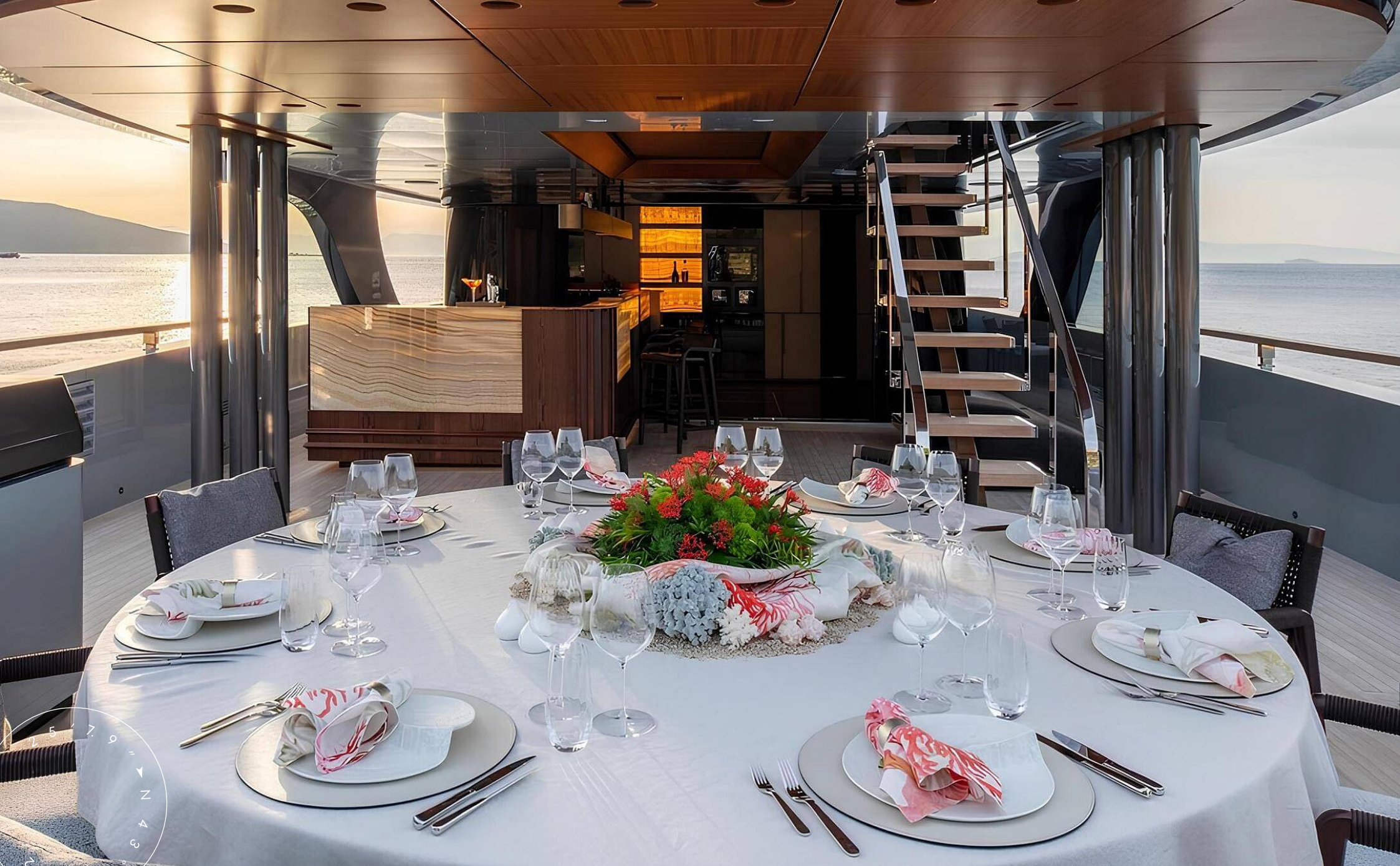
UPPER DECK SALOON DINING AREA