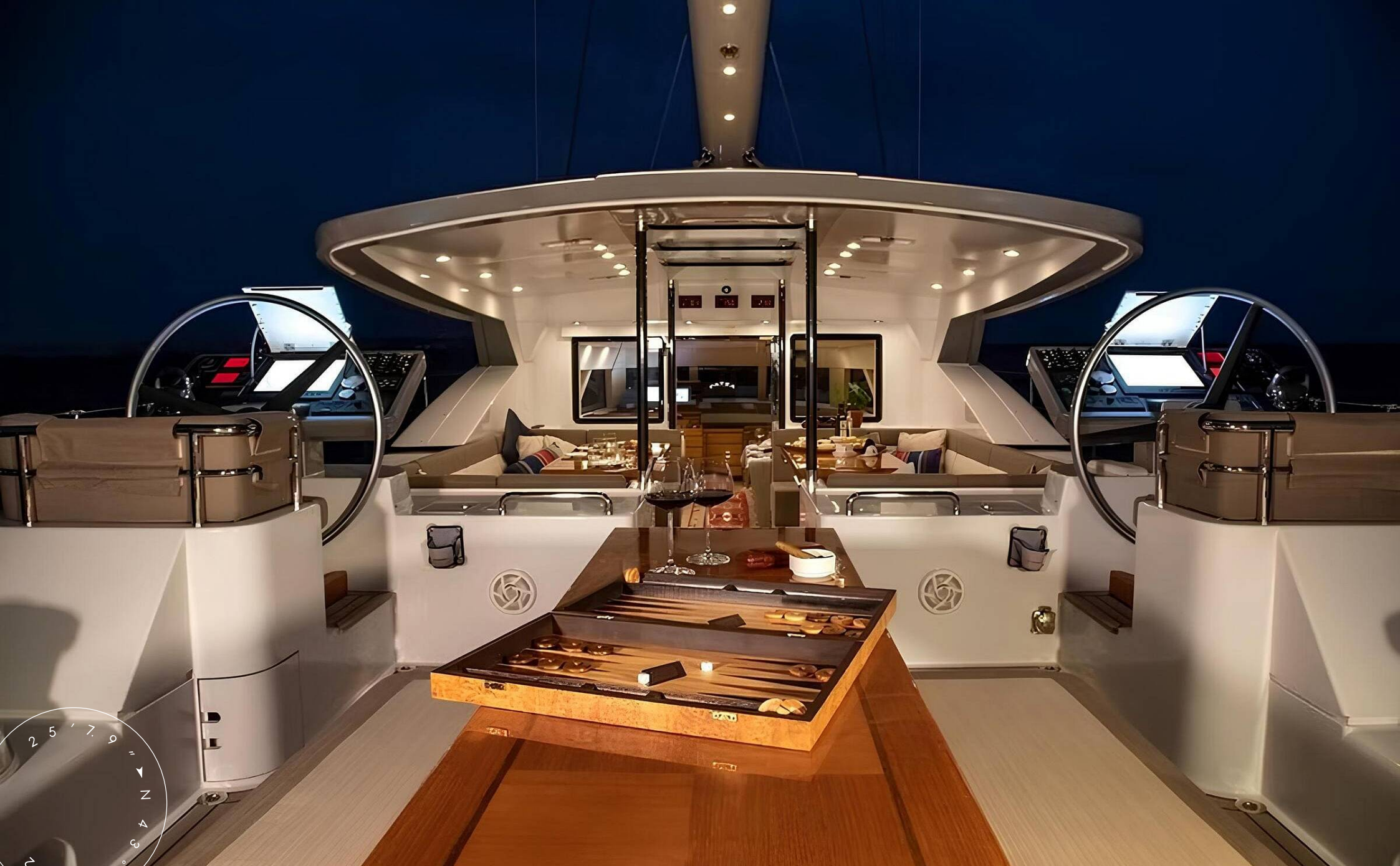
MAIN DECK LOUNGE AREA