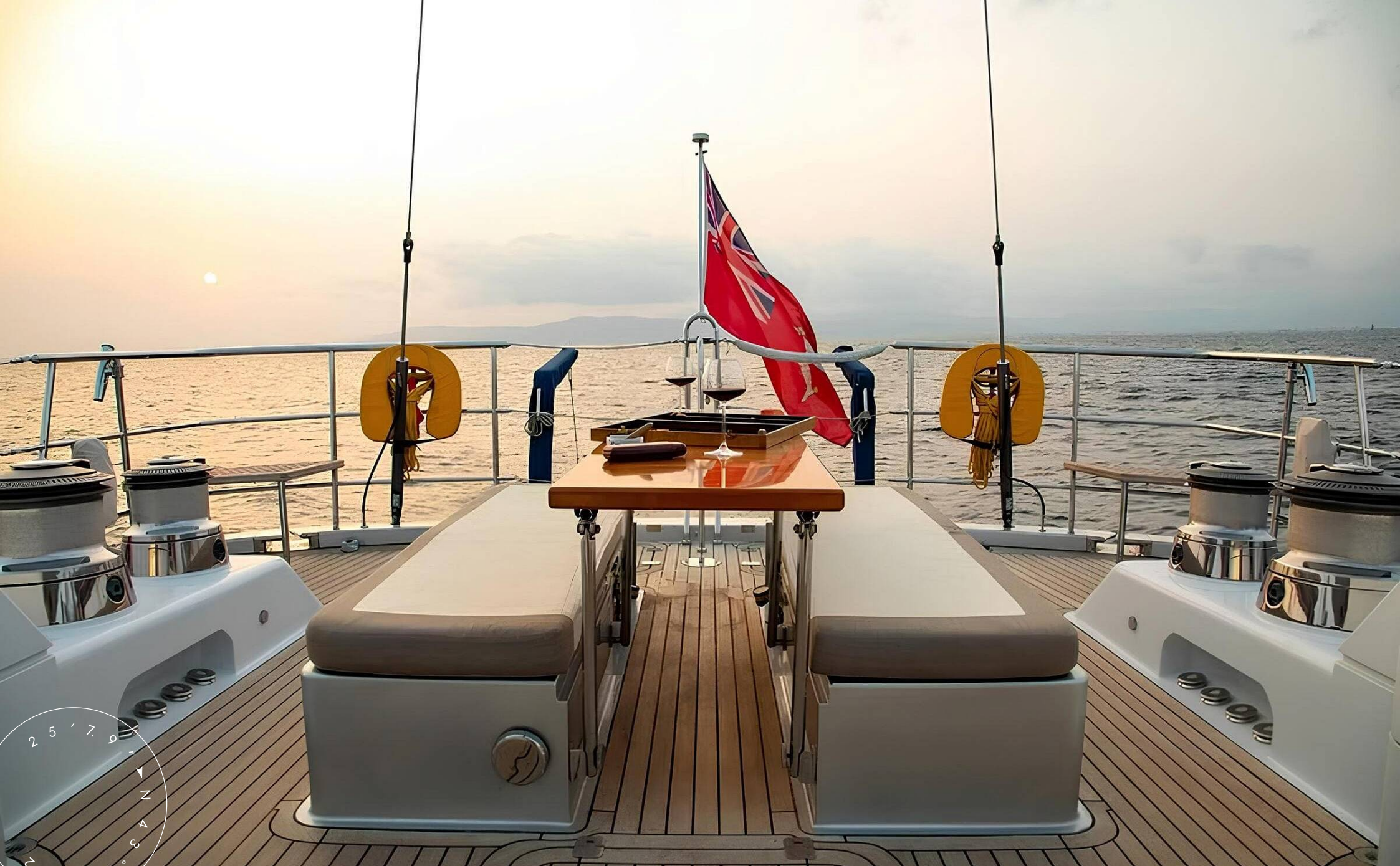
MAIN DECK LOUNGE AREA