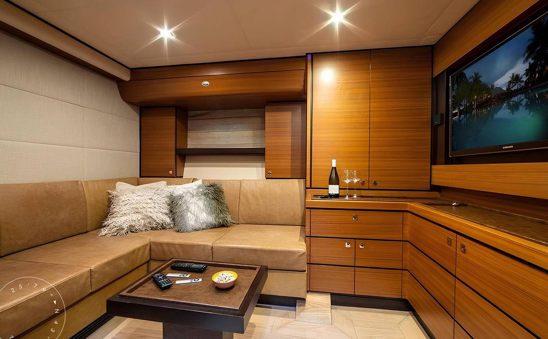
LOWER DECK LOBBY