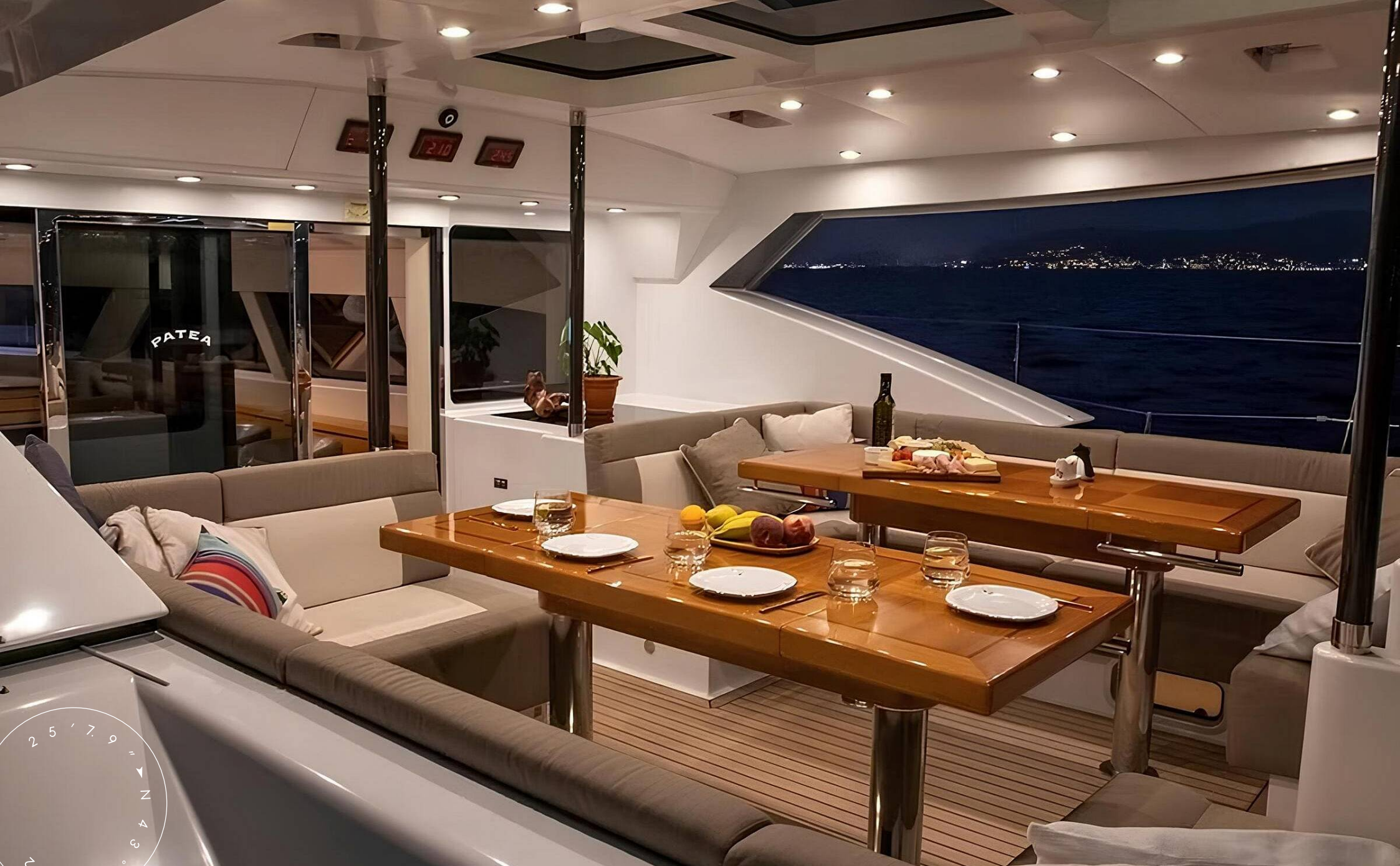
AFT MAIN DECK DINING AREA