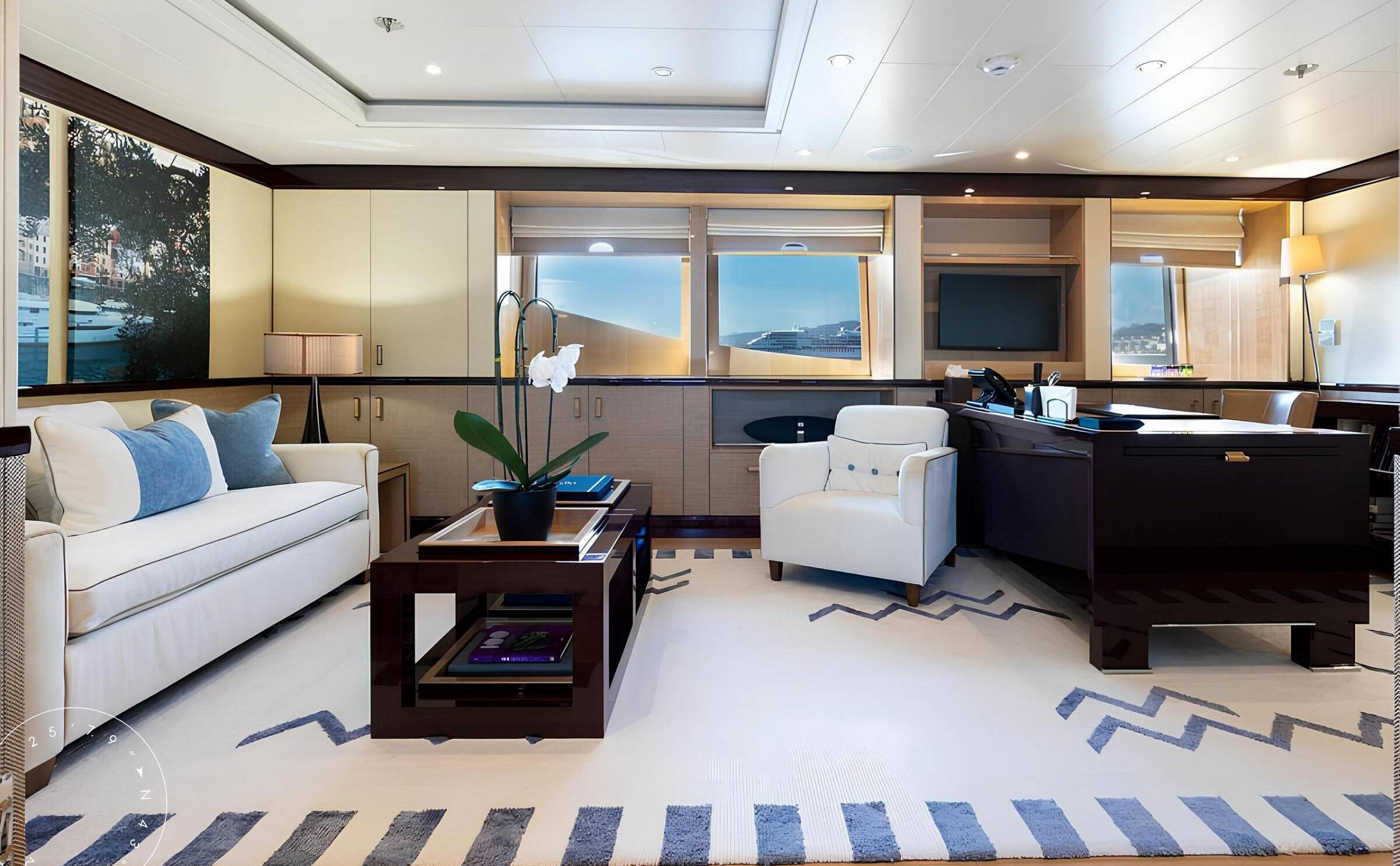
MASTER CABIN LOUNGE AREA