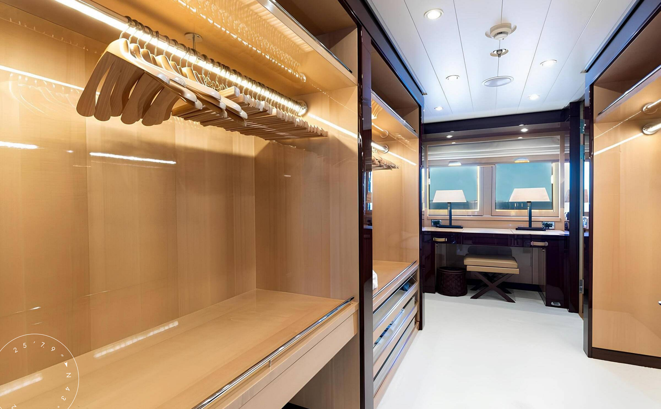
MASTER CABIN DRESSING ROOM