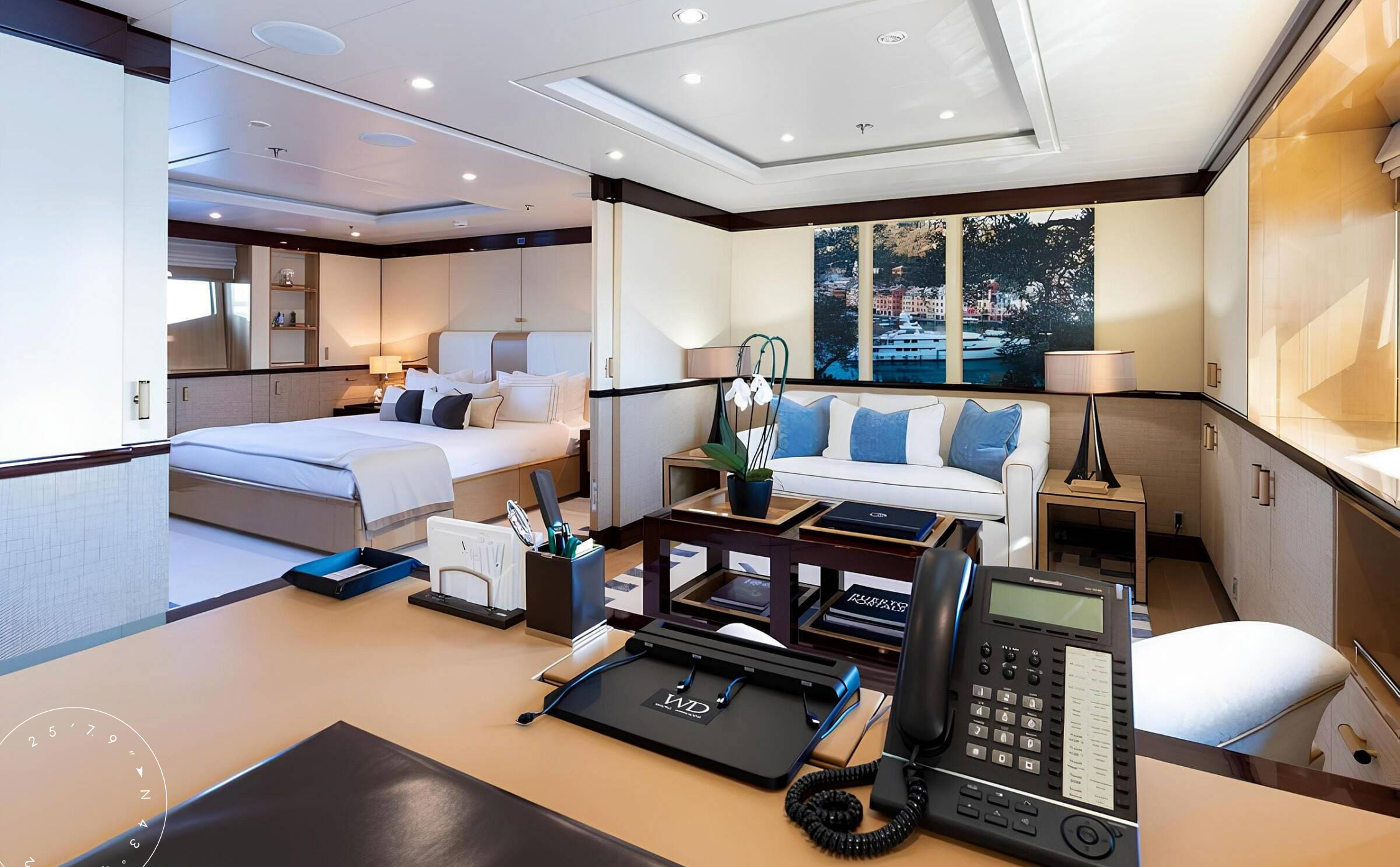
MASTER CABIN LOUNGE AREA