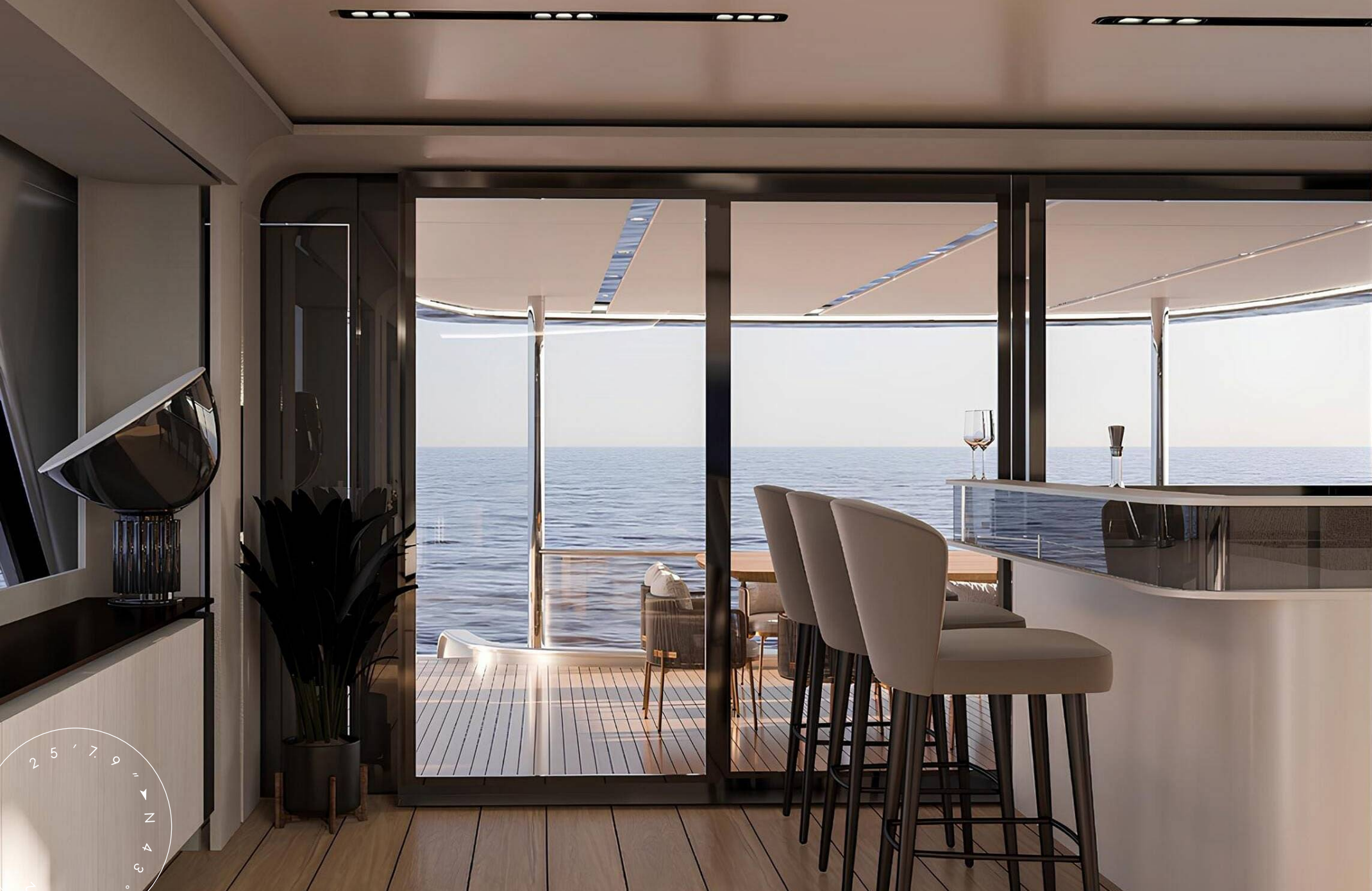
MAIN SALON BAR