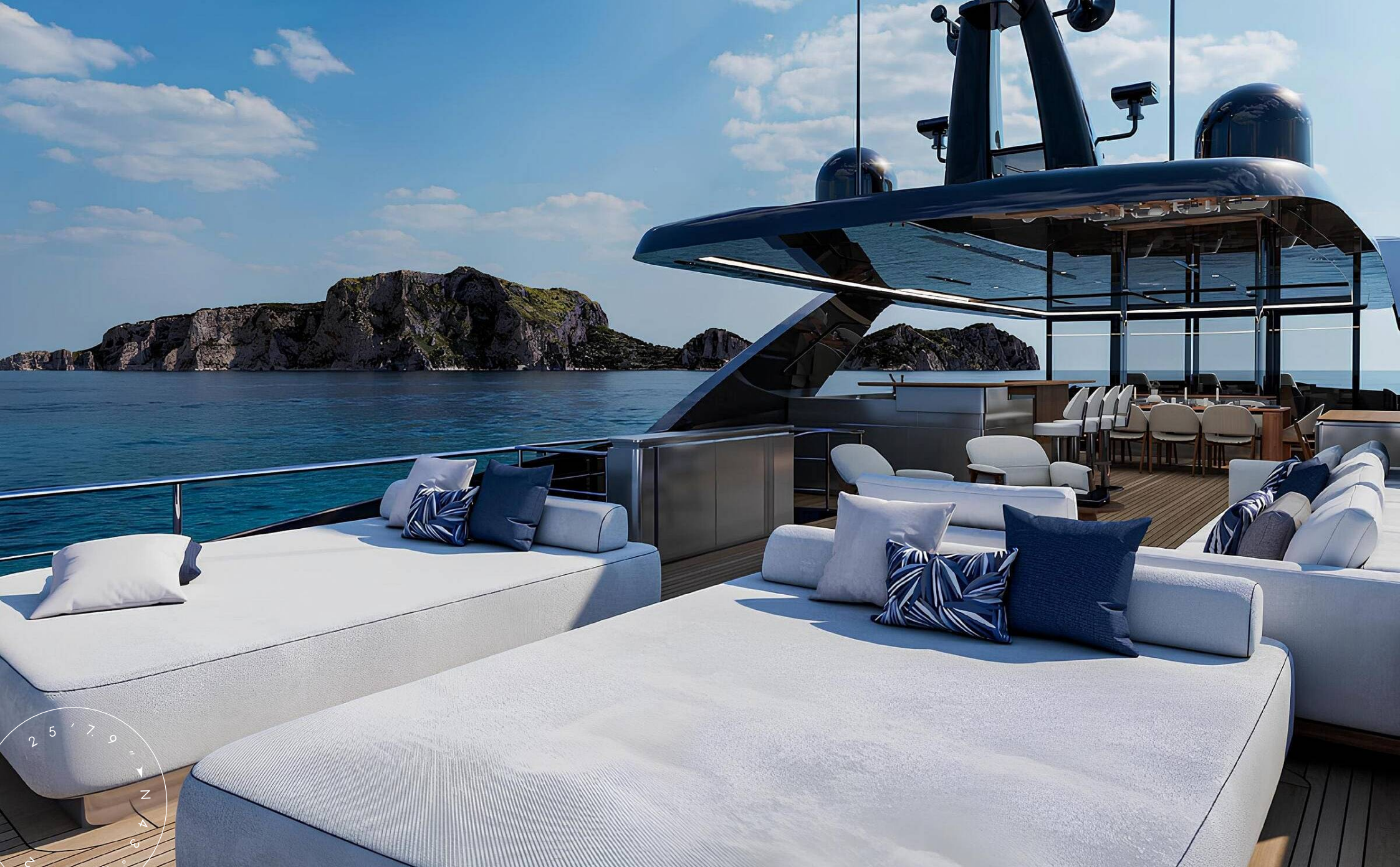
FLYBRIDGE AFT SUNBATHING AREA