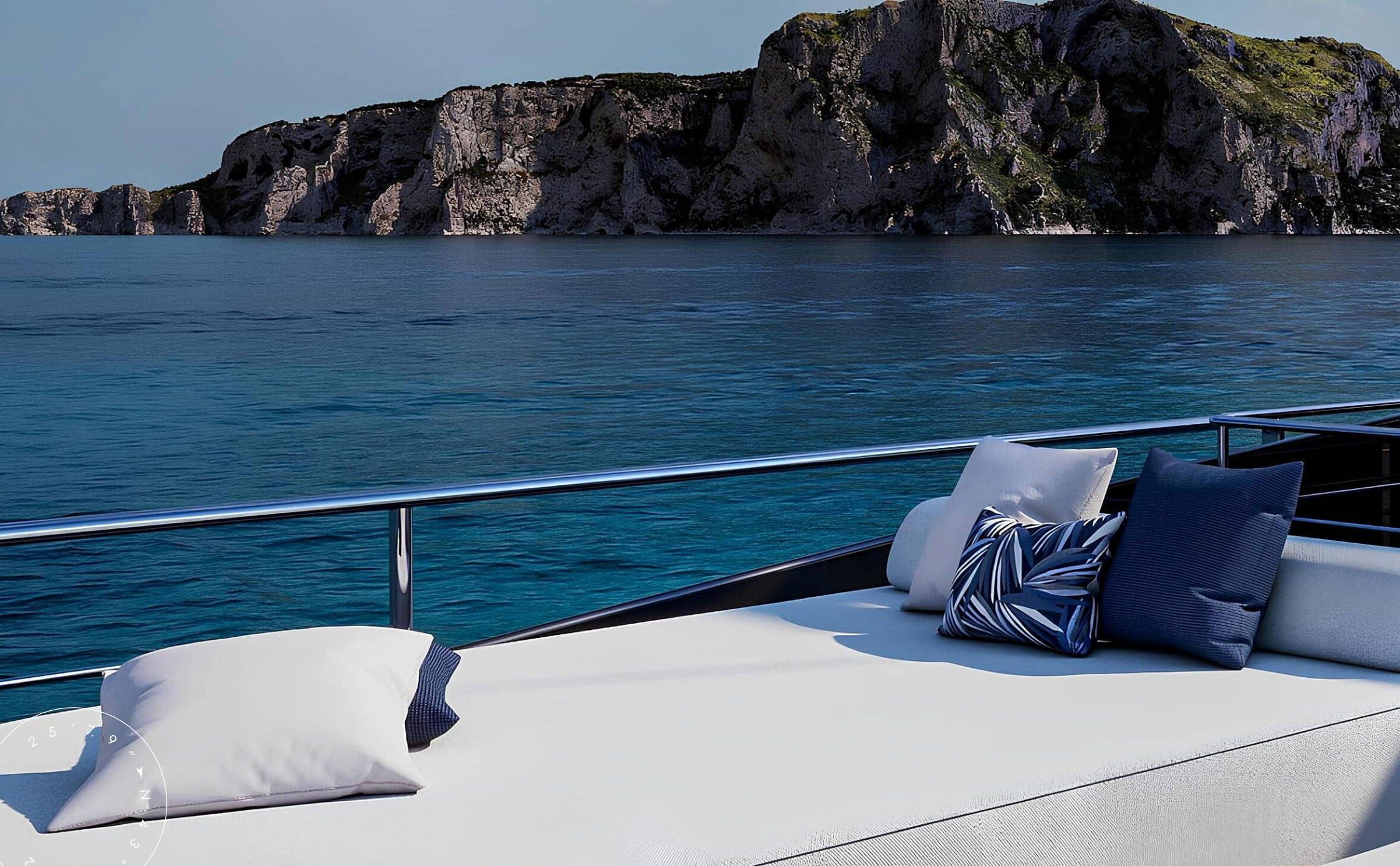
FLYBRIDGE AFT SUNBATHING AREA