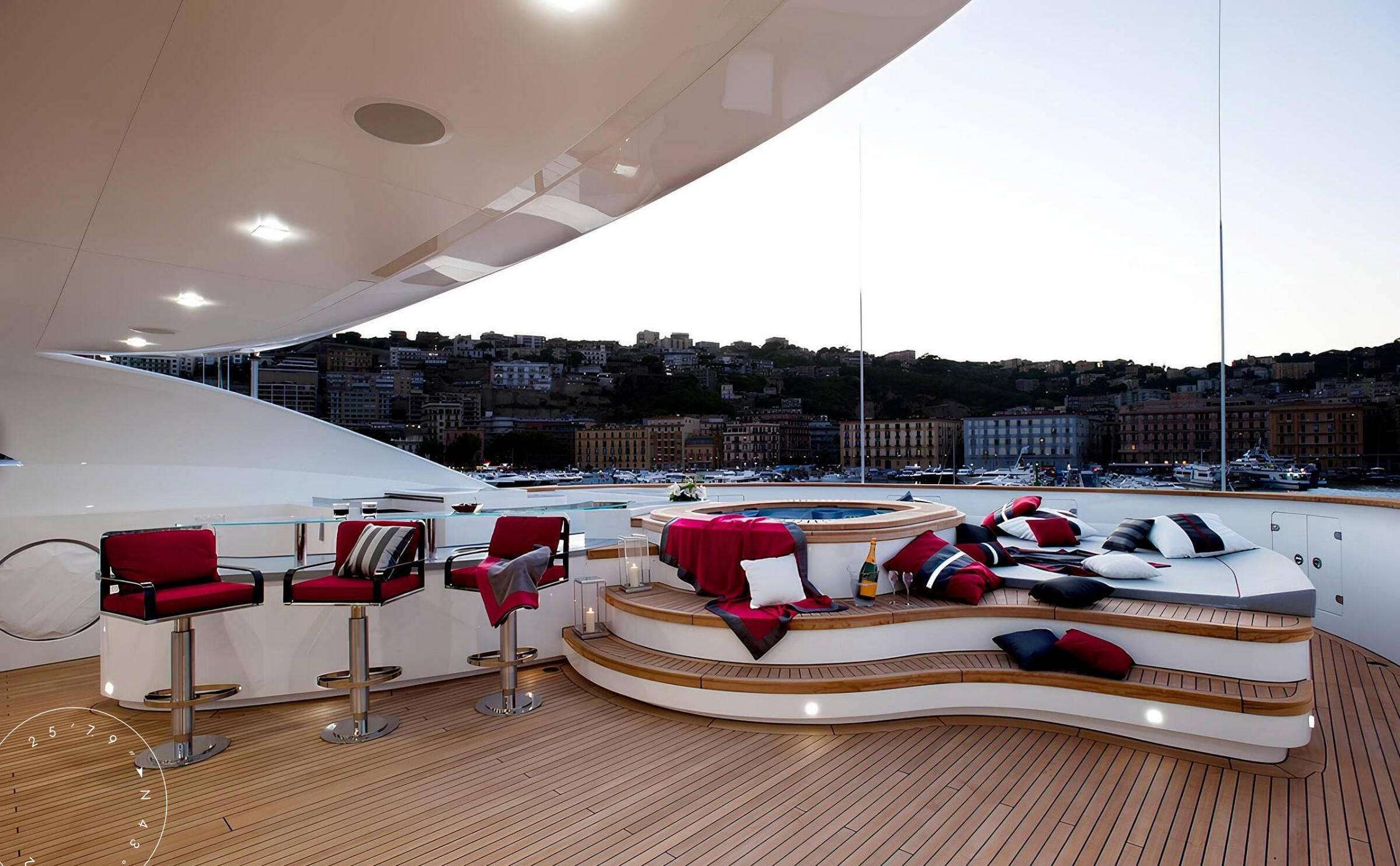
SUNDECK LOUNGE AREA