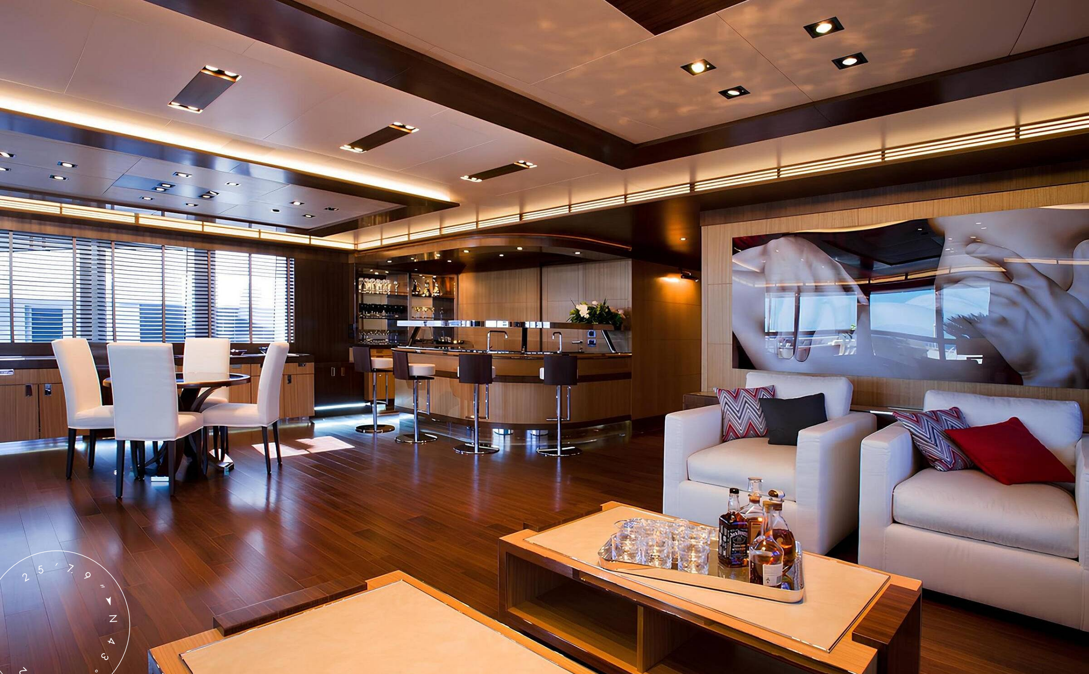
UPPER DECK SALOON