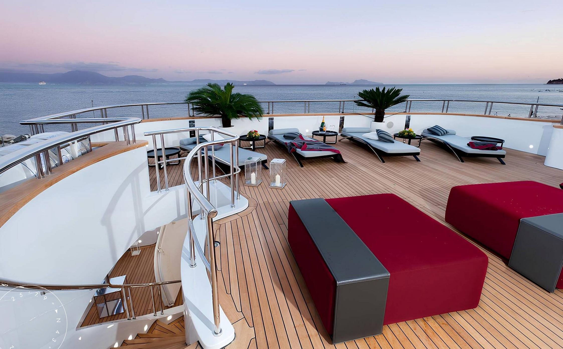
SUNDECK LOUNGE AREA