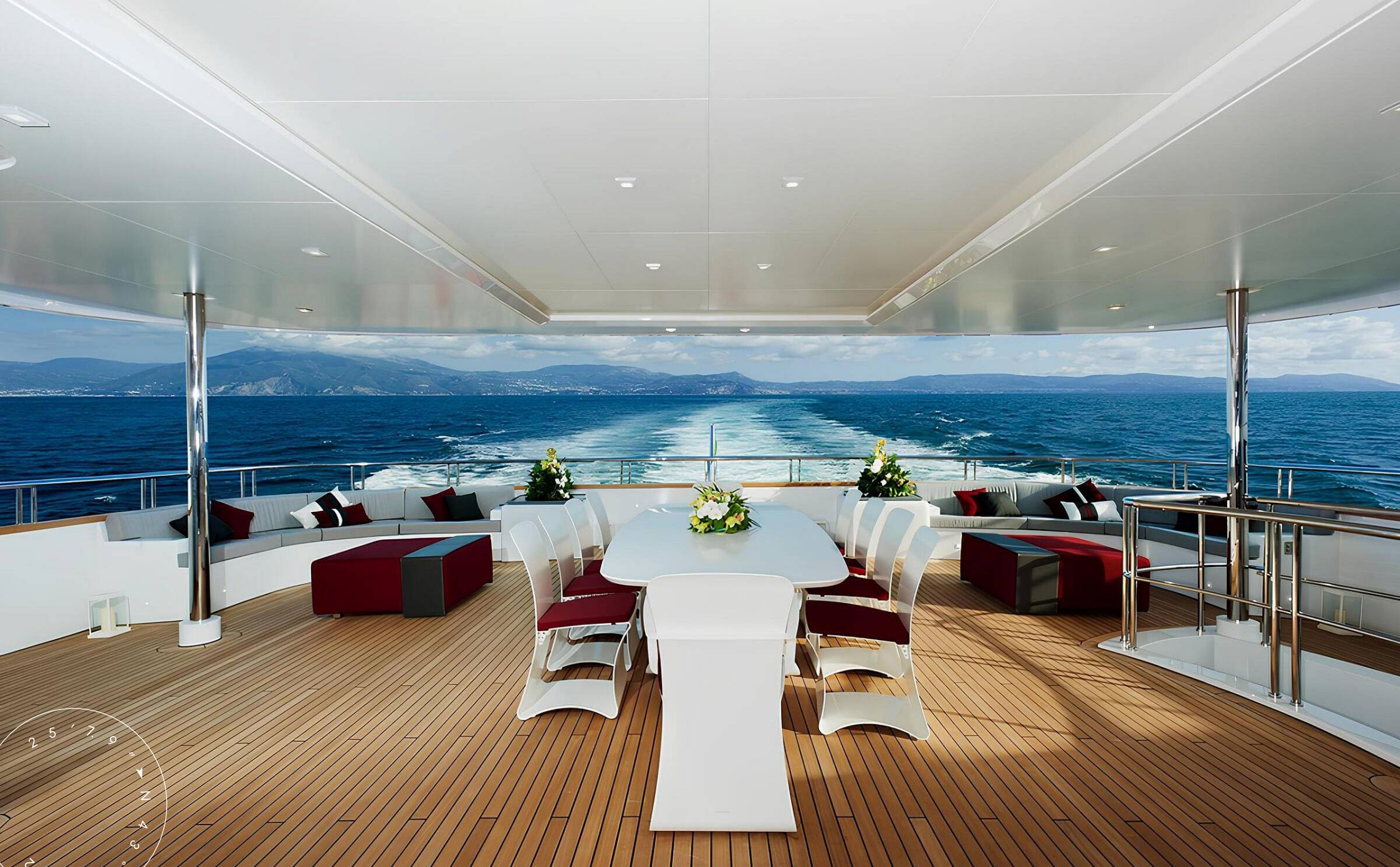
AFT UPPER DECK DINING AREA