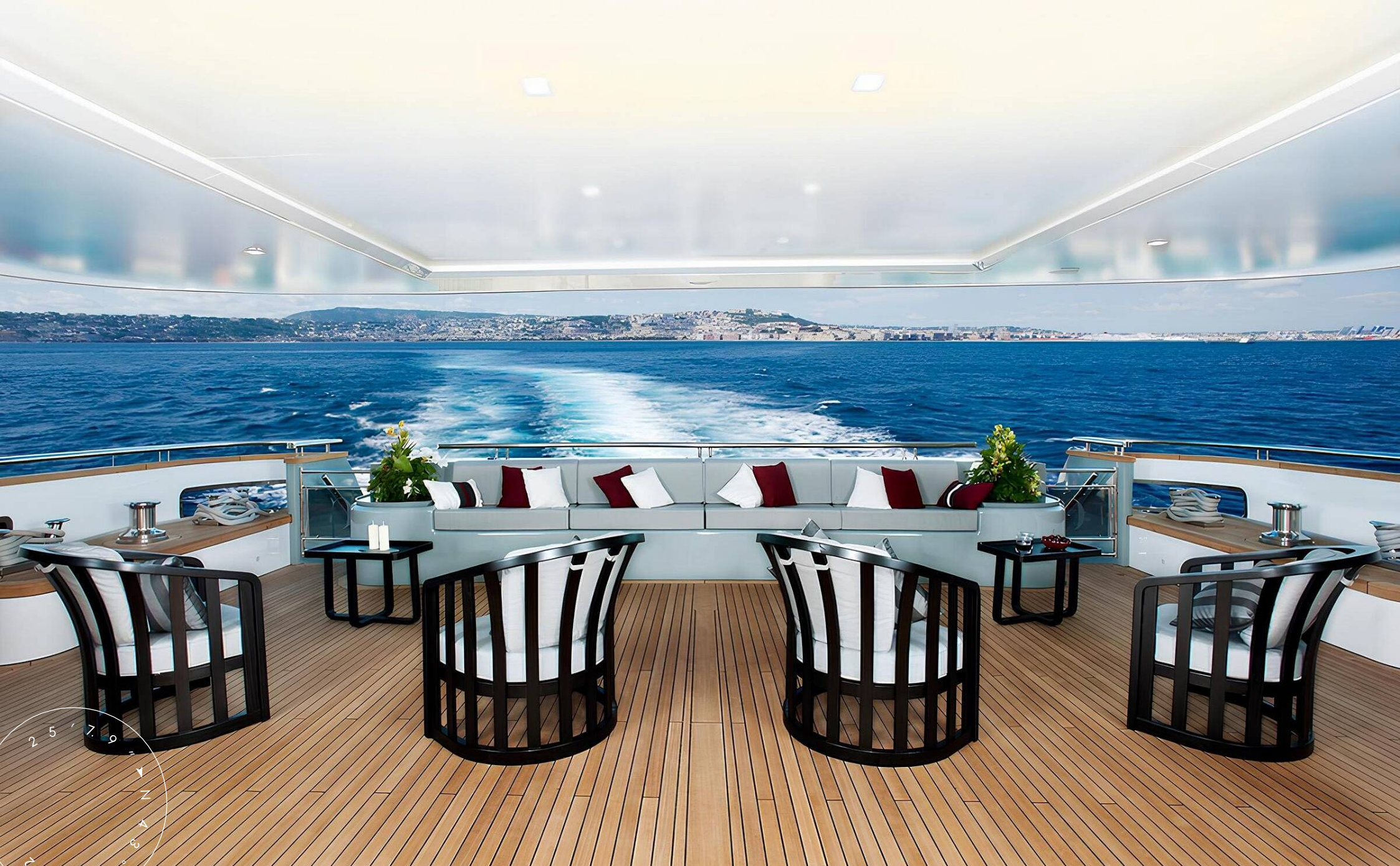
AFT MAIN DECK LOUNGE AREA