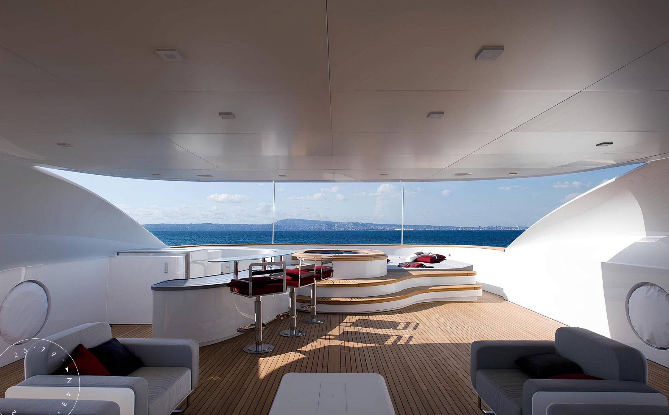
SUNDECK LOUNGE AREA