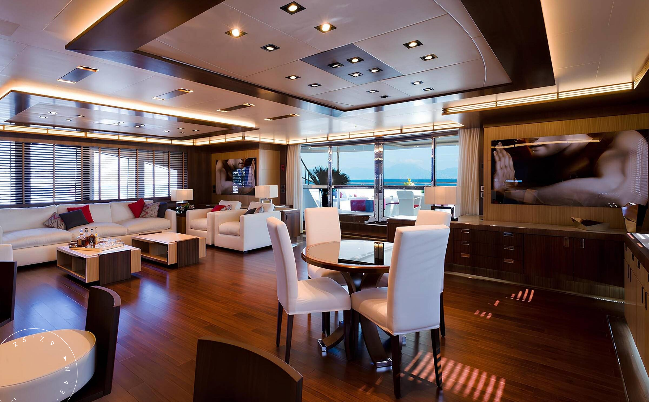
UPPER DECK SALOON