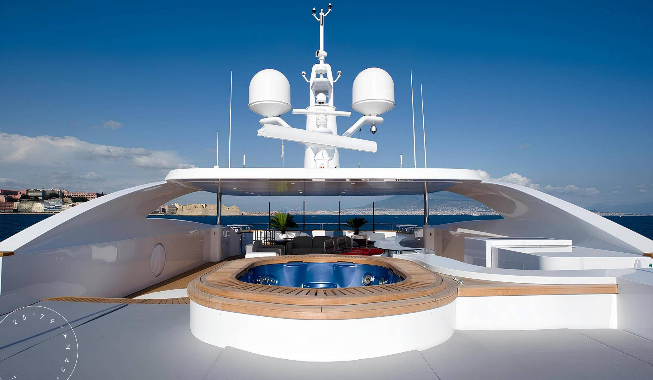
SUNDECK LOUNGE AREA