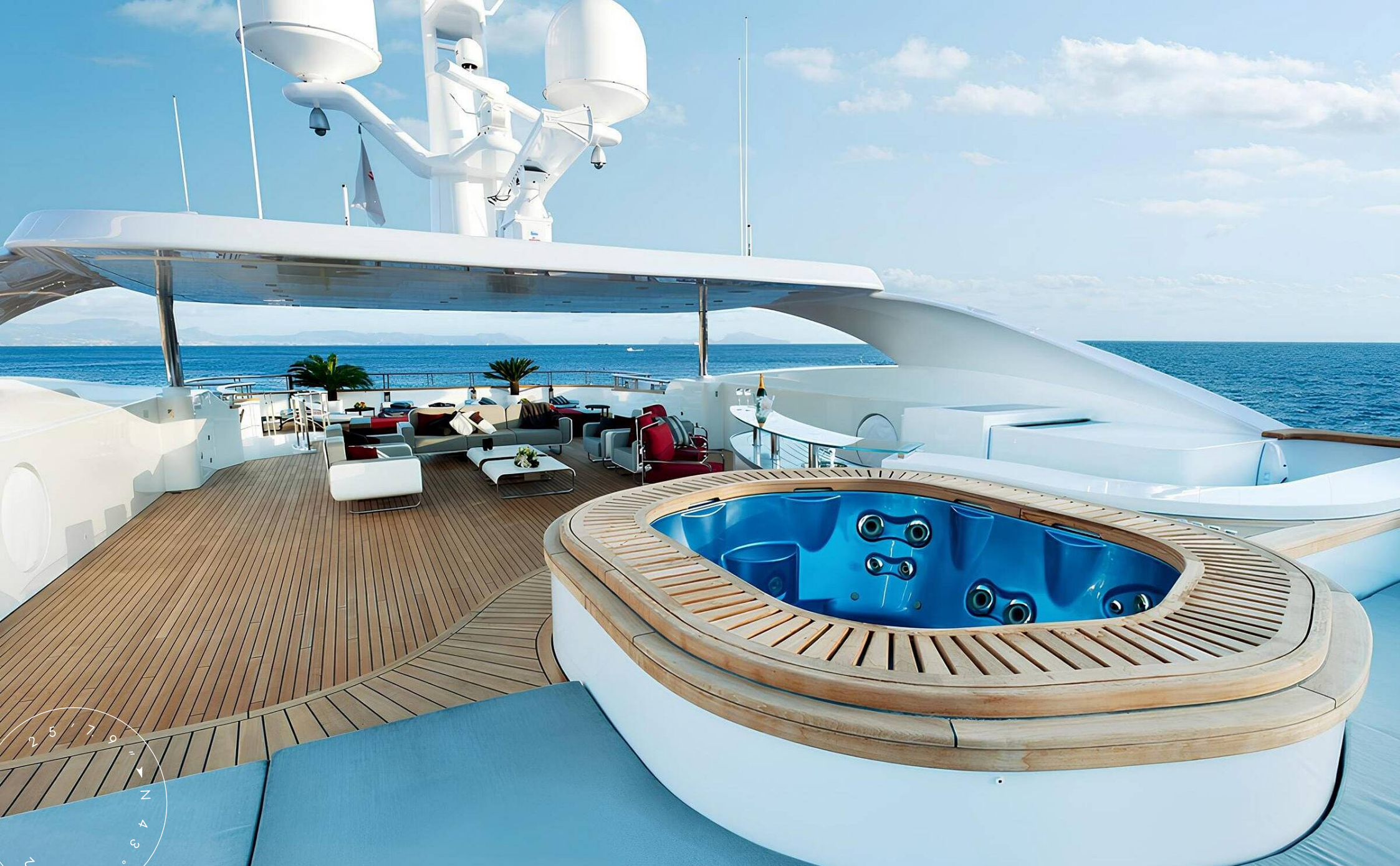
SUNDECK LOUNGE AREA