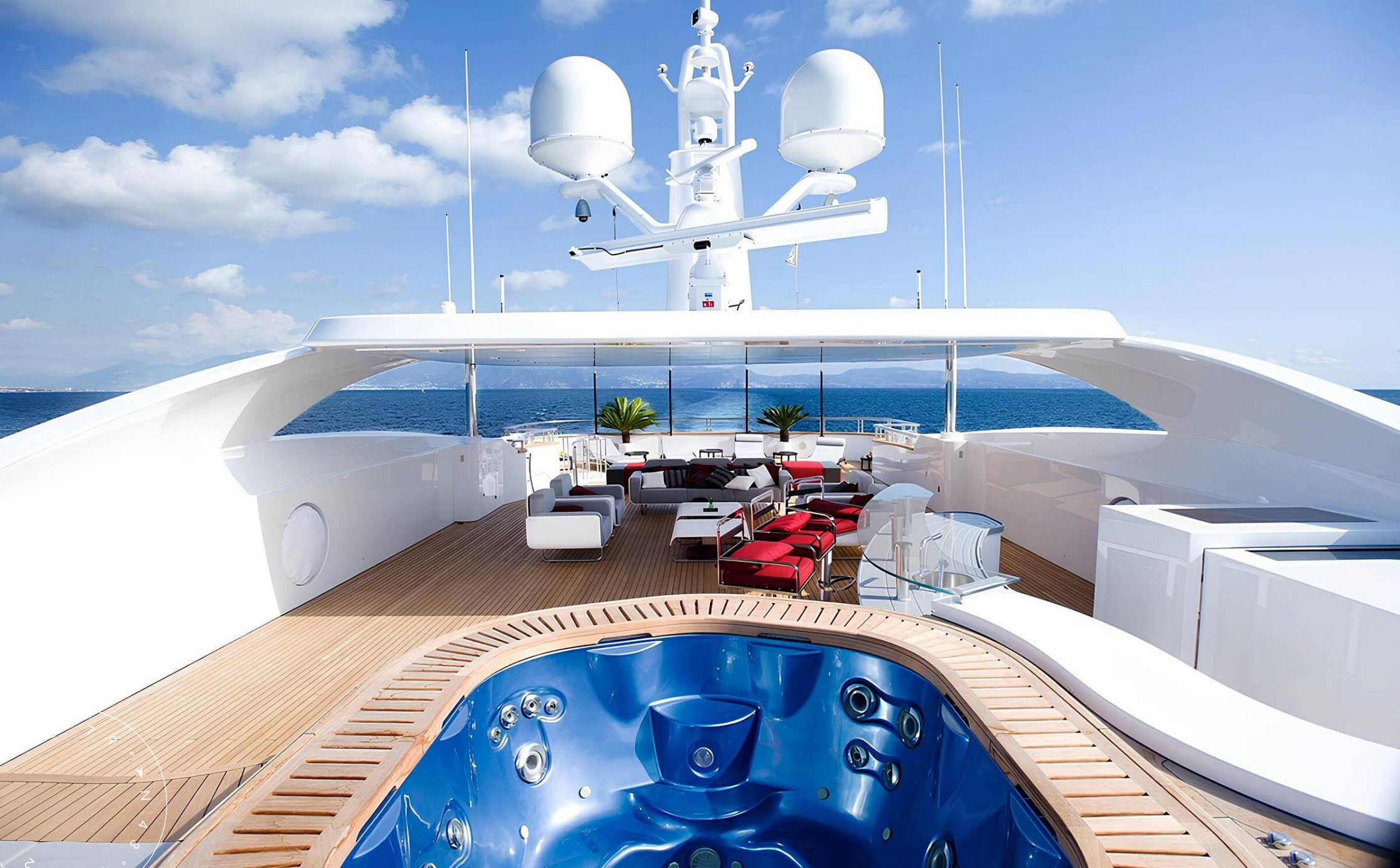
SUNDECK LOUNGE AREA