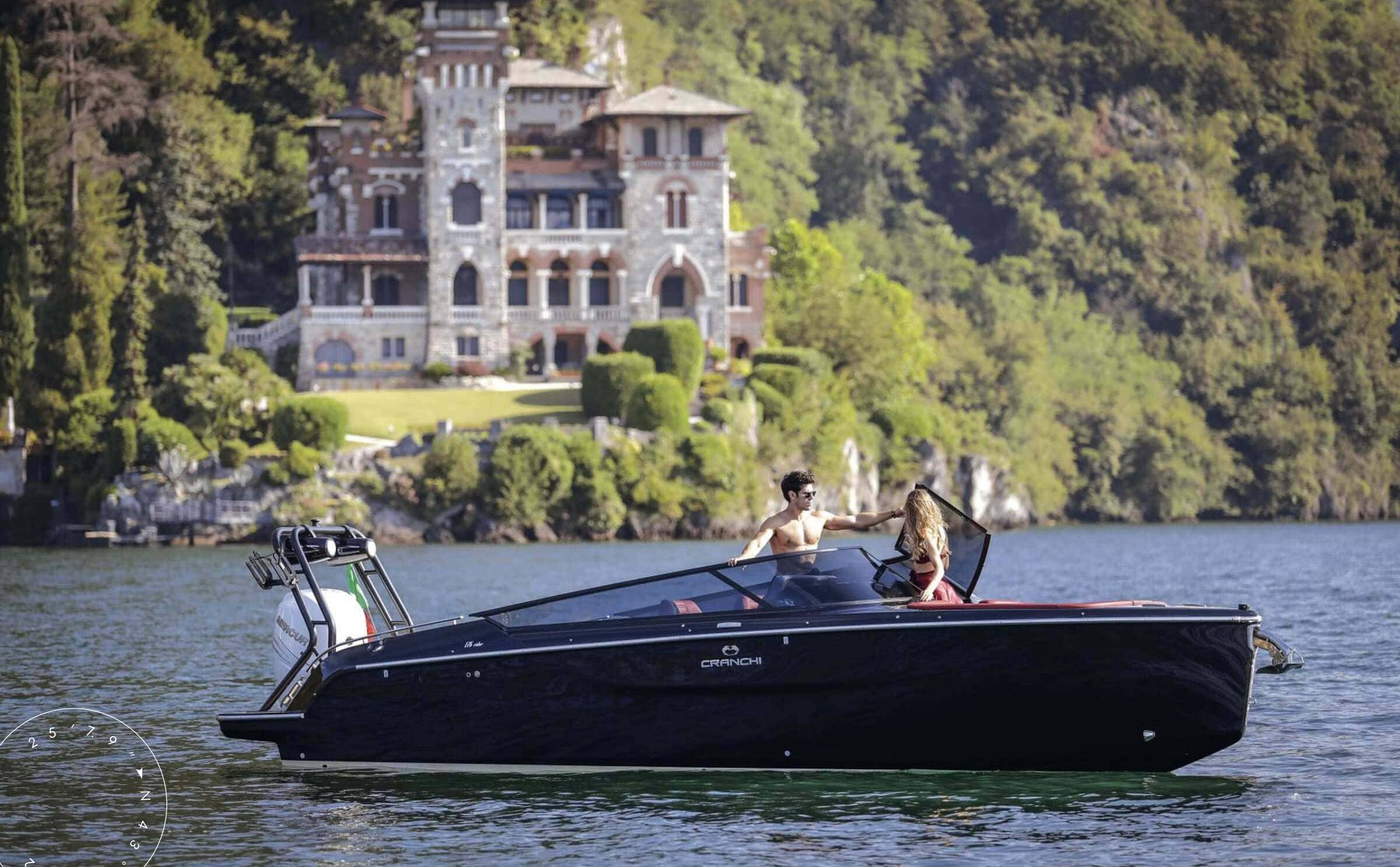
EXTERIOR CRANCHI E26 RIDER