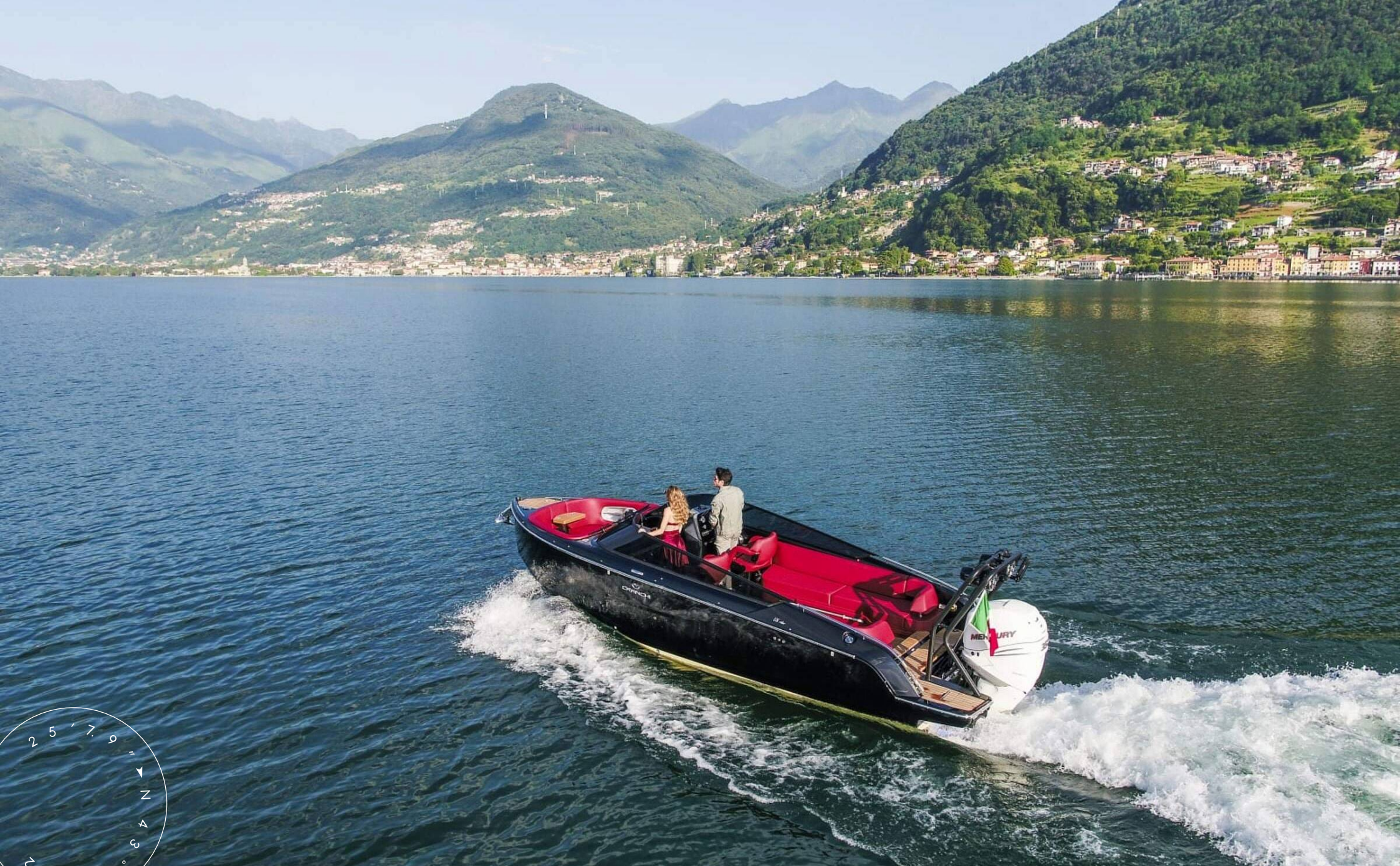
EXTERIOR CRANCHI E26 RIDER