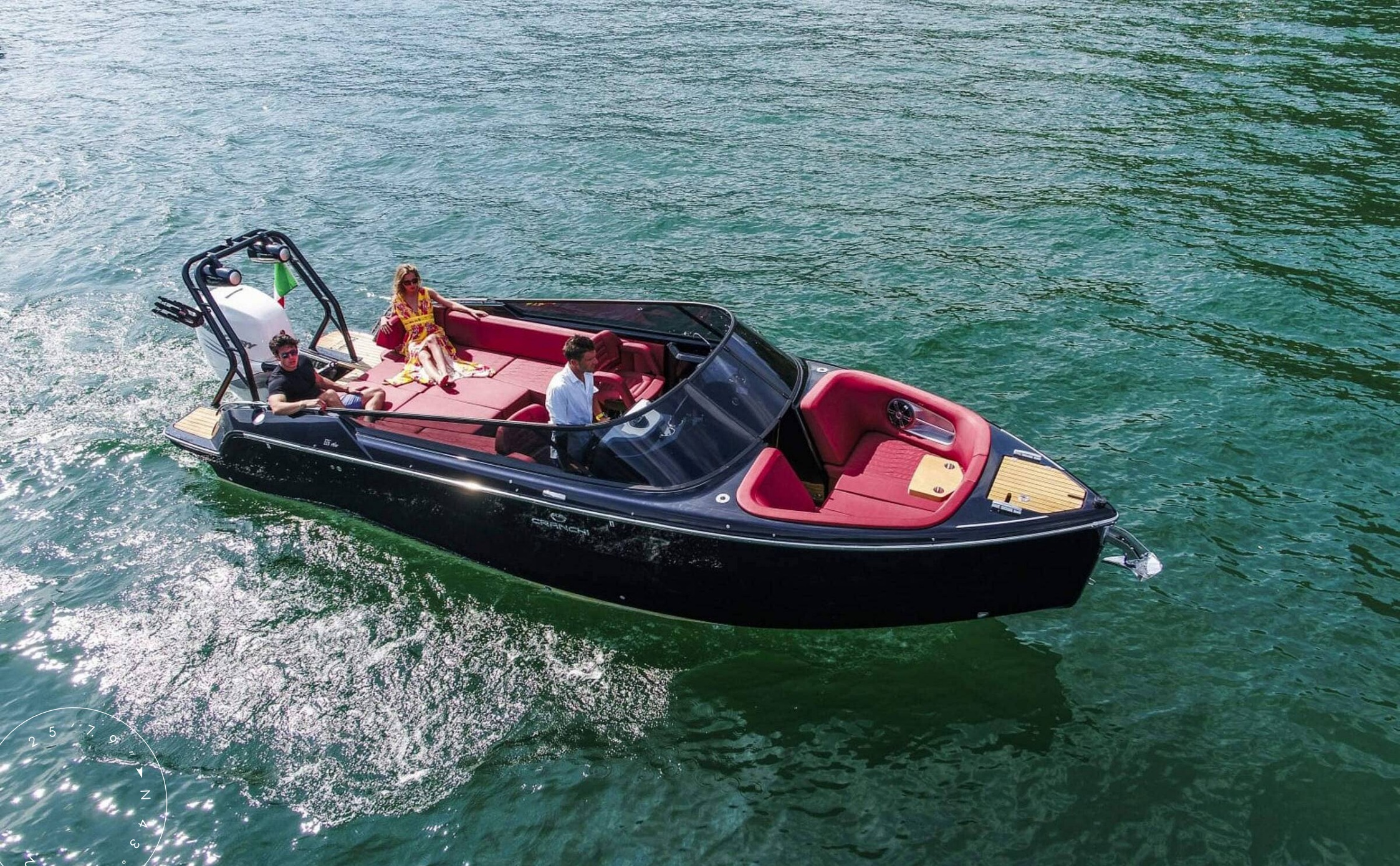
EXTERIOR CRANCHI E26 RIDER