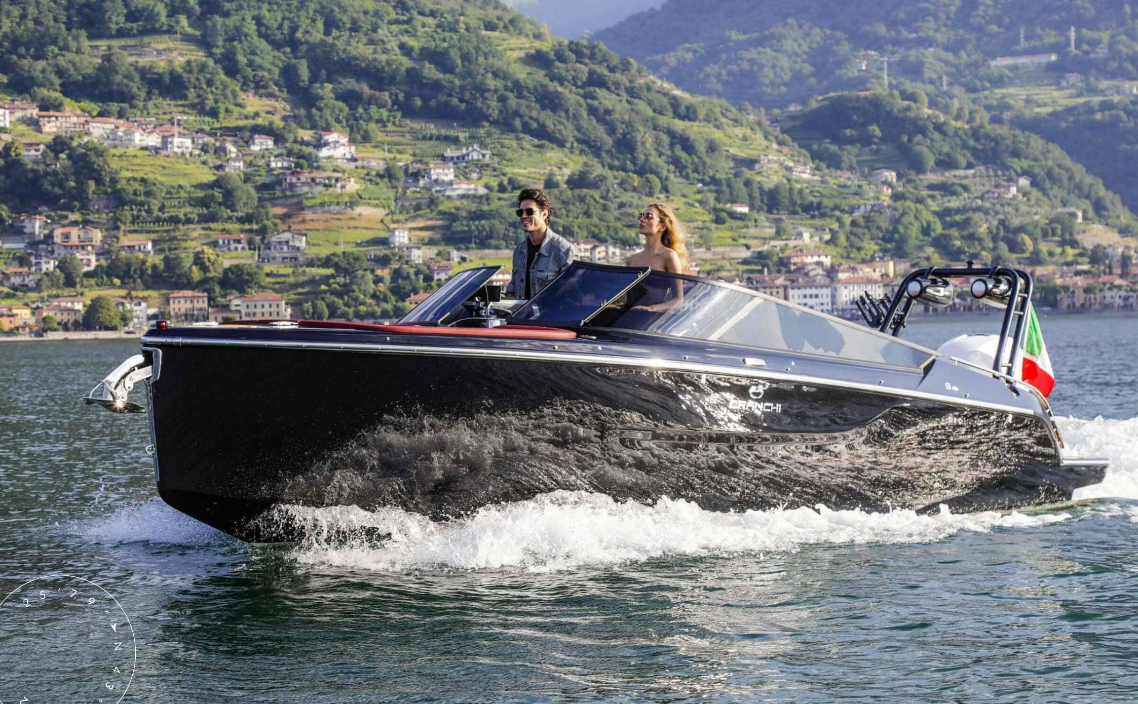
EXTERIOR CRANCHI E26 RIDER