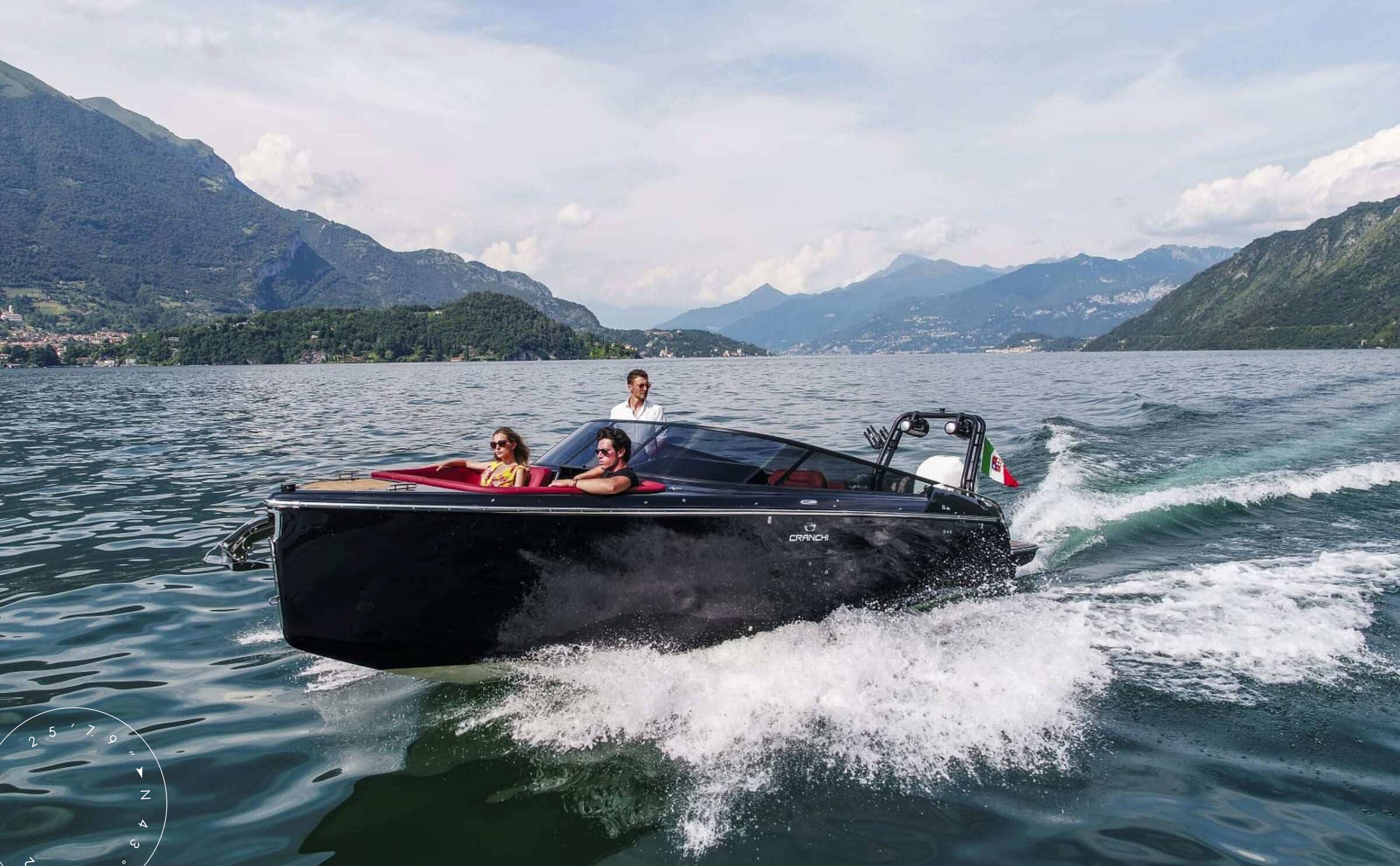
EXTERIOR CRANCHI E26 RIDER