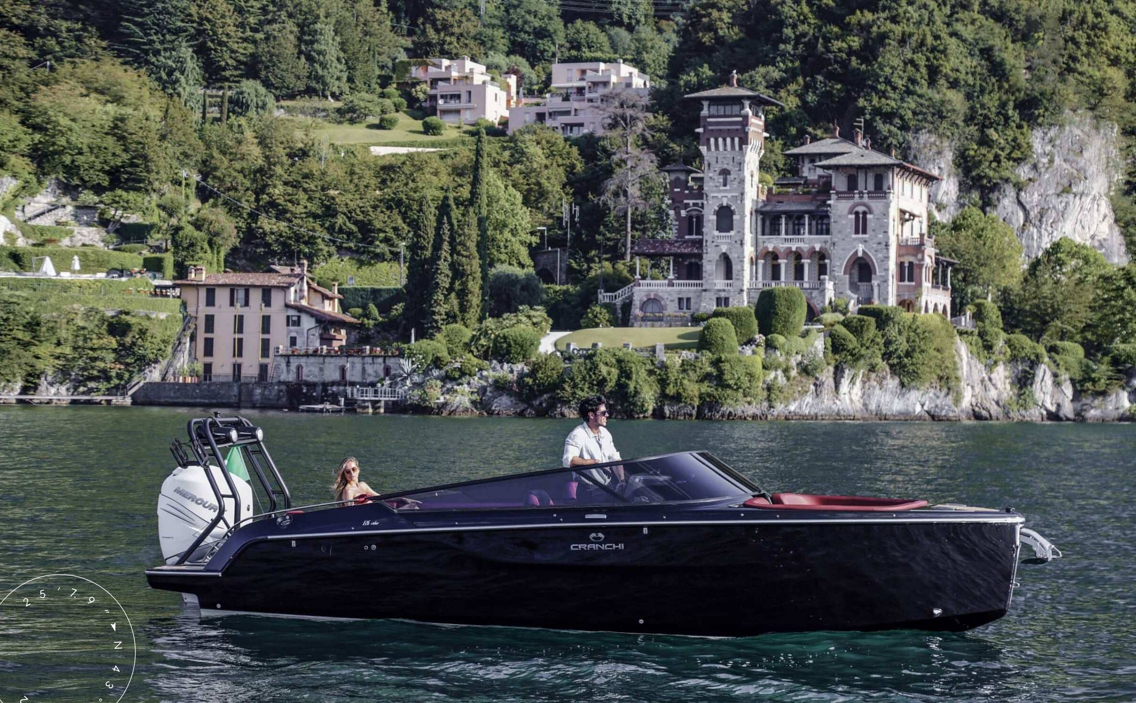
EXTERIOR CRANCHI E26 RIDER