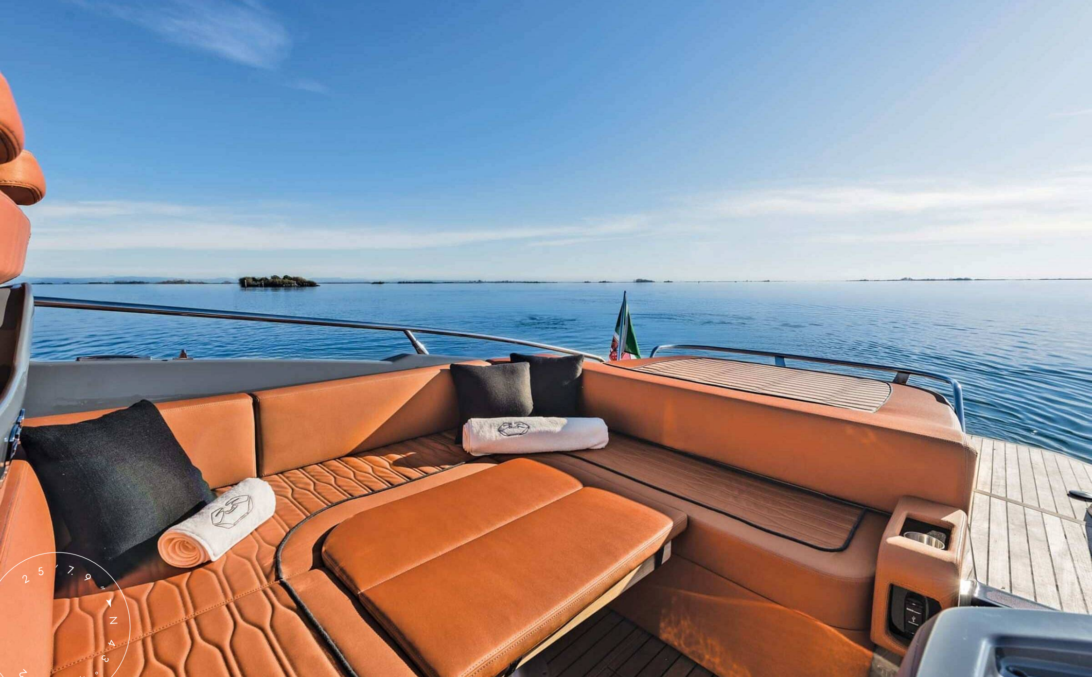
COCKPIT SEATING AREA