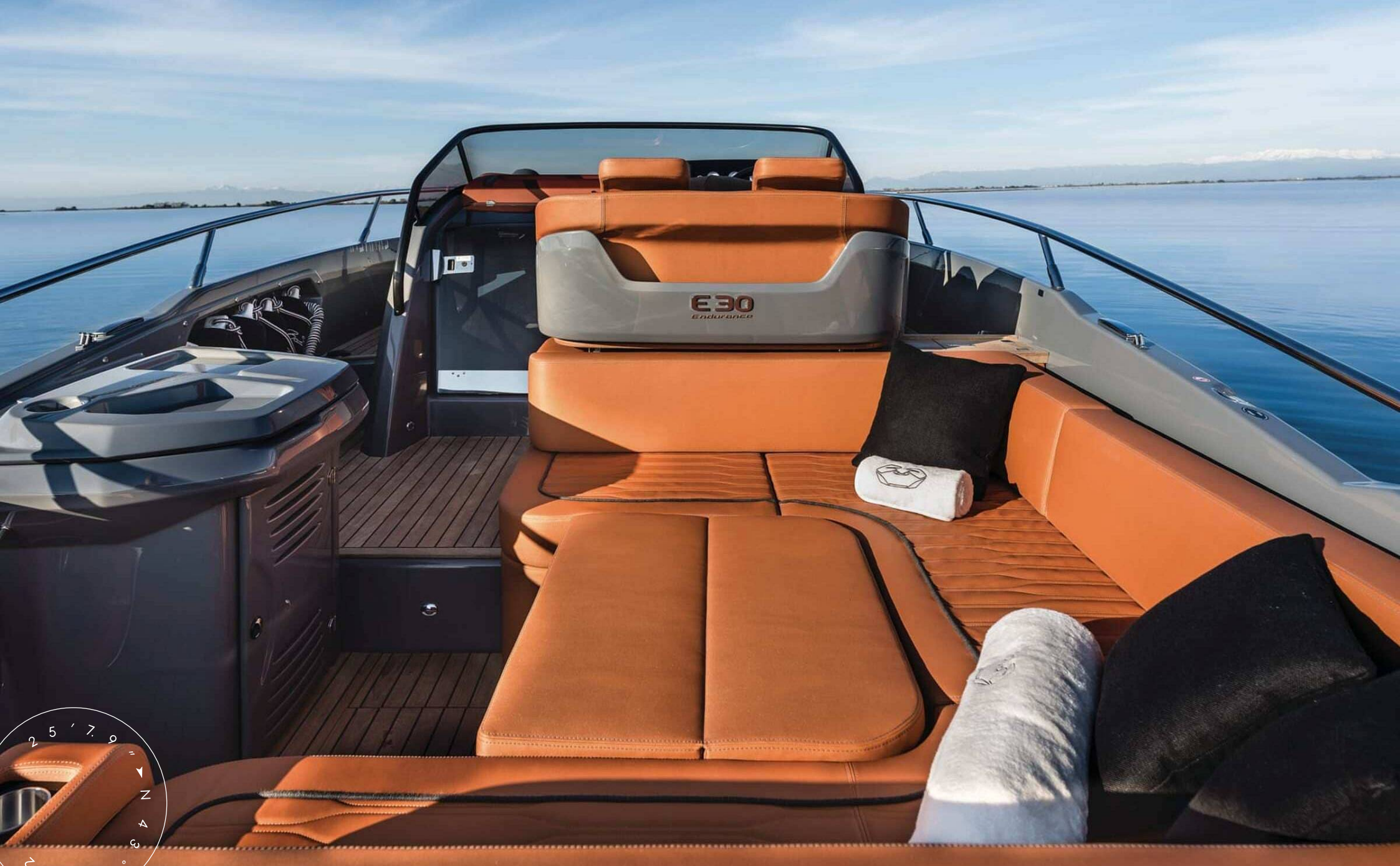
COCKPIT SEATING AREA